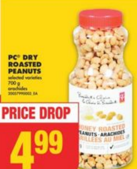
PC® DRY ROASTED PEANUTS selected varieties 700 g arachides 2005799002 SA