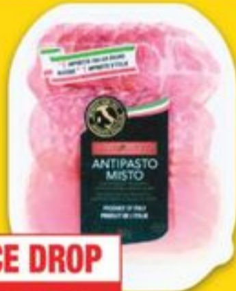
MARCANGELO SLICED DELI MEAT selected varieties 100 g viandes de charcuterie 20661202 SA