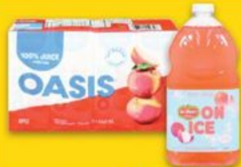
OASIS JUICE or ARIZONA ICED TEA, ALLEN'S APPLE CRANBERRY COCKTAIL or DEL MONTE ON ICE REFRESHERS 1.89 L selected varieties jus ou thé glacé ou boissons 20313744002 SA/21375061 SA