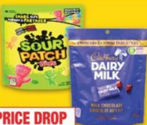
CADBURY POUCH or MAYNARDS CANDY selected varieties chocolat ou friandises 21101861 SA/21343809 SA