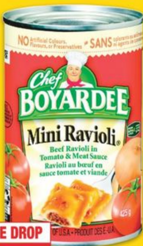
CHEF BOYARDEE selected varieties 418/425 g pâtes 2031230001 SA