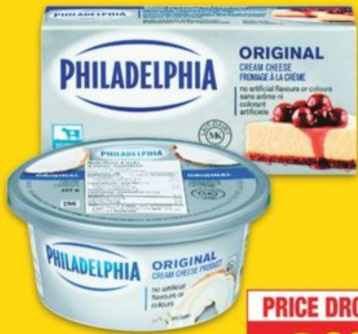
PHILADELPHIA CREAM CHEESE PRODUCT selected varieties 227/250 g produit de fromage à la crème 20641267 SA/2064492610 SA