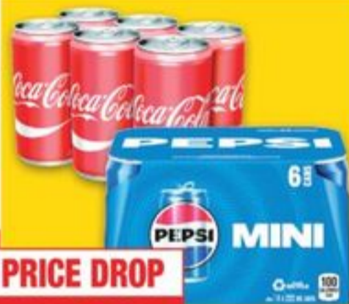
COCA-COLA or PEPSI SOFT DRINKS selected varieties 6x222 mL boissons gazeuses 20344286002 C06/20637360004 C06