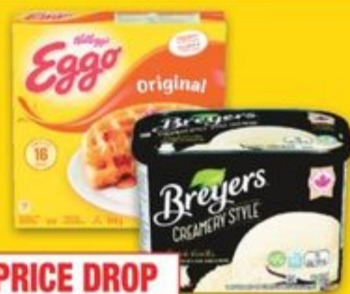
EGGO WAFFLES 16's or BREYERS CREAMERY STYLE ICE CREAM 1.66 L selected varieties, frozen gâteaux ou crème glacée 20097730004 SA/20344920004 SA