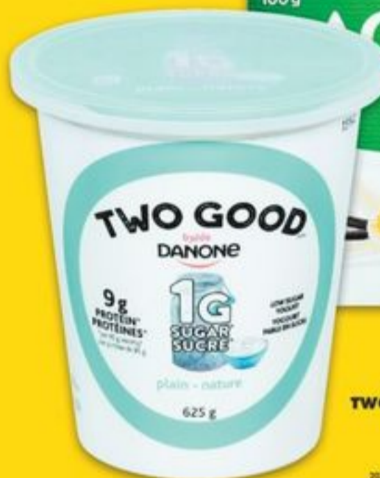
DANONE ACTIVIA 8% MIX & GO VANILLA 2% or TWO GOOD LOW SUGAR YOGURT selected varieties yogourt 2022384002 SA/21477313 SA