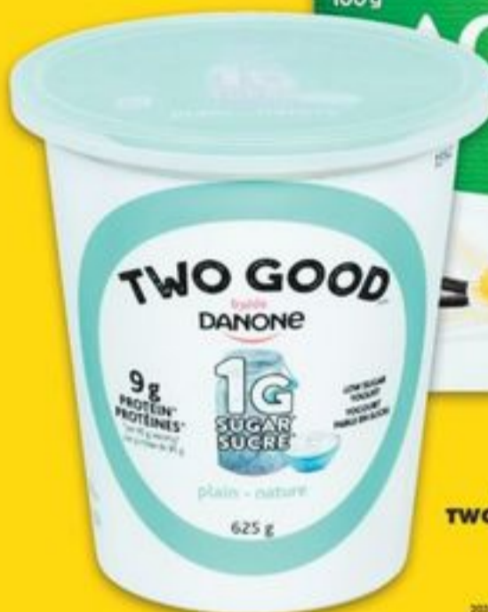
DANONE ACTIVIA 8% MIX & GO VANILLA 2% or TWO GOOD LOW SUGAR YOGURT selected varieties yogourt 2022384002 SA/21477313 SA