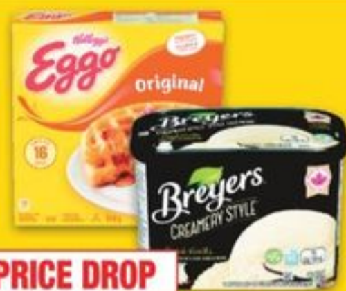
EGGO WAFFLES 16's or BREYERS CREAMERY STYLE ICE CREAM 1.66 L selected varieties, frozen gâteaux ou crème glacée 20099730004 SA/20344920004 SA