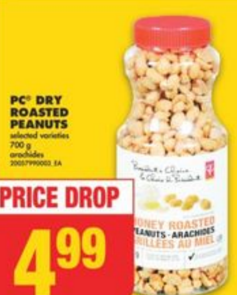
PC® DRY ROASTED PEANUTS selected varieties 700 g arachides 2002799002 SA