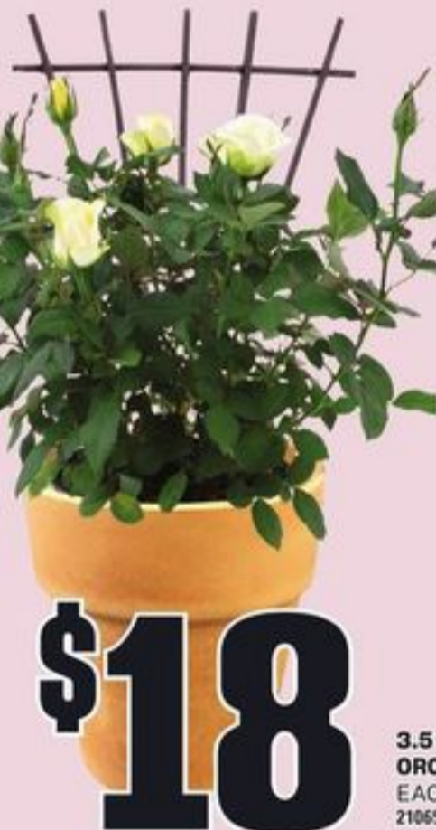
3.5 INCH ORCHID EACH 21065625_EA