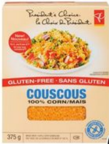
PC* GLUTEN-FREE COUSCOUS SELECTED VARIETIES 375 G 20749043_EA