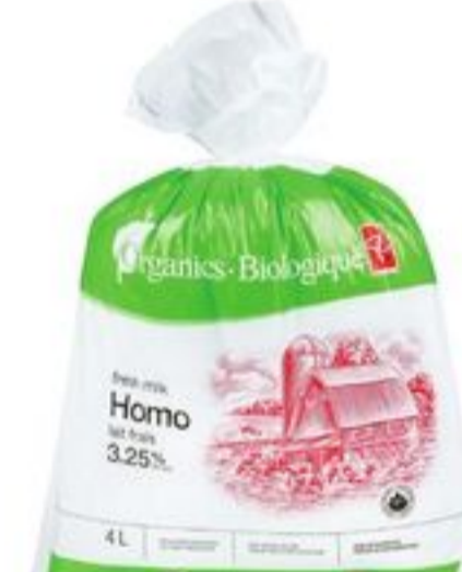
PC* ORGANICS MILK 1% 2% OR HOMO 4 L 20054844_EA/20304385_EA