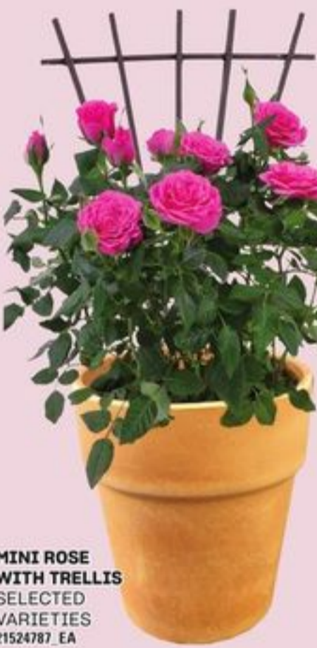
MINI ROSE WITH TRELLIS SELECTED VARIETIES 21524787_EA