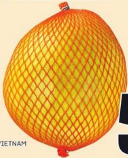
RED POMELO PRODUCT OF VIETNAM 20081390001_KG