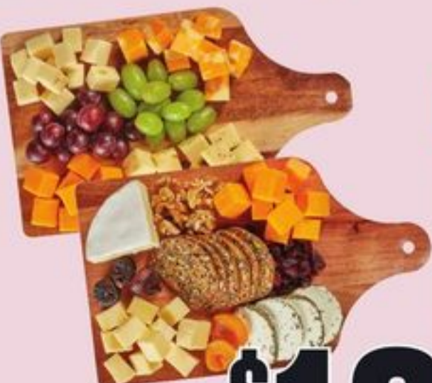
BACK TO BASICS CHEESE BOARD SELECTED VARIETIES 412-432 G 21405571_EA/21405538_EA