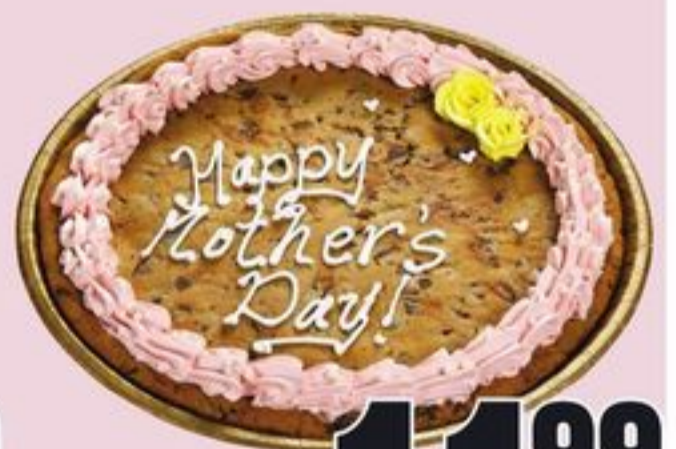
BAKED MOTHER'S DAY MESSAGE COOKIE CAKE 612 G 20966119_C10