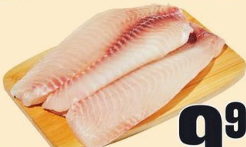
FRESH ASC TILAPIA FILLETS 22.02/KG 20897812_KG