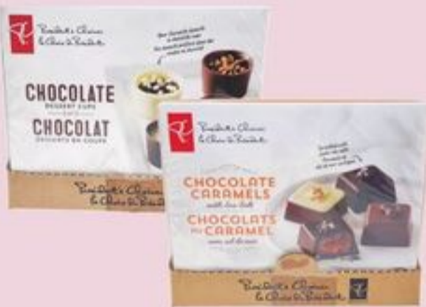
PC® BAR DESSERT COLLECTION 145 G OR CHOCOLATE SALTED CARAMELS 158 G 21197993_EA 21200083_EA