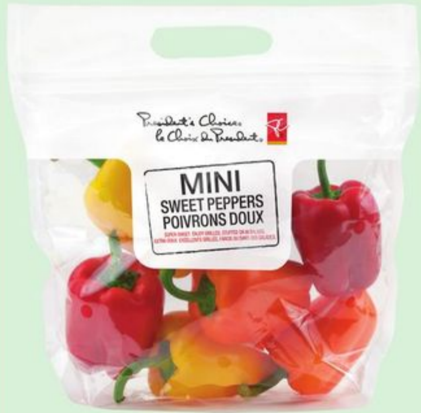
PC ® MINI PEPPERS PRODUCT OF CANADA 454 G 20920821001_EA