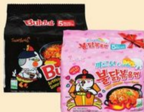
SAMYANG BULDAK RAMEN SELECTED VARIETIES 650-700 G 21345870_C05 21450283_EA