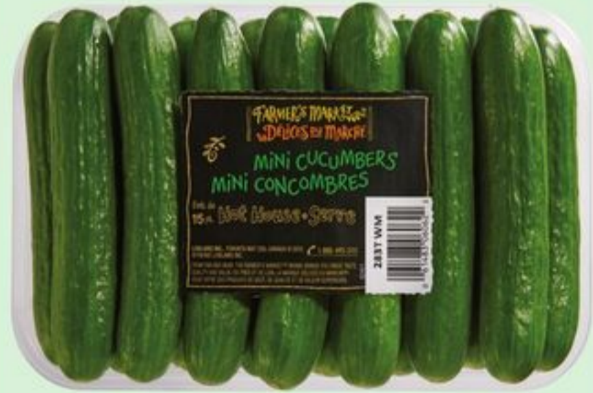
FARMER'S MARKET ™ MINI CUCUMBERS PRODUCT OF ONTARIO 11'S 21070679001_EA