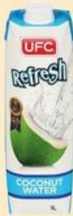
UFC REFRESH COCONUT WATER 1 L 20570506_EA