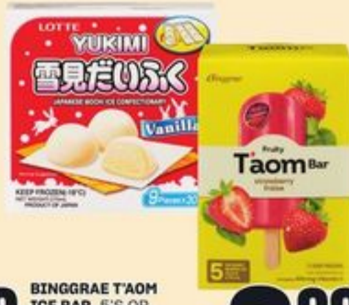
BINGGRAE T'AOM ICE BAR, 5'S OR LOTTE MOCHI 270 G SELECTED VARIETIES FROZEN 21247111_EA 21566396_EA