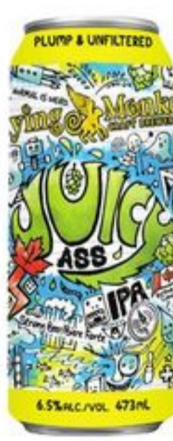
FLYING MONKEYS JUICY ASS IPA 473 ML CANS 21122521_EA