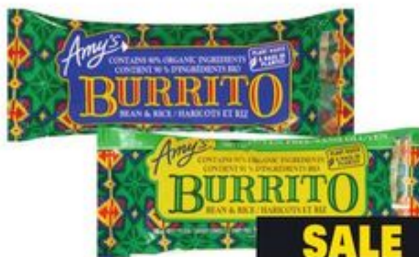
AMYS KITCHEN SELECTED VARIETIES AND SIZES 20042092002_EA/20371439001_EA