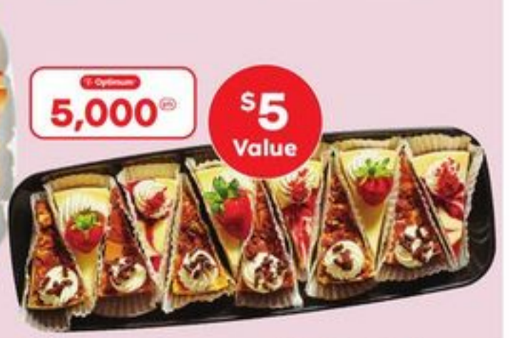
CHEESECAKE TRAY 108 G 2096282_EA