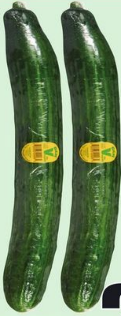
ORGANIC ENGLISH CUCUMBER PRODUCT OF ONTARIO EACH 20080489001_EA