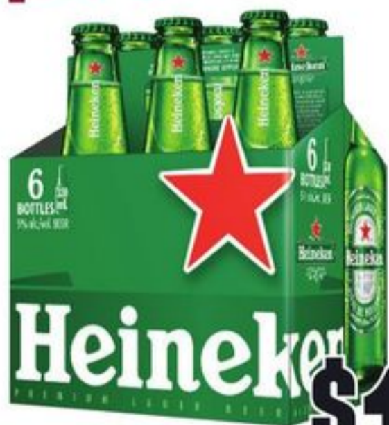
HEINEKEN LAGER 6X330 ML BOTTLES 20015206_C06