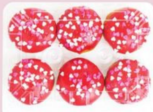
MINI MOTHER'S DAY DONUTS 6'S 21355442_EA