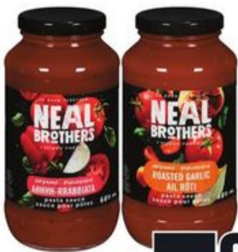
NEAL BROTHERS ORGANIC PASTA SAUCE SELECTED VARIETIES 680 ML 21306298_EA/21306341_EA