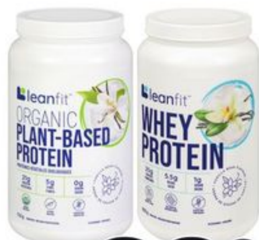
LEANFIT ORGANIC PLANT-BASED PROTEIN 715 G OR WHEY PROTEIN 517-579 G SELECTED VARIETIES 21395716_EA/214603978_EA