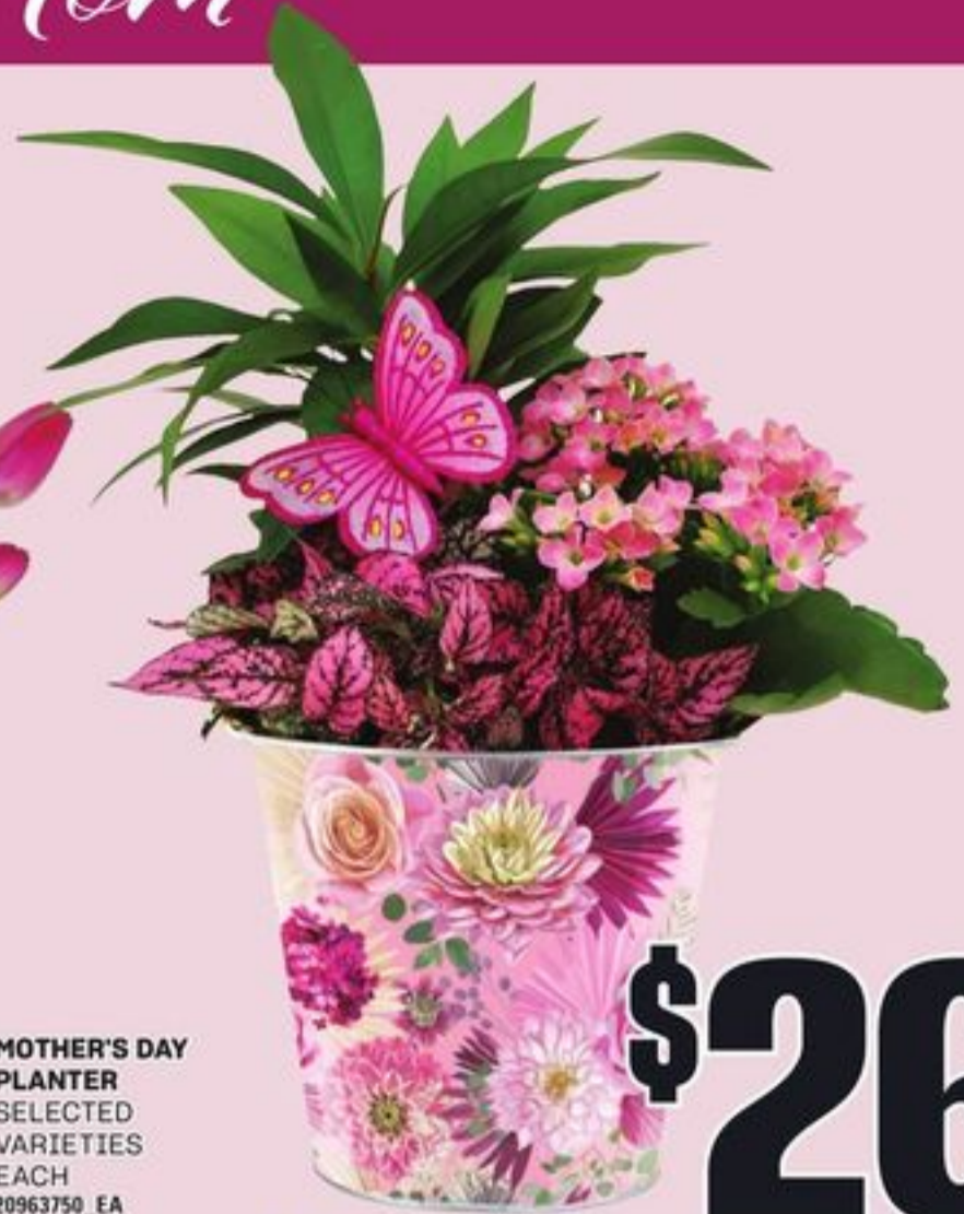
MOTHER'S DAY PLANTER SELECTED VARIETIES EACH 20963750_EA