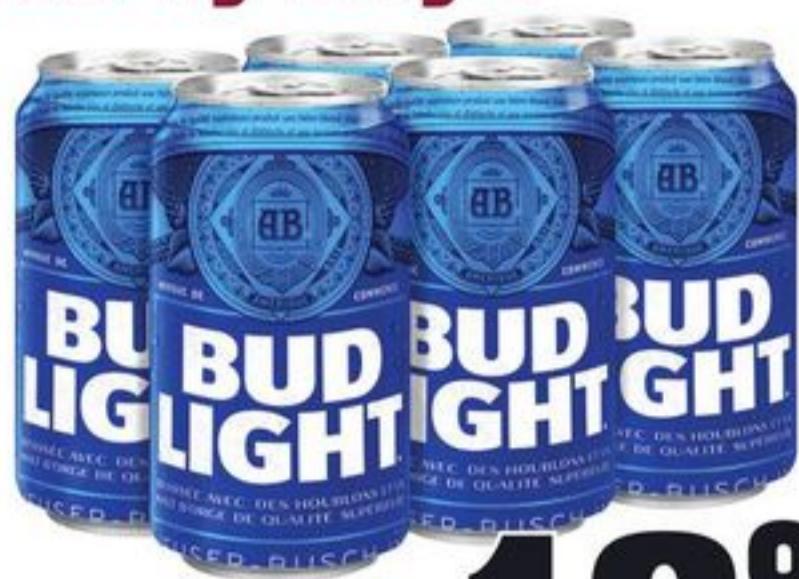
BUD LIGHT 6X355 ML CANS 20115763_C06