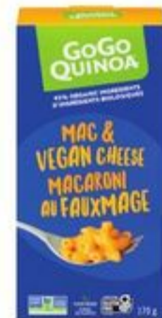
GOGO QUINOA MAC & VEGAN CHEESE SELECTED VARIETIES 170 G 21380709_EA