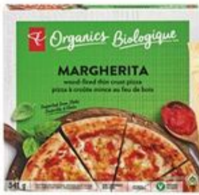
PC* GLUTEN-FREE PIZZA OR PRETZEL SELECTED VARIETIES 340-400 G 21077582_EA/21092257_EA 21092293_EA