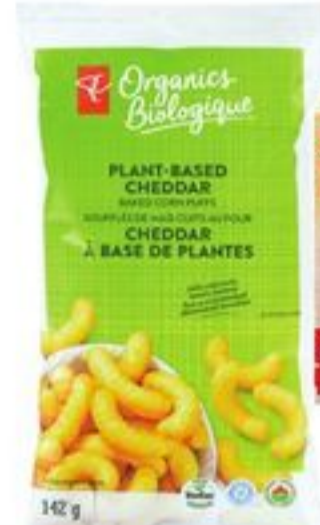
PC* GLUTEN-FREE WAFFLES OR PC* ORGANICS VEGAN PUFFS SELECTED VARIETIES 142-198 G 21358684_EA/21419163_EA