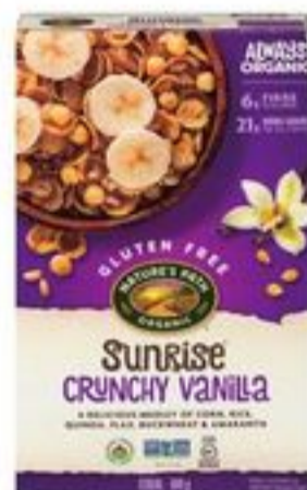
NATURES PATH SUNRISE CEREAL 300 G OR PC* ORGANICS GLUTEN-FREE ROLLED OATS 900 G SELECTED VARIETIES 20043938002_EA/21396198_EA