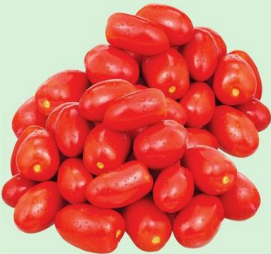
GREENHOUSE ROMA TOMATOES PRODUCT OF MEXICO 5.49/KG 20143381001_KG