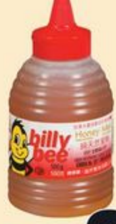
BILLY BEE HONEY 500 G 21001564_EA