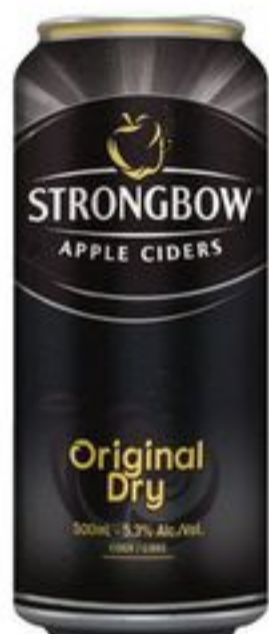
STRONGBOW CIDER 500 ML CANS 20976563_EA