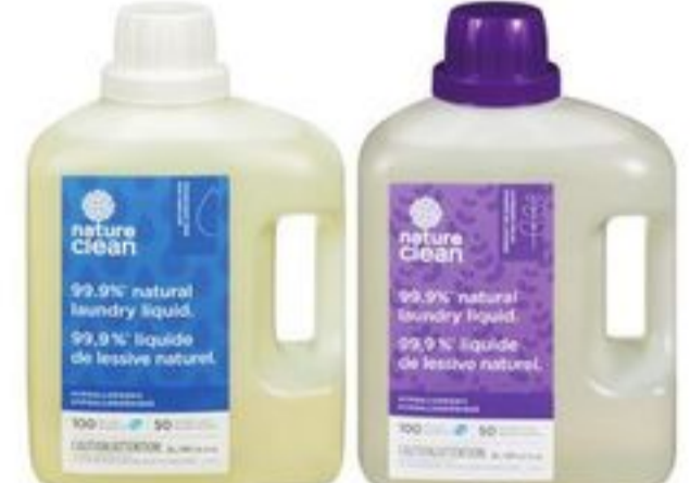
NATURE CLEAN LAUNDRY LIQUID 3 L, PLASTIC FREE LAUNDRY OR CLEANER STRIPS 32/36'S SELECTED VARIETIES 20067905_EA/20757371001_EA