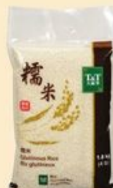
T&T® GLUTINOUS RICE 1.8 KG 20828956_EA