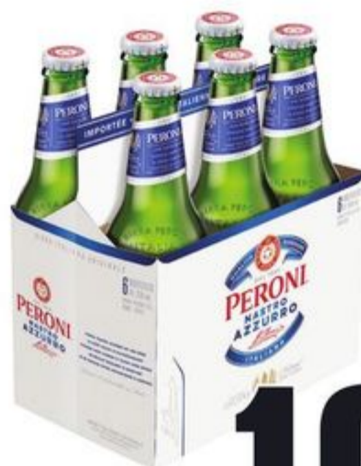
PERONI NASTRO AZZURRO 6X330 ML BOTTLES 20335529_C06