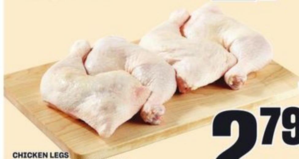
CHICKEN LEGS FAMILY SIZE, BACK ATTACHED 6.16/KG 20153925_KG

Optimum Members-Only Price™ 99¢ Non-members 1 49