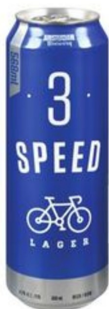
AMSTERDAM 3 SPEED LAGER 568 ML CANS 21122537_EA