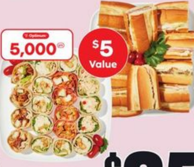
PIN WHEELS WRAP OR SMALL GAME NIGHT PLATTER EACH 21558135_EA/21557919_EA