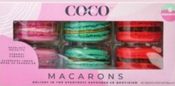
COCO BAKERY MACARON SELECTED VARIETIES 206 G 21587432_EA