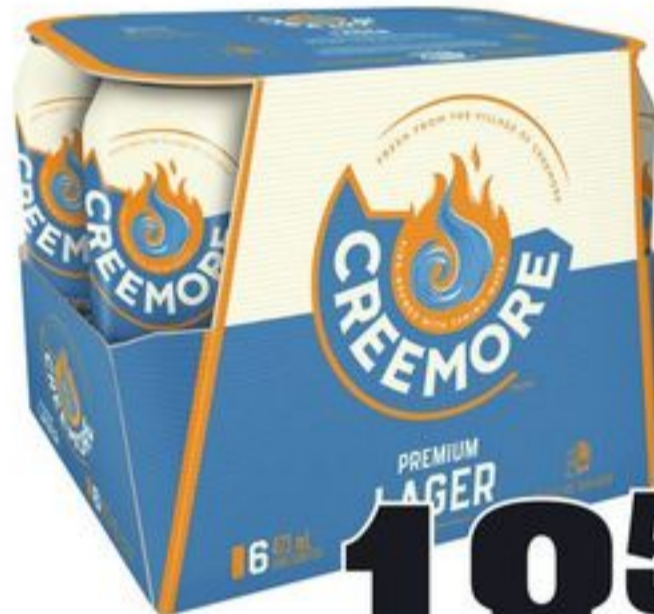
CREEMORE SPRINGS PREMIUM LAGER 6X473 ML CANS 21097267_C06