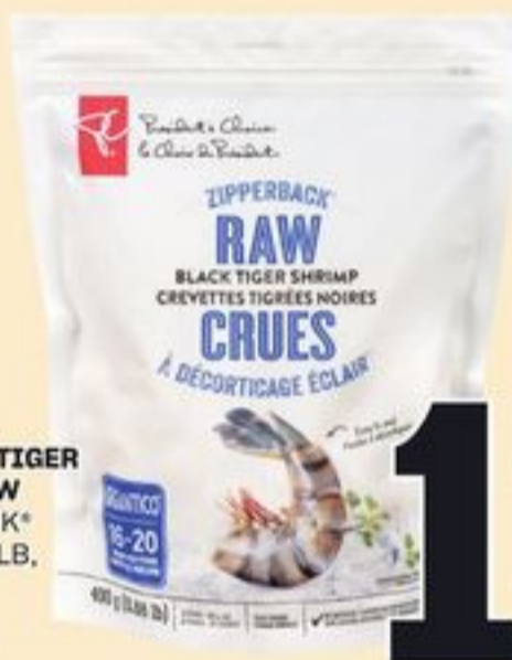
PC® BLACK TIGER SHRIMP RAW ZIPPERBACK® 16-20 PER LB. FROZEN 400 G 20801192_EA