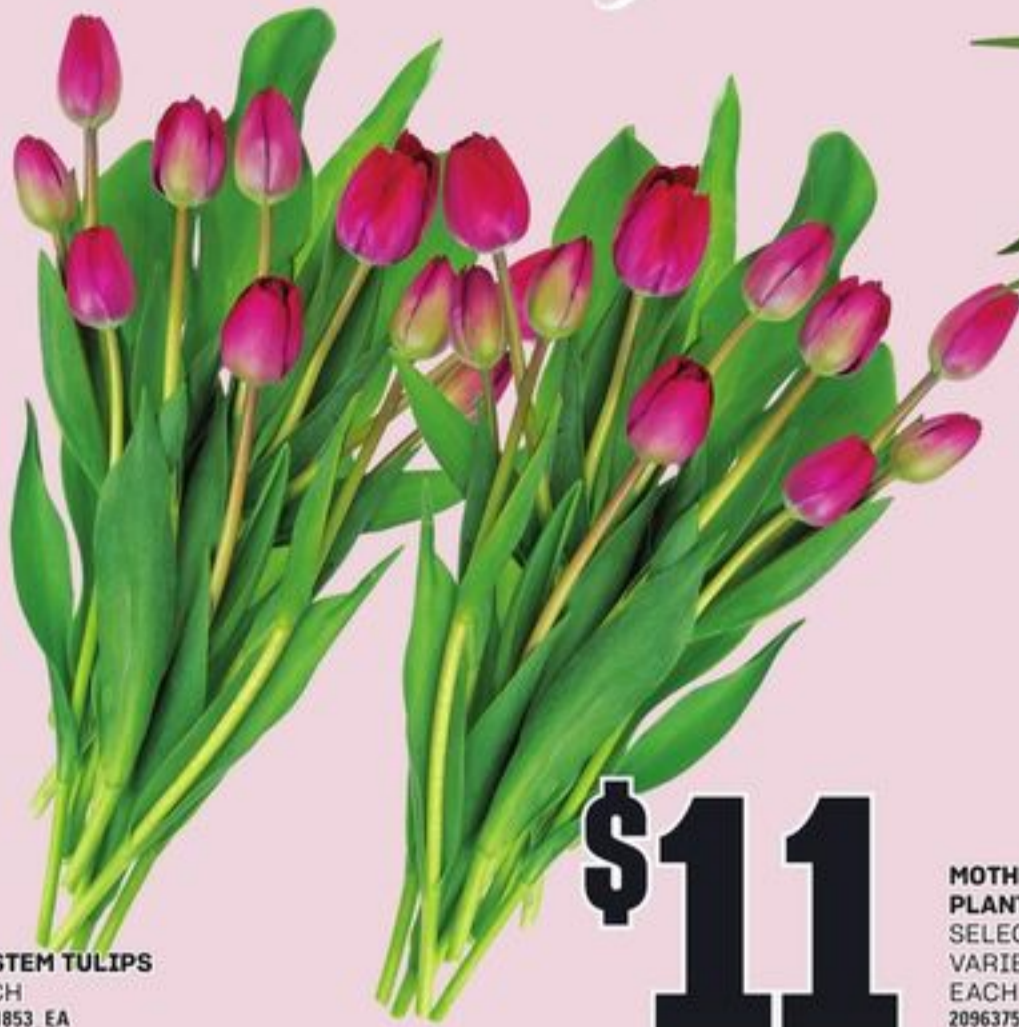
10 STEM TULIPS EACH 21521853_EA