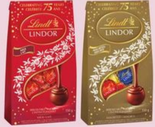
LINDOR OR GHIRARDELLI CHOCOLATE BAGS SELECTED VARIETIES 116-151 G 21390291_EA 21390363_EA