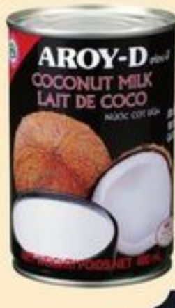
AROY-D COCONUT MILK SELECTED VARIETIES 400 ML 20063864_EA