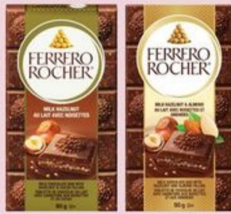
FERRERO ROCHER TABLETS SELECTED VARIETIES 90 G 21428863_EA 21570452_EA