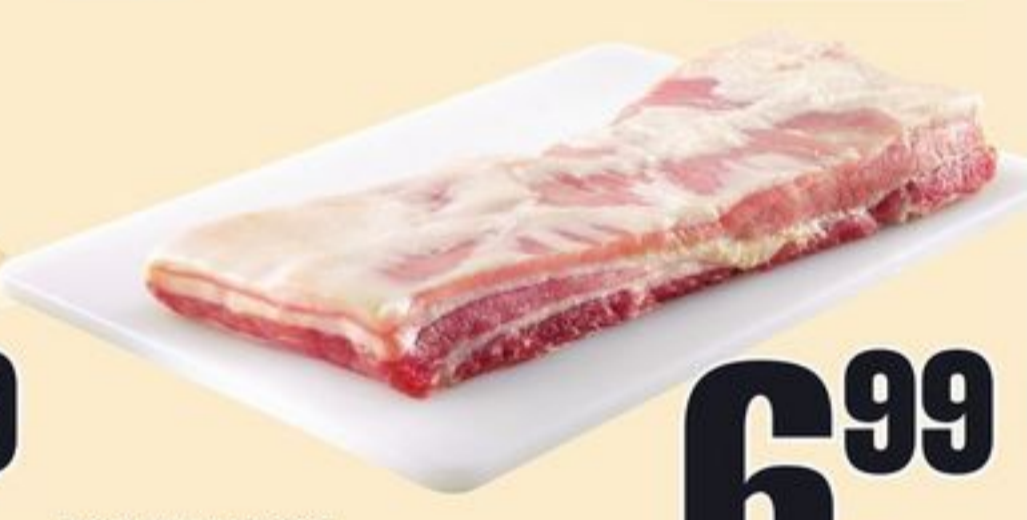
PORK BELLY PORTION 15.41/KG 20793502_KG