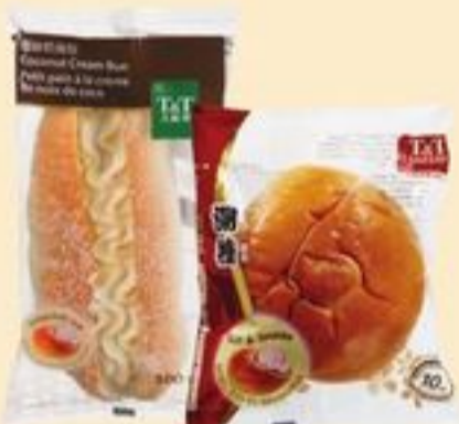
T&T® BAKERY BUNS SELECTED VARIETIES 90/100 G 20332833_EA/20334565_EA