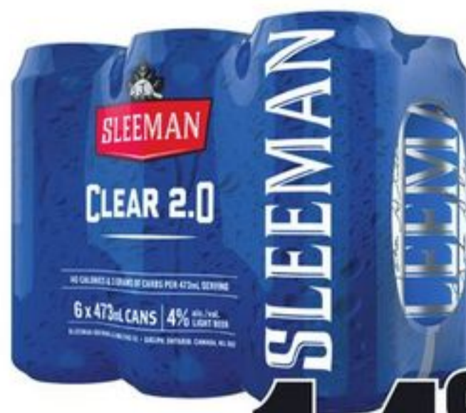
SLEEMAN CLEAR 6X473 ML CANS 21014347_C06