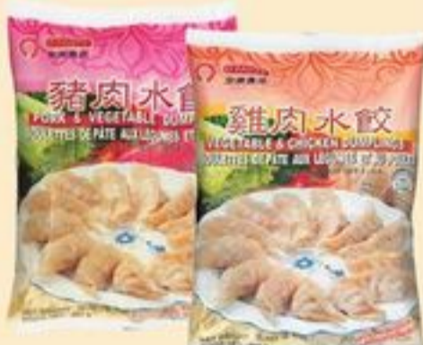
O'TASTY DUMPLINGS SELECTED VARIETIES, FROZEN 567 G 20319243001_EA/20319243004_EA