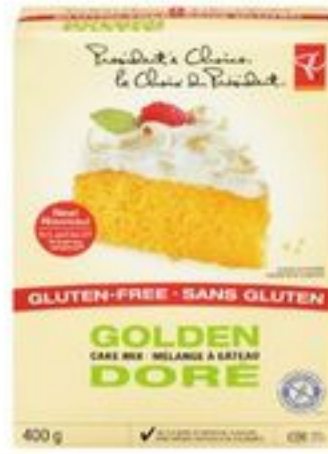
PC* ORGANICS GLUTEN-FREE CAKE MIX OR FLOUR SELECTED VARIETIES 400/800 G 20689979001_EA/20809079_EA