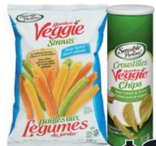
SENSIBLE PORTIONS VEGGIE STRAWS SELECTED VARIETIES 120-142 G 20377204001_EA/21380091_EA