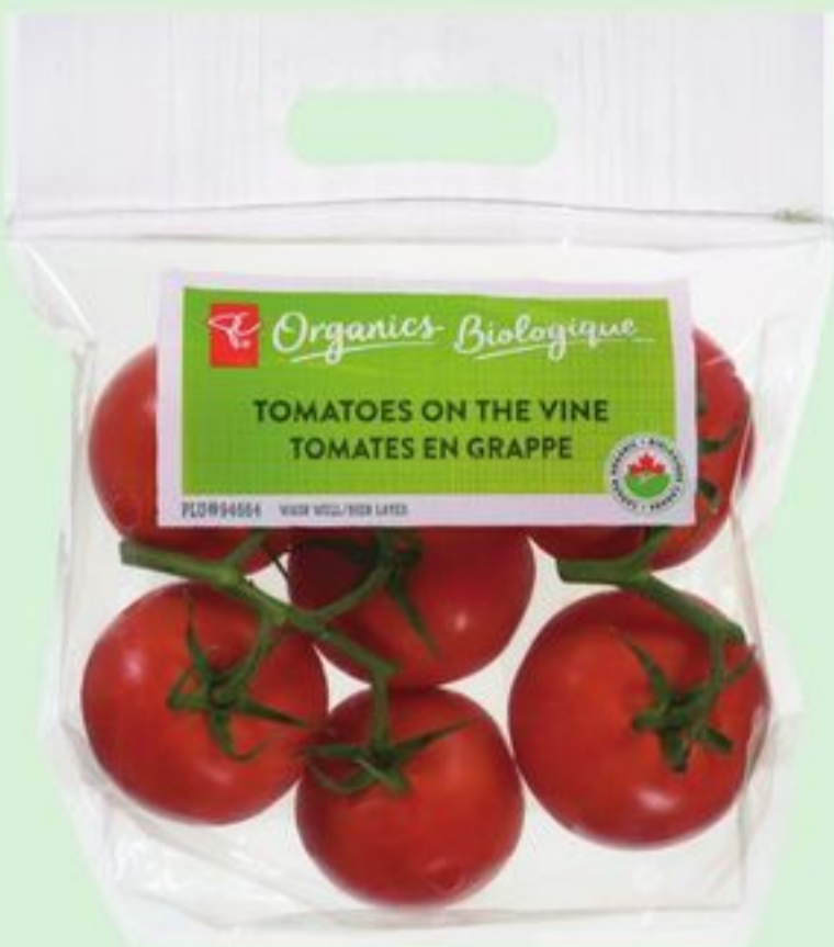
PC ® ORGANICS TOMATOES ON THE VINE PRODUCT OF CANADA 8.80/KG 20127917001_KG