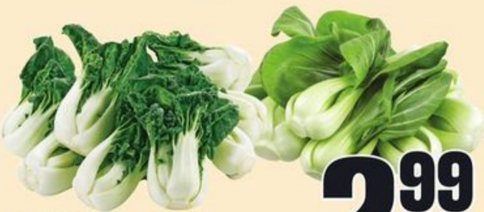
BABY OR SHANGHAI BOK CHOY PRODUCT OF MEXICO 6.59/KG 20082279001_KG/20032454001_KG