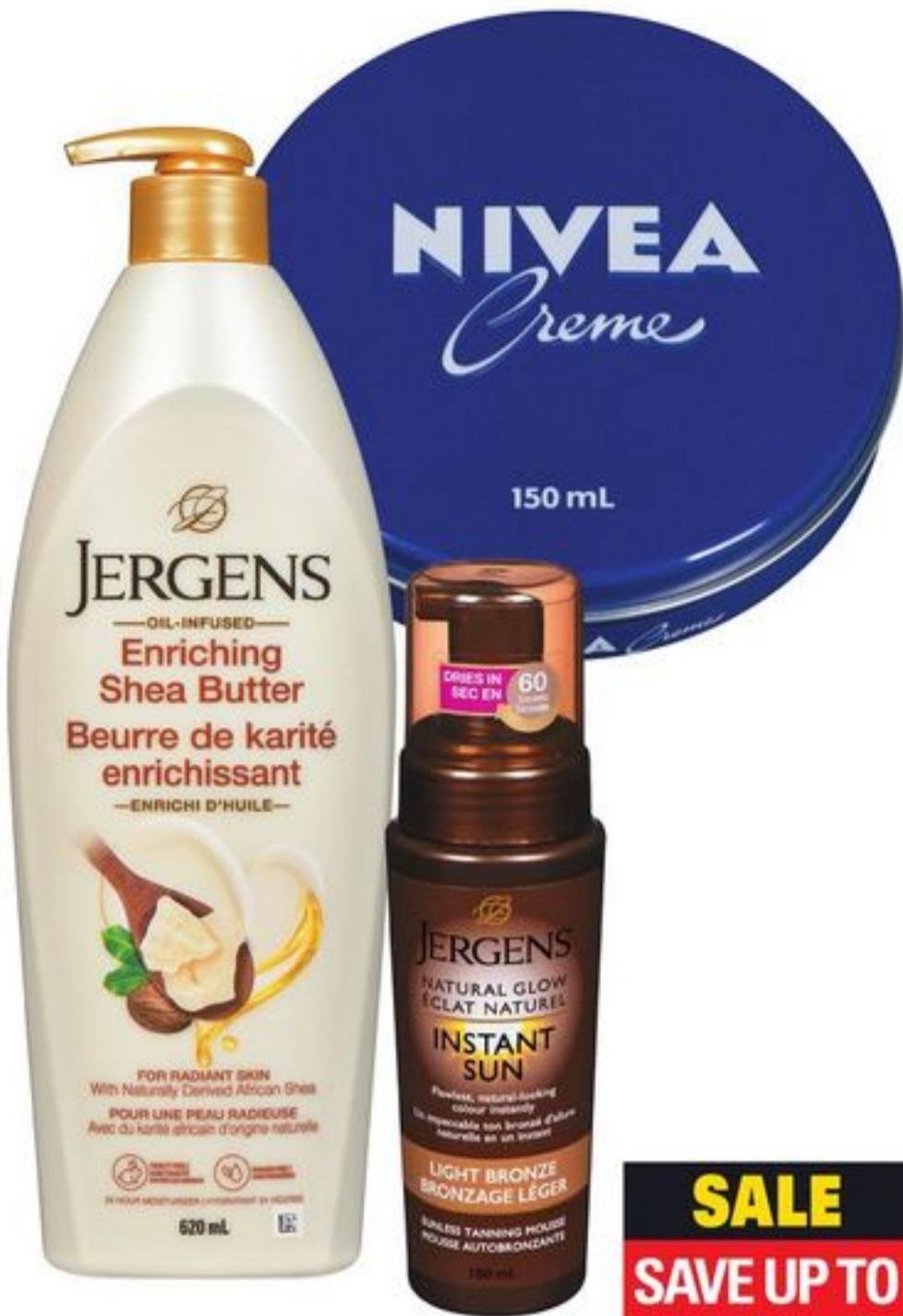
JERGENS LOTION, COPPERTONE SUNSCREEN, NIVEA CREAM OR BIORÉ FACE CARE SELECTED VARIETIES AND SIZES 21089622_EA/21176321_EA