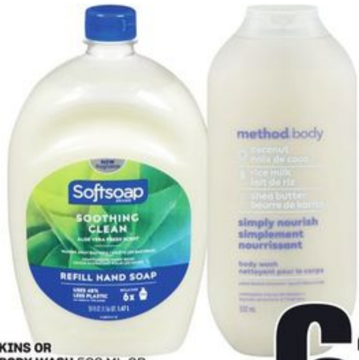
J.R. WATKINS OR METHOD BODY WASH 532 ML OR J.R. WATKINS OR SOFTSOAP LIQUID HAND SOAP REFILL 828 ML-1.47 L SELECTED VARIETIES 21167194_EA/21425299_EA