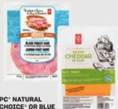
PC NATURAL CHOICE OR BLUE MENU SLICED DELI MEATS 175 G OR PC CHEESE SLICES 140-170 G SELECTED VARIETIES 20216643_EA/20310580_EA