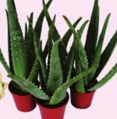
ALOE VERA 4 INCH POT 21047366_EA