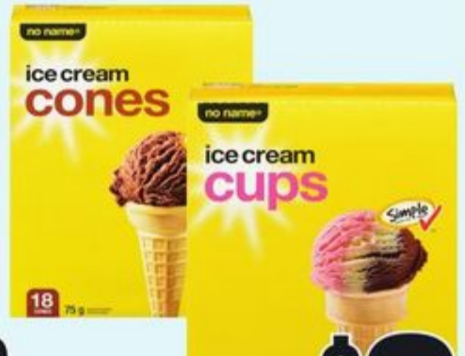
NO NAME® ICE CREAM CONES OR CUPS SELECTED VARIETIES 75-80 G 21203830_EA/21203883_EA