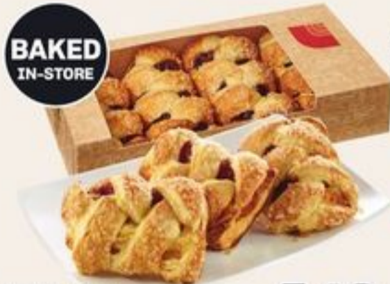
BAKED IN-STORE MINI BRAIDED STRUDELS OR MAPLE PECAN DANISH SELECTED VARIETIES 4'S 21464142_EA/21464199_EA