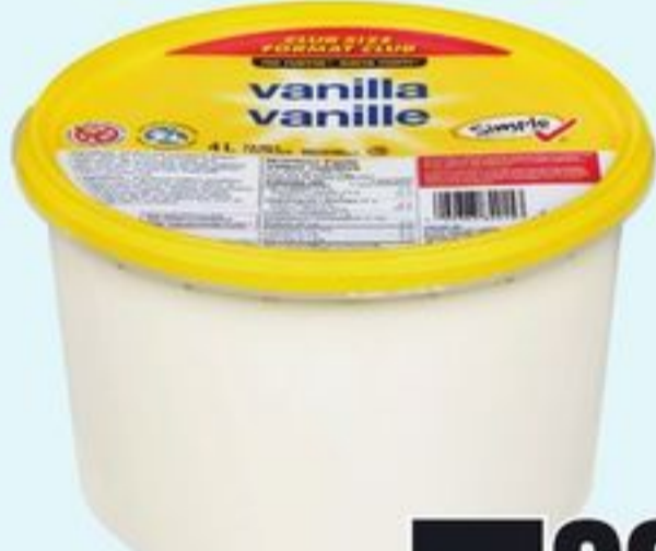
NO NAME® ICE MILK SELECTED VARIETIES FROZEN 4 L 20015284002_EA