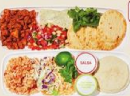
CHICKEN, FAJITA, TANDOORI OR GYRO TACO TRAYS SELECTED VARIETIES 1-1.1 KG 21395977_EA/21595419_EA

Great to go items plus applicable taxes.