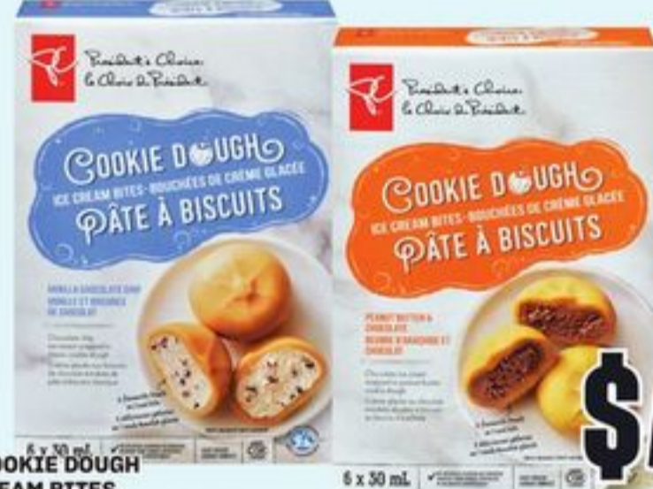
PC® COOKIE DOUGH ICECREAM BITES SELECTED VARIETIES FROZEN 6'S 21506998_EA/21507016_EA