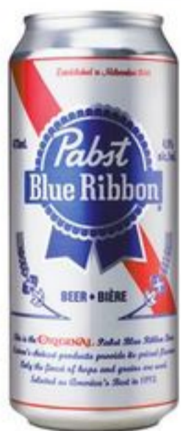
PABST BLUE RIBBON 473 ML CAN 20954813_EA