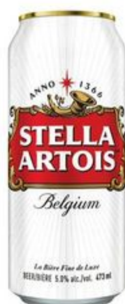
STELLA ARTOIS 473 ML CAN 21337003_EA