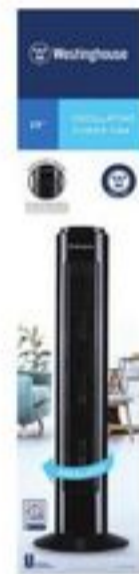
HONEYWELL OR WESTINGHOUSE FANS SELECTED VARIETIES 20129684_EA/21449261_EA