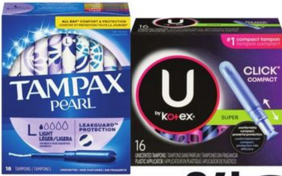
TAMPAX PEARL TAMPONS 18'S, ALWAYS PREMIUM INFINITY FLEX FOAM PADS 16'S OR U BY KOTEX CLICK COMPACT UNSCENTED TAMPONS 16'S SELECTED VARIETIES AND SIZES 21284541_EA/21287976_EA