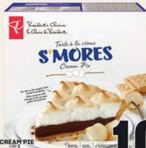
PC S'MORES CREAM PIE FROZEN 730 G 21574358_EA