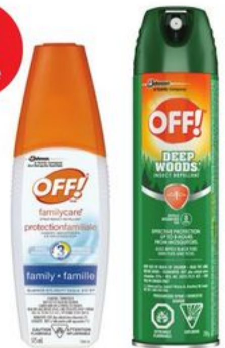
OFF! OR RAID INSECT REPELLENT SELECTED VARIETIES 20001279002_EA/20158572_EA