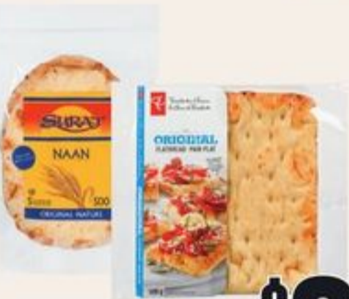
PC FLATBREAD 220/300 G OR SURAJ NAAN 5'S SELECTED VARIETIES 20910042_EA/21051353_EA