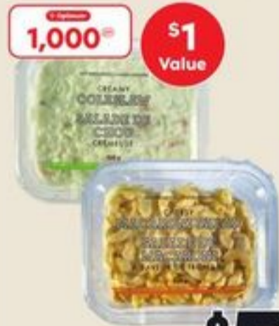
PREMIUM SALADS 425-454 G 21544608_EA/21544611_EA