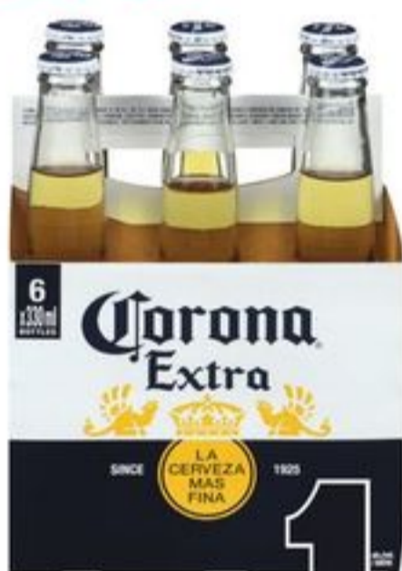
CORONA EXTRA 6X330 ML BOTTLES 21338460_C06