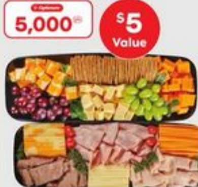
PARTY PLATTERS SELECTED VARIETIES 696 G/1.8 KG 21217521_EA/21217522_EA