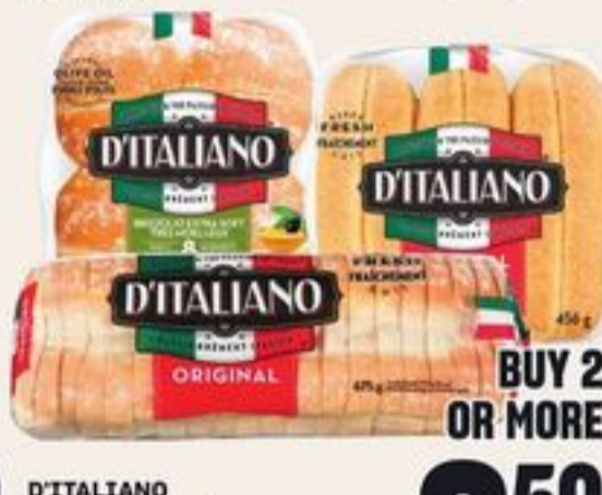
D'ITALIANO BREAD OR BUNS SELECTED VARIETIES AND SIZES 20038335_EA/20627101_EA/20627103_EA

BUY 2 OR MORE 3 50 LESS THAN 2 $3.99 EA.