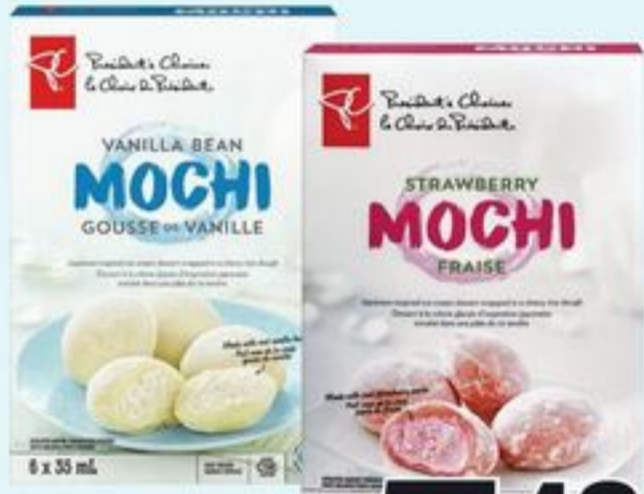
PC® MOCHI FROZEN DESSERT SELECTED VARIETIES 6'S 21166581_EA/21167338_EA