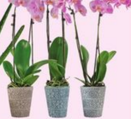
DOUBLE SPIKE ORCHID IN CERAMIC SELECTED VARIETIES 20997631_EA