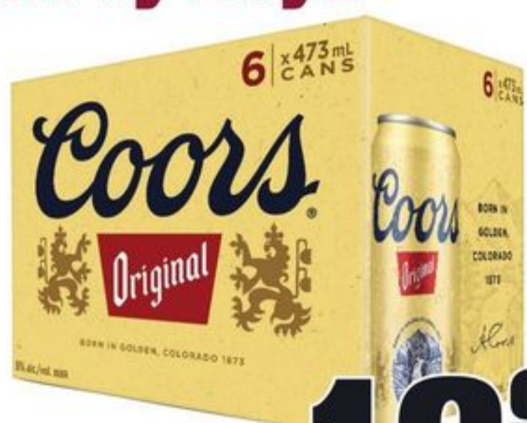
COORS ORIGINAL 6X473 ML CANS 21294687_C06