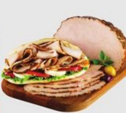
PC CHICKEN SERVICE CASE MEATS SELECTED VARIETIES 20301114_KG