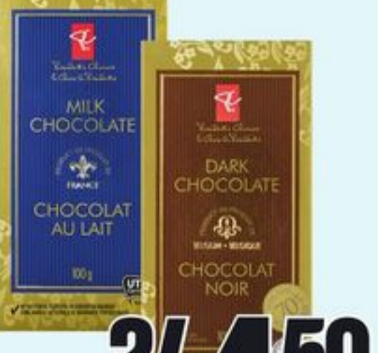
PC® CHOCOLATE BARS SELECTED VARIETIES 90-100 G 20024823_EA/20313501_EA