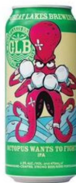
GLB OCTOPUS WANTS TO FIGHT IPA 473 ML CAN 21185170_EA