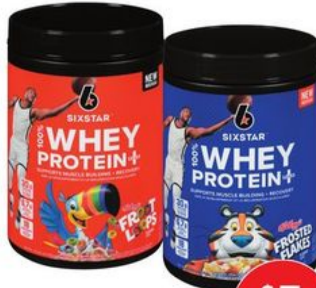
SIX STAR WHEY PROTEIN SELECTED VARIETIES 821/907 G 21559849_EA/21559977_EA