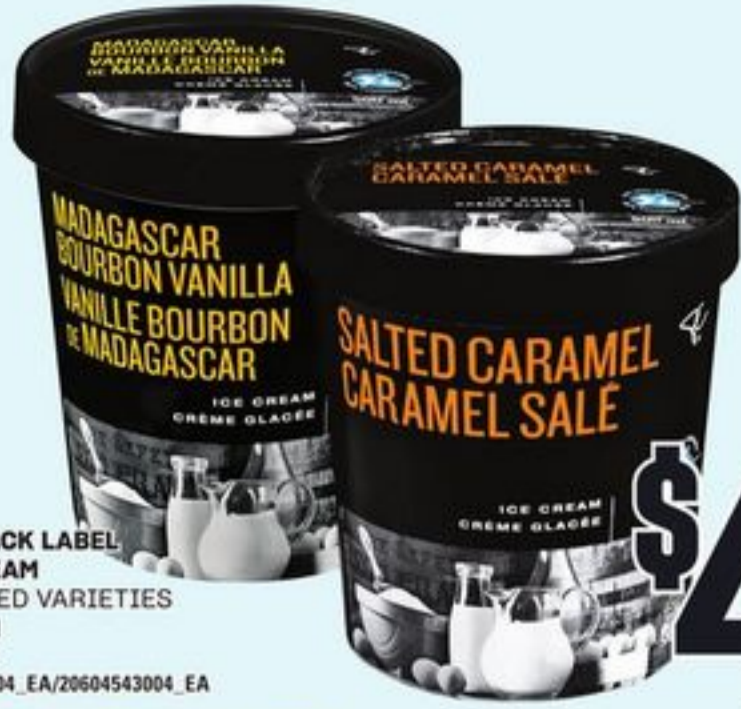
PC® BLACK LABEL ICE CREAM SELECTED VARIETIES FROZEN 500 ML 20604543004_EA/20604543004_EA