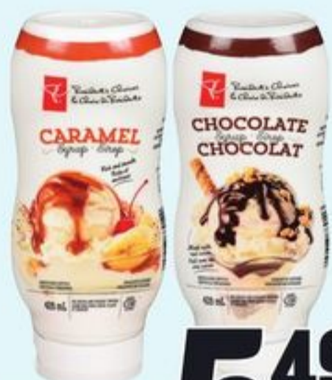
PC® SYRUP SQUEEZABLE BOTTLE SELECTED VARIETIES 428 ML 20338077_EA/20339669_EA