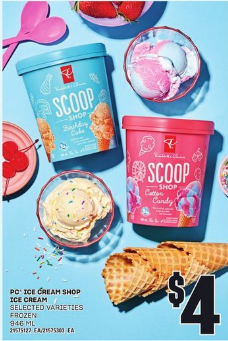
PC® ICE CREAM SHOP ICE CREAM SELECTED VARIETIES FROZEN 946 ML 21575127_EA/21575303_EA