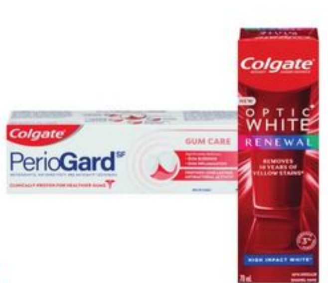
COLGATE OPTIC WHITE OR SENSITIVE PRO RELIEF TOOTH PASTE 70-133 ML, BATTERY TOOTHBRUSHES, MANUAL TOOTHBRUSHES, HELLO TOOTH PASTE 82-98 ML OR COLGATE PERIOGARD TOOTH PASTE SELECTED VARIETIES 21220587_EA/21517424_EA