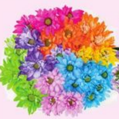
COLOUR POP DAISIES 21437439_EA