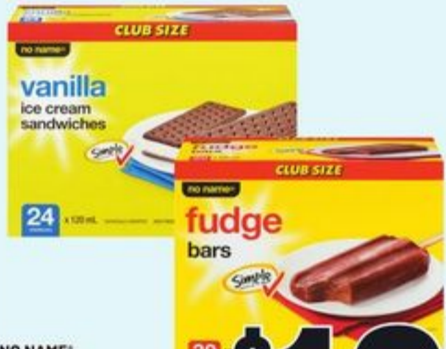
NO NAME® ICE CREAM SANDWICHES OR BARS CLUB SIZE SELECTED VARIETIES FROZEN 24/30'S 2034740002_EA/21013432_EA