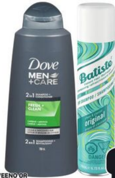
DOVE, BATISTE, AVEENO OR GARNIER WHOLE BLENDS HAIR CARE OR STYLING SELECTED VARIETIES AND SIZES 20419882001_EA/20850398_EA