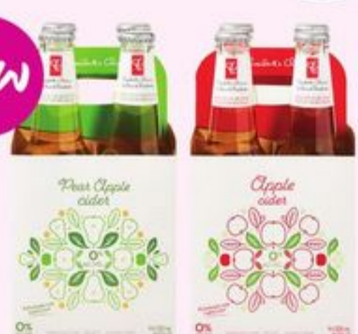
PC® SPARKLING DEALCOHOLIZED APPLE OR PEAR CIDER BEVERAGE SELECTED VARIETIES 4X330 ML 21588266_C04 21588277_C04