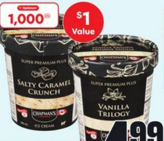
CHAPMAN'S SUPER PREMIUM PLUS ICE CREAM SELECTED VARIETIES FROZEN 500 ML 21511147_EA/21511200_EA