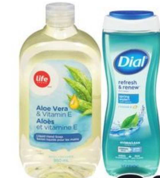
DIAL BODY WASH 473 ML, FOAMING LIQUID HAND SOAP 221 ML OR LIFE BRAND LIQUID HAND SOAP 950 ML SELECTED VARIETIES 21311819_EA/21357582001_EA