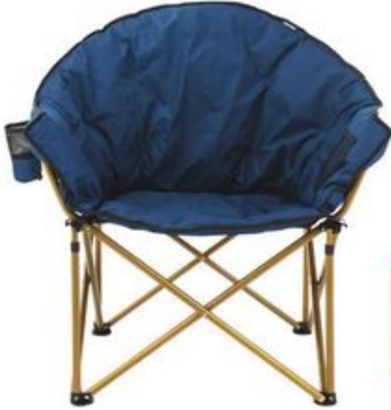
PAPLUX CAMP CHAIR SELECTED VARIETIES 21456922_EA