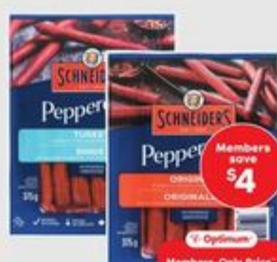
SCHNEIDERS PEPPERETTES SELECTED VARIETIES 250-375 G 20976093_EA/20976110_EA