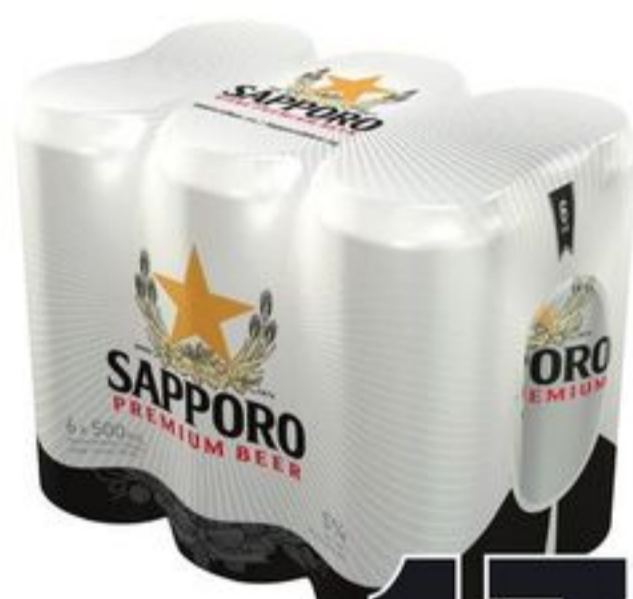
SAPPORO 6X500 ML CANS 21014346_C06