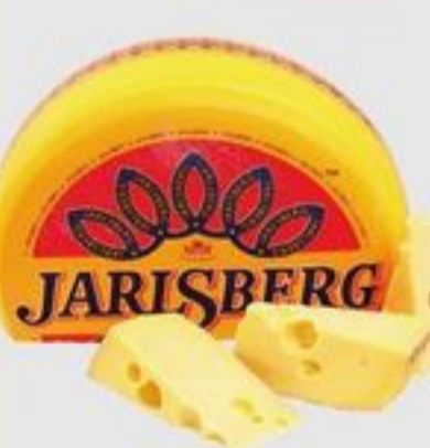
NORWEGIAN JARLSBERG CHEESE 21388103_KG