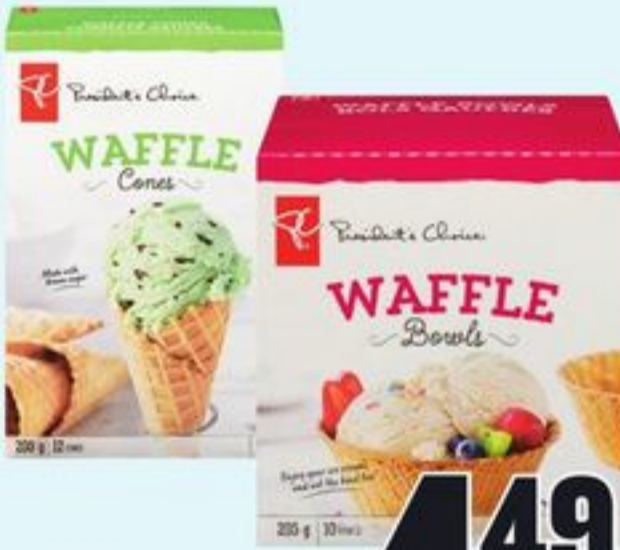
PC® WAFFLE BOWLS OR CONES SELECTED VARIETIES 135/205 G 21263795_EA/21263798_EA