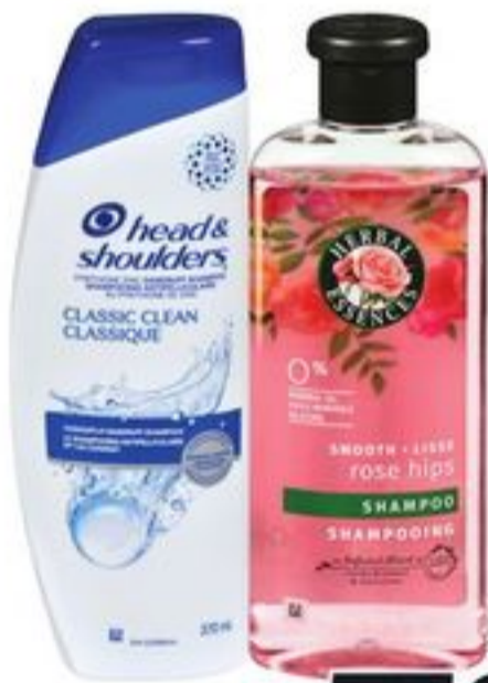
HEAD & SHOULDERS 370 ML, OLD SPICE 400 ML OR HERBAL ESSENCE 400-600 ML HAIR CARE SELECTED VARIETIES AND SIZES 21505016_EA