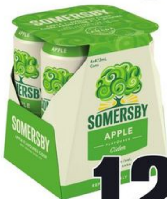
SOMERSBY APPLE CIDER 4X473 ML CANS 21313146_C04