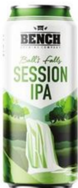
BALL'S FALLS SESSION IPA 473 ML CAN 21009874_EA