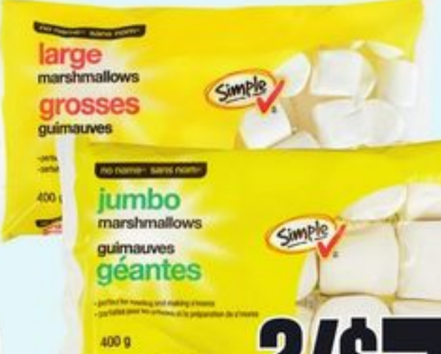
NO NAME® MARSHMALLOW SELECTED VARIETIES 400 G 20304672001_EA/21023141_EA