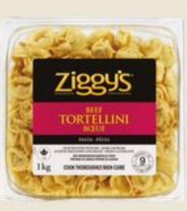
ZIGGY'S PASTA SELECTED VARIETIES 1 KG 21521156_EA