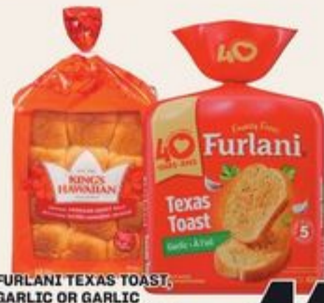
FURLANI TEXAS TOAST, GARLIC OR GARLIC PARM 638 G OR KING'S HAWAIIAN ROLLS 312/340 G SELECTED VARIETIES 20041579_EA/214795970_EA