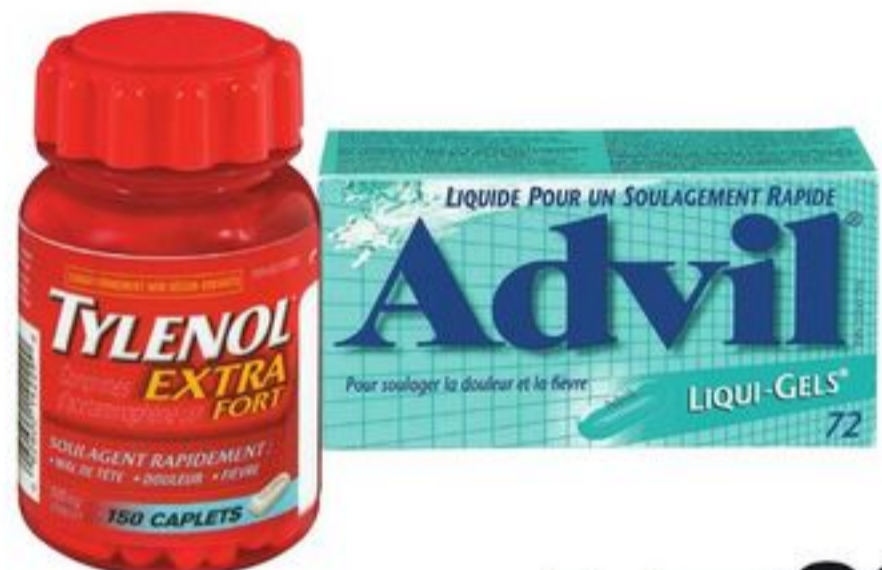
ASPIRIN 100/120'S, ALEVE 40-100'S, ALEVE-X 72 G, TYLENOL 72-150'S, MOTRIN 60/150'S OR ADVIL 40-72'S PAIN RELIEF TABLETS, CAPLETS, GELS OR RUB SELECTED VARIETIES 21532778_EA/20328051_EA