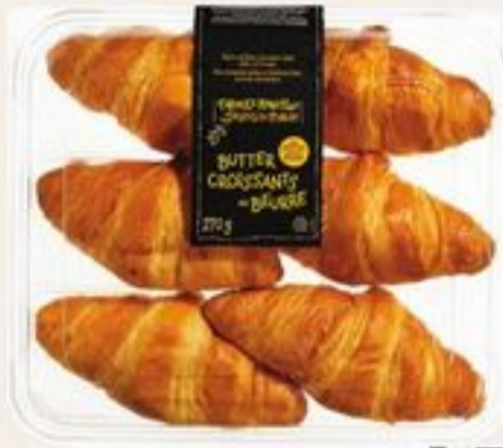
FARMER'S MARKET BUTTER CROISSANTS SELECTED VARIETIES 6'S 20975943_EA