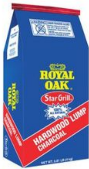
STAR GRILL LUMP CHARCOAL 8.8 LB 20773869_EA