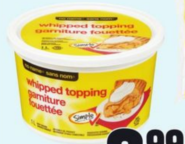
NO NAME® WHIPPED TOPPING SELECTED VARIETIES FROZEN 1 L 20113422001_EA