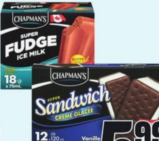
CHAPMAN'S SUPER NOVELTIES SELECTED VARIETIES FROZEN 20072328002_EA/20111532_EA