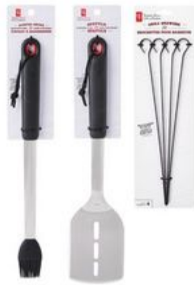
PC® BBQ ACCESSORIES, TOOLS, BBQ COVERS OR LIGHTERS SELECTED VARIETIES 21524461_EA/21524356_EA