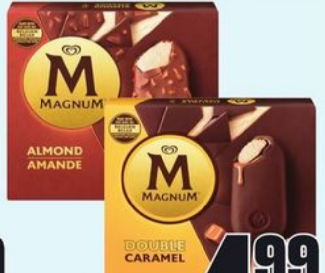
MAGNUM BARS SELECTED VARIETIES FROZEN 4'S 2034205003_EA/20950739_EA