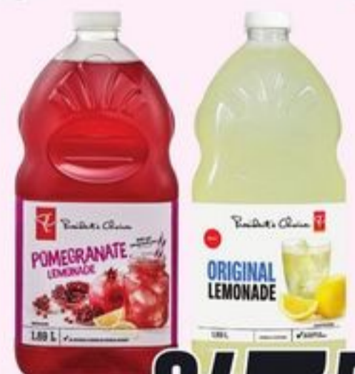
PC® LEMONADE SELECTED VARIETIES 1.89 L 20772870001_EA 21425929_EA