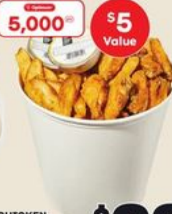
CHICKEN WINGS AND WEDGES BUCKET 1.2-2.12 KG 21541872_EA/21541877_EA