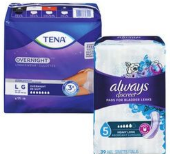
ALWAYS DISCREET 10-54'S OR TENA 12-48'S INCONTINENCE UNDERWEAR OR PADS SELECTED VARIETIES AND SIZES 20814896_EA/210333778_EA