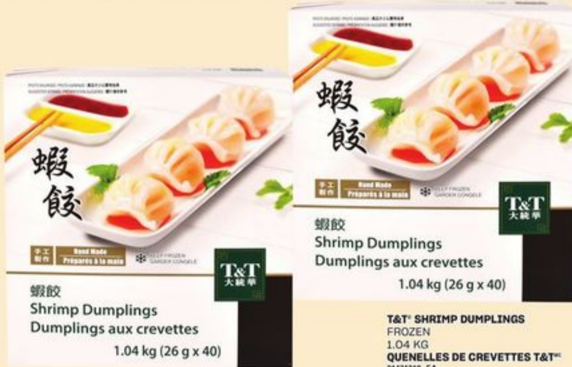
蝦餃 Shrimp Dumplings Dumplings aux crevettes 1.04 kg (26 g x 40)