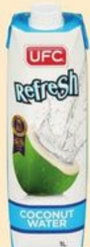
UFC REFRESH COCONUT WATER 1 L 20570506_EA