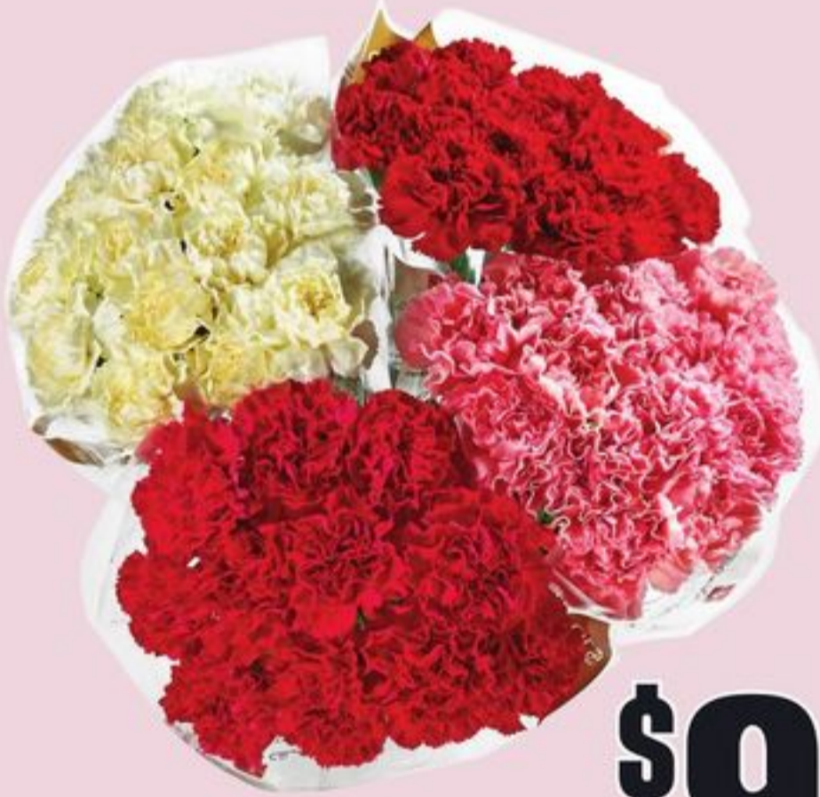
CARNATION BUNCH IN ASSORTED COLOURS 21087795_EA