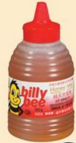
BILLY BEE HONEY 500 G 21001564_EA