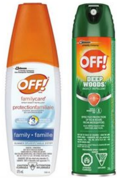
OFF! OR RAID INSECT REPELLENT SELECTED VARIETIES 20001279002_EA/20158572_EA