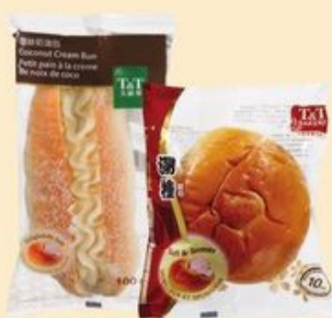
T&T® BAKERY BUNS SELECTED VARIETIES 90/100 G 20332833_EA 20334565_EA