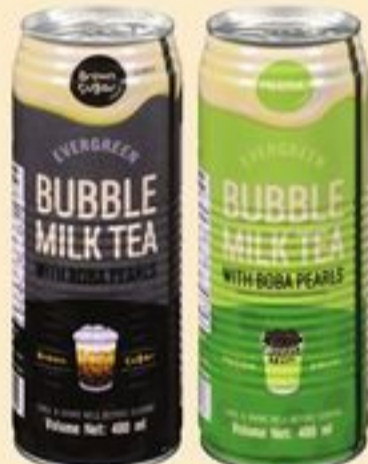
EVERGREEN BUBBLE MILK TEA SELECTED VARIETIES 480 ML 21528465_EA 21528467_EA