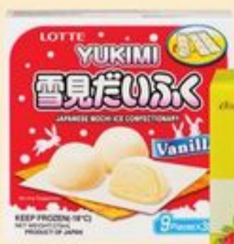
BINGGRAE T'AOM ICE BAR, 5'S OR LOTTE MOCHI 270 G SELECTED VARIETIES FROZEN 21247111_EA 21566306_EA