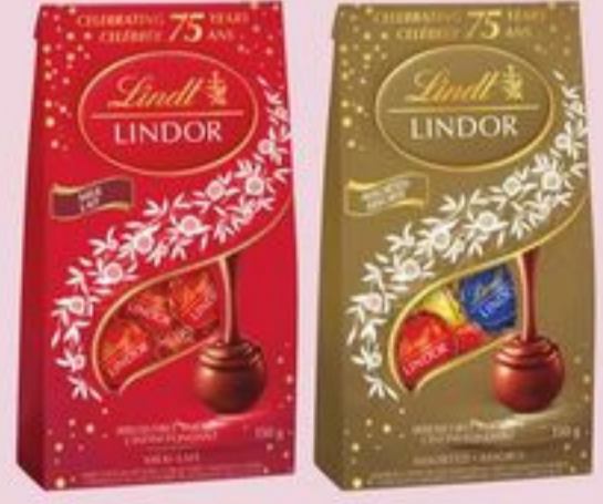
LINDOR OR GHIRARDELLI CHOCOLATE BAGS SELECTED VARIETIES 116-151 G 21390291_EA 21390363_EA