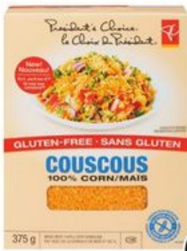
PC* GLUTEN-FREE COUSCOUS SELECTED VARIETIES 375 G 20749043_EA