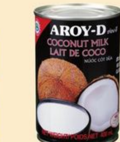
AROY-D COCONUT MILK SELECTED VARIETIES 400 ML 20063864_EA