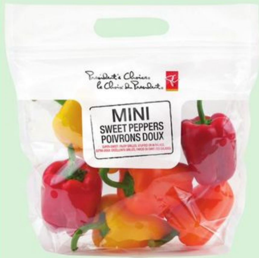
PC ® MINI PEPPERS PRODUCT OF CANADA 454 G 20920821001_EA