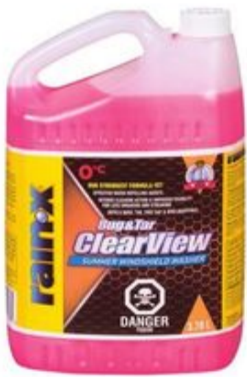
RAIN-X SUMMER BREEZE WINDSHIELD WASH 3.78 L 21534718_EA