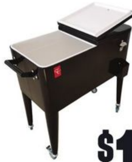
PC® RETRO COOLER 77 QUART 21480391_EA/21480408_EA