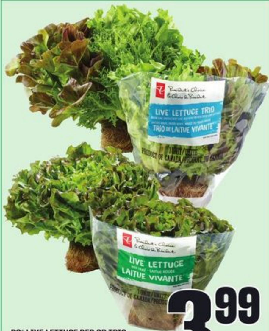
PC ® LIVE LETTUCE RED OR TRIO PRODUCT OF CANADA 1'S 21506580_EA/21178850_EA