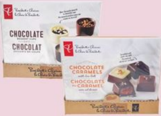
PC® BAR DESSERT COLLECTION 145 G OR CHOCOLATE SALTED CARAMELS 158 G 21197993_EA 21200083_EA