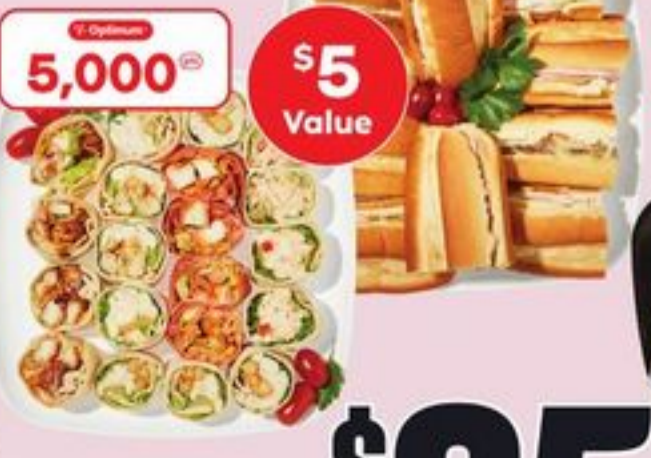
PIN WHEELS WRAP OR SMALL GAME NIGHT PLATTER EACH 21558135_EA/21557919_EA