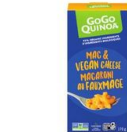
GOGO QUINOA MAC & VEGAN CHEESE SELECTED VARIETIES 170 G 21380709_EA