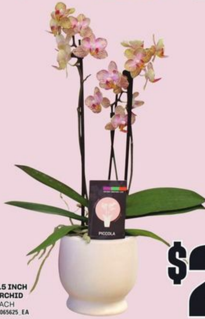
3.5 INCH ORCHID EACH 21065625_EA