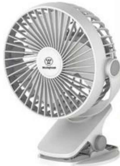
HONEYWELL OR WESTINGHOUSE FANS SELECTED VARIETIES 20129604_EA/21507828_EA