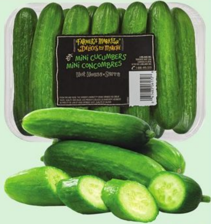
FARMER'S MARKET SM MINI CUCUMBERS PRODUCT OF ATLANTIC CANADA 11'S 21070679001_EA