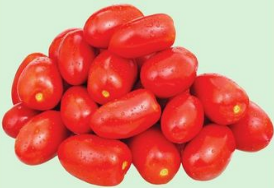
GREENHOUSE ROMA TOMATOES PRODUCT OF MEXICO 5.49/KG 20143381001_KG