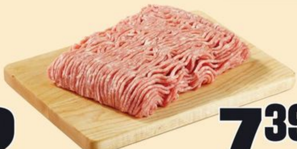
LEAN GROUND PORK 16.29/KG 20833248_KG