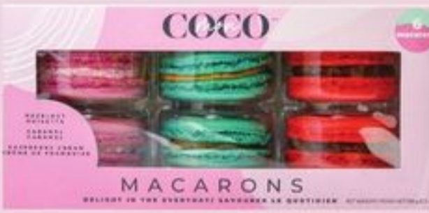
COCO BAKERY MACARON SELECTED VARIETIES 206 G 21587432_EA