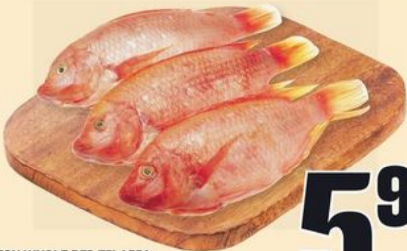
FRESH WHOLE RED TILAPIA 13.21/KG 20057884_KG