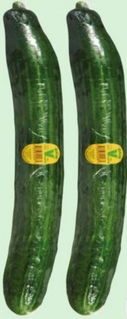
ORGANIC ENGLISH CUCUMBER PRODUCT OF ATLANTIC CANADA EACH 20080489001_EA