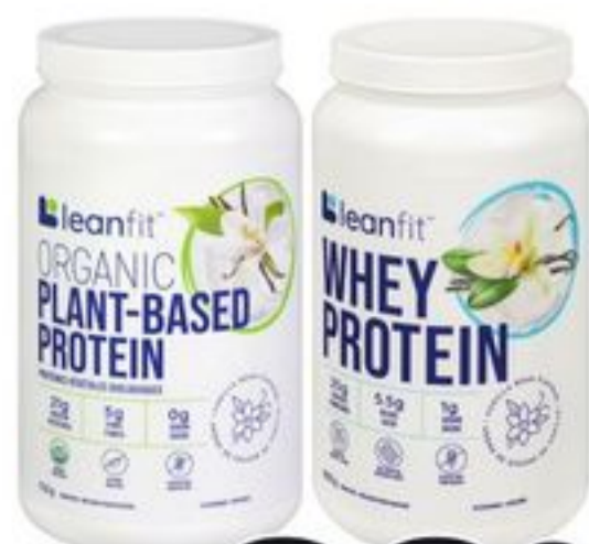
LEANFIT ORGANIC PLANT-BASED PROTEIN 715 G OR WHEY PROTEIN 517-579 G SELECTED VARIETIES 21395716_EA/21403978_EA