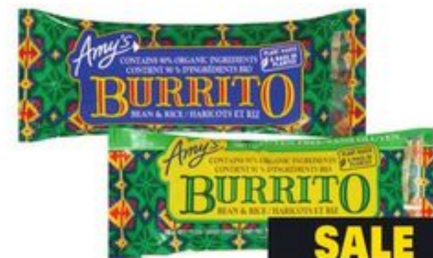
AMYS KITCHEN SELECTED VARIETIES AND SIZES 20042092002_EA/20371439001_EA