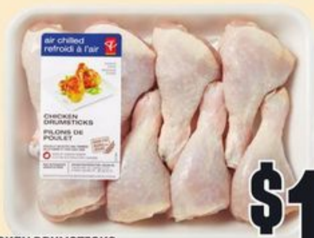
PC® CHICKEN DRUMSTICKS AIR CHILLED 8'S 21341042_EA

Optimum Members-Only Price™ 99¢ Non-members 1 49