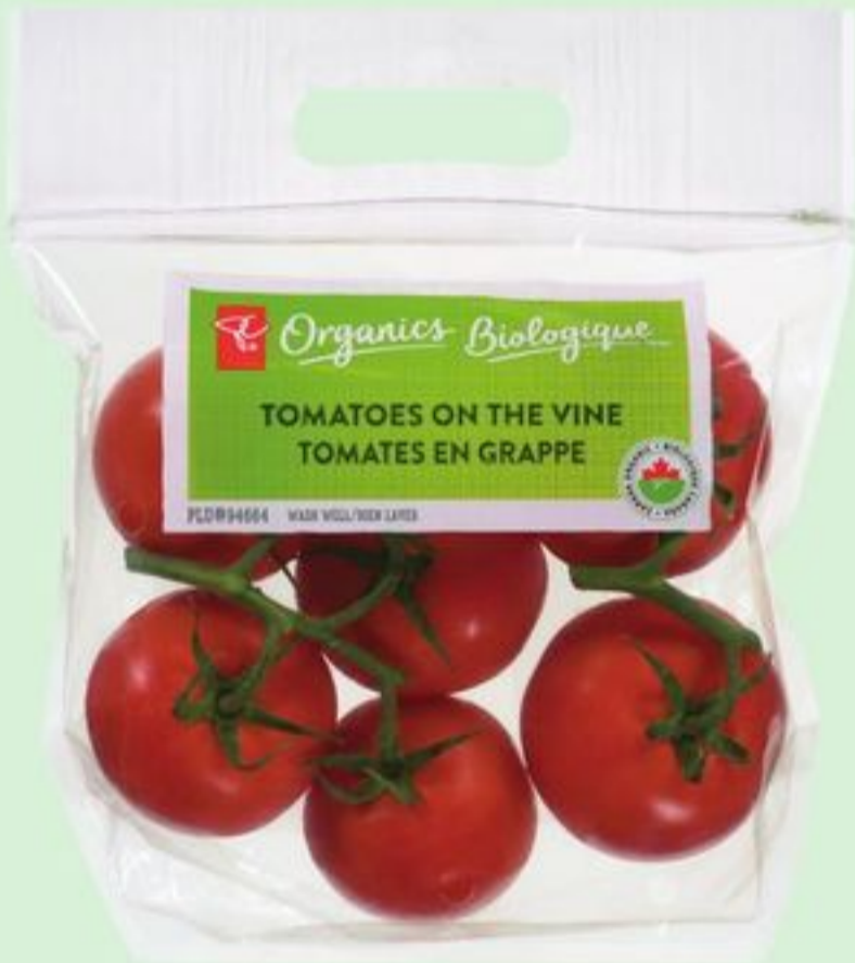
PC ® ORGANICS TOMATOES ON THE VINE PRODUCT OF CANADA 9.90/KG 20127917001_KG