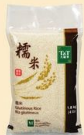
T&T® GLUTINOUS RICE 1.8 KG 20828956_EA