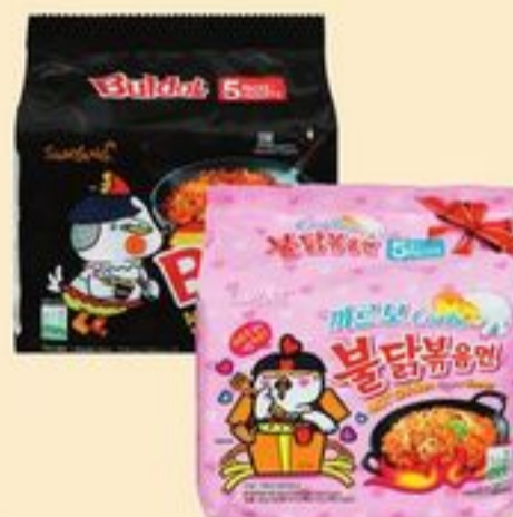
SAMYANG BULDAK RAMEN SELECTED VARIETIES 650-700 G 21345870_C05 21450283_EA