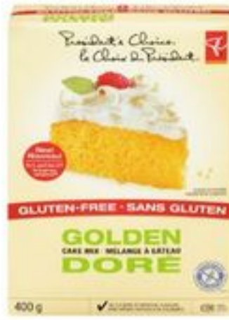
PC* ORGANICS GLUTEN-FREE CAKE MIX OR FLOUR SELECTED VARIETIES 400/800 G 20689979001_EA/20809079_EA