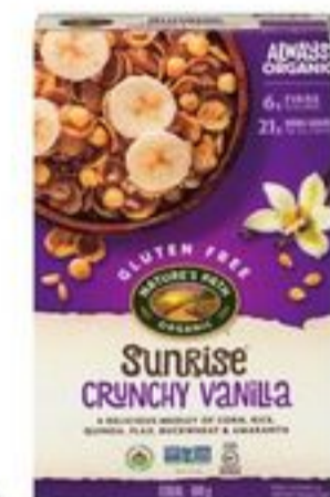
NATURES PATH SUNRISE CEREAL 300 G OR PC* ORGANICS GLUTEN-FREE ROLLED OATS 900 G SELECTED VARIETIES 20043938002_EA/21396198_EA