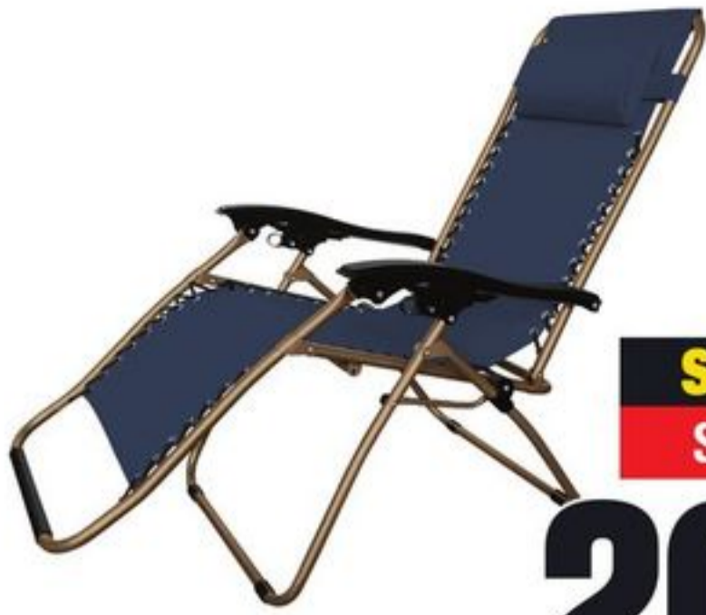
CAMP CHAIRS SELECTED VARIETIES 21456849_EA