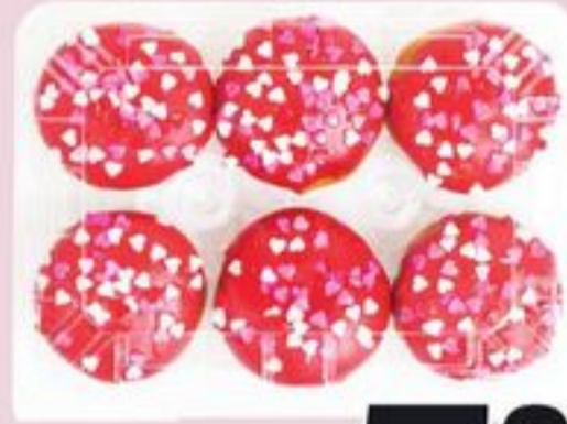
MINI MOTHER'S DAY DONUTS 6'S 21355442_EA