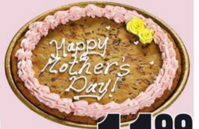
BAKED MOTHER'S DAY MESSAGE COOKIE CAKE 612 G 20966119_C10