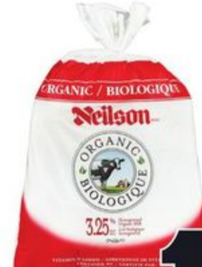
NEILSON ORGANIC MILK SELECTED VARIETIES 4 L 20711395_EA