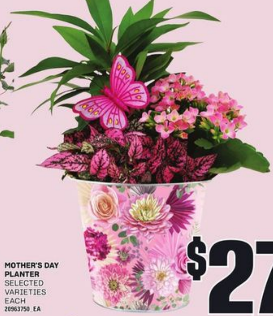
MOTHER'S DAY PLANTER SELECTED VARIETIES EACH 20963750_EA