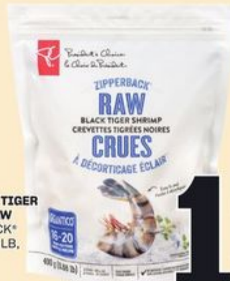
PC® BLACK TIGER SHRIMP ZIPPERBACK® 16-20 PER LB. FROZEN 400 G 20801192_EA