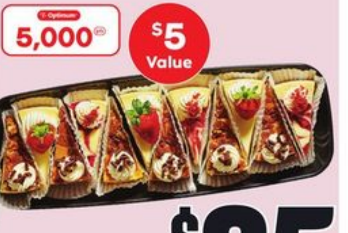
CHEESECAKE TRAY 108 G 2096282_EA