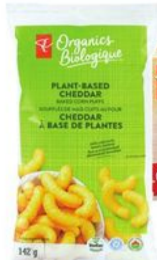
PC* GLUTEN-FREE WAFFLES OR PC* ORGANICS VEGAN PUFFS SELECTED VARIETIES 142-198 G 21358684_EA/21419163_EA