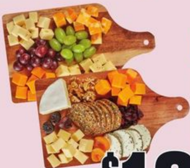
BACK TO BASICS CHEESE BOARD SELECTED VARIETIES 412-432 G 21405571_EA/21405538_EA