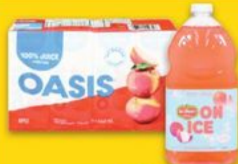
OASIS JUICE or ARIZONA ICED TEA, ALLEN'S APPLE or CRANBERRY COCKTAIL or DEL MONTE ON ICE REFRESHERS 1.89 L selected varieties jus ou thé glacé ou boissons 20313744002 SA/21375061 SA