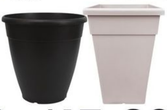
HAVANA PLANTERS SELECTED STYLES 21576659_EA 21576658_EA