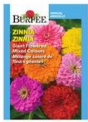
BURPEE OR MCKENZIE SEEDS SELECTED VARIETIES 20752992_EA/20752876_EA