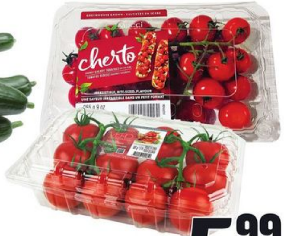
ONTARIO TOMATOES CHERTO 255 G OR VERO TOMATOES 680 G PRODUCT OF ONTARIO 21046464001_EA/21068372001_EA