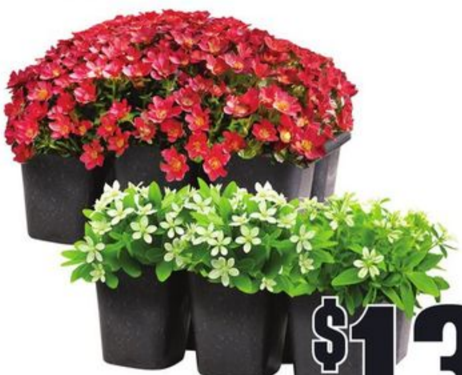
GROUNDCOVERS 6'S 20161178_EA