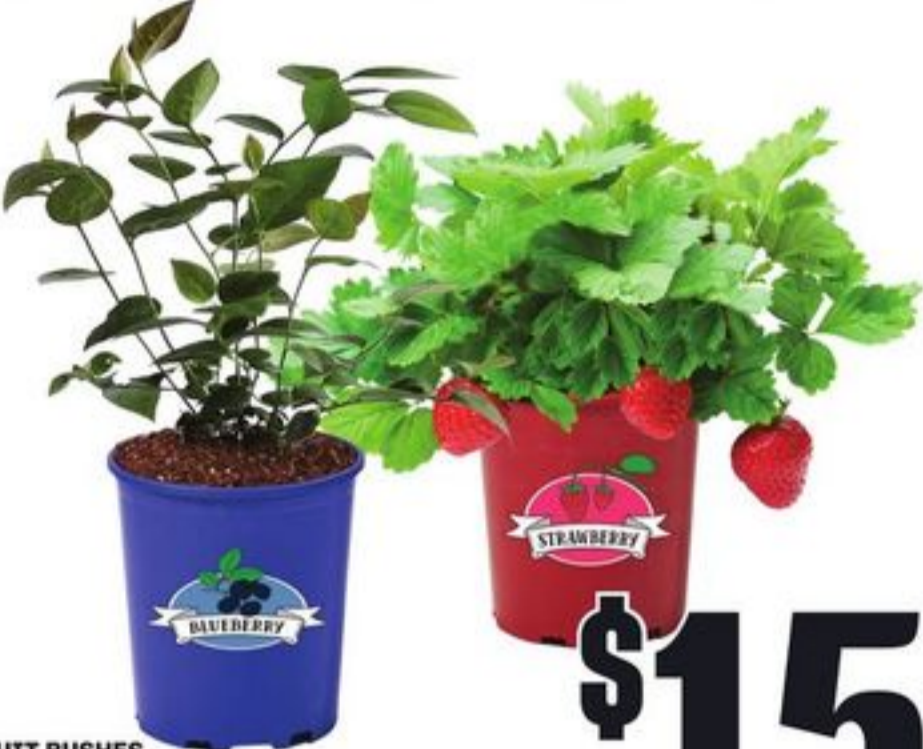
FRUIT BUSHES SELECTED VARIETIES 1 GALLON 21214932_EA