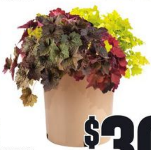
HEUCHERA PLANTER 2 GALLON 21578835_EA