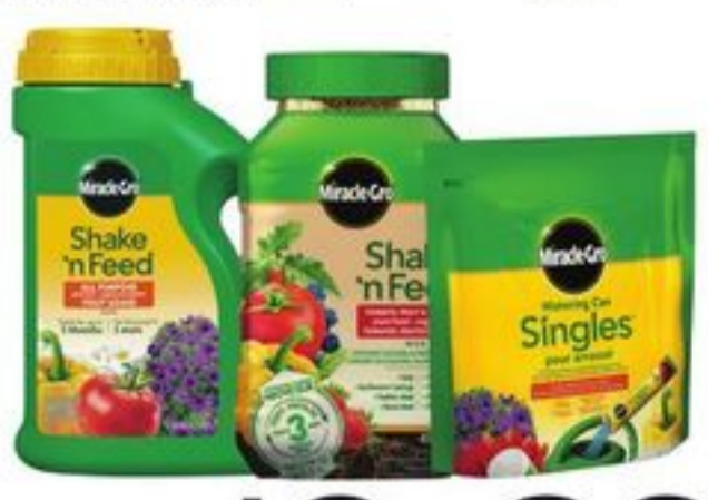
PLANT FOOD FERTILIZER SELECTED TYPES AND SIZES 21567431_EA 21157858_EA 21567705_EA