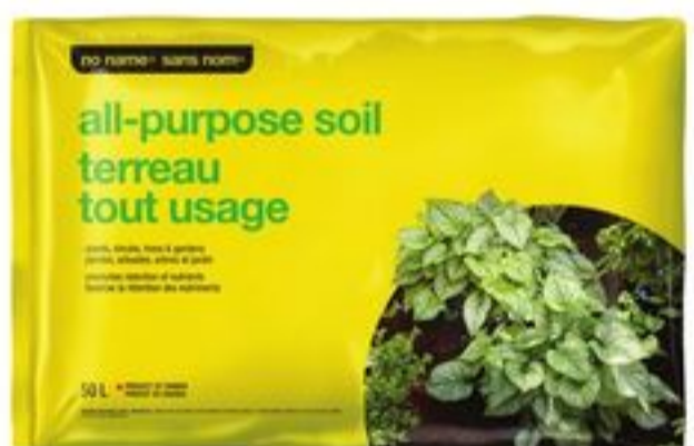
NO NAME® ALL-PURPOSE SOIL 50 L 21358664_EA