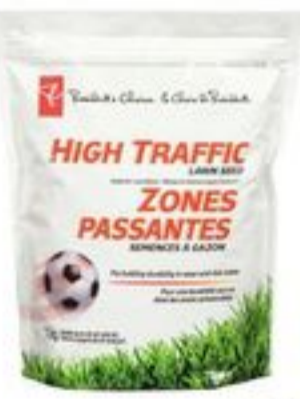
PC® GRASS SEED SELECTED VARIETIES 1 KG 21359477_EA 21359479_EA