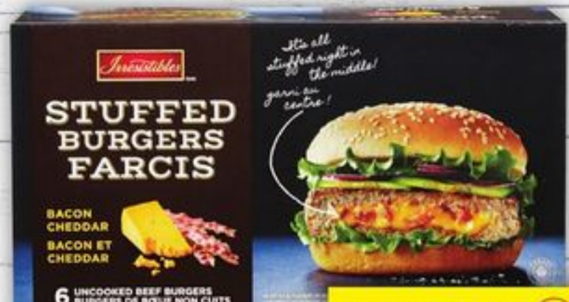
IRRESISTIBLES STUFFED BEEF BURGERS 1.02 KG FROZEN SELECTED VARIETIES