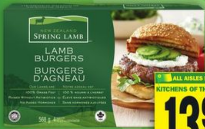
NEW ZEALAND LAMB BURGERS 540 G FROZEN SELECTED VARIETIES

ALL AISLES LEAD HOME KITCHENS OF THE WORLD 3.99 /LB