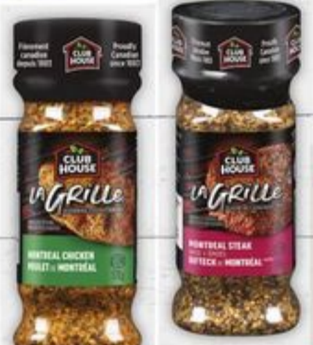
CLUB HOUSE LA GRILLE SPICES 120 - 248 G SELECTED VARIETIES