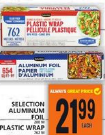
SELECTION ALUMINUM FOIL PAPER 200 M PLASTIC WRAP 762 M SELECTED VARIETIES