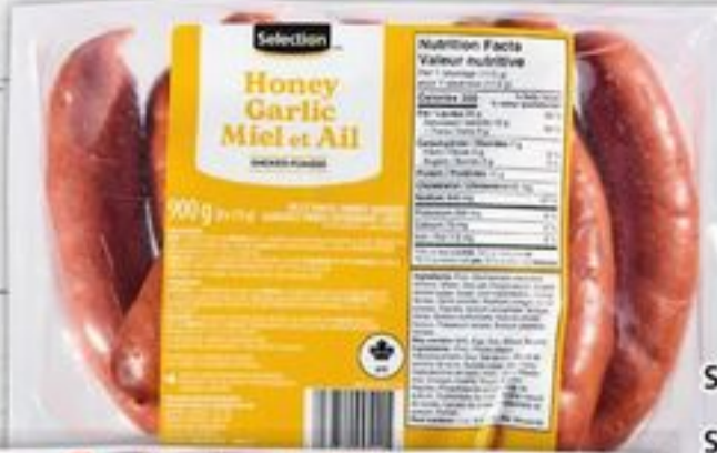
SELECTION SMOKED SAUSAGES 900 G SELECTED VARIETIES