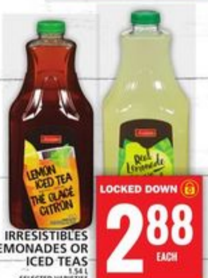
IRRESISTIBLES LEMONADES OR ICED TEAS 1.5 L SELECTED VARIETIES