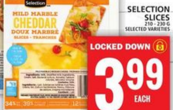
SELECTION SLICES 210 - 230 G SELECTED VARIETIES