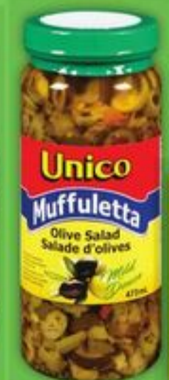
MOLISANA OLIVES OR UNICO MUFFULETTA 473, 750 ML SELECTED VARIETIES

ALL AISLES LEAD HOME KITCHENS OF THE WORLD 5.49 EACH