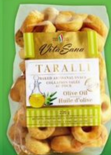
VITA SANA TARALLI 225 G SELECTED VARIETIES

ALL AISLES LEAD HOME KITCHENS OF THE WORLD 5.49 EACH