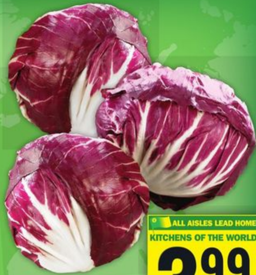
RADICCHIO PRODUCT OF U.S.A. OR MEXICO 8.80/KG

ALL AISLES LEAD HOME KITCHENS OF THE WORLD 1.48 /LB