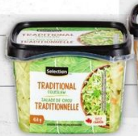
SELECTION DELI SALADS 454 G SELECTED VARIETIES