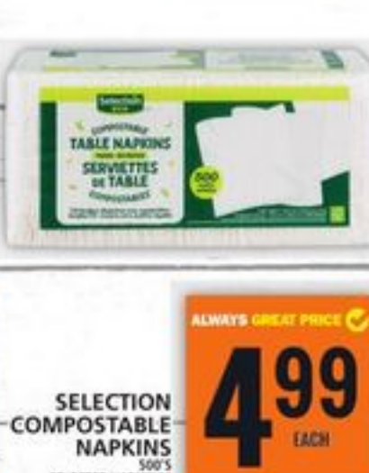
SELECTION COMPOSTABLE NAPKINS 50'S SELECTED VARIETIES