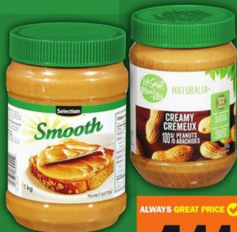
SELECTION OR LIFE SMART NATURALIA PEANUT BUTTER 750 G - 1 KG SELECTED VARIETIES