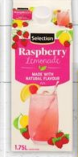
SELECTION LEMONADES 1.75 L SELECTED VARIETIES