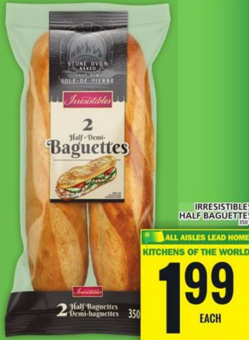
IRRESISTIBLES HALF BAGUETTES 350 G

ALL AISLES LEAD HOME KITCHENS OF THE WORLD 6.99 /LB