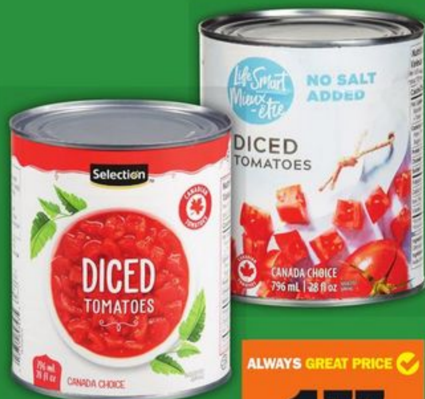
SELECTION OR LIFE SMART DICED TOMATOES 540 - 796 ML SELECTED VARIETIES