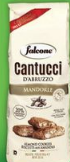
FALCONE CANTUCCI 800 G SELECTED VARIETIES

ALL AISLES LEAD HOME KITCHENS OF THE WORLD 2.49 EACH