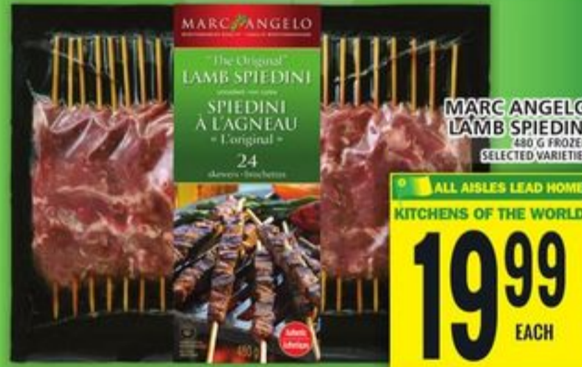
MARC ANGELO LAMB SPIEDINI 24 340 G FROZEN SELECTED VARIETIES

ALL AISLES LEAD HOME KITCHENS OF THE WORLD 13.99 EACH