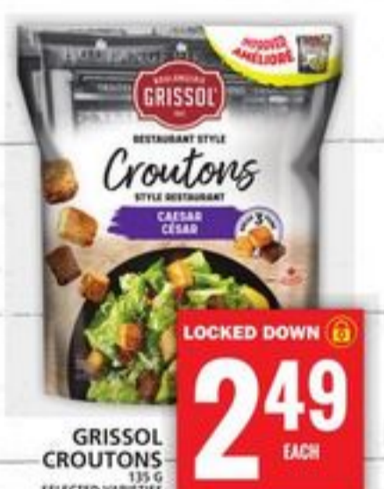
GRISSOL CROUTONS 135 G SELECTED VARIETIES