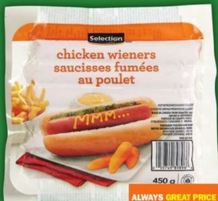
SELECTION CHICKEN WIENERS 450 G SELECTED VARIETIES