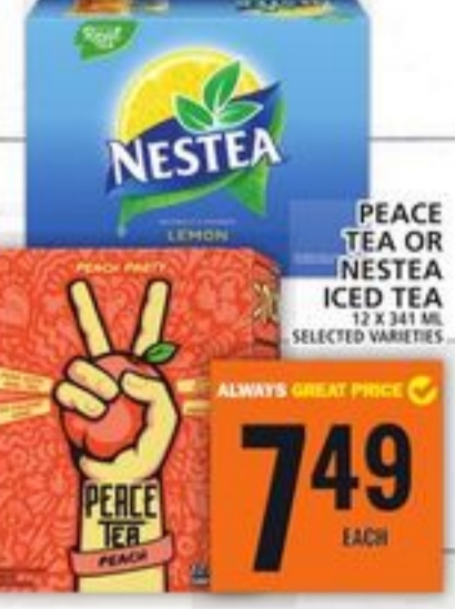
PEACE TEA OR NESTEA ICED TEA 1.2 X 241 ML SELECTED VARIETIES