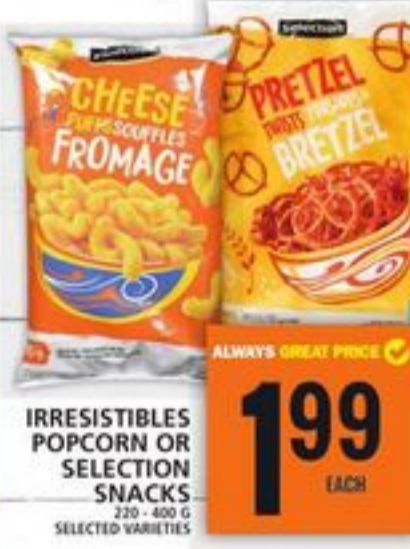
IRRESISTIBLES POPCORN OR SELECTION SNACKS 225 - 400 G SELECTED VARIETIES