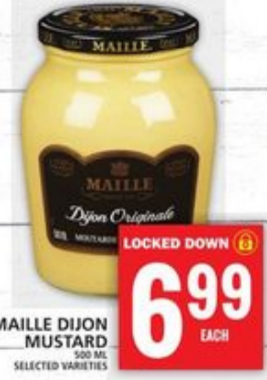
MAILLE DIJON MUSTARD 500 ML SELECTED VARIETIES