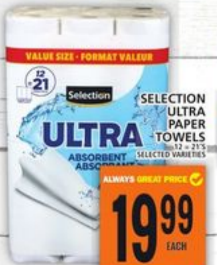
SELECTION ULTRA PAPER TOWELS 12 X 21.5 SELECTED VARIETIES