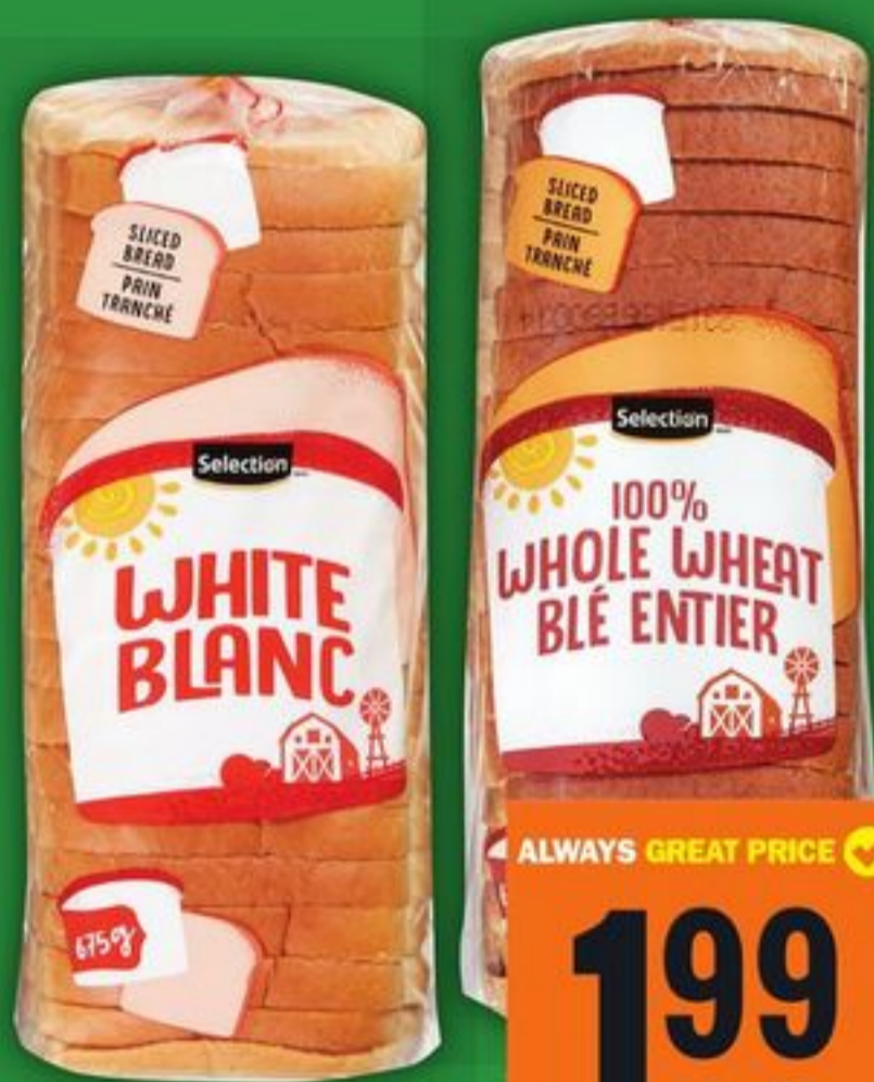
SELECTION BREAD 875 G SELECTED VARIETIES