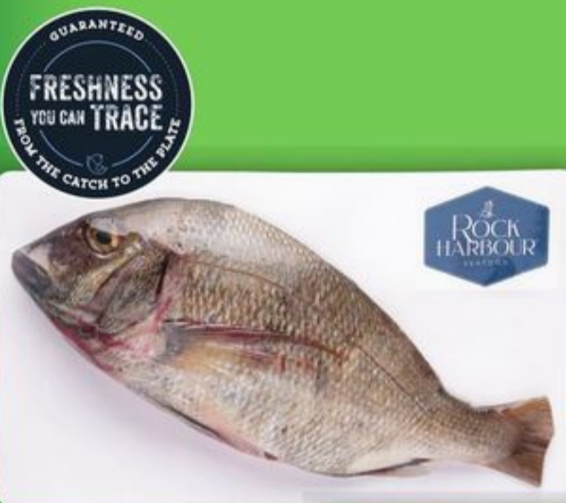
FRESH WHOLE PORGY FISH 15.41/KG

ALL AISLES LEAD HOME KITCHENS OF THE WORLD 19.99 EACH