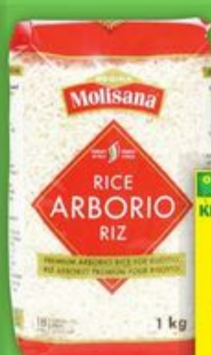
REGINA MOLISANA LASAGNE OR ARBORIO RICE 500 G, 1 KG SELECTED VARIETIES

ALL AISLES LEAD HOME KITCHENS OF THE WORLD 4.49 EACH