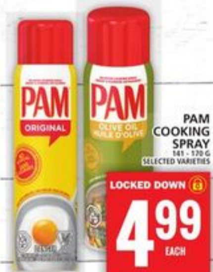
PAM COOKING SPRAY 341 - 120 G SELECTED VARIETIES