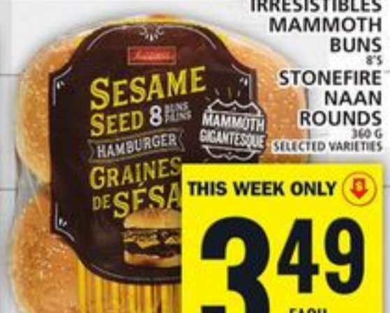
IRRESISTIBLES MAMMOTH BUNS & STONEFIRE NAAN ROUNDS 360 G SELECTED VARIETIES