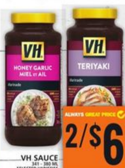
VH SAUCE 341 - 380 ML SELECTED VARIETIES