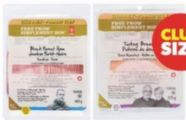
PC® FREE FROM® SLICED DELI MEAT SELECTED VARIETIES, 300-400 G