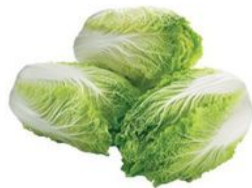
NAPA PRODUCT OF U.S.A. 20015025001_KG