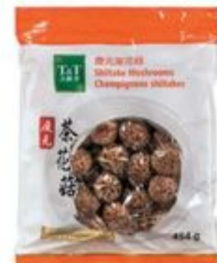
T&T® DRIED SHIITAKE MUSHROOMS 454 G 21026418_EA