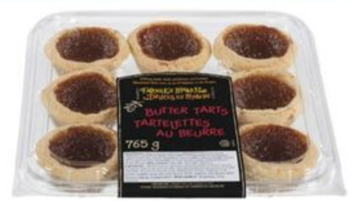
FARMER'S MARKET™ BUTTER TARTS