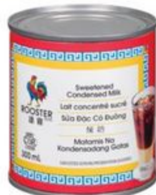
ROOSTER® SWEET CONDENSED MILK 300 ML 20126907_EA