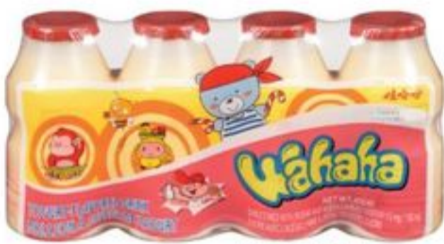
WAHABA YOGURT DRINK 4X100 ML 21091972_EA