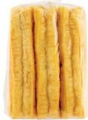
CHINESE LONG DONUTS BAKED IN-STORE, 6'S 20923195_EA