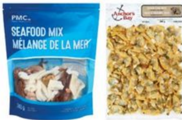
ANCHOR'S BAY MUSSEL MEAT, COOKED CLAM MEAT, OR PMC SEAFOOD MEDLEY FROZEN, 340 G 20792247_EA/21433378_EA