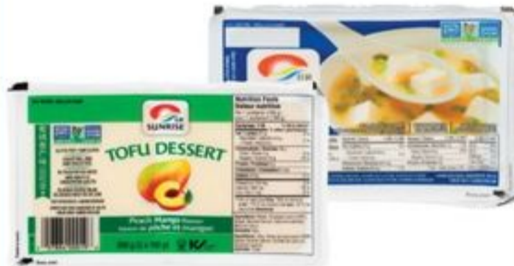
SUNRISE DESSERT OR SOFT TOFU SELECTED VARIETIES 300 G 20131704_EA/20569354_EA