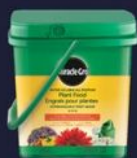
MIRACLE GRO® ALL PURPOSE PLANT FOOD 1.5 KG 21137038_EA