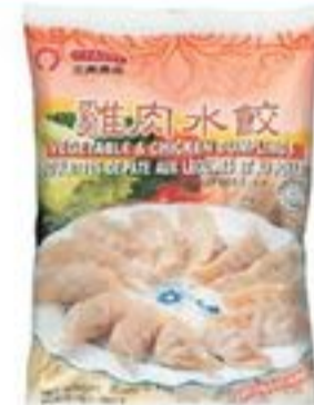
O'TASTY DUMPLINGS SELECTED VARIETIES FROZEN, 567 G 20319343004_EA