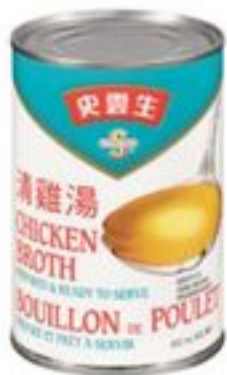
CAMPBELL'S SWANSON CHICKEN BROTH 412 ML 20042814_EA