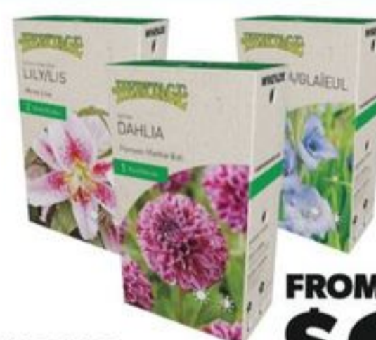
SPRING BULBS PLANT NOW FOR SUMMER BLOOMS, SELECTED VARIETIES 21357246_EA/21357049_EA/21357249_EA