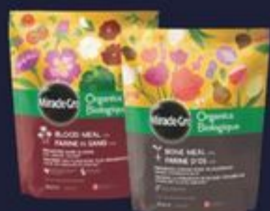
MIRACLE GRO® BLOOD MEAL OR BONE MEAL 1.36 KG 21090312_EA/21090313_EA