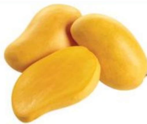
ATAULFO MANGO PRODUCT OF MEXICO 20121509001_EA