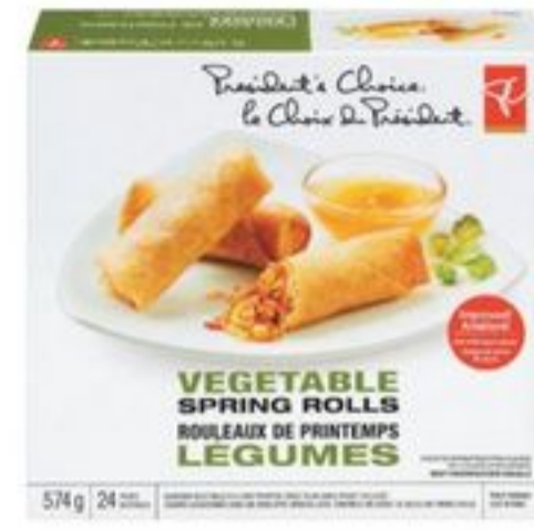
PC® SPRING ROLLS SELECTED VARIETIES, FROZEN, 560/574 G