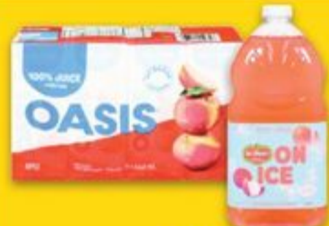
OASIS JUICE or ARIZONA ICED TEA, ALLEN'S APPLE or CRANBERRY COCKTAIL or DEL MONTE ON ICE REFRESHERS 1.89 L selected varieties jus ou thé glacé ou boissons 20313744002 SA/21375041 SA