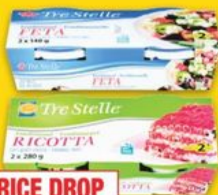
TRE STELLE CHEESE TWIN PACK selected varieties 240-560 g fromage 21100062 SA/21100064 SA