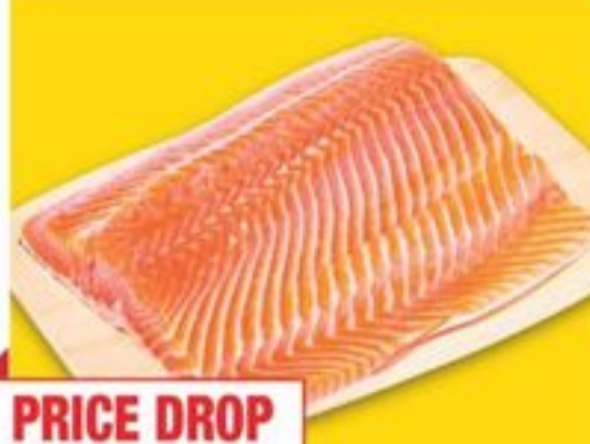
STEELHEAD TROUT FILLET frozen 22.02/kg filet de truite 21496445 KC