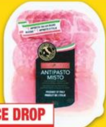
MARCANGELO SLICED DELI MEAT selected varieties 100 g viandes de charcuterie 20681202 SA