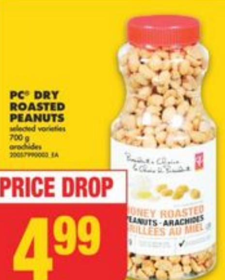
PC® DRY ROASTED PEANUTS selected varieties 700 g arachides 2005799002 SA