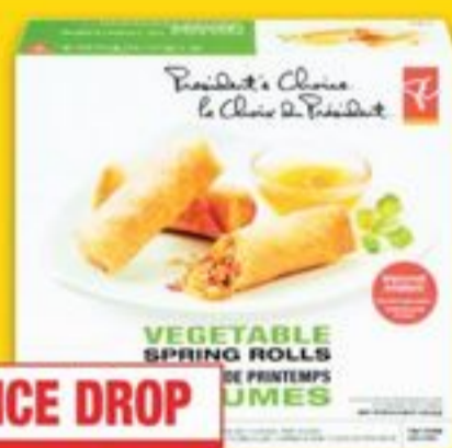
PC® SPRING ROLLS selected varieties, frozen 574 g rouleaux de printemps 20692094 SA