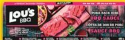
LOU'S PORK BACK RIBS selected varieties, frozen 680 g côtes de dos 21320777 SA