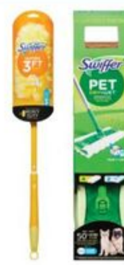
SWIFFER SWEEPER OR DUSTER STARTER KITS OR WET JET SWEEPER OR DUSTER REFILLS 16-48'S