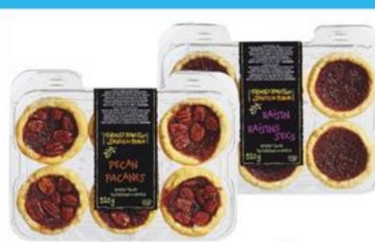
FARMER'S MARKET™ HOMESTYLE TARTS