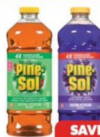
PINE-SOL CLEANER SELECTED VARIETIES, 1.41 L