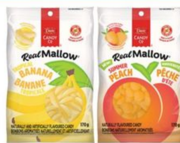
DARE REAL MALLOW CANDY SELECTED VARIETIES, 170 G