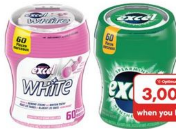
EXCEL GUM BOTTLE SELECTED VARIETIES, 40/60'S