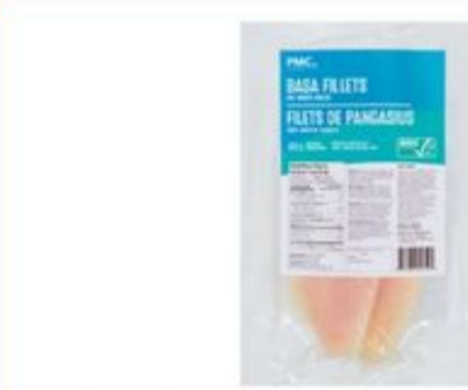
PMC BASA FILLETS, 400 G OR ANCHOR'S BAY MUSSEL MEAT 340 G OR BASA FILLETS 400 G FROZEN 20432307_EA