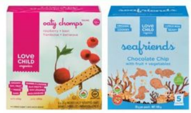
LOVE CHILD ORGANICS OATY CHOMPS OR SEAFRIENDS BABY SNACKS SELECTED VARIETIES, 100-140 G