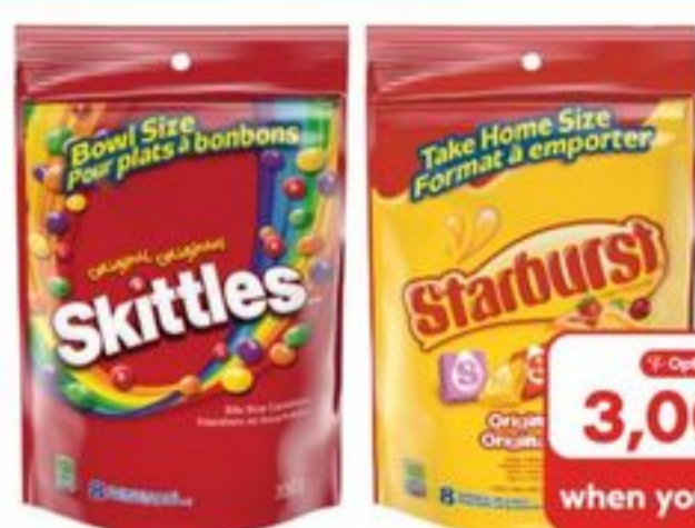
SKITTLES OR STARBURST CANDY BAGS SELECTED VARIETIES, 280/320 G