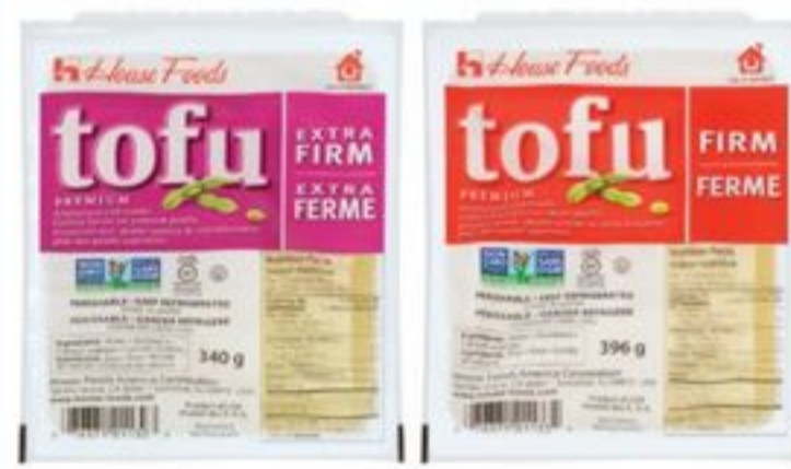
HOUSE FOODS TOFU SELECTED VARIETIES, 340/396 G 21315424_EA/21315429_EA