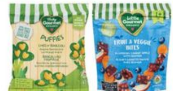
BABY GOURMET ORGANIC PUFFIES, MUSHIES OR FRUIT & VEGGIE BITES BABY SNACKS 23-60 G OR BABY GOURMET OR EARTH'S BEST BARS 90/133 G SELECTED VARIETIES