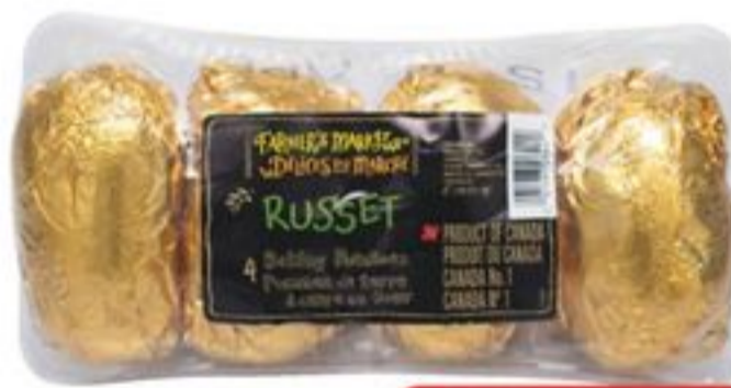
FARMER'S MARKET™ BAKING POTATOES