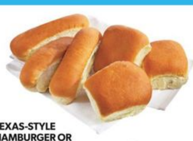
TEXAS-STYLE HAMBURGER OR HOT DOG BUNS 8'S OR BRIOCHE HAMBURGER