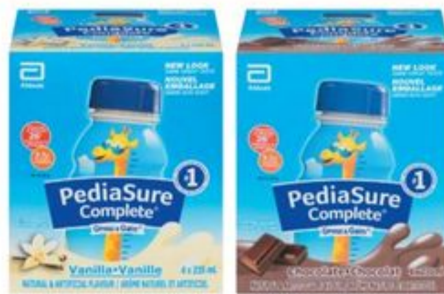
PEDIASURE COMPLETE NUTRITIONAL SUPPLEMENT SELECTED VARIETIES, 4X235 ML