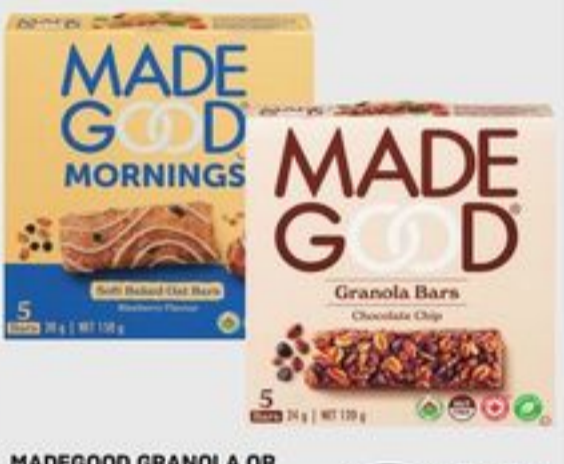
MADEGOOD GRANOLA OR MORNINGS BARS, SOFT BAKED COOKIES, MINIS OR SQUARES SELECTED VARIETIES 110-150 G 21425468_EA/20797052001_EA