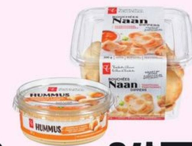
PC® DIPS OR HUMMUS 190-227 G OR PC® NAAN DIPPERS 200 G SELECTED VARIETIES 20584097_EA 21092033_EA