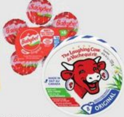
BABYBEL 6'S OR THE LAUGHING COW 8'S SELECTED VARIETIES 20319107_EA/ 20574332_EA