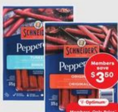
SCHNEIDERS PEPPERETTES SELECTED VARIETIES 250-375 G 20976093_EA/ 20976110_EA

Members save $3 50 Members-Only Price 7 99 Non-members 11 49