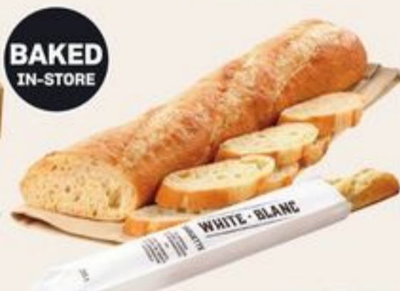
BAGUETTE WHITE OR WHOLE WHEAT 255 G 21529211_EA