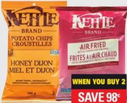
KETTLE POTATO CHIPS SELECTED VARIETIES 198 G 21520692_EA/21589837_EA

WHEN YOU BUY 2 SAVE $1.48 2/6.50 LESS THAN 2 $3.99 EA.