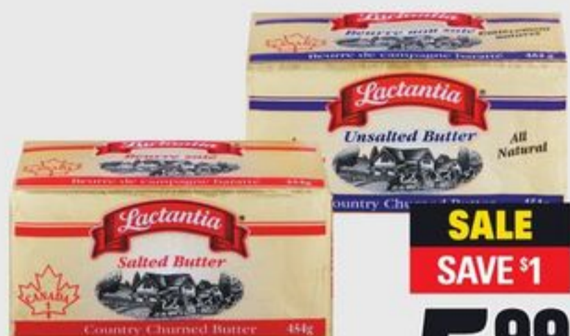
LACTANTIA BUTTER SELECTED VARIETIES 454 G 20296112005_EA/20639926_EA