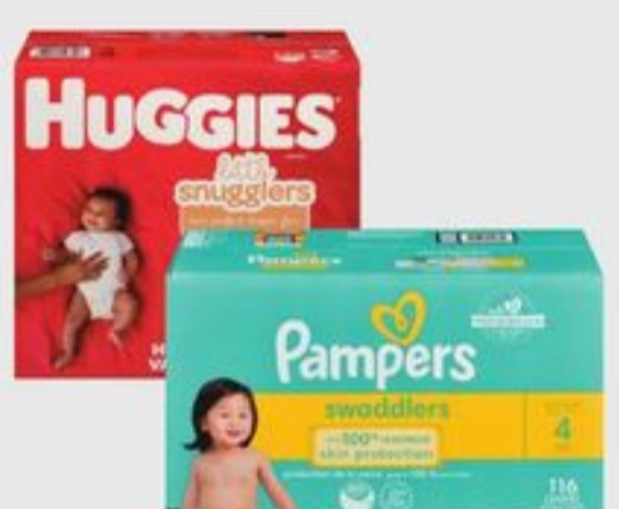
HUGGIES OR PAMPERS DIAPERS SELECTED VARIETIES 62-174'S 21456492_EA 21551525_EA