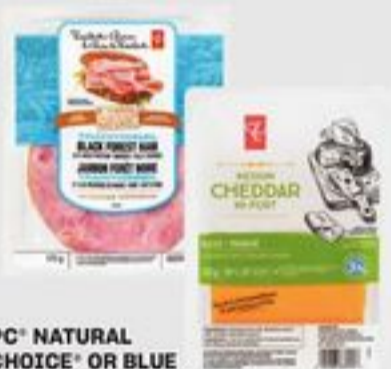
PC® NATURAL CHOICE® OR BLUE MENU® SLICED DELI MEATS 175 G OR PC® CHEESE SLICES 140-170 G SELECTED VARIETIES 20216643_EA/20310580_EA