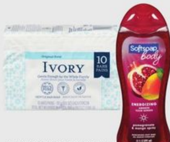
IRISH SPRING OR IVORY BAR SOAP 6X10.4 G/10X90 G OR IRISH SPRING, SOFTSOAP OR IVORY BODY WASH 591/621 ML SELECTED VARIETIES 20347887002_EA/21218375_EA