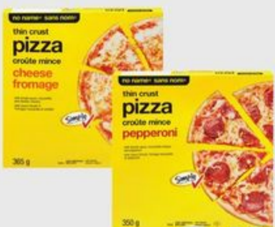
NO NAME® PIZZA SELECTED VARIETIES FROZEN 369-411 G 21541429_EA/21541441_EA

WHEN YOU BUY 2 SAVE 98¢ 2/$6 LESS THAN 2 $3.49 EA.