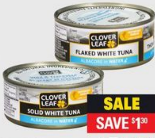
CLOVER LEAF WHITE TUNA SELECTED VARIETIES 170 G 20167571_EA 20326358001_EA