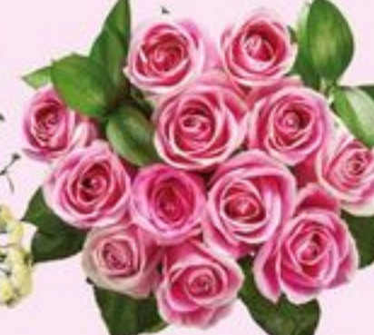
DOZEN ROSES SELECTED VARIETIES 20581781_EA