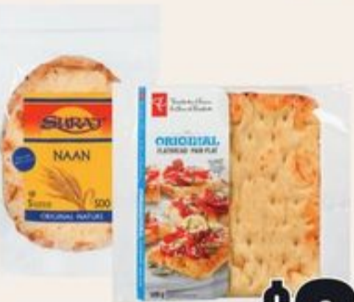
PC® FLATBREAD 220/300 G OR SURAJ™ NAAN 5'S SELECTED VARIETIES 20910042_EA/21051353_EA