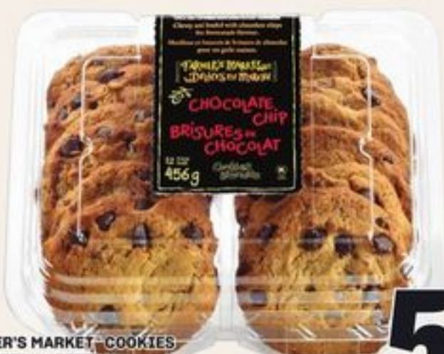
FARMER'S MARKET™ COOKIES SELECTED VARIETIES 12'S 20566774_EA