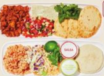
CHICKEN, FAJITA, TANDOORI OR GYRO TACO TRAYS SELECTED VARIETIES 1-1.1 KG 21395977_EA/21595419_EA

Great to go items plus applicable taxes.