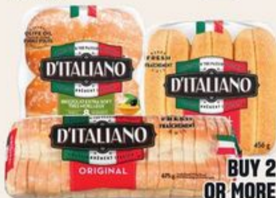
D'ITALIANO BREAD OR BUNS SELECTED VARIETIES AND SIZES 20038335_EA/20627101_EA/ 20627103_EA

BUY 2 OR MORE 3 50 EA. LESS THAN 2 $3.99 EA.