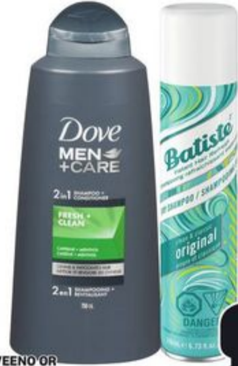
DOVE, BATISTE, AVEENO OR GARNIER WHOLE BLENDS HAIR CARE OR STYLING SELECTED VARIETIES AND SIZES 20419882001_EA/20850398_EA