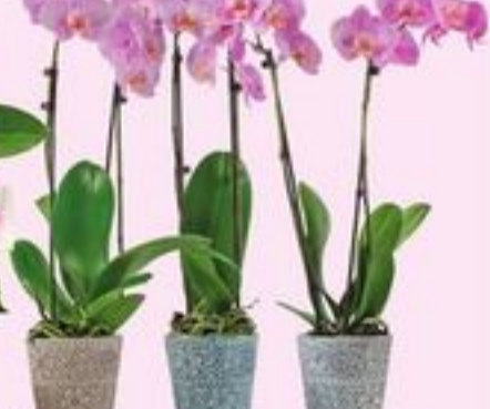
DOUBLE SPIKE ORCHID IN CERAMIC SELECTED VARIETIES EACH 20293541_EA