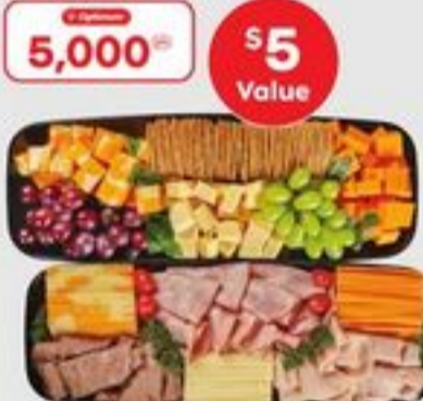
PARTY PLATTERS SELECTED VARIETIES 696 G/1.8 KG 21217521_EA/21217522_EA