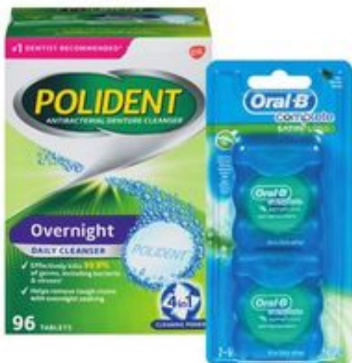
SENSODYNE RAPID RELIEF OR REPAIR AND PROTECT TOOTHPASTE, POLIDENT TABLETS 84-96'S, ORAL-B BATTERY TOOTHBRUSH, CREST PRO HEALTH OR SCOPE MOUTHWASH OR CREST GUM DETOXIFY TOOTHPASTE SELECTED VARIETIES AND SIZES 20437569002_EA/205598749_EA