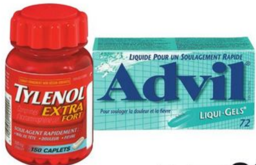
ASPIRIN 100/120'S, ALEVE 40-100'S, ALEVE-X 72 G, TYLENOL 72-150'S, MOTRIN 60/150'S OR ADVIL 40-72'S PAIN RELIEF TABLETS, CAPLETS, GELS OR RUB SELECTED VARIETIES 20077169001_EA/20328051_EA