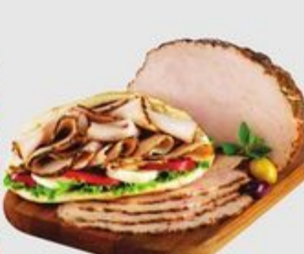
PC® CHICKEN SERVICE CASE MEATS SELECTED VARIETIES 20301114_KG

Members save $3 50 Members-Only Price 7 99 Non-members 11 49