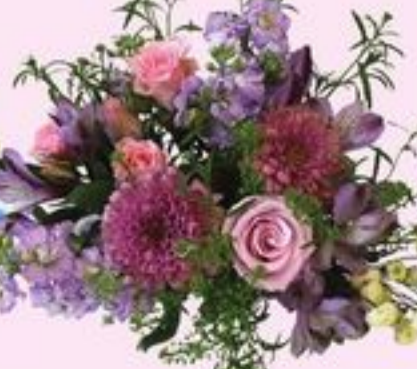
SIGNATURE GIFT BOUQUETS SELECTED VARIETIES 21436377_EA/21436378_EA