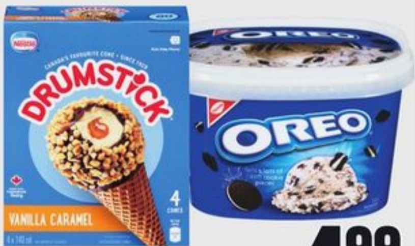
NESTLÉ DRUMSTICK 4'S OR CONFECTORY FROZEN DESSERT 1.5 L OR BARS 4-10'S SELECTED VARIETIES FROZEN 20322380001_EA/20324757003_EA