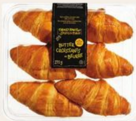
FARMER'S MARKET™ BUTTER CROISSANTS SELECTED VARIETIES 6'S 20975943_EA