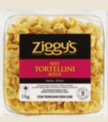
ZIGGY'S® PASTA SELECTED VARIETIES 1 KG 21521156_EA