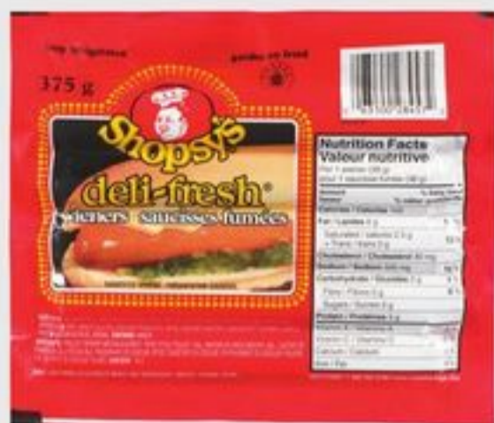
SHOPSY'S DELI-FRESH WIENERS 375 G 21094890_EA