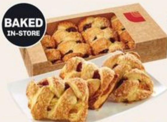
MINI BRAIDED STRUDELS OR MAPLE PECAN DANISH SELECTED VARIETIES 4'S 21464142_EA/21464199_EA