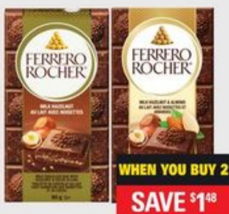
FERRERO ROCHER TABLET SELECTED VARIETIES 90 G 21428863_EA/21570452_EA

WHEN YOU BUY 2 SAVE $1.48 2/6.50 LESS THAN 2 $3.99 EA.