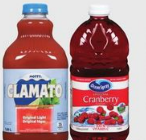
MOTT'S CLAMATO JUICE 1.89 L OR OCEAN SPRAY 100% JUICE BLEND OR COCKTAIL 1.77 L-1.89 L SELECTED VARIETIES 20300066008_EA/21575320_EA