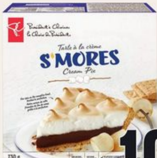
PC® S'MORES CREAM PIE FROZEN 730 G 21574358_EA