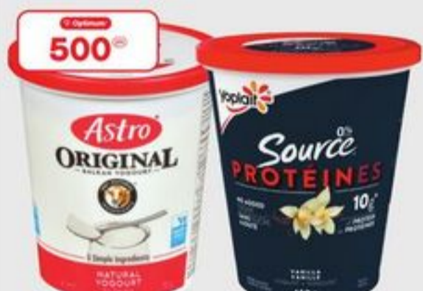
ASTRO OR YOPLAIT PROTEIN YOGURT 625-750 G, SIGGIS OR YOPLAIT YOGURT 4X100 G SELECTED VARIETIES 20165226001_EA/21587947_EA