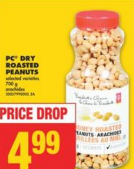
PC® DRY ROASTED PEANUTS selected varieties 700 g arachides 2005799002 SA