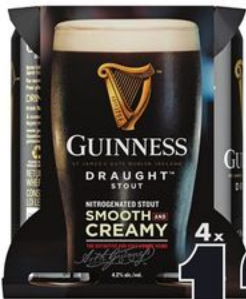
GUINNESS DRAUGHT BEER 4X440 ML CANS 20035374_C04