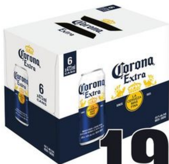
CORONA EXTRA BEER 6X473 ML CANS 21377481_C06