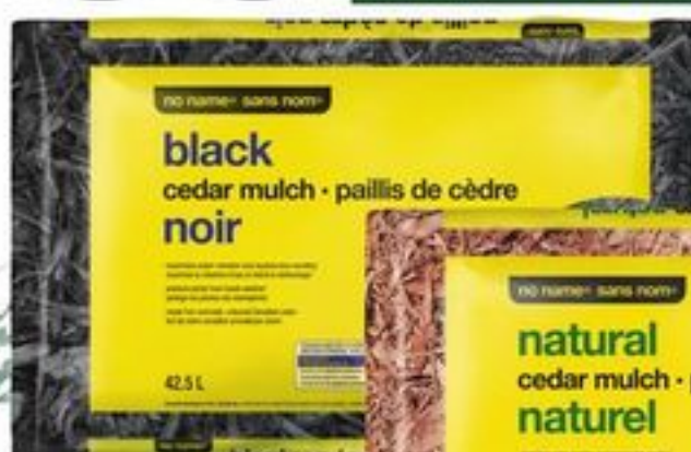
NO NAME® CEDAR MULCH AVAILABLE IN NATURAL, BLACK OR RED 42.5 L 21358531_EA 21358573_EA