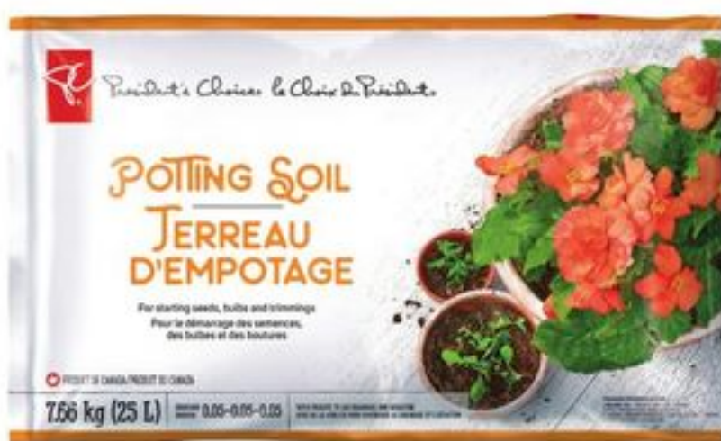
PC® POTTING SOIL 25 L 21349090_EA