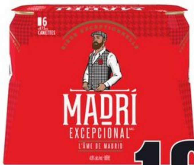
MADRI EXCEPCIONAL BEER 6X473 ML 21607641_C06