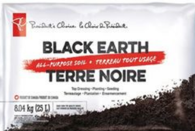
PC® BLACK EARTH SOIL 25 L 21357792_EA