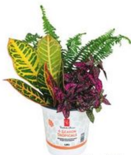
PC® 4-SEASON TROPICALS SELECTED VARIETIES 6 INCH 21347083_EA