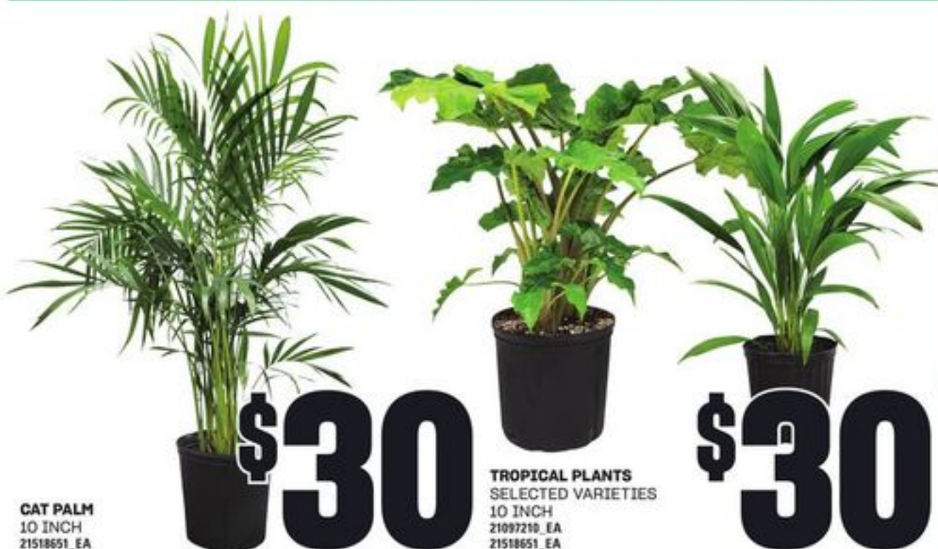
CAT PALM 10 INCH 21518651_EA