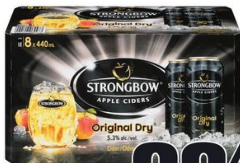
STRONGBOW CIDER 8X440 ML CANS 20125679_C08