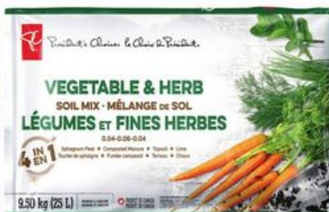
PC® VEGETABLE & HERB SOIL 25 L 21345109_EA