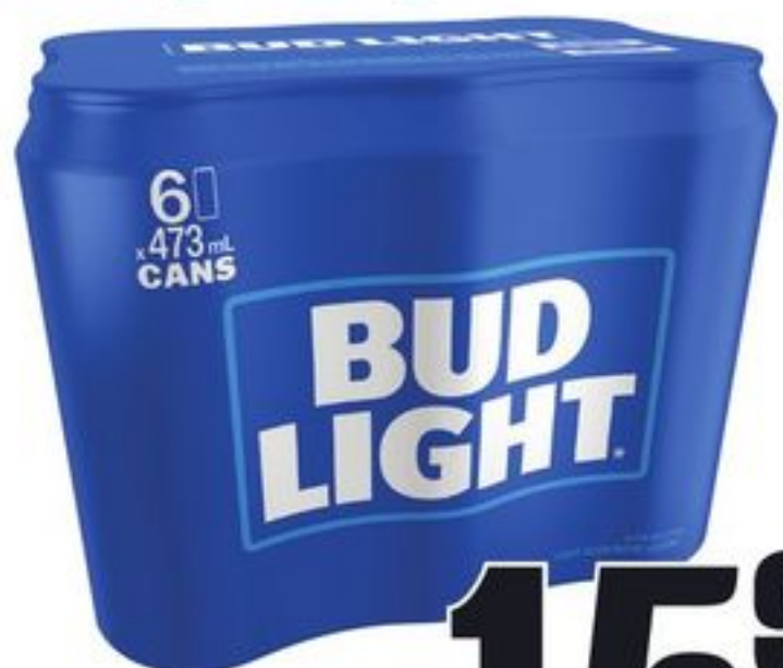
BUD LIGHT BEER 6X473 ML TALL CANS 20955258_C06