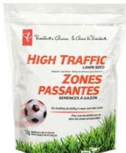
PLANT FOOD FERTILIZER OR GRASS SEED SELECTED VARIETIES AND SIZES EACH 21359477_EA 21567705_EA