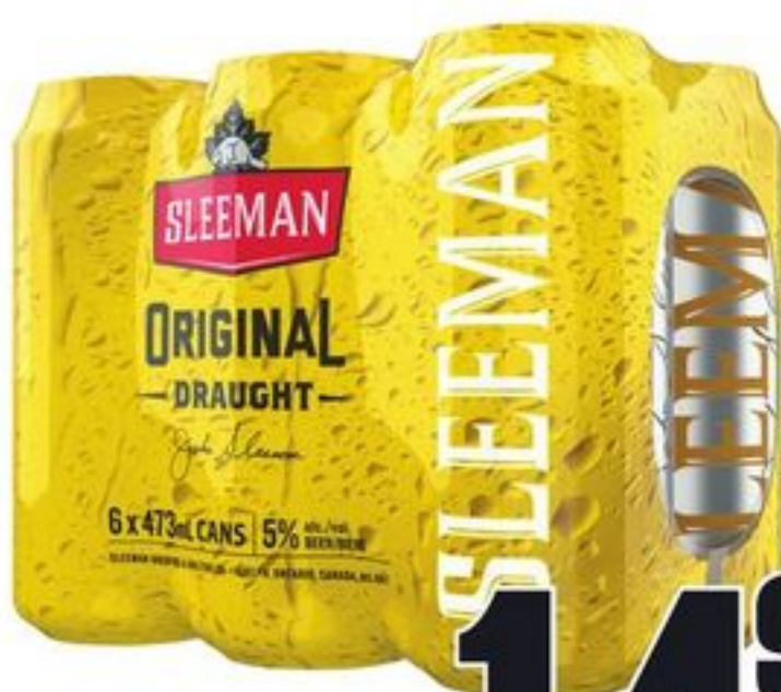
SLEEMAN ORIGINAL DRAUGHT BEER 6X473 ML CANS 20955192_C06