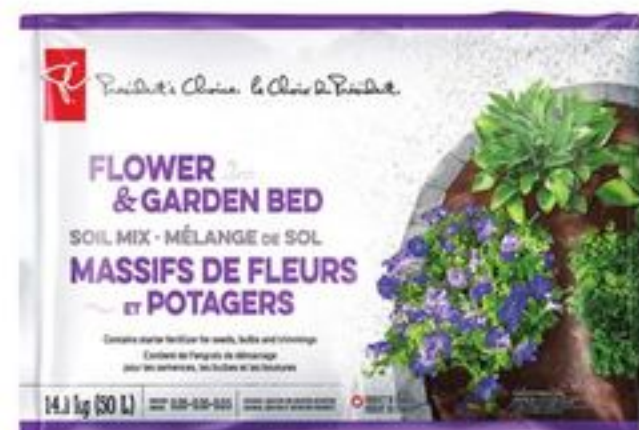
PC® FLOWER & GARDEN BED SOIL 50 L 21363856_EA