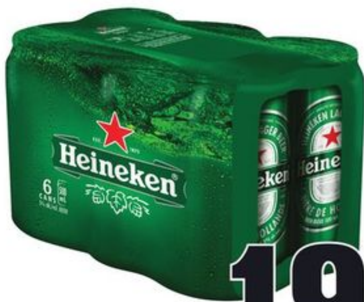
HEINEKEN BEER 6X500 ML TALL CANS 20955260_C06