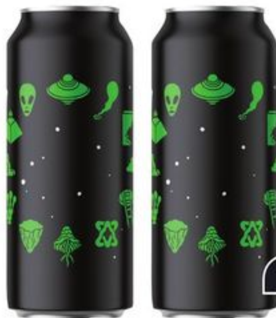
OMNIPOLLO IPA 473 ML CAN 21097266_EA