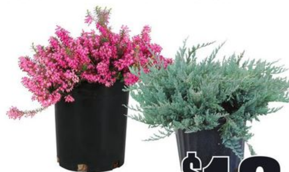
SHRUBS OR EVERGREENS SELECTED VARIETIES 1 GALLON 21214932_EA