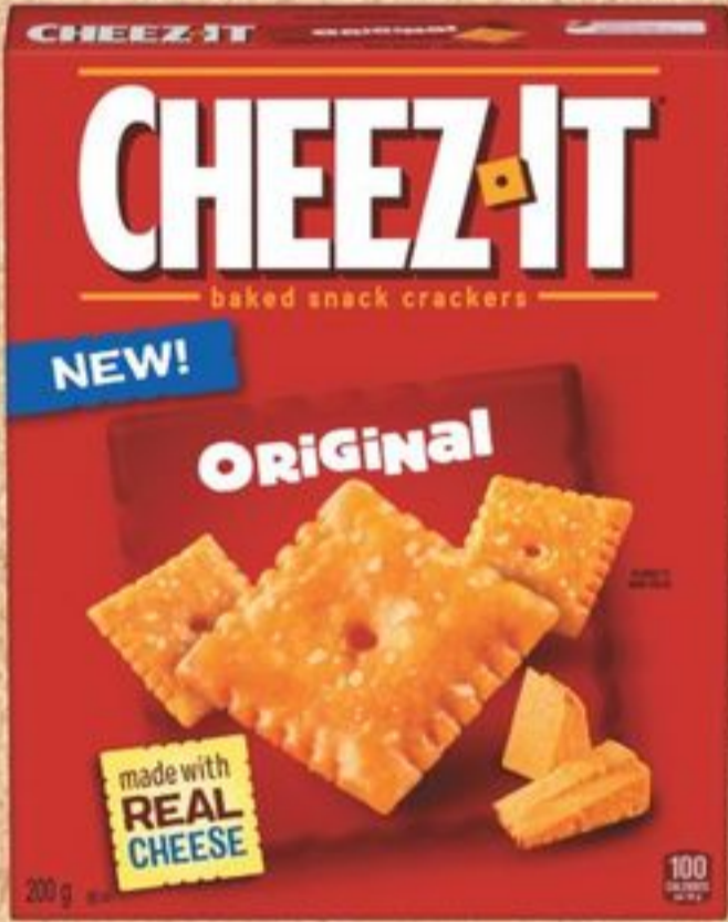
Cheez-It Baked Snack Crackers selected varieties, 191-200g