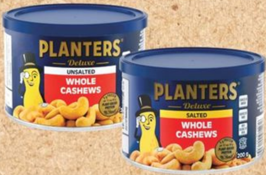
Planters Deluxe Whole Cashews, Salted or Unsalted 200g