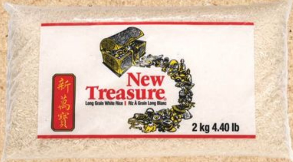
New Treasure Long Grain White Rice 2kg