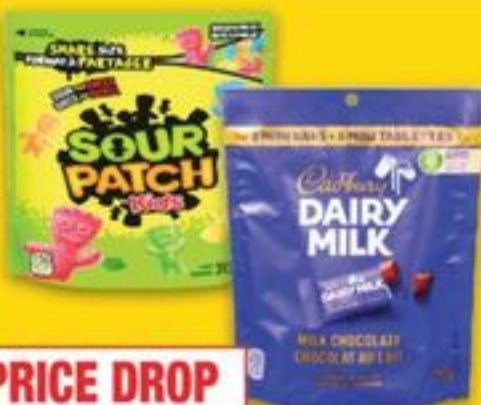
CADBURY POUCH or MAYNARDS CANDY selected varieties chocolat ou friandises 21101861 SA/21343809 SA