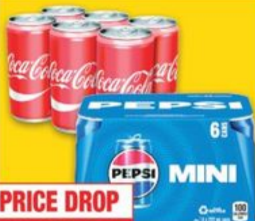
COCA-COLA or PEPSI SOFT DRINKS selected varieties 6x222 mL boissons gazeuses 20344288002 C06/20637340004 C06