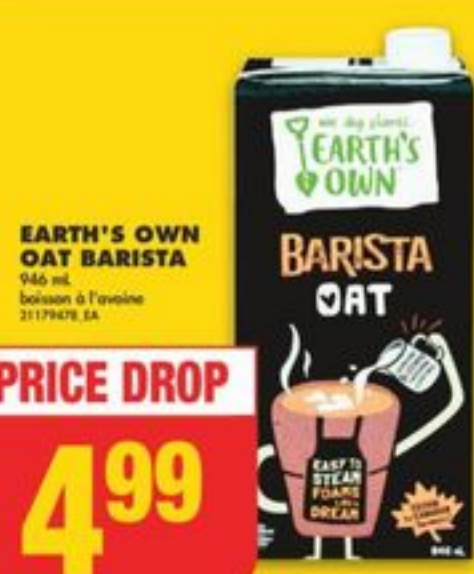
EARTH'S OWN OAT BARISTA 946 mL boisson à l'avoine 21179478 SA