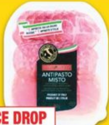
MARCANGELO SLICED DELI MEAT selected varieties 100 g viandes de charcuterie 20681202 SA