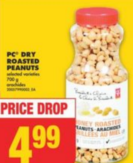
PC® DRY ROASTED PEANUTS selected varieties 700 g arachides 2005799002 SA