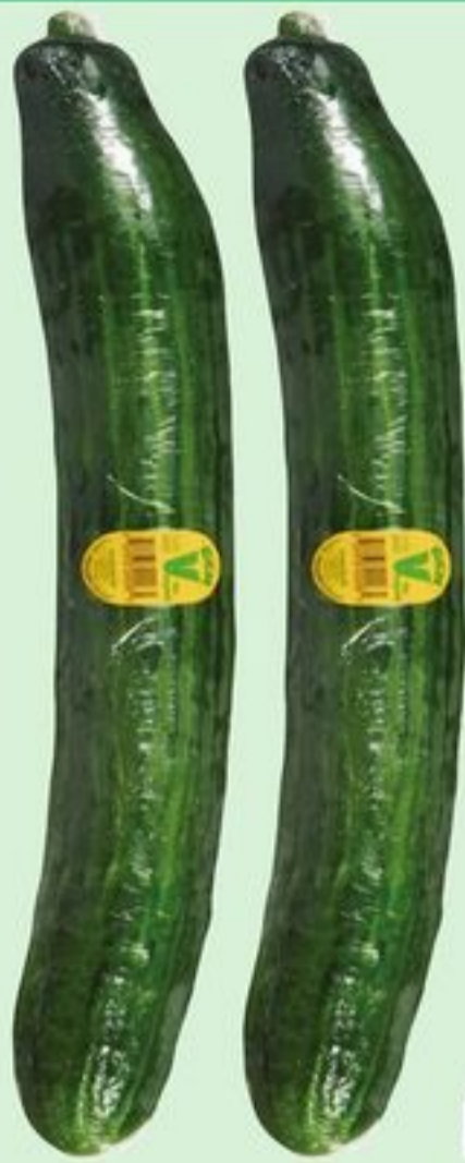
ORGANIC ENGLISH CUCUMBER PRODUCT OF ATLANTIC CANADA EACH 20080489001_EA