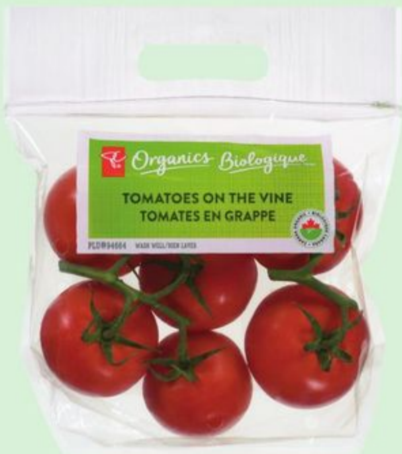
PC ® ORGANICS TOMATOES ON THE VINE PRODUCT OF CANADA 11.00/KG 20127917001_KG