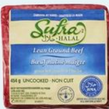
SUFRA™ HALAL LEAN GROUND BEEF 454 G 21397283_EA