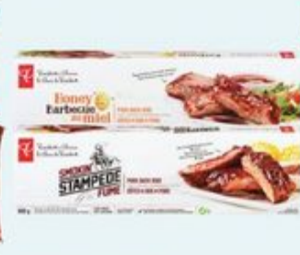
PC™ BBQ PORK BACK RIBS FULLY COOKED, SELECTED VARIETIES 500 G 21284538_EA/21284542_EA