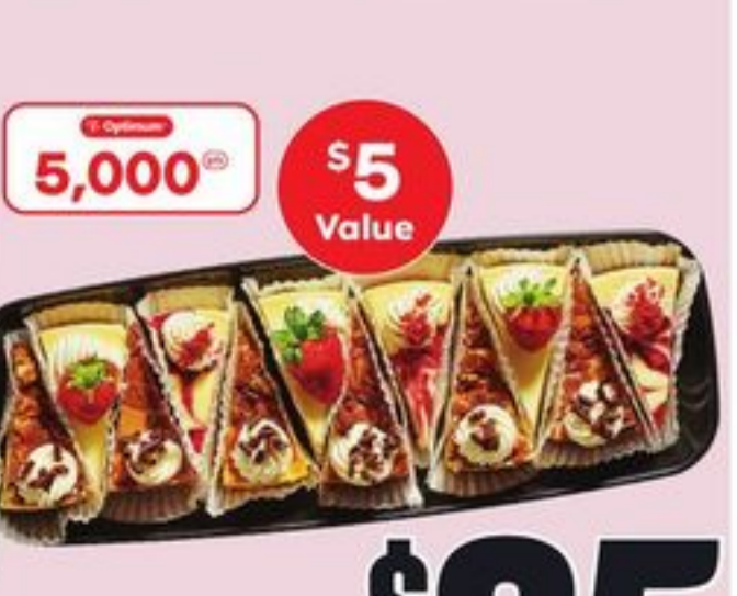
CHEESECAKE TRAY 108 G 2096282_EA