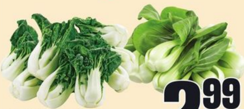
BABY OR SHANGHAI BOK CHOY PRODUCT OF MEXICO 6.59/KG 20082279001_KG/20032454001_KG