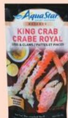
AQUASTAR™ WILD CAUGHT KING CRAB LEGS OR CLAWS FROZEN 500 G 21012170_EA