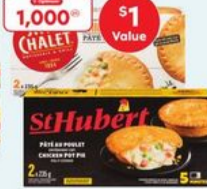
ST-HUBERT OR SWISS CHALET SINGLE PIES FROZEN 470 G 21047000_EA/21047192_EA