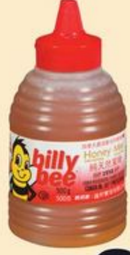
BILLY BEE HONEY 500 G 21001564_EA