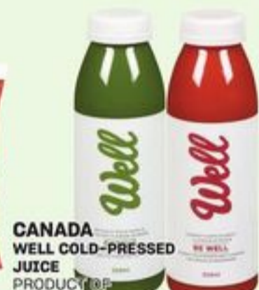
CANADA WELL COLD-PRESSED JUICE PRODUCT OF CANADA, SELECTED VARIETIES 333 ML 21186483_EA/ 21186518_EA