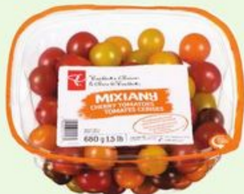
CANADA PC™ MIXIANY CHERRY TOMATOES PRODUCT OF CANADA 680 G 2128588001_EA