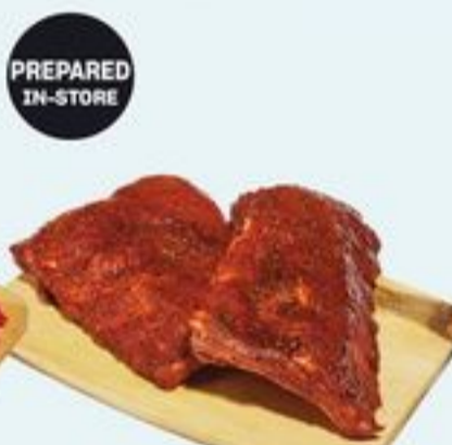
MARINATED PORK BACK RIBS 13.21/KG 21418296_KG