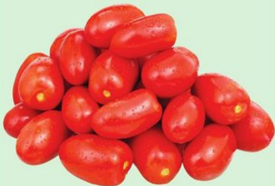
GREENHOUSE ROMA TOMATOES PRODUCT OF MEXICO 6.15/KG 20143381001_KG