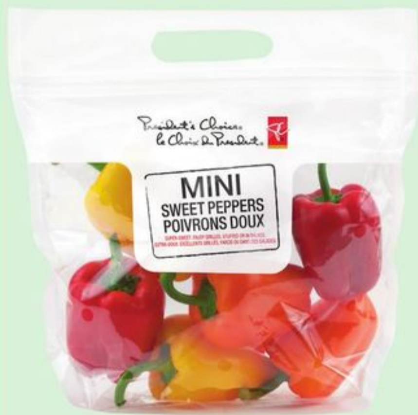
PC ® MINI PEPPERS PRODUCT OF CANADA 454 G 20920821001_EA