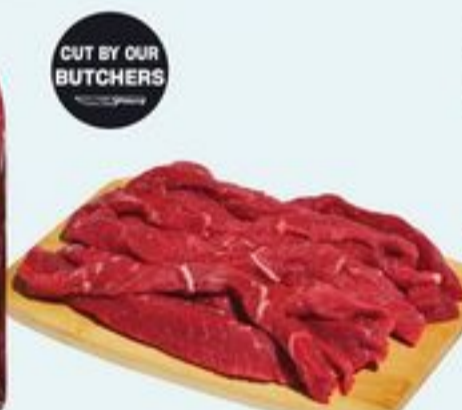
BEEF STIR FRY STRIPS 250 G 21588067_EA