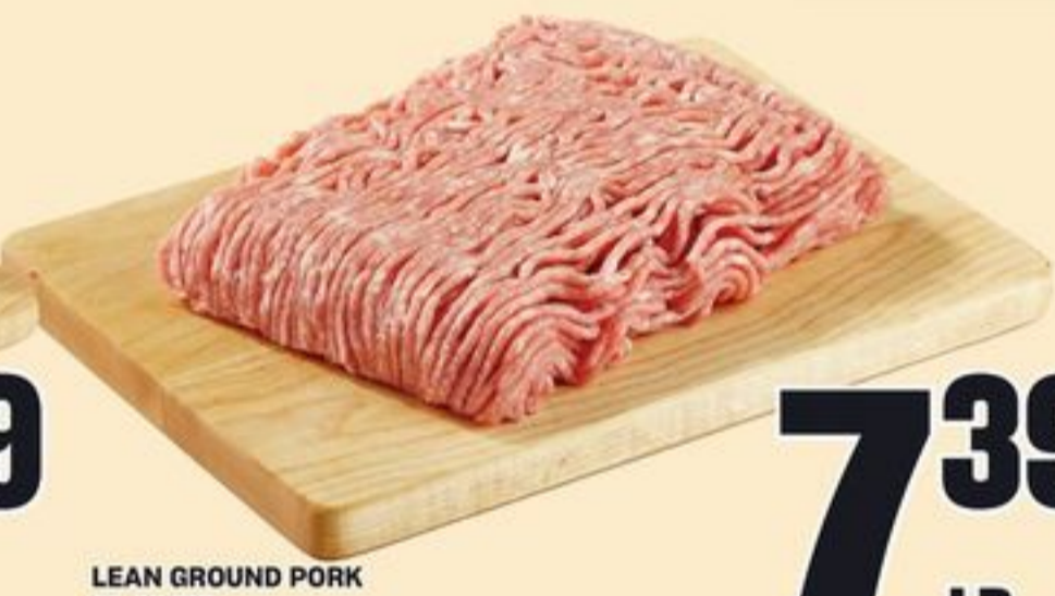
LEAN GROUND PORK 16.29/KG 20833248_KG