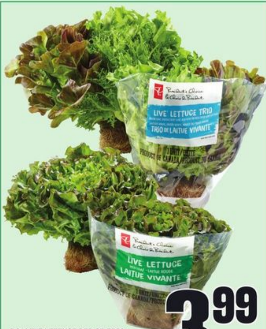
PC ® LIVE LETTUCE RED OR TRIO PRODUCT OF CANADA 1'S 21506580_EA/21178850_EA