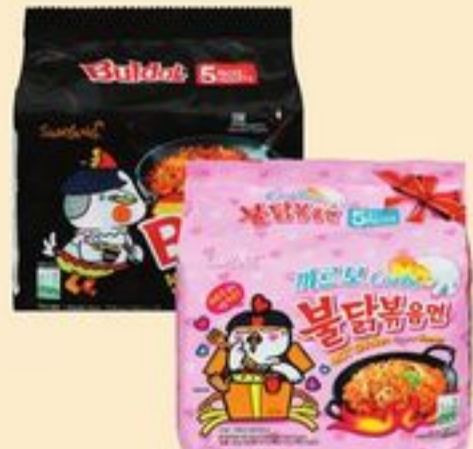
SAMYANG BULDAK RAMEN SELECTED VARIETIES 650-700 G 21345870_C05 21450283_EA