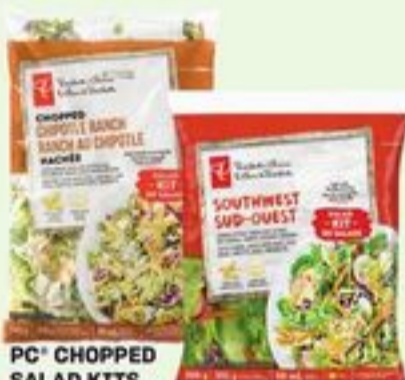
PC™ CHOPPED SALAD KITS PRODUCT OF U.S.A., SELECTED VARIETIES 285-369 G 21378071_EA/ 21378098_EA