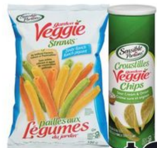
SENSIBLE PORTIONS VEGGIE STRAWS SELECTED VARIETIES 120-142 G 20377204001_EA/21380091_EA