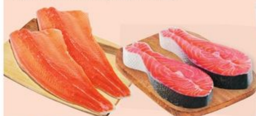
STEELHEAD TROUT FILLETS FROZEN OR PREVIOUSLY FROZEN 24.23/KG 21478771_KG

Fresh seafood items subject to availability.