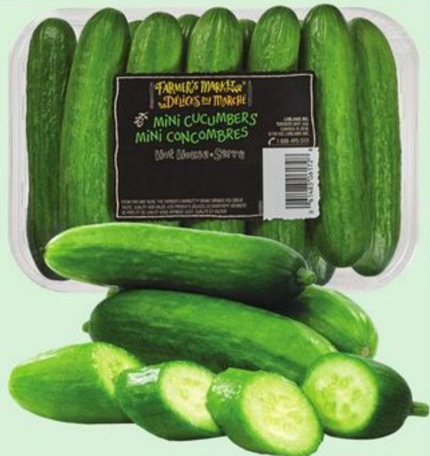
FARMER'S MARKET SM MINI CUCUMBERS PRODUCT OF ATLANTIC CANADA 11'S 21070679001_EA