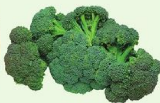
BROCCOLI CROWNS PRODUCT OF MEXICO OR U.S.A. EACH 21121560001_EA