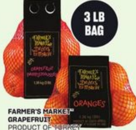
FARMER'S MARKET™ GRAPEFRUIT OR NAVEL ORANGES PRODUCT OF SPAIN, MOROCCO OR TURKEY 3 LB 20118409001_EA/ 20162945001_EA