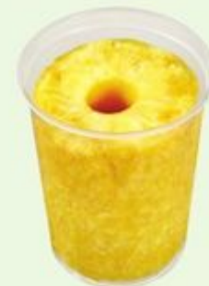
CORED PINEAPPLE MADE IN-STORE DAILY 600 G 20503143_EA