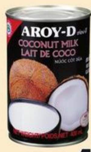
AROY-D COCONUT MILK SELECTED VARIETIES 400 ML 20063864_EA