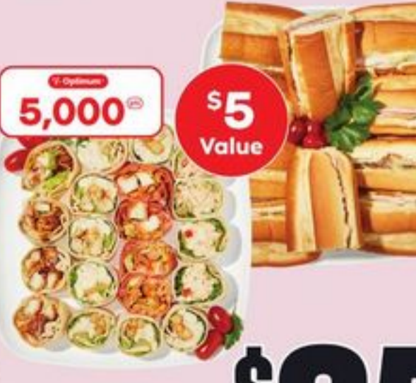
PIN WHEELS WRAP OR SMALL GAME NIGHT PLATTER EACH 21558135_EA/21557919_EA