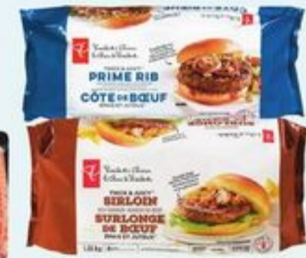
PC™ BURGERS SELECTED VARIETIES, FROZEN 568 G-1.36 KG 20941230_EA/ 20941443_EA