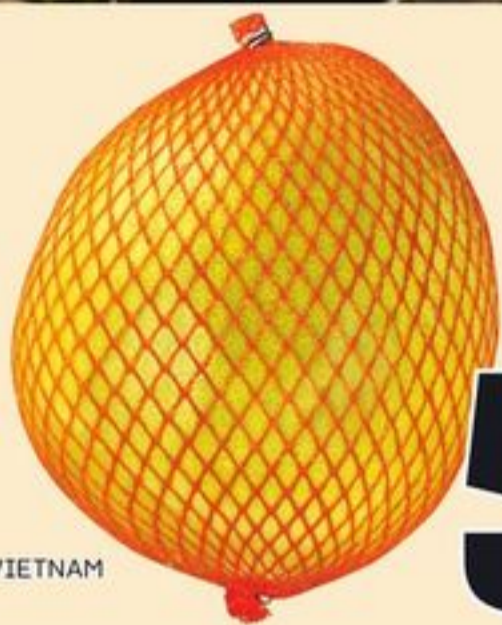
RED POMELO PRODUCT OF VIETNAM 20081390001_KG