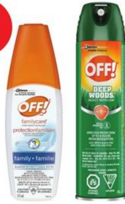
OFF! OR RAID INSECT REPELLENT SELECTED VARIETIES 20001279002_EA/20158572_EA