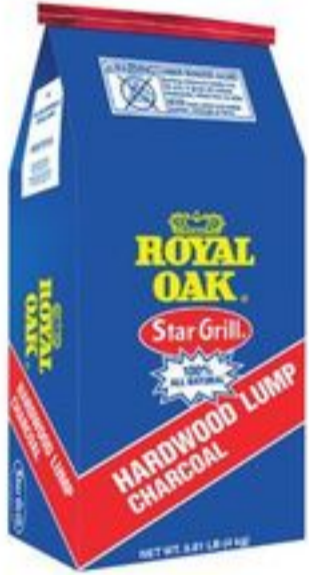
STAR GRILL LUMP CHARCOAL 8.8 LB 20773869_EA