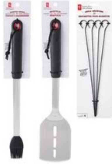
PC® BBQ ACCESSORIES, TOOLS, BBQ COVERS OR LIGHTERS SELECTED VARIETIES 21524461_EA/21524356_EA