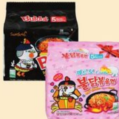
SAMYANG BULDAK RAMEN SELECTED VARIETIES 650-700 G 21345870_C05 21450283_EA