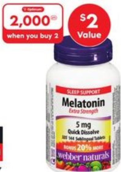
WEBBER NATURALS VITAMINS OR SUPPLEMENTS SELECTED VARIETIES AND SIZES EACH 20860422_EA