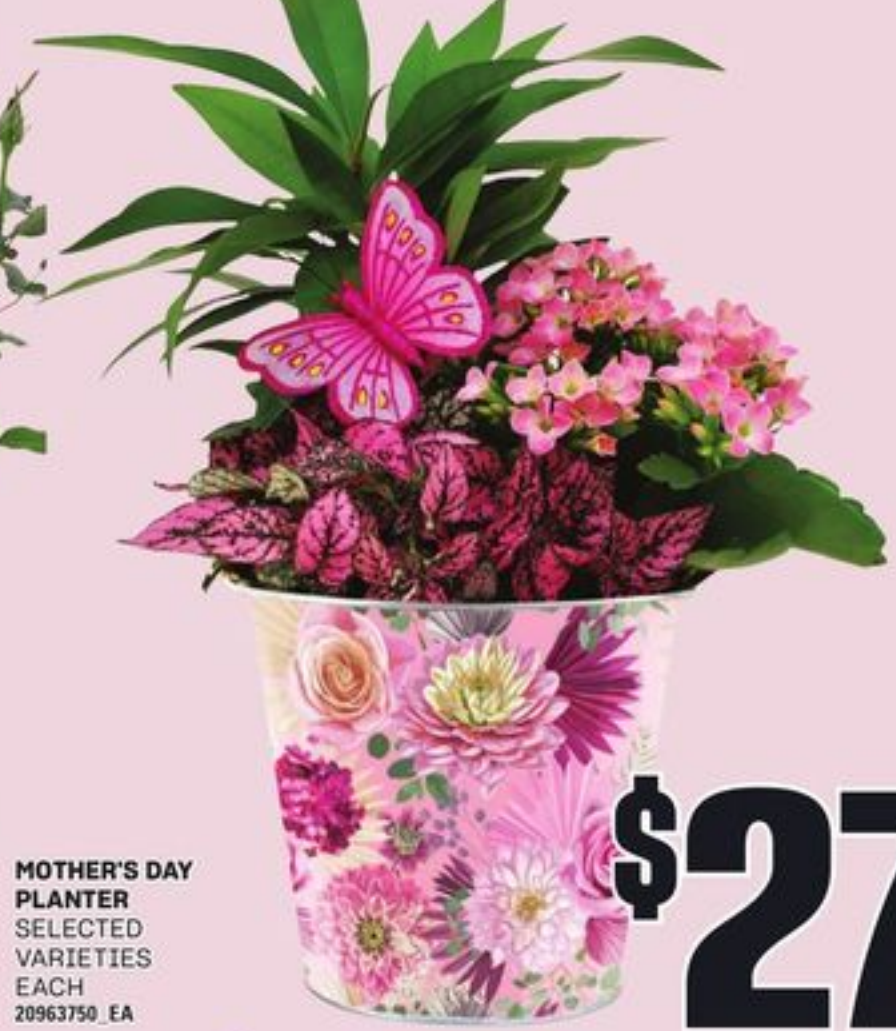
MOTHER'S DAY PLANTER SELECTED VARIETIES EACH 20963750_EA