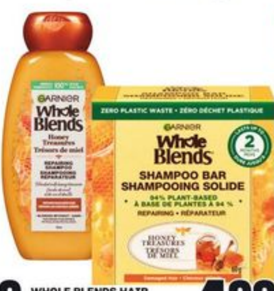
GARNIER WHOLE BLENDS HAIR CARE 370 ML OR SHAMPOO BARS 60 G SELECTED VARIETIES AND SIZES 20941723_EA/21424783_EA