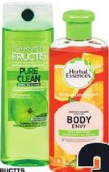
GARNIER FRUCTIS, HERBAL ESSENCES OR AUSSIE HAIR CARE SELECTED VARIETIES AND SIZES 21007198_EA/21247055_EA