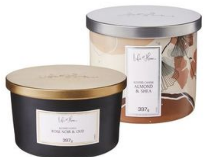
LIFE AT HOME™ 14 OZ 3 WICK CANDLE ASSORTED SCENTS $16 21413774_EA/21415353_EA