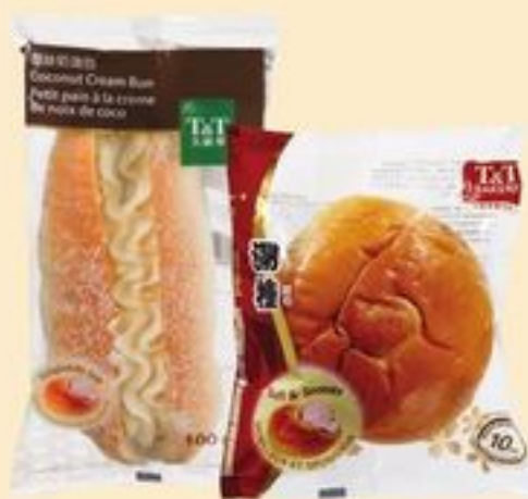
T&T® BAKERY BUNS SELECTED VARIETIES 90/100 G 20332833_EA 20334565_EA