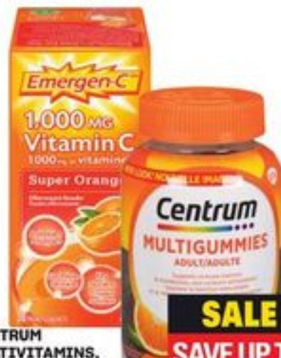
CENTRUM MULTIVITAMINS, EMERGEN-C OR CALTRATE SUPPLEMENTS SELECTED VARIETIES AND SIZES 20997357_EA 21283427_EA