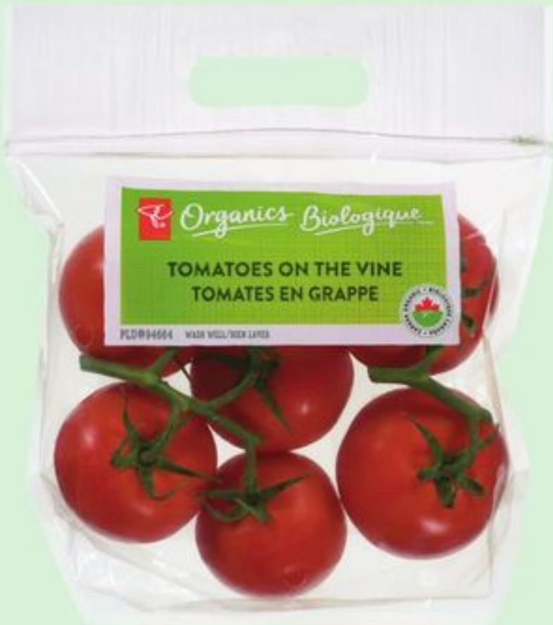
PC® ORGANICS TOMATOES ON THE VINE PRODUCT OF CANADA 9.90/KG 20127917001_KG