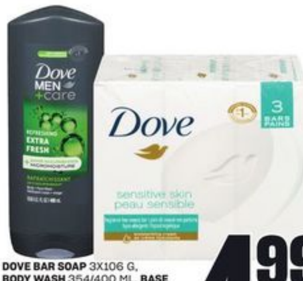
DOVE BAR SOAP 3X106 G, BODY WASH 354/400 ML, BASE DEODORANT/ANTIPERSPIRANT 45-85 G OR DEGREE MOTION SENSE ANTIPERSPIRANT 74 G SELECTED VARIETIES 20329036001_EA/21220515_EA