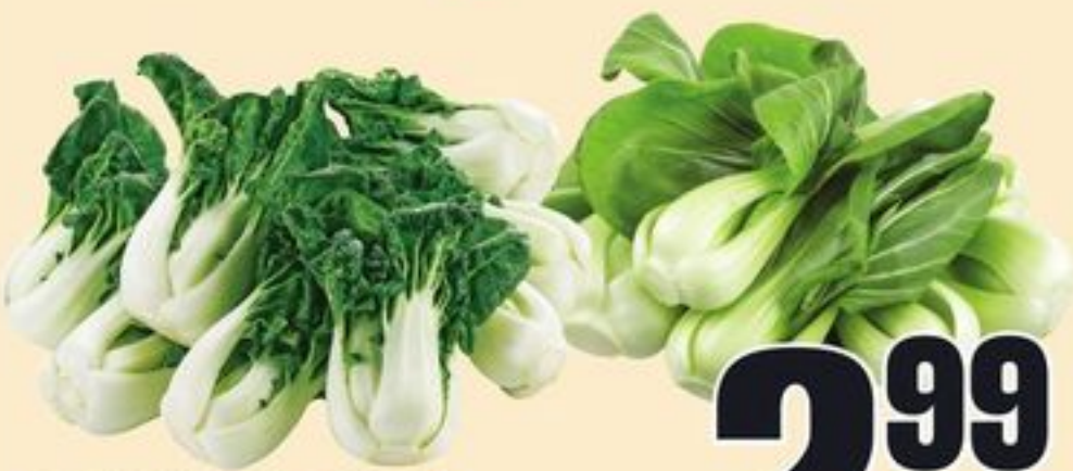
BABY OR SHANGHAI BOK CHOY PRODUCT OF MEXICO 6.59/KG 20082279001_KG/20032454001_KG