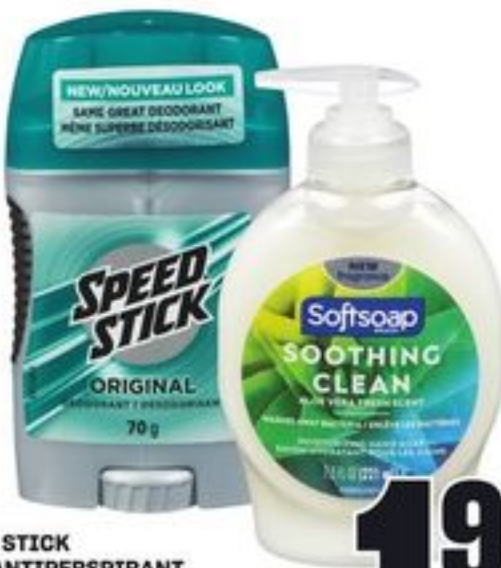
SPEED STICK BASE ANTIPERSPIRANT 45-70 G OR SOFTSOAP LIQUID HAND SOAP PUMP 221 ML SELECTED VARIETIES, EXCLUDES FOAMING 20145312002_EA/21073176_EA