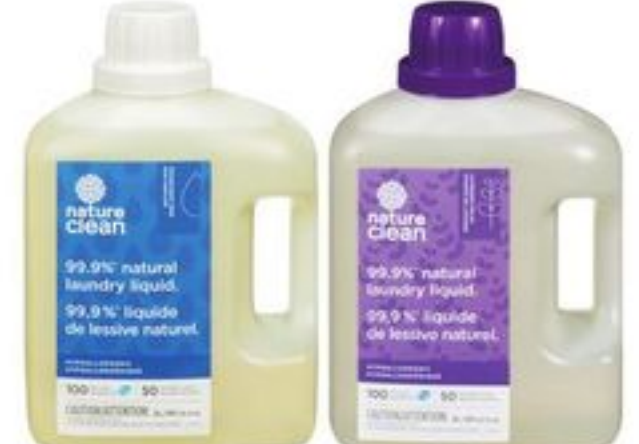
NATURE CLEAN LAUNDRY LIQUID 3 L, PLASTIC FREE LAUNDRY OR CLEANER STRIPS 32/36'S SELECTED VARIETIES 20067905_EA/20757371001_EA