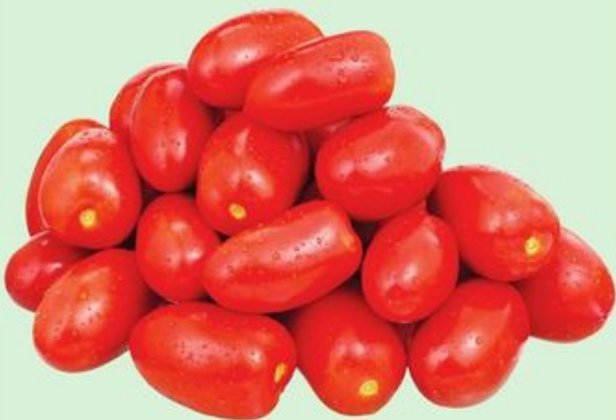
GREENHOUSE ROMA TOMATOES PRODUCT OF MEXICO 5.49/KG 20143381001_KG