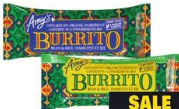
AMYS KITCHEN SELECTED VARIETIES AND SIZES 20042092002_EA/20371439001_EA