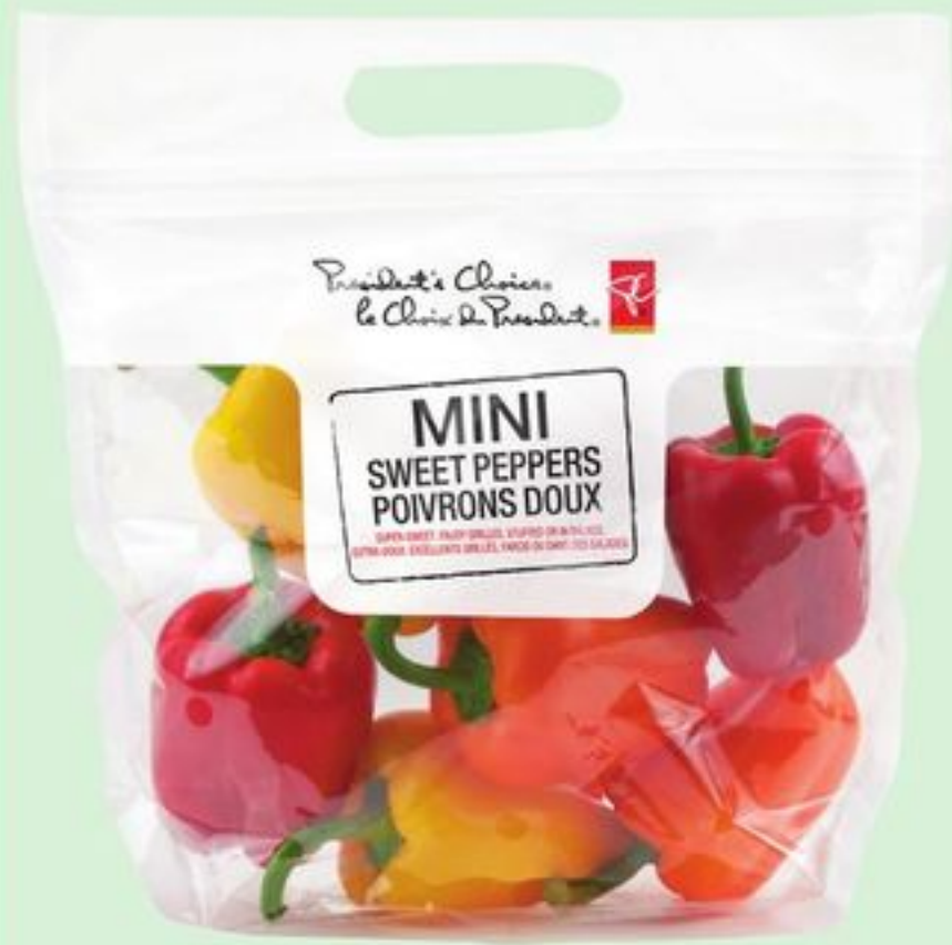
PC® MINI PEPPERS PRODUCT OF CANADA 454 G 20920821001_EA