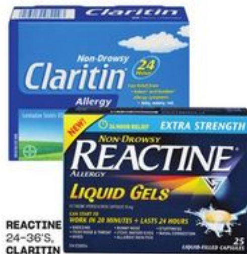
REACTINE 24-36'S, CLARITIN 15-30'S, OR BENADRYL 25 MG 100'S CAPLETS, TABLETS, OR GELS SELECTED VARIETIES 20308018001_EA 20550172_EA