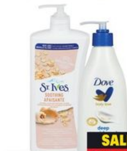
ST. IVES SKIN CLEANSERS AND MOISTURIZERS OR DOVE HAND AND BODY LOTION SELECTED VARIETIES AND SIZES 21006101_EA/21428038_EA