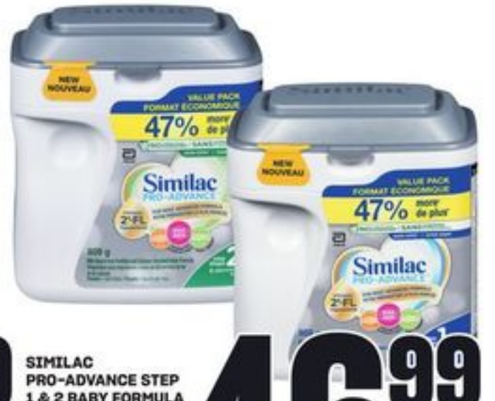
SIMILAC PRO-ADVANCE STEP 1 & 2 BABY FORMULA POWDER SELECTED VARIETIES 859 G 21436985_EA/21437126_EA