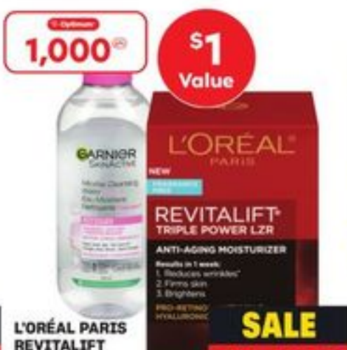
L'ORÉAL PARIS REVITALIFT RETINOL NIGHT SERUM OR GARNIER SKINACTIVE MICELLAR WATER SELECTED VARIETIES AND SIZES 21347222_EA 21040515_EA