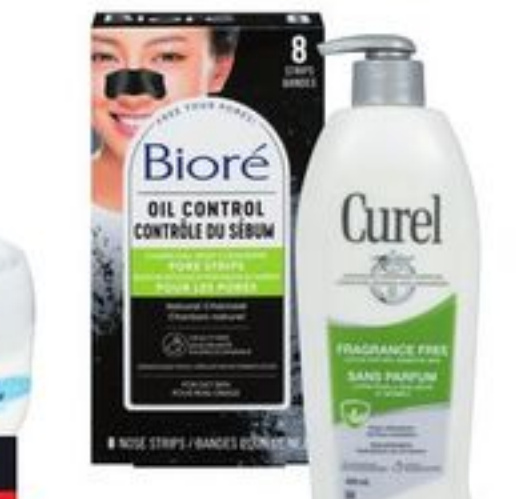
BIORÉ CHARCOAL PORE STRIPS 8'S OR CUREL FRAGRANCE FREE LOTION SELECTED VARIETIES AND SIZES 20213025001_EA/20853307_EA