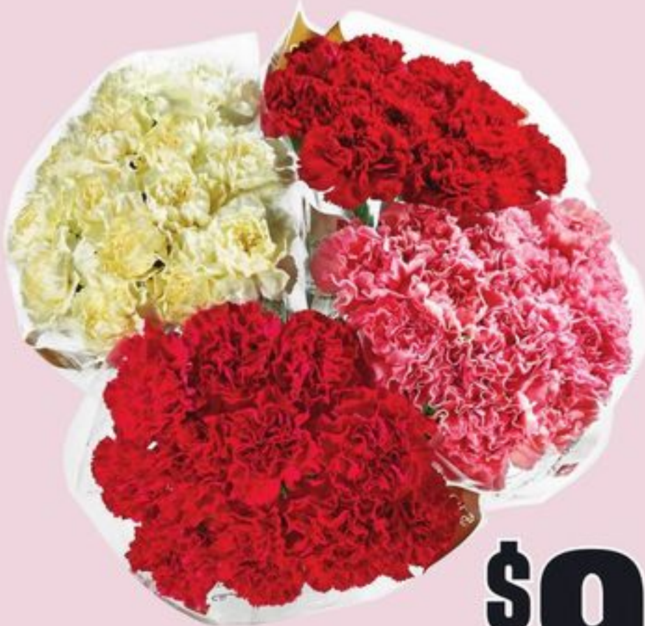
CARNATION BUNCH IN ASSORTED COLOURS 21087795_EA