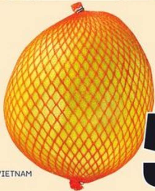
RED POMELO PRODUCT OF VIETNAM 20081390001_KG