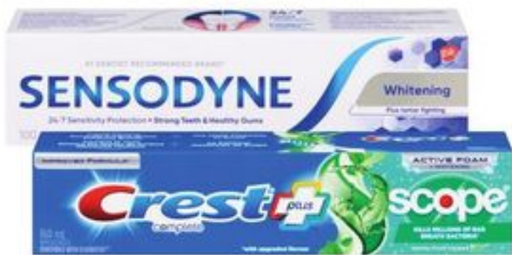
SENSODYNE OR PRONAMEL TOOTHPASTE 75-100 ML, POLIDOR OR POLIGRIP, CREST 3D WHITE OR PRO-HEALTH TOOTHPASTE, SCOPE PRO HEALTH OR KIDS RINSE 500 ML, ORAL-B MANUAL TOOTHBRUSH OR FLOSS SELECTED VARIETIES AND SIZES 20301179001_EA/21354700_EA