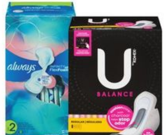
ALWAYS PADS 28-48'S, LINERS 96-162'S, TAMPAX PEARL 32-40'S, BASE TAMPONS 54'S, U BY KOTEX TAMPONS 31-34'S, PADS 26-34'S, OR LINERS 64-100'S SELECTED VARIETIES 20319562001_EA/21518239_EA