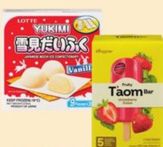
BINGGRAE T'AOM ICE BAR, 5'S OR LOTTE MOCHI 270 G SELECTED VARIETIES FROZEN 21247111_EA 21566306_EA