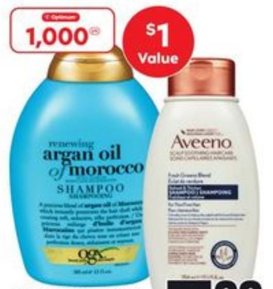
OGX, AVEENO OR MAUI HAIR CARE SELECTED VARIETIES AND SIZES 20340206004_EA 21165324_EA