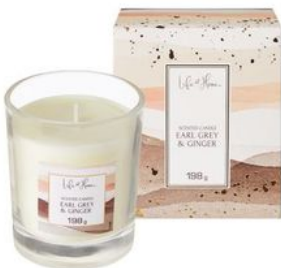
LIFE AT HOME™ 7 OZ SINGLE WICK CANDLE ASSORTED SCENTS $10 21414403_EA

Sophisticated and alluring, this textural scent boasts notes of suede, amber and rosewood wrapped in sensual vanilla and tonka.