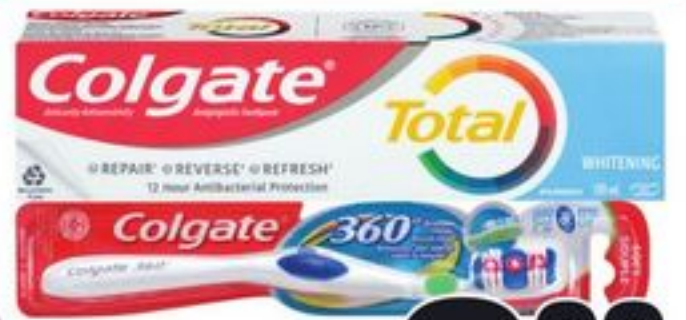
COLGATE PREMIUM ADULT OR KIDS TOOTHPASTE 70-150 ML, OR COLGATE MANUAL TOOTHBRUSH SELECTED VARIETIES 20306410001_EA/21166612_EA