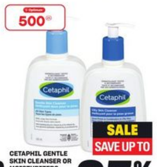
CETAPHIL GENTLE SKIN CLEANSER OR MOISTURIZERS SELECTED VARIETIES AND SIZES 20432313001_EA 20432313002_EA