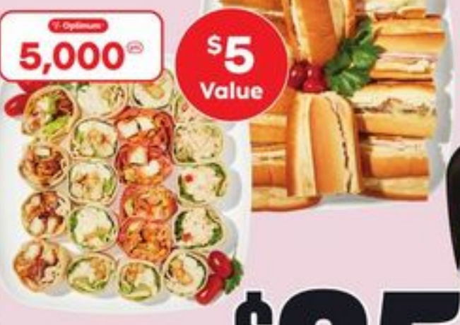
PIN WHEELS WRAP OR SMALL GAME NIGHT PLATTER EACH 21558135_EA/21557919_EA