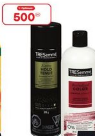
TRESEMME HAIR CARE OR STYLING SELECTED VARIETIES AND SIZES 20315303001_EA/21169718_EA