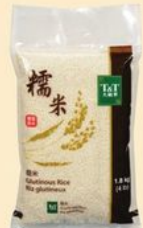
T&T® GLUTINOUS RICE 1.8 KG 20828956_EA