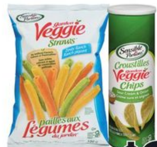
SENSIBLE PORTIONS VEGGIE STRAWS SELECTED VARIETIES 120-142 G 20377204001_EA/21380091_EA