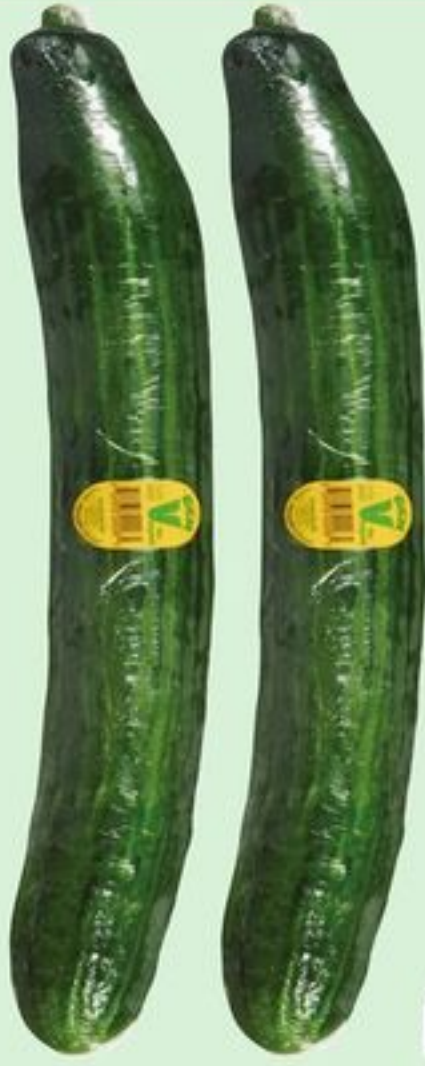
ORGANIC ENGLISH CUCUMBER PRODUCT OF ATLANTIC CANADA EACH 20080489001_EA