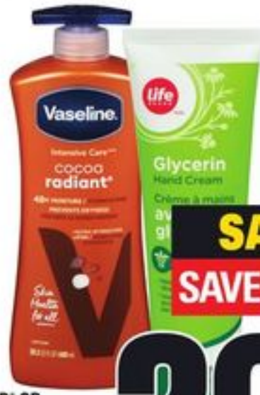
LIFE BRAND® OR VASELINE HAND OR BODY LOTION SELECTED VARIETIES AND SIZES 21085011_EA/21102172_EA