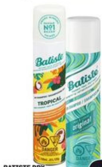
BATISTE DRY SHAMPOO SELECTED VARIETIES AND SIZES 200 ML 20848082_EA/20850398_EA