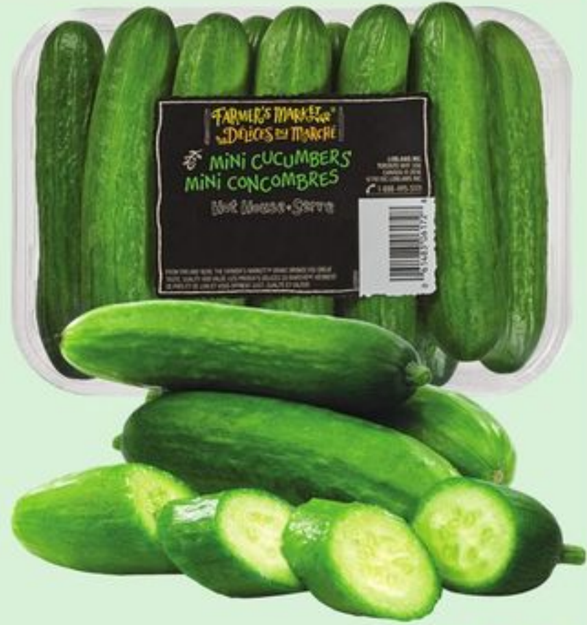
FARMER'S MARKET™ MINI CUCUMBERS PRODUCT OF ATLANTIC CANADA 11'S 21070679001_EA