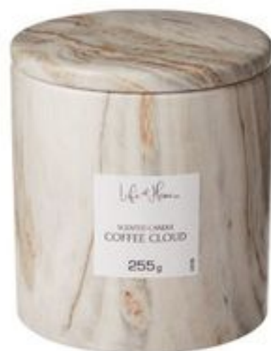
LIFE AT HOME™ 9 OZ SINGLE WICK CANDLE ASSORTED SCENTS $10 21414180_EA