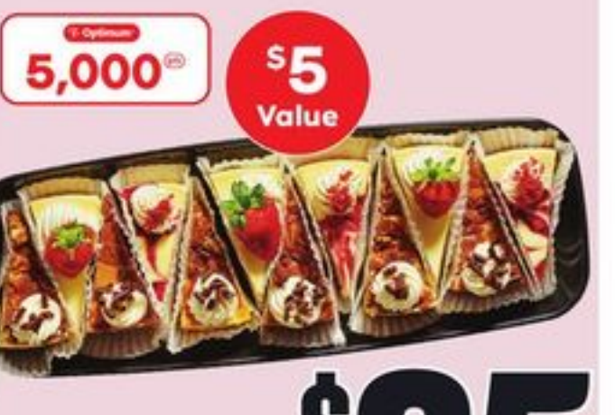
CHEESECAKE TRAY 108 G 2096282_EA