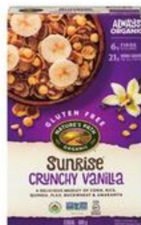
NATURES PATH SUNRISE CEREAL 300 G OR PC* ORGANICS GLUTEN-FREE ROLLED OATS 900 G SELECTED VARIETIES 20043938002_EA/21396198_EA