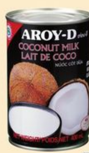
AROY-D COCONUT MILK SELECTED VARIETIES 400 ML 20063864_EA