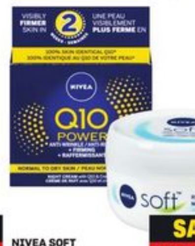
NIVEA SOFT MOISTURIZING, Q10 ADVANCED NIGHT CREAMS OR EUCERIN LOTIONS SELECTED VARIETIES AND SIZES 20253595001_EA 20700027_EA