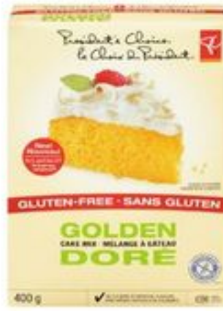
PC* ORGANICS GLUTEN-FREE CAKE MIX OR FLOUR SELECTED VARIETIES 400/800 G 20689979001_EA/20809079_EA