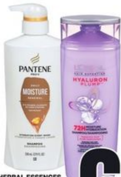
PANTENE, HERBAL ESSENCES, HERBAL BIO, HAIR EXPERTISE HAIR CARE OR OLD SPICE HAIR STYLERS SELECTED VARIETIES AND SIZES 21424214_EA/21428992_EA