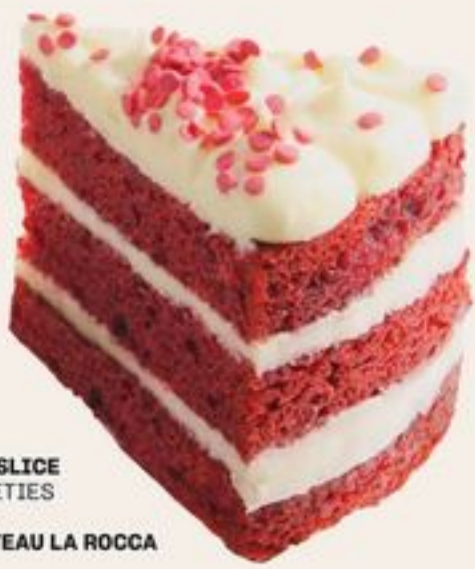
LA ROCCA CAKE SLICE SELECTED VARIETIES 137-187 G TRANCHE DE GÂTEAU LA ROCCA 21496255_EA