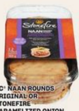
PC NAAN ROUNDS ORIGINAL OR STONEFIRE CAMELIZED ONION PAINS NAAN ROUNDS PC ORIGINAL OU OIGNONS CAMELISÉS STONEFIRE 20757871_EA/21594557_EA

BUY 2 OR MORE 3.50 EA. LESS THAN 2 $3.99 EA.