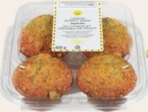
PREMIUM MUFFINS SELECTED VARIETIES 4'S MUFFINS DE QUALITÉ SUPÉRIEURE 21557676_EA

Optimum Members-Only Price 5.99 Non-members 6.99