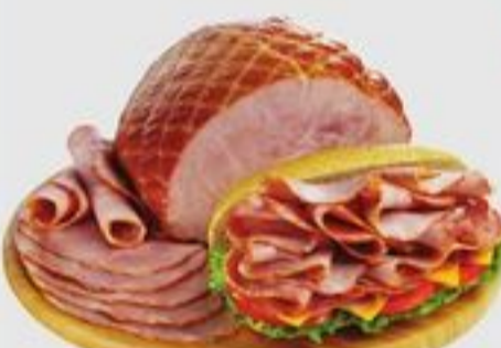
PC HAM SERVICE CASE SELECTED VARIETIES JAMBON PC DU COMPTOIR DE SERVICE 20301724_KG