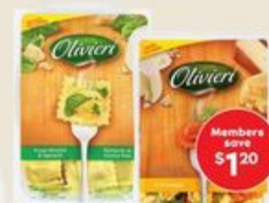
OLIVIERI FAMILY PACK PASTA SELECTED VARIETIES 540-700 G SAUCE EN EMBALLAGE FAMILIAL OLIVIERI 20312412_EA/20915348_EA

Members save $1.20 Optimum Members-Only Price 10.79 Non-members 11.99