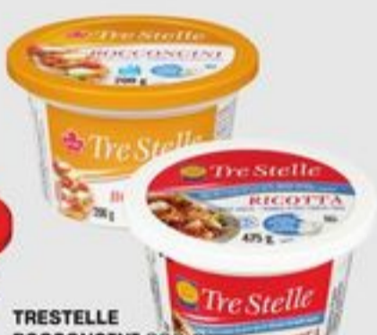
TRESTELLE BOCCONCINI 200 G OR RICOTTA 475 G SELECTED VARIETIES BOCCONCINI OU RICOTTA TRESTELLE 20318663_EA/20528878_EA