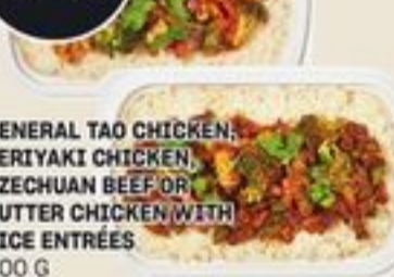
GENERAL TAO CHICKEN, TERIYAKI CHICKEN, SZECHUAN BEEF OR BUTTER CHICKEN WITH RICE ENTRÉES 900 G PLATS CUISINÉS DE POULET GÉNÉRAL TAO, POULET TERIYAKI, BŒUF À LA SICHUANAISE OU POULET AU BEURRE AVEC RIZ 21533950_EA/21533951_EA