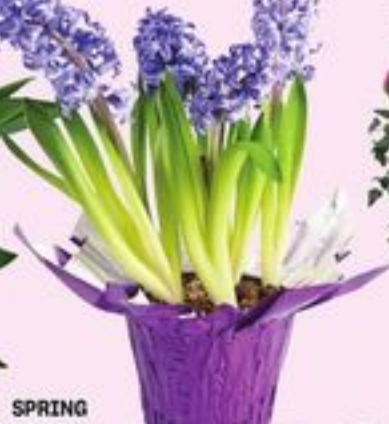
SPRING BULBS ASSORTED VARIETIES BULBES DU PRINTEMPS 20956925_EA