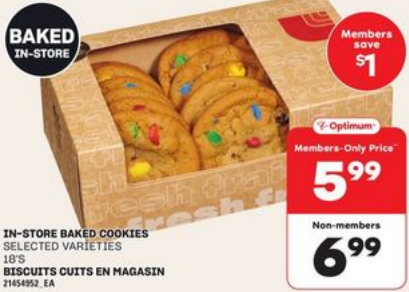
BAKED IN-STORE IN-STORE BAKED COOKIES SELECTED VARIETIES 18'S BISCUITS CUIITS EN MAGASIN 21454952_EA