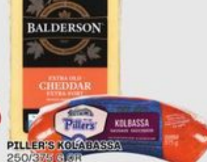
PILLER'S KOLBASSA 250/375 G OR BALDERSON CHEESE 250/280 G SELECTED VARIETIES 240-350 G KOLBASSA PILLER'S OU FROMAGE BALDERSON 20308469_EA/21495455_EA