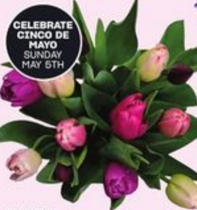
10 STEM RAINBOW TULIPS 10 TULIPES ARC-EN-CIEL SUR TIGE 21521853_EA