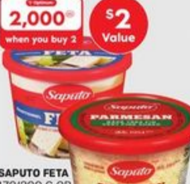
SAPUTO FETA 170/200 G OR SHREDDED CHEESE 140 G SELECTED VARIETIES FETA OU FROMAGE RÂPÉ SAPUTO 20573975_EA/21081222_EA

Members save $1.20 Optimum Members-Only Price 10.79 Non-members 11.99