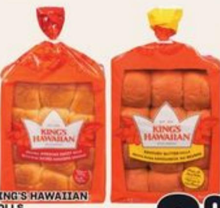
KING'S HAWAIIAN ROLLS SELECTED SIZES AND VARIETIES PETITS PAINS KING'S HAWAIIAN 21475970_EA/21489831_EA