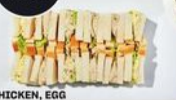
CHICKEN, EGG OR TUNA SOFTY SANDWICHES FAMILY SIZE 1.1 KG SANDWICHES MOELLEUX AU POULET, AUX ŒUFS OU AU THON 21502465_EA