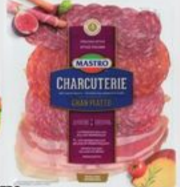
MASTRO TRIO PACKS SELECTED VARIETIES 150/250 G TRIOS MASTRO 21554465_EA