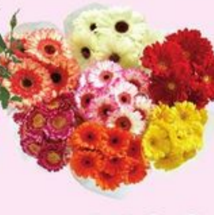
GERBERA DAISIES MARGUERITES GERBERA 21437443_EA