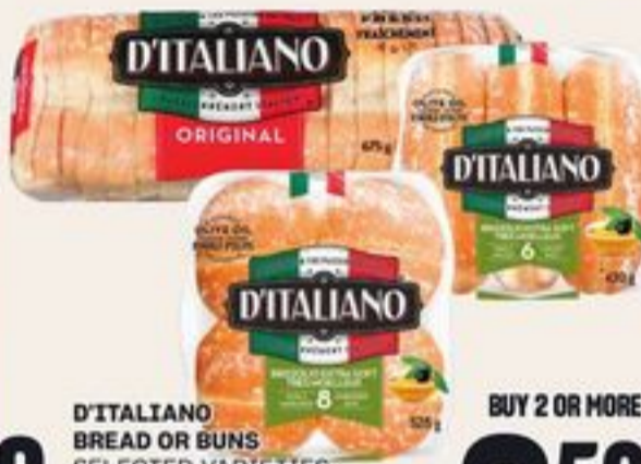
D'ITALIANO BREAD OR BUNS SELECTED VARIETIES AND SIZES PAIN OU PETITS PAINS D'ITALIANO 20038335_EA/20673208_EA/20627103_EA

BUY 2 OR MORE 3.50 EA. LESS THAN 2 $3.99 EA.