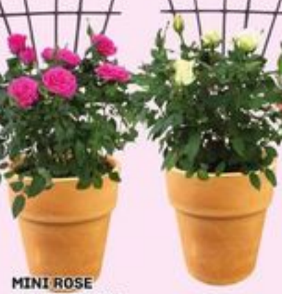
MINI ROSE WITH TRELLIS SELECTED VARIETIES MINI-ROSIER AVEC TRELLIS 21524787_EA