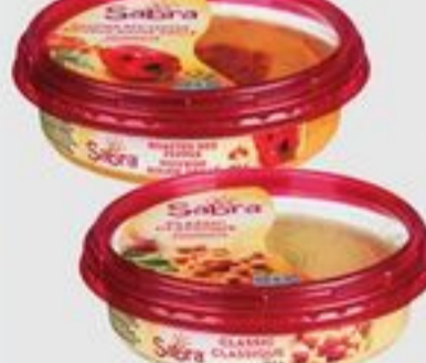
SABRA HUMMUS SELECTED VARIETIES 283 G HUMMUS SABRA 20005858_EA/20103117_EA