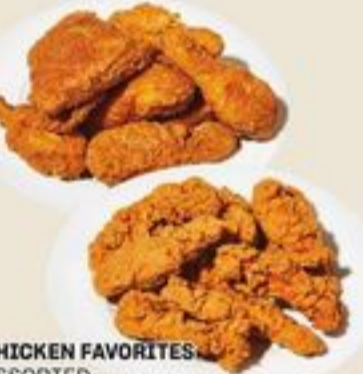
CHICKEN FAVORITES ASSORTED VARIETIES SERVED HOT OR CHILLED 320-700 G MORCEAUX PRÉFÉRÉS DE POULET 20131058_EA/20992187_EA