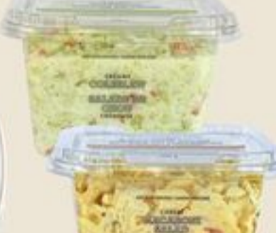
PREMIUM SALADS 850-908 G SALADES DE QUALITÉ SUPÉRIEURE 21544597_EA/21544612_EA