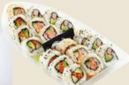
BENTO SUSHI MAKI BOAT 400 G BATEAU DE MAKI BENTO SUSHI 20171858_EA