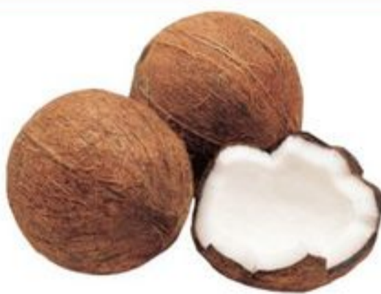
COCONUT PRODUCT OF INDIA 20005774001_EA