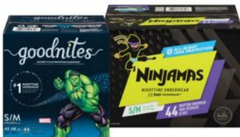
NINJAMAS OR GOODNITES NIGHTTIME UNDERWEAR SELECTED VARIETIES, 28-44'S