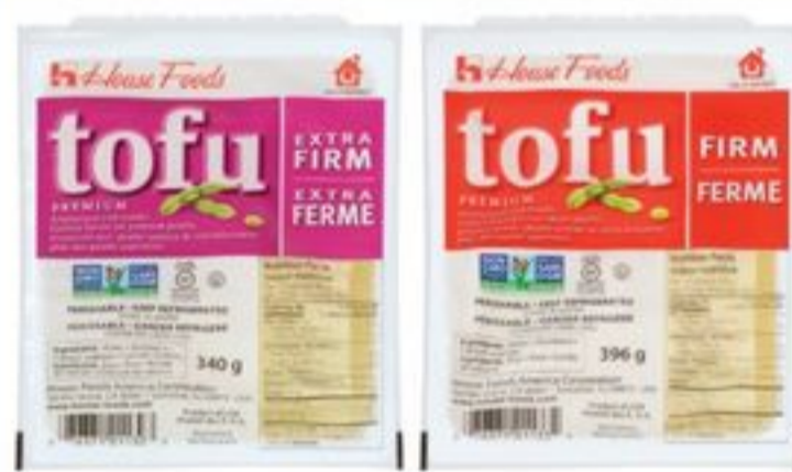
HOUSE FOODS TOFU SELECTED VARIETIES, 340/396 G 21315424_EA/21315429_EA