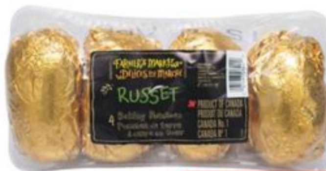
FARMER'S MARKET™ BAKING POTATOES