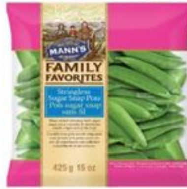
MANN'S SNAP PEAS PRODUCT OF U.S.A., 425 G 20645558_EA