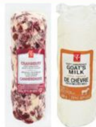
PC® GOAT CHEESE LOGS