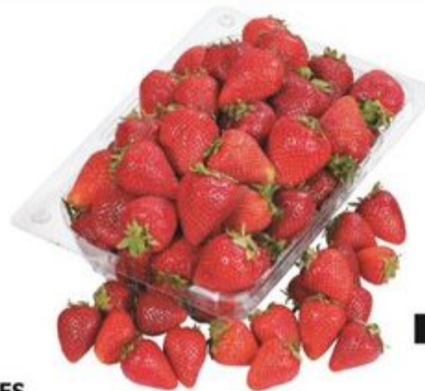
STRAWBERRIES PRODUCT OF U.S.A., 2 LB CLAMSHELL 20069661001_EA