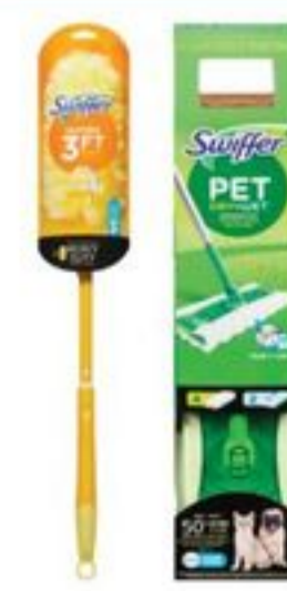
SWIFFER SWEEPER OR DUSTER STARTER KITS OR WET JET SWEEPER OR DUSTER REFILLS 16-48'S