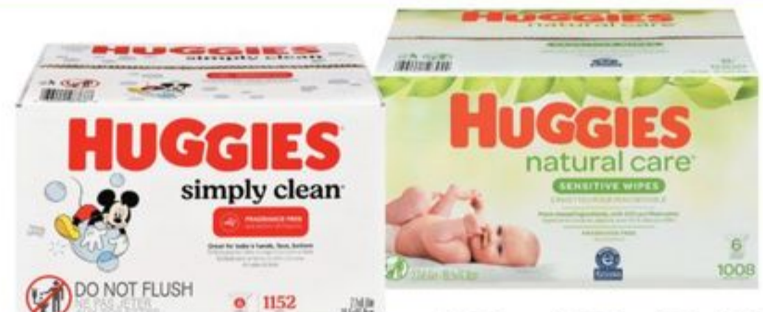
HUGGIES 16X BABY WIPES SELECTED VARIETIES 960-1152'S