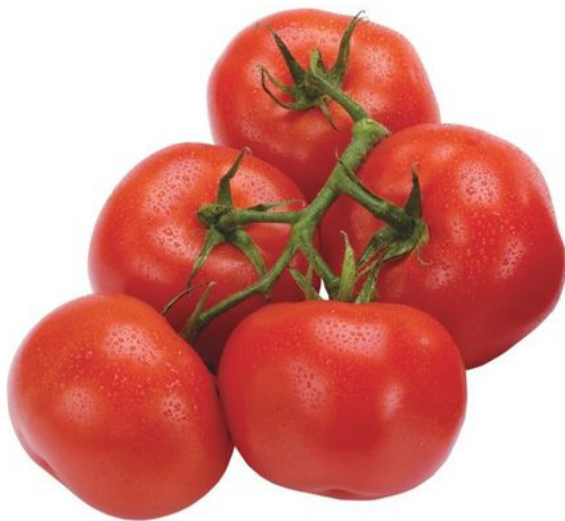
TOMATOES ON THE VINE PRODUCT OF ONTARIO 20026703001_KG