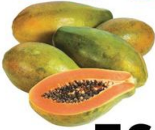
PAPAYA PRODUCT OF MEXICO 20817066001_KG