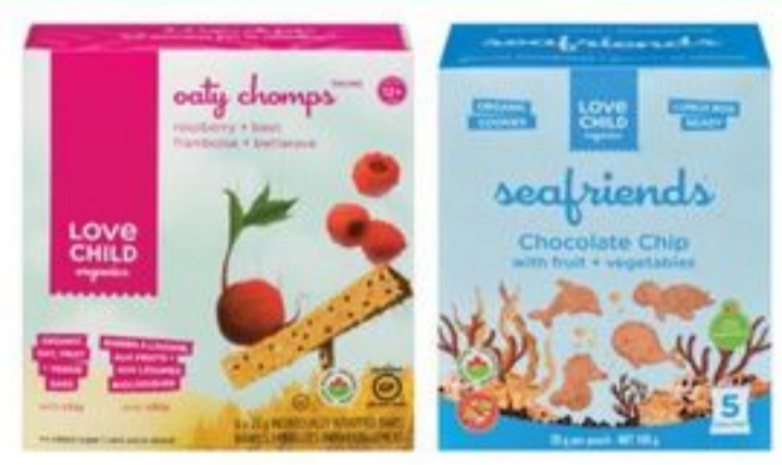
LOVE CHILD ORGANICS OATY CHOMPS OR SEAFRIENDS BABY SNACKS