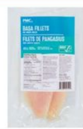
PMC BASA FILLETS, 400 G OR ANCHOR'S BAY MUSSEL MEAT 340 G OR BASA FILLETS 400 G FROZEN 20432307_EA