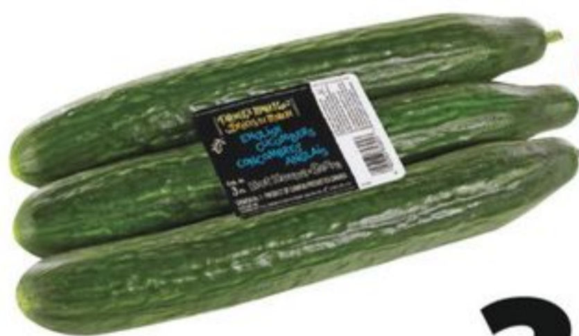
FARMER'S MARKET™ ENGLISH CUCUMBERS PRODUCT OF ONTARIO, 3'S 20828461001_EA