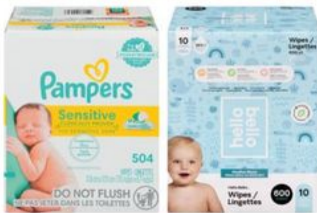
PAMPERS OR HELLO BELLO 9/10X BABY WIPES SELECTED VARIETIES, 336-600'S