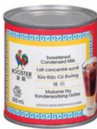
ROOSTER™ SWEET CONDENSED MILK 300 ML 20126907_EA