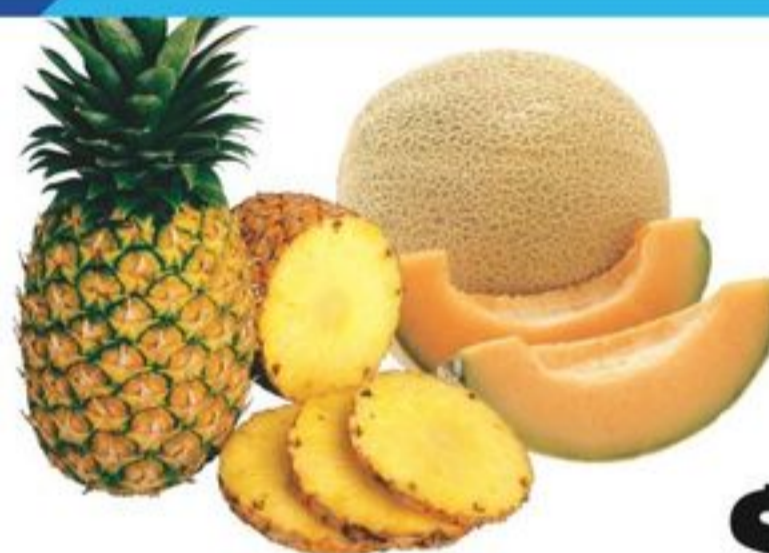
CANTALOUPE PRODUCT OF GUATEMALA OR PINEAPPLE PRODUCT OF COSTA RICA 20167017001_EA 20160992001_EA