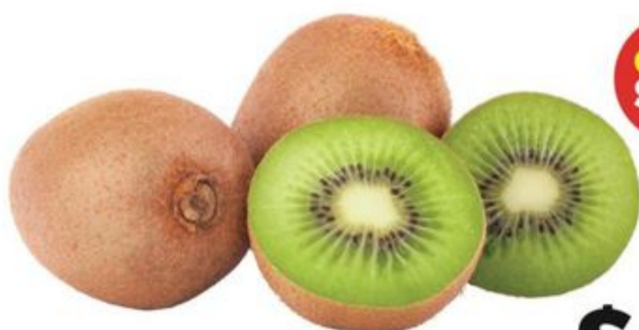
KIWI PRODUCT OF GREECE, 2 LB 2147438001_EA