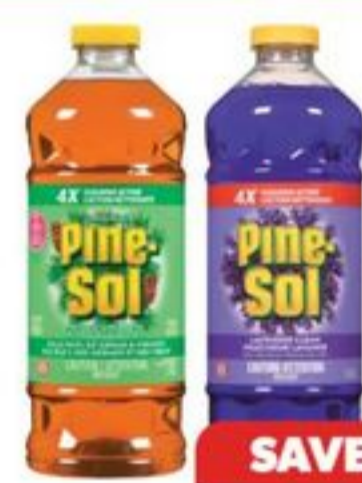
PINE-SOL CLEANER SELECTED VARIETIES, 1.41 L