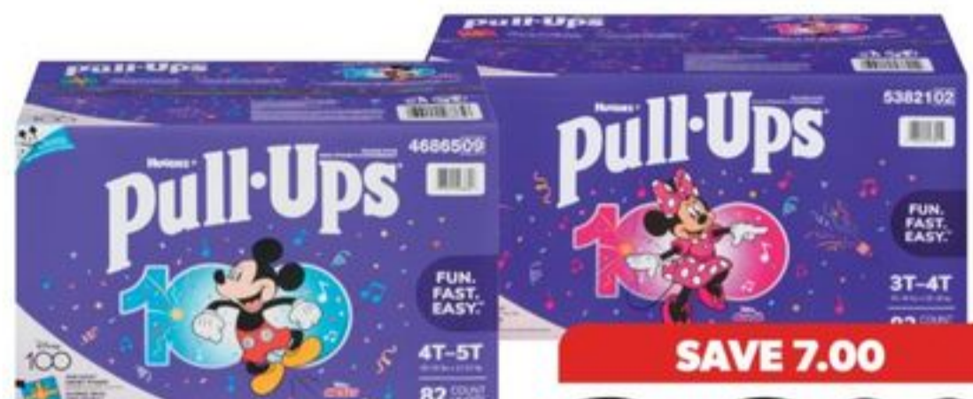
HUGGIES PULL-UPS ECONO PACK TRAINING PANTS SELECTED VARIETIES 66-104'S