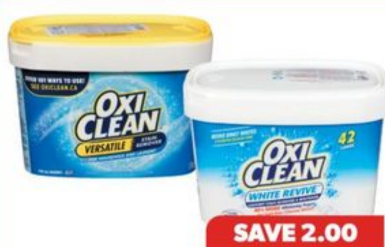
OXI CLEAN LAUNDRY STAIN REMOVER SELECTED VARIETIES, 1.28/1.36 KG