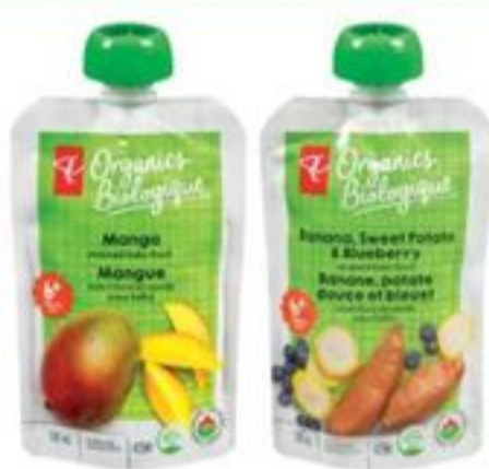
PC® ORGANICS BABY FOOD POUCHES SELECTED VARIETIES, 128 ML