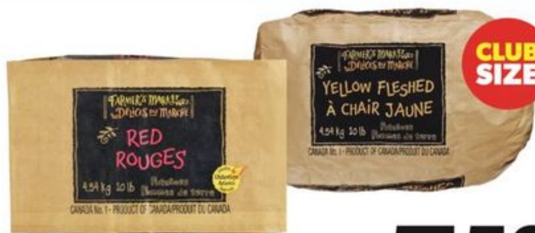
FARMERS MARKET™ RED OR YELLOW POTATOES PRODUCT OF CANADA, CANADA NO. 1 GRADE, 10 LB BAG 2060103001_EA 2060107001_EA