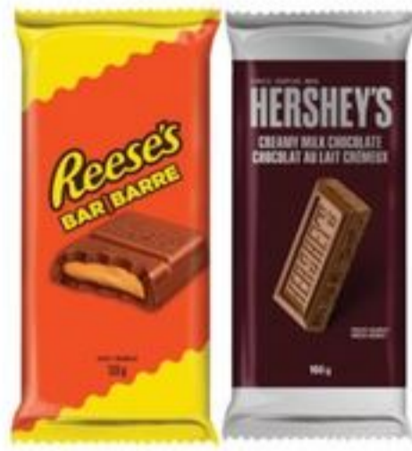
HERSHEY'S FAMILY SIZE CHOCOLATE BAR SELECTED VARIETIES, 90-120 G