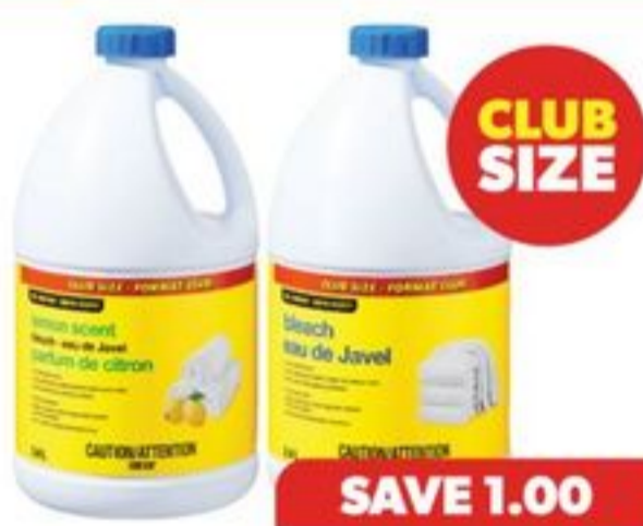
NO NAME® BLEACH SELECTED VARIETIES, 2.4 L