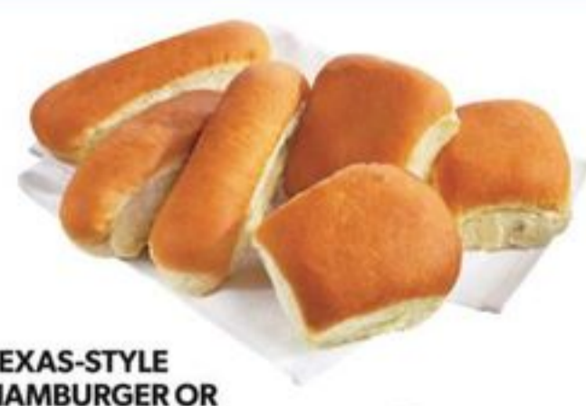
TEXAS-STYLE HAMBURGER OR HOT DOG BUNS 8'S OR BRIOCHE HAMBURGER BUNS 4'S