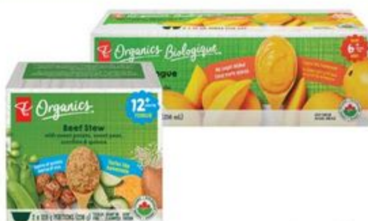
PC® ORGANICS FROZEN BABY FOOD SELECTED VARIETIES