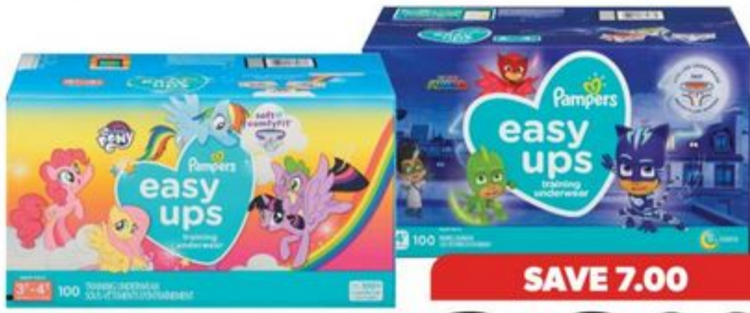
PAMPERS EASY UPS GIANT PACK TRAINING PANTS SELECTED VARIETIES 68-112'S