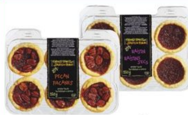
FARMER'S MARKET™ HOMESTYLE TARTS