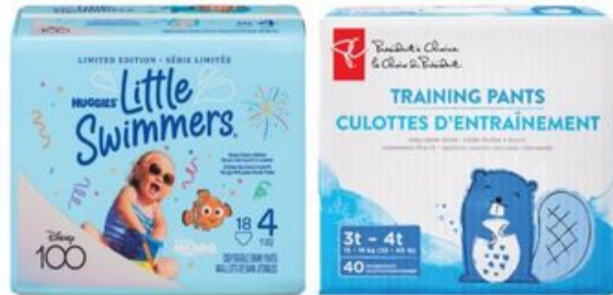
PC® TRAINING PANTS 20-44'S OR HUGGIES LITTLE SWIMMERS SWIM DIAPERS 17-20'S SELECTED VARIETIES