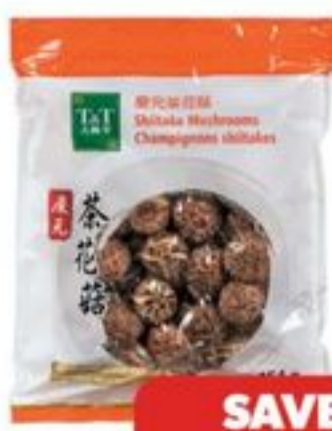
T&T® DRIED SHIITAKE MUSHROOMS 454 G 21426418_EA