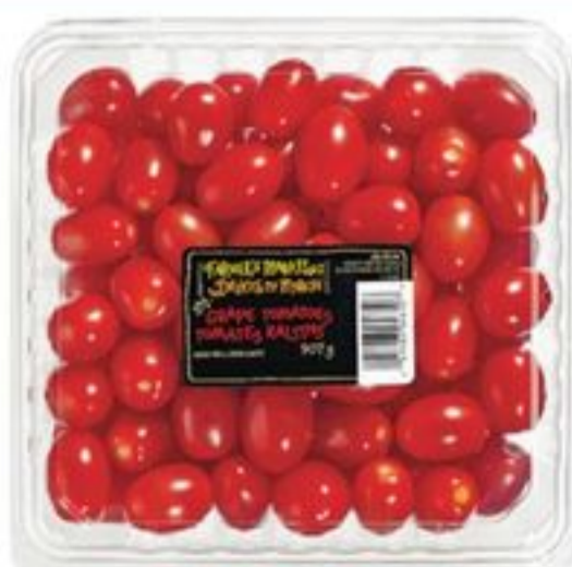
FARMER'S MARKET™ GRAPE TOMATOES PRODUCT OF MEXICO, 907 G 20840038001_EA