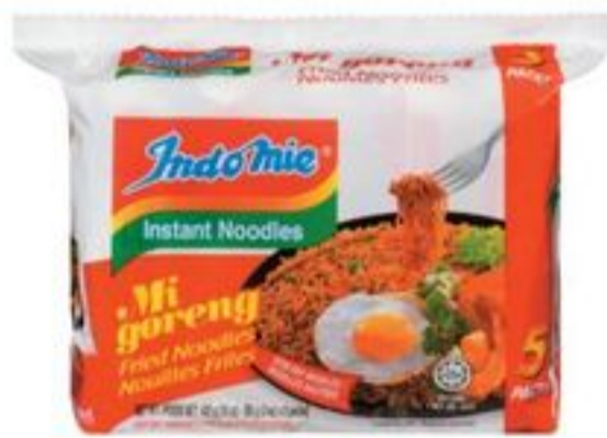
INDOMIE NOODLES SELECTED VARIETIES, 400/425 G 20686779_EA