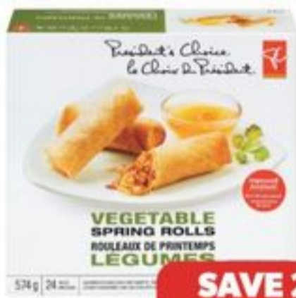
PC® SPRING ROLLS