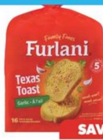
FURLANI TEXAS TOAST