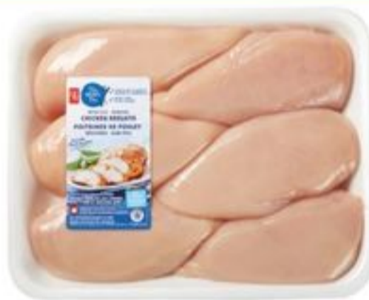
PC® BONELESS SKINLESS CHICKEN BREAST