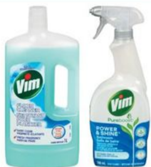
VIM CLEANING SPRAY 700 ML OR FLOOR CLEANER 1 L