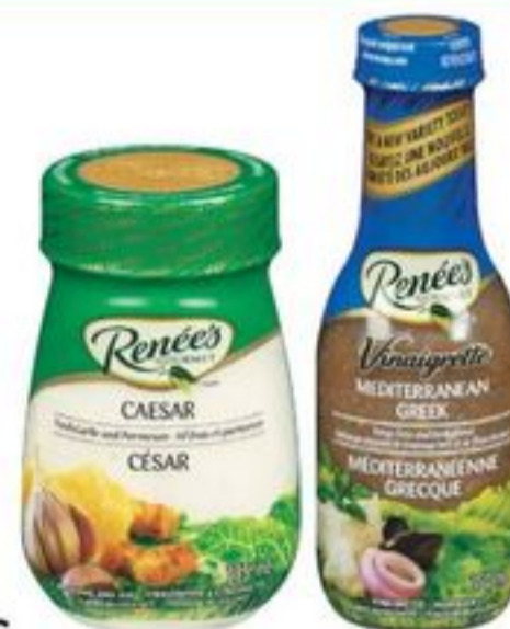
RENÉE'S DRESSING SELECTED VARIETIES, PRODUCT OF CANADA, 350 ML 20314592_EA 20312720_EA