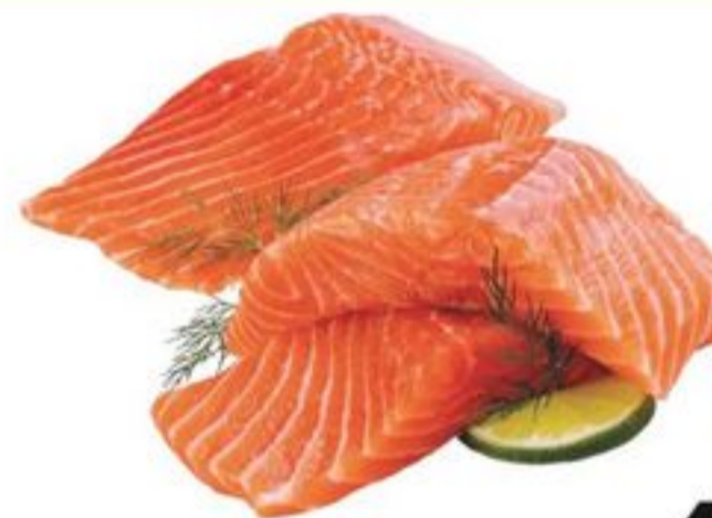
FRESH ATLANTIC SALMON PORTIONS