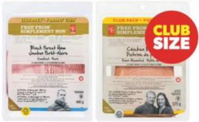
PC® FREE FROM® SLICED DELI MEAT