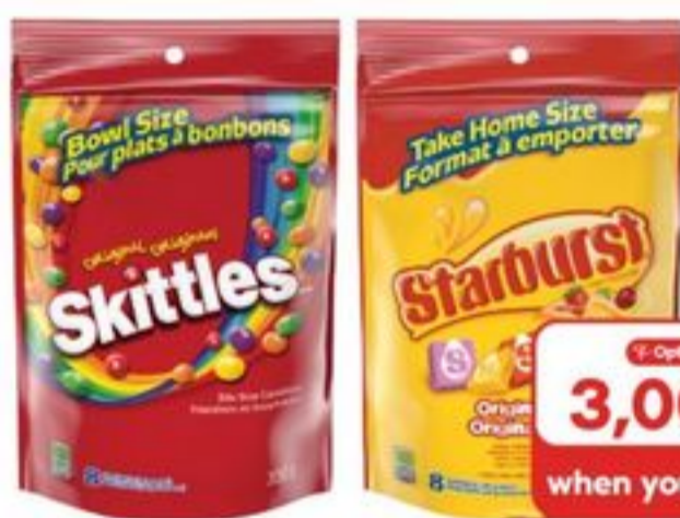
SKITTLES OR STARBURST CANDY BAGS SELECTED VARIETIES, 280/320 G