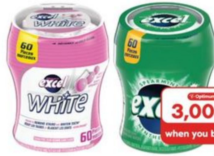
EXCEL GUM BOTTLE SELECTED VARIETIES, 40/60'S