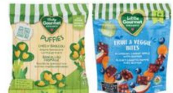
BABY GOURMET ORGANIC PUFFIES, MUSHIES OR FRUIT & VEGGIE BITES BABY SNACKS 23-60 G OR BABY GOURMET OR EARTH'S BEST BARS 90/133 G SELECTED VARIETIES