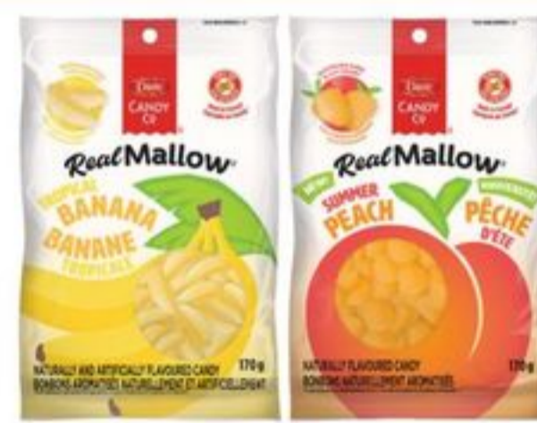
DARE REAL MALLOW CANDY SELECTED VARIETIES, 170 G