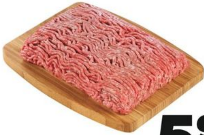
LEAN GROUND BEEF AND PORK FRESH