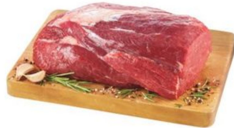
BEEF TENDERLOIN BUTT PORTION ROAST OR STEAKS CUT FROM UNGRADED BEEF