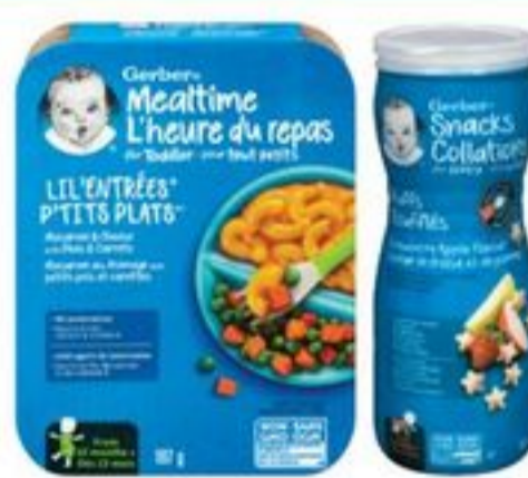
GERBER BABY SNACKS