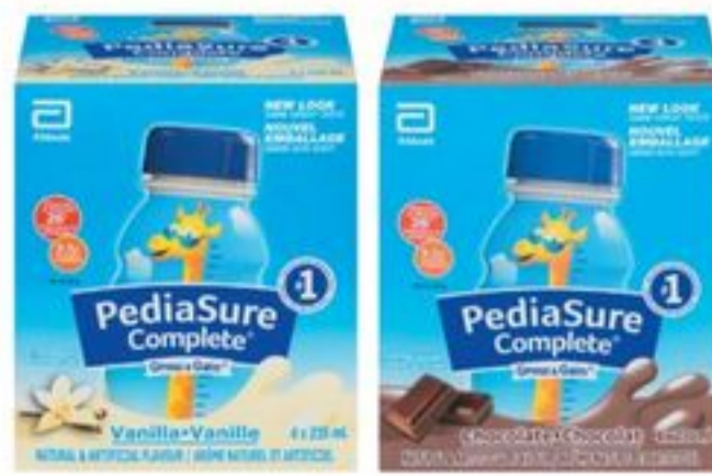
PEDIASURE COMPLETE NUTRITIONAL SUPPLEMENT