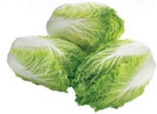
NAPA PRODUCT OF MEXICO 20015029001_KG