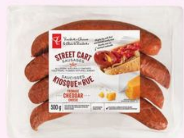
PC® STREET CART SAUSAGE CHEDDAR OR ORIGINAL 500 G 21525048_EA/21525049_EA