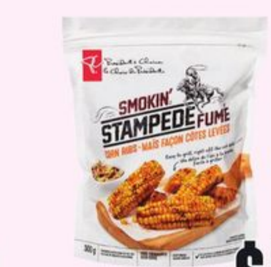
PC® SMOKIN' STAMPEDE FUMÉ CORN RIBS FROZEN 500 G 21520140_EA