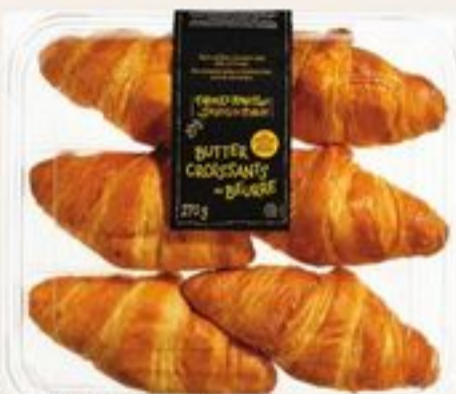
FARMER'S MARKET™ BUTTER CROISSANTS SELECTED VARIETIES 6'S CROISSANTS AU BEURRE DÉLICÉS DU MARCHÉ™ 20975943_EA