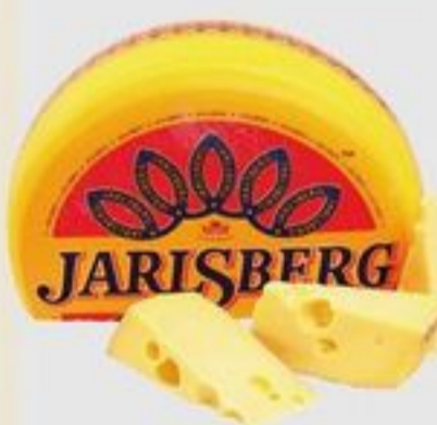
NORWEGIAN JARLSBERG CHEESE FROMAGE JARLSBERG NORVÉGIEN 21388103_KG