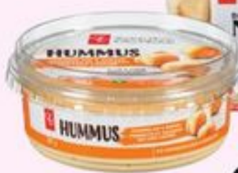
PC® DIPS OR HUMMUS 190-227 G OR PC® NAAN DIPPERS 200 G SELECTED VARIETIES 20584097_EA 21092033_EA