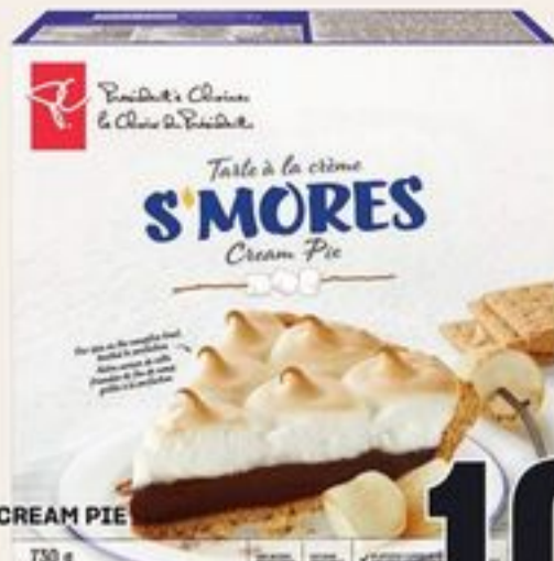
PC® S'MORES CREAM PIE FROZEN 730 G TARTE À LA CRÈME S'MORES PC™ 21574358_EA