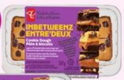
PC® INBETWEENZ™ DESSERT SQUARE SELECTED VARIETIES 312 G 21592641_EA