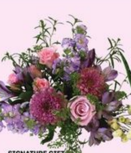
SIGNATURE GIFT BOUQUETS SELECTED VARIETIES BOUQUETS-CADEAUX SIGNATURE 21436377_EA/21436378_EA