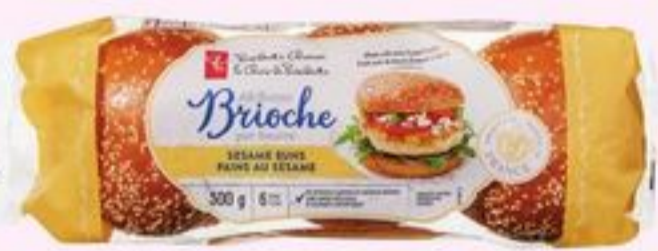
PC® BRIOCHE SESAME BUNS 300 G 21576538_EA