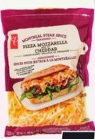
PC® MONTREAL STEAK SPICE SEASONED PIZZA MOZZARELLA AND CHEDDAR CHEESE BLEND 320 G 21575868_EA