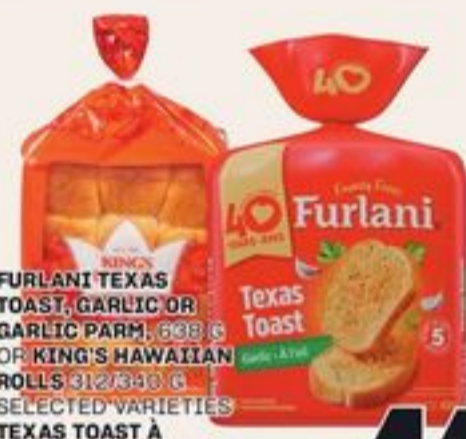
FURLANI TEXAS TOAST, GARLIC OR GARLIC PARM. 698 G OR KING'S HAWAIIAN ROLLS 312/340 G SELECTED VARIETIES TEXAS TOAST À L'AIL OU AIL ET PARMESAN FURLANI OU PETITS PAINS KING'S HAWAIIAN 20041579_EA/21475970_EA