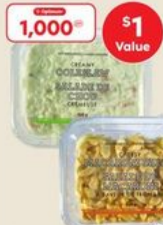
PREMIUM SALADS 425-454 G SALADES DE QUALITÉ SUPÉRIEURE 21544608_EA/21544611_EA