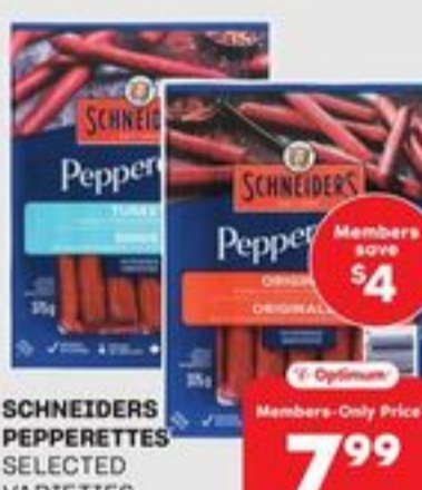
SCHNEIDERS PEPPERETTES SELECTED VARIETIES 250-375 G PEPPERETTES SCHNEIDERS 20976093_EA/20976110_EA