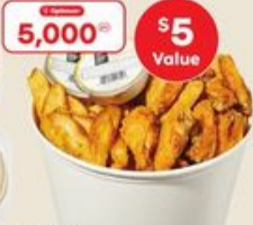
CHICKEN WINGS AND WEDGES BUCKET 1.2-2.12 KG SEAU DE 36 AILES DE POULET ET FRITES EN QUARTIERS 21541872_EA/21541877_EA