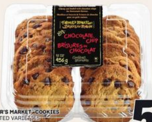
FARMER'S MARKET™ COOKIES SELECTED VARIETIES 12'S BISCUITS DÉLICÉS DU MARCHÉ™ 20566774_EA