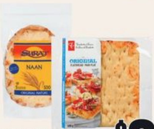
PC® FLATBREAD 220/300 G OR SURAJ® NAAN 5'S SELECTED VARIETIES PAIN PLAT PC™ OU NAAN SURAJ® 20910042_EA/21051353_EA