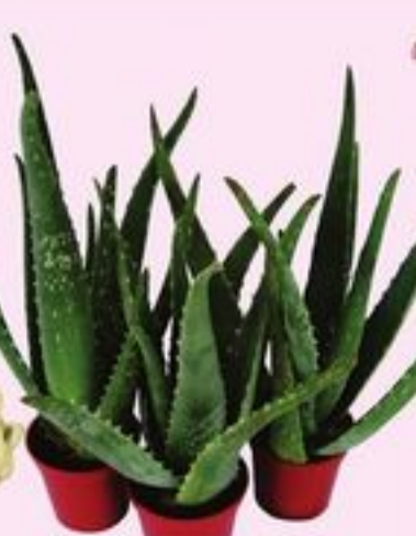
ALOE VERA 4 INCH POT ALOËS 21047366_EA