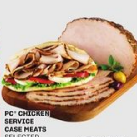
PC® CHICKEN SERVICE CASE MEATS SELECTED VARIETIES POULET PC™ POUR LE COMPTOIR DE SERVICE 20301114_KG