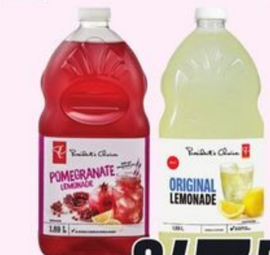
PC® LEMONADE SELECTED VARIETIES 1.89 L 20772870001_EA 21425929_EA