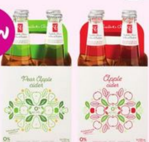
PC® SPARKLING DEALCOHOLIZED APPLE OR PEAR CIDER BEVERAGE SELECTED VARIETIES 4X330 ML 21588266_C04 21588277_C04