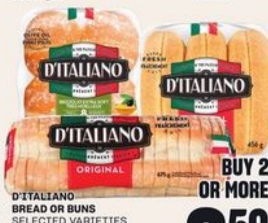
D'ITALIANO BREAD OR BUNS SELECTED VARIETIES AND SIZES PAIN OU PETITS PAINS D'ITALIANO 20038335_EA/20627101_EA/20587369_EA

BUY 2 OR MORE 3 50 LESS THAN 2 $3.99 EA.