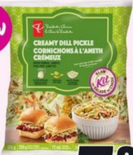
PC® CREAMY DILL PICKLE SLAW KIT 301 G 21588279_EA