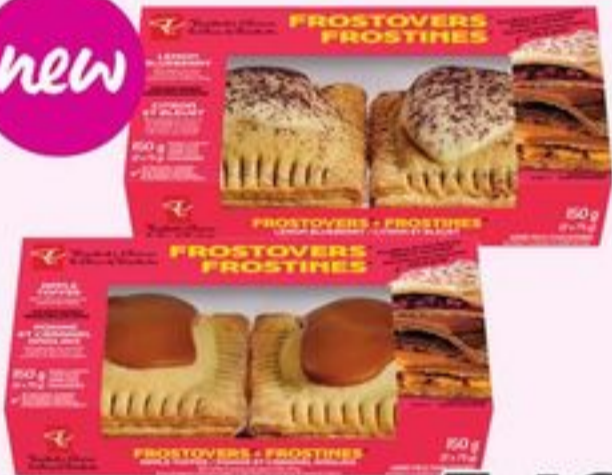
PC® FROSTOVERS™ HAND PIE SELECTED VARIETIES 150 G 21588644_EA