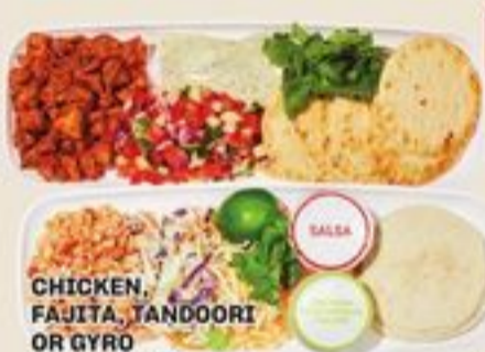
CHICKEN, FAJITA, TANDOORI OR GYRO TACO TRAYS SELECTED VARIETIES 1-1.1 KG PLATEAUX DE TACOS AU POULET, FAJITA, TANDOORI OU GYRO 21395977_EA/21595419_EA

Great to go items plus applicable taxes.