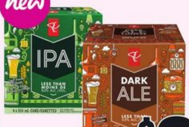
PC® DARK ALE OR IPA LOW ALCOHOL BEER (LESS THAN 0.5% ALC./VOL.) 4X355 ML 21588335_C04 21589408_C04