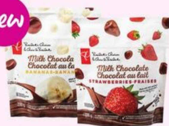
PC® MILK CHOCOLATE COVERED STRAWBERRIES OR BANANAS SELECTED VARIETIES FROZEN 200 G 21544053_EA 21520140_EA