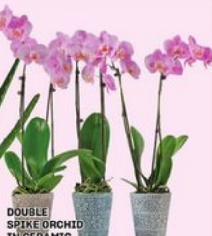
DOUBLE SPIKE ORCHID IN CERAMIC SELECTED VARIETIES ORCHIDÉE À DEUX TIGES DANS UN POT EN CÉRAMIQUE 20293541_EA