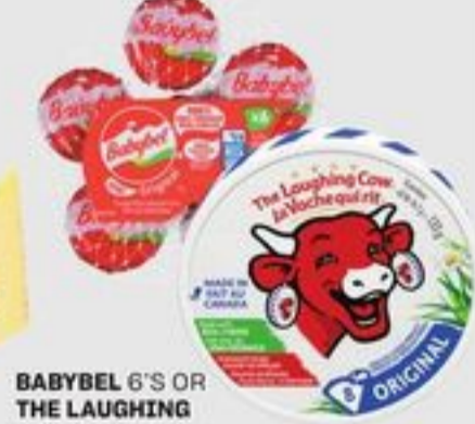
BABYBEL 6'S OR THE LAUGHING COW 8'S SELECTED VARIETIES BABYBEL OU LA VACHE QUI RIT 20319107_EA/20574332_EA