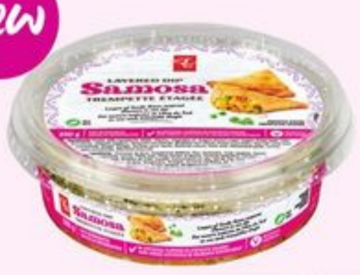
PC® SAMOSA LAYERED DIP 350 G 21588729_EA