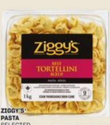
ZIGGY'S PASTA SELECTED VARIETIES 1 KG PÂTES ZIGGY'S® 21521156_EA