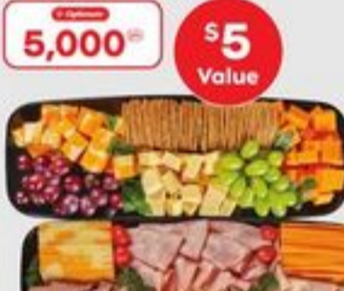
PARTY PLATTERS SELECTED VARIETIES 696 G/1.8 KG PLATEAUX DE CÉLÉBRATION 21217521_EA/21217522_EA