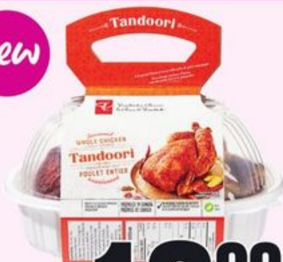
PC® TANDORI SEASONED FULLY COOKED WHOLE CHICKEN 900 G 21587735_EA