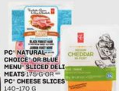
PC® NATURAL CHOICE™ OR BLUE MENU™ SLICED DELI MEATS 175 G OR PC® CHEESE SLICES 140-170 G SELECTED VARIETIES CHARCUTERIES TRANCHÉES PC™ LE CHOIX NATUREL™ OU MENU BLEU™ OU TRANCHES DE FROMAGE PC™ 20216643_EA/20310580_EA