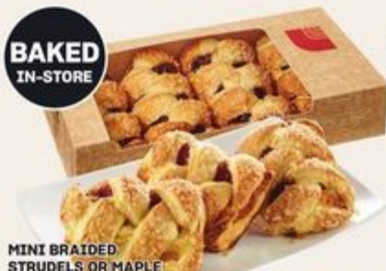
BAKED IN-STORE MINI BRAIDED STRUDELS OR MAPLE PECAN DANISH SELECTED VARIETIES 4'S MINI-CHAUSSON TRESSÉ OU DANOISÉ ÉRABLE ET PACANAS 21464142_EA/21464199_EA