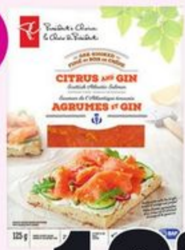
PC® OAK-SMOKED CITRUS AND GIN SCOTTISH ATLANTIC SALMON 125 G 21576457_EA