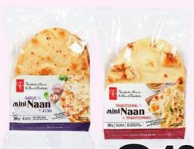
PC® MINI NAAN TRADITIONNAL OR GARLIC SELECTED VARIETIES 4'S 21076210_EA 21076234_EA