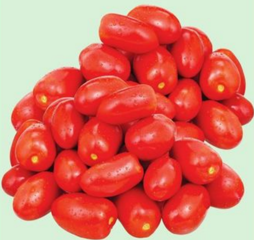
GREENHOUSE ROMA TOMATOES PRODUCT OF MEXICO 5.49/KG 20143381001_KG