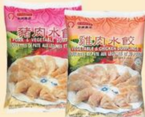
O'TASTY DUMPLINGS SELECTED VARIETIES, FROZEN 567 G 20319243001_EA/20319243004_EA