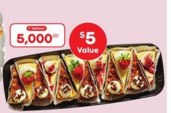
CHEESECAKE TRAY 108 G 2096282_EA