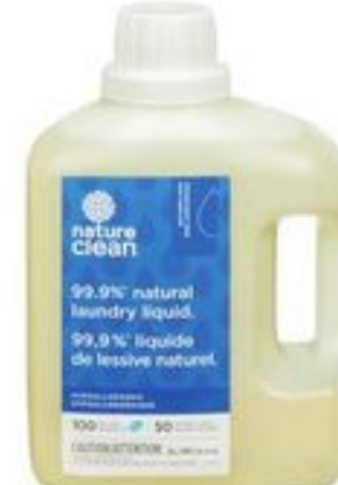
NATURE CLEAN LAUNDRY LIQUID 3 L, PLASTIC FREE LAUNDRY OR CLEANER STRIPS 32/36'S SELECTED VARIETIES 20067905_EA/20757371001_EA