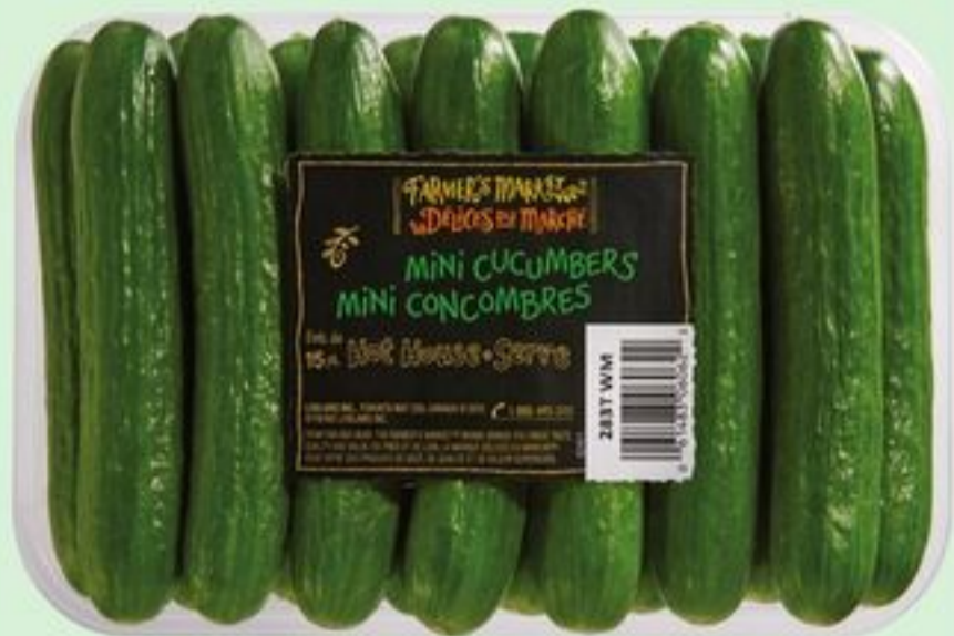
FARMER'S MARKET ™ MINI CUCUMBERS PRODUCT OF ONTARIO 11'S 21070679001_EA