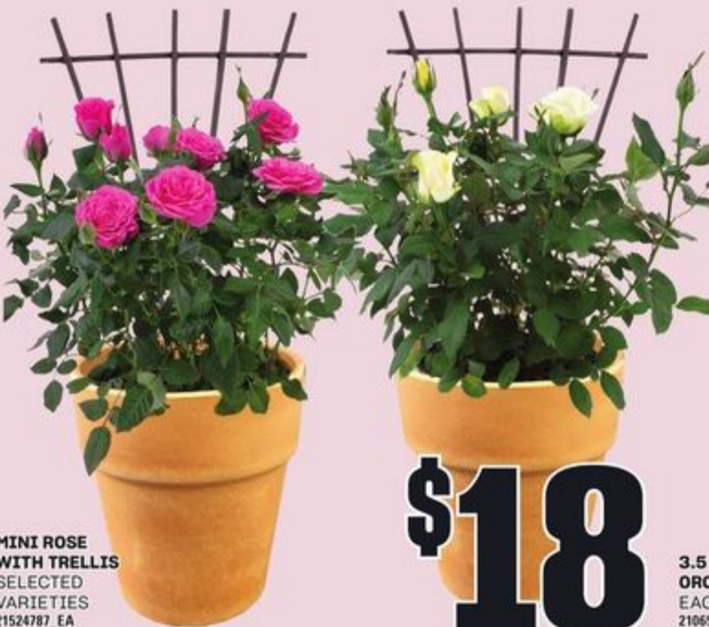
MINI ROSE WITH TRELIS SELECTED VARIETIES 21524787_EA