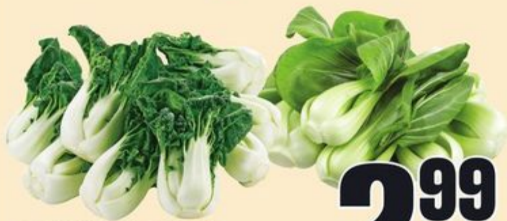
BABY OR SHANGHAI BOK CHOY PRODUCT OF MEXICO 6.59/KG 20082279001_KG/20032454001_KG