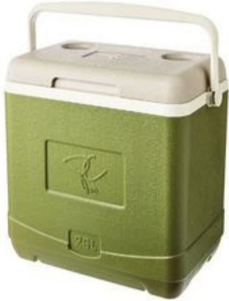
COOLERS SELECTED VARIETIES 21457443_EA