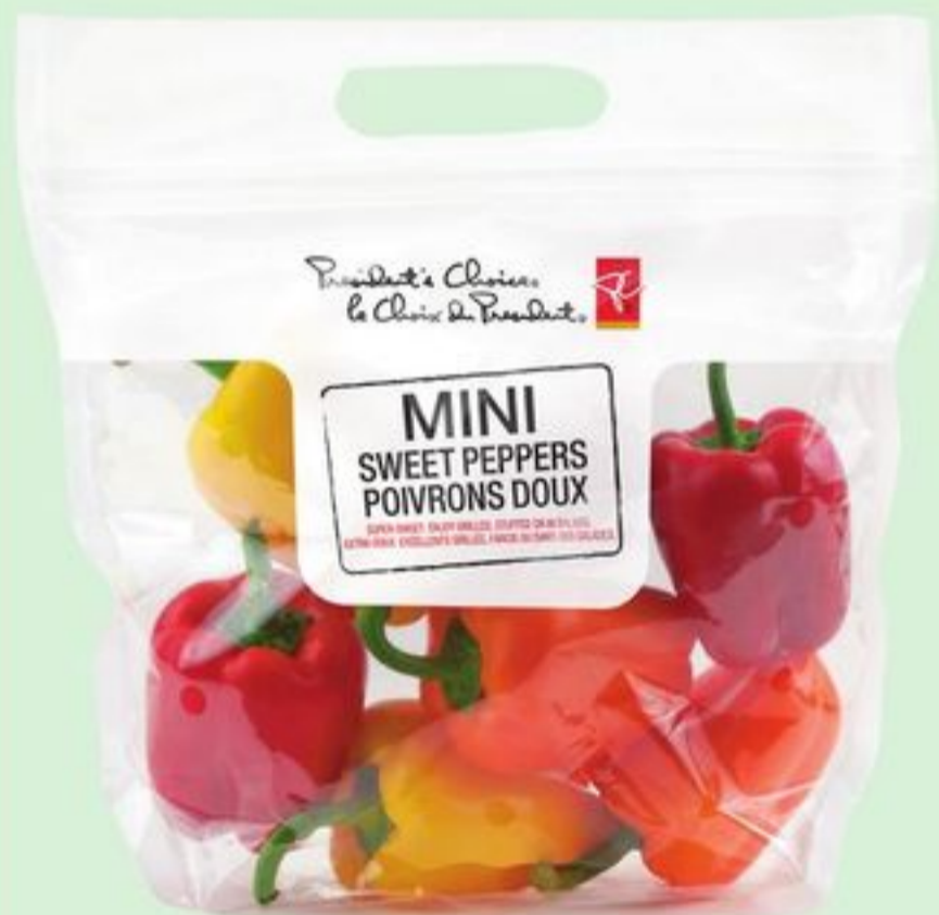
PC ® MINI PEPPERS PRODUCT OF CANADA 454 G 20920821001_EA