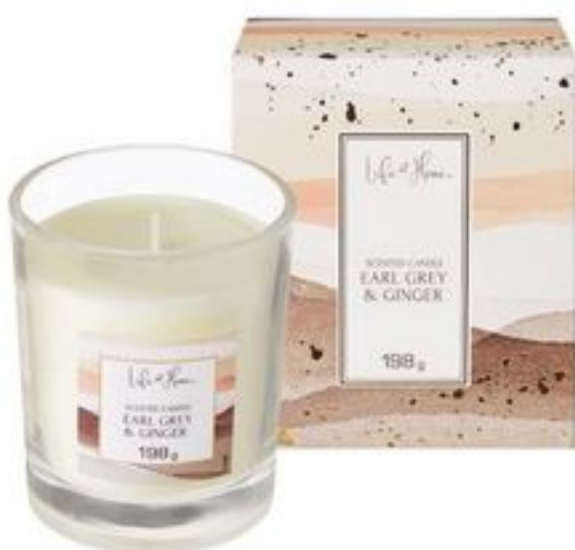
LIFE AT HOME™ 7 OZ SINGLE WICK CANDLE ASSORTED SCENTS $10 21414403_EA

Sophisticated and alluring, this textural scent boasts notes of suede, amber and rosewood wrapped in sensual vanilla and tonka.