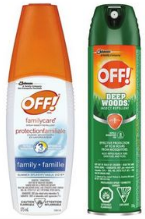
OFF! OR RAID INSECT REPELLENT SELECTED VARIETIES 20001279002_EA/20158572_EA