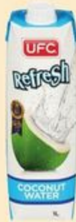
UFC REFRESH COCONUT WATER 1 L 20570506_EA