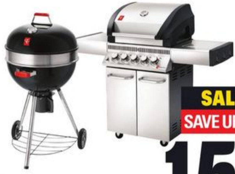
PC™ BBQ GRILLS LIMITED 5 YEAR WARRANTY SELECTED VARIETIES 21297213_EA/21296458_EA