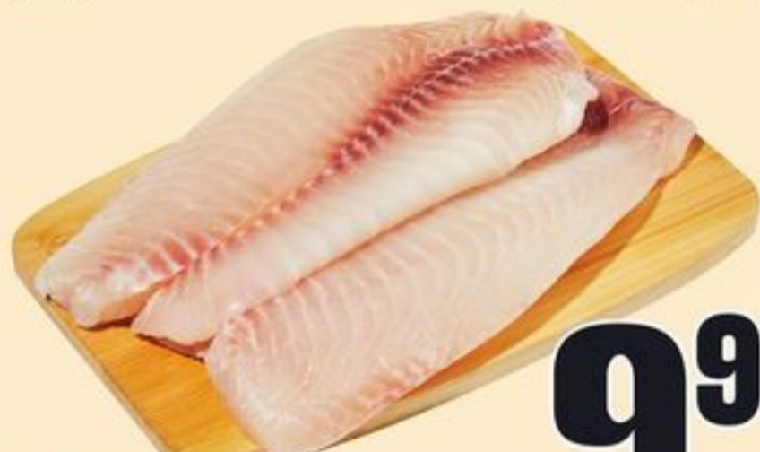
FRESH ASC TILAPIA FILLETS 22.02/KG 20897812_KG