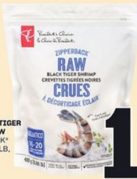
PC® BLACK TIGER SHRIMP RAW ZIPPERBACK® 16-20 PER LB. FROZEN 400 G 20801192_EA