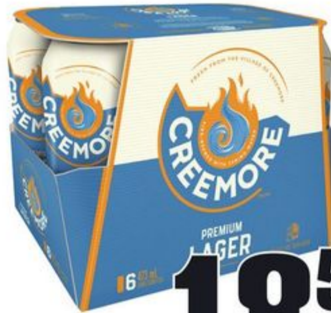
CREEMORE SPRINGS PREMIUM LAGER 6X473 ML CANS 21097267_C06