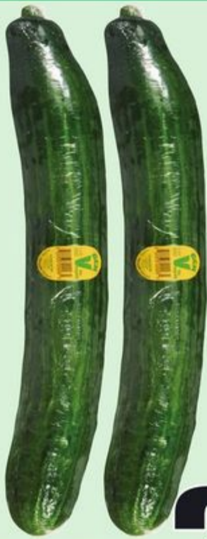
ORGANIC ENGLISH CUCUMBER PRODUCT OF ONTARIO EACH 20080489001_EA