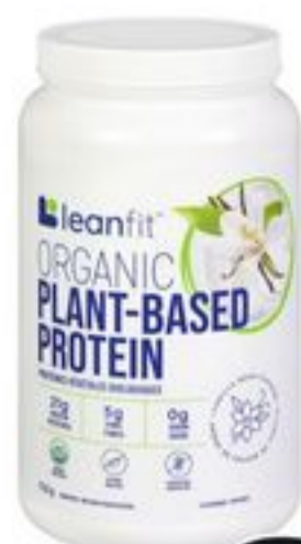
LEANFIT ORGANIC PLANT-BASED PROTEIN 715 G OR WHEY PROTEIN 517-579 G SELECTED VARIETIES 21395716_EA/214603978_EA