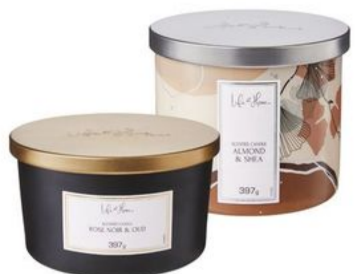
LIFE AT HOME™ 14 OZ 3 WICK CANDLE ASSORTED SCENTS $16 21413774_EA/21415353_EA