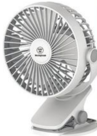
HONEYWELL OR WESTINGHOUSE FANS SELECTED VARIETIES 20129604_EA/21507828_EA