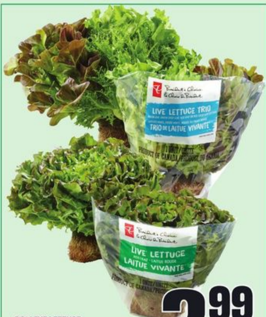
PC ® LIVE LETTUCE RED OR TRIO PRODUCT OF CANADA 1'S 21506580_EA/21178850_EA