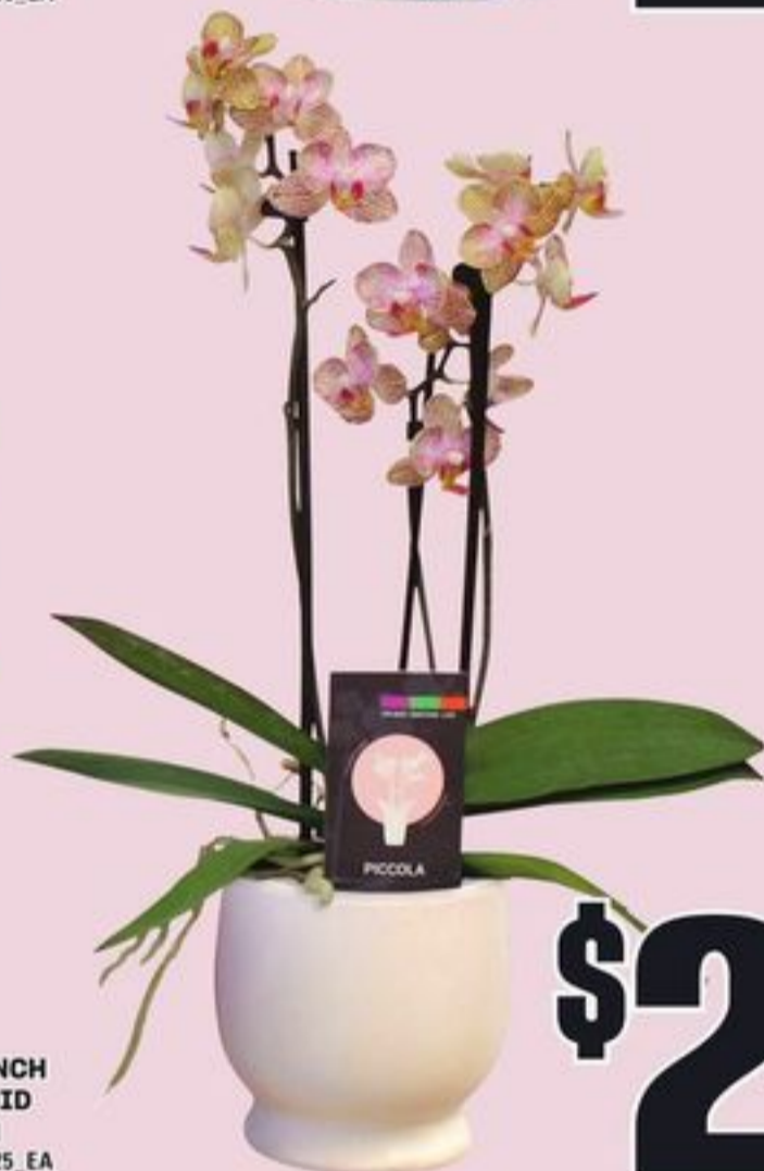
3.5 INCH ORCHID EACH 21065625_EA