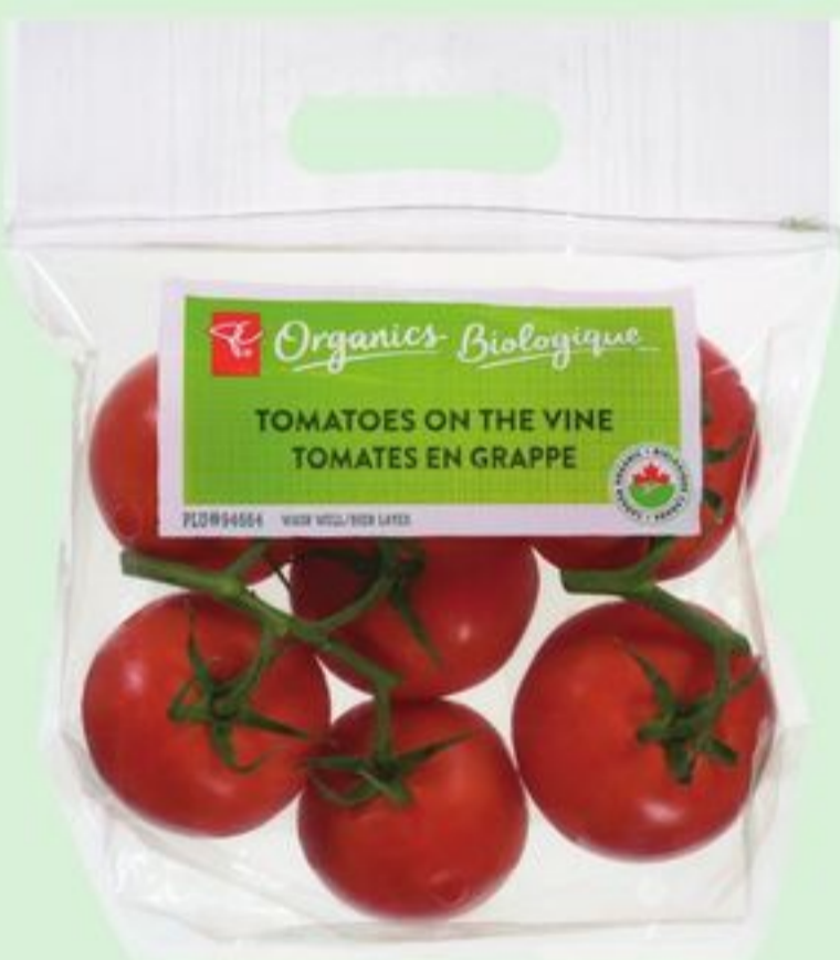
PC ® ORGANICS TOMATOES ON THE VINE PRODUCT OF CANADA 8.80/KG 20127917001_KG