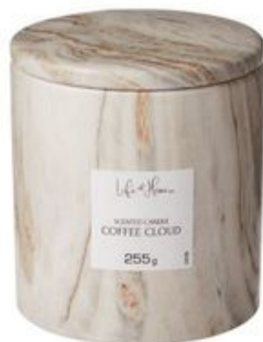
LIFE AT HOME™ 9 OZ SINGLE WICK CANDLE ASSORTED SCENTS $10 21414180_EA