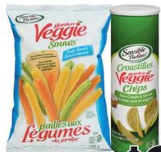
SENSIBLE PORTIONS VEGGIE STRAWS SELECTED VARIETIES 120-142 G 20377204001_EA/21380091_EA