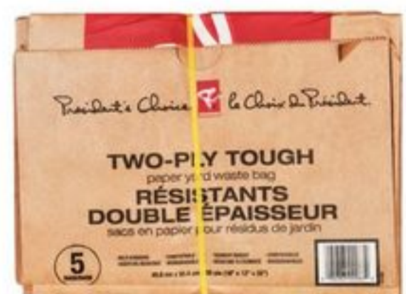
PC® YARD WASTE BAGS 5'S 20429980_EA