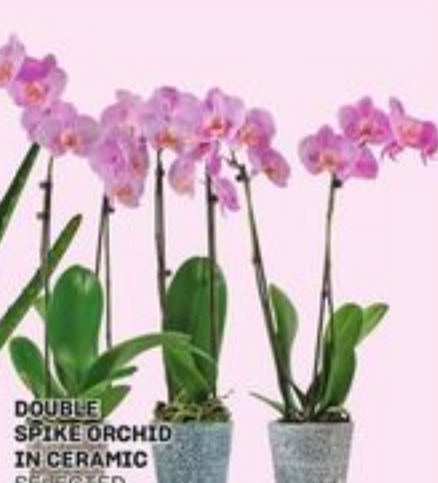
DOUBLE SPIKE ORCHID IN CERAMIC SELECTED VARIETIES EACH ORCHIDÉE À DEUX TIGES DANS UN POT EN CÉRAMIQUE 20293541_EA