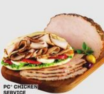
PC® CHICKEN SERVICE CASE MEATS SELECTED VARIETIES POULET PC™ POUR LE COMPTOIR DE SERVICE 20301114_KG