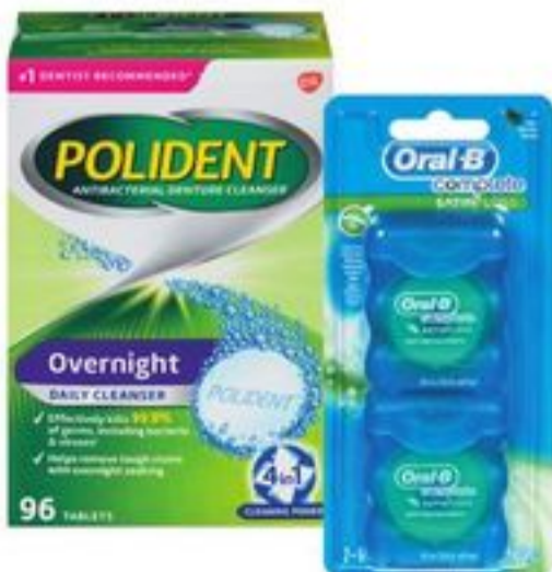
SENSODYNE RAPID RELIEF OR REPAIR AND PROTECT TOOTHPASTE, POLIDENT TABLETS 84-96'S, ORAL-B BATTERY TOOTHBRUSH, CREST PRO HEALTH OR SCOPE MOUTHWASH OR CREST GUM DETOXIFY TOOTHPASTE SELECTED VARIETIES AND SIZES 20437569002_EA/20558749_EA