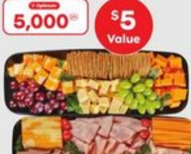
PARTY PLATTERS SELECTED VARIETIES 696 G/1.8 KG PLATEAUX DE CÉLÉBRATION 21217521_EA/21217522_EA