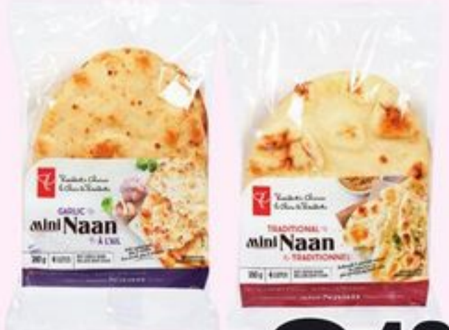
PC® MINI NAAN TRADITIONNAL OR GARLIC SELECTED VARIETIES 4'S 21076210_EA 21076234_EA