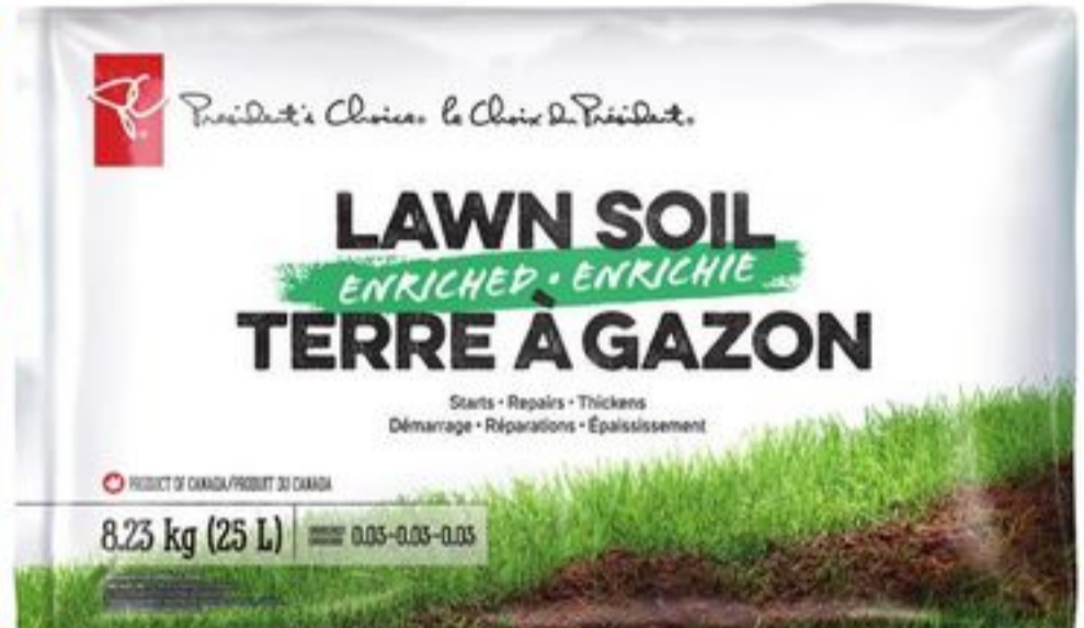
PC® ENRICHED LAWN SOIL 25 L 21349080_EA