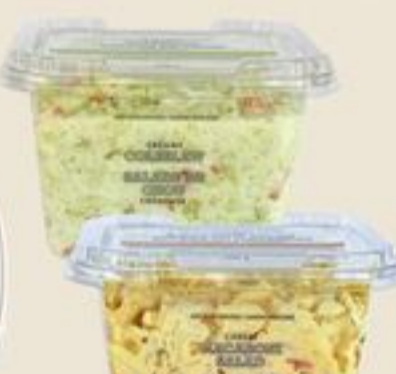
PREMIUM SALADS 850-908 G 21544597_EA/21544612_EA