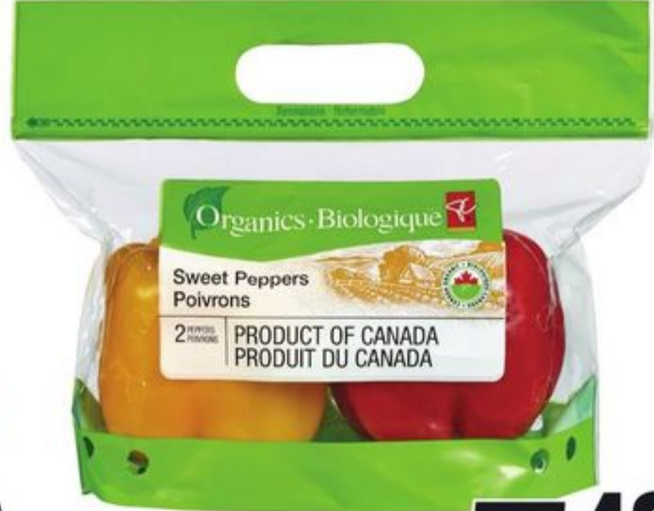
CANADA PC® ORGANICS PEPPERS PRODUCT OF CANADA 2'S 20690699001_EA