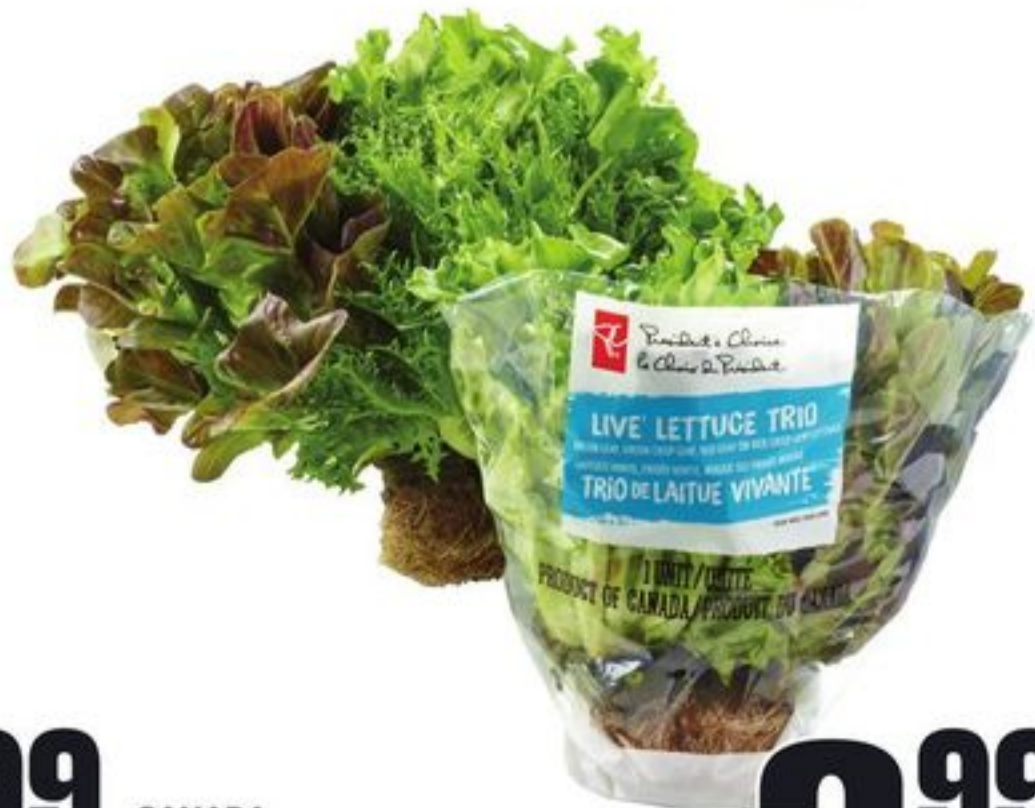
CANADA PC® LIVE LETTUCE GREEN, RED OR TRIO PRODUCT OF CANADA EACH 21178850_EA/21506580_EA