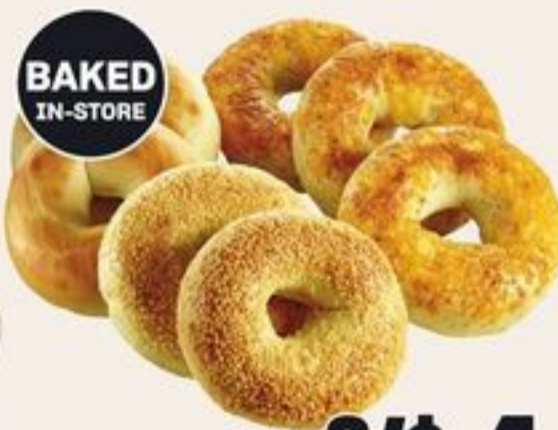
PREMIUM BULK BAGELS 20038964_EA