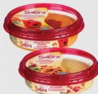
SABRA HUMMUS SELECTED VARIETIES 283 G 20005858_EA/20103117_EA