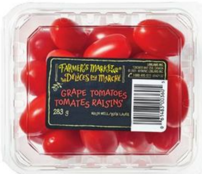
FARMER'S MARKET™ GRAPE TOMATOES PRODUCT OF MEXICO 283 G 21367880001_EA