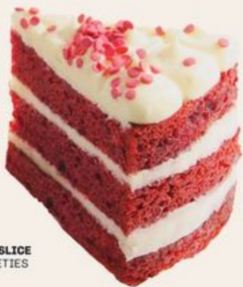
LA ROCCA CAKE SLICE SELECTED VARIETIES 137-187 G 21496255_EA