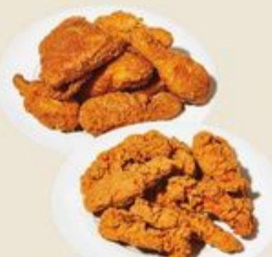
CHICKEN FAVORITES ASSORTED VARIETIES SERVED HOT OR CHILLED 320-700 G 20137058_EA/20992187_EA