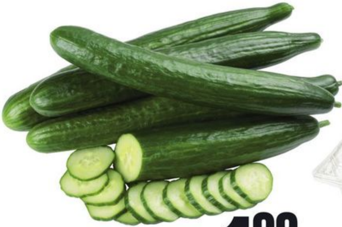
ONTARIO ENGLISH CUCUMBERS PRODUCT OF ONTARIO EACH 20070132001_EA