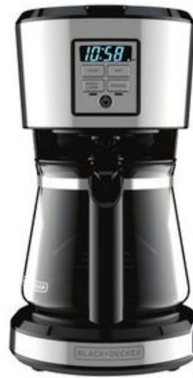
BLACK AND DECKER APPLIANCES 21513969_EA