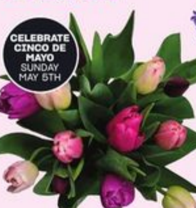
10 STEM RAINBOW TULIPS 21521853_EA