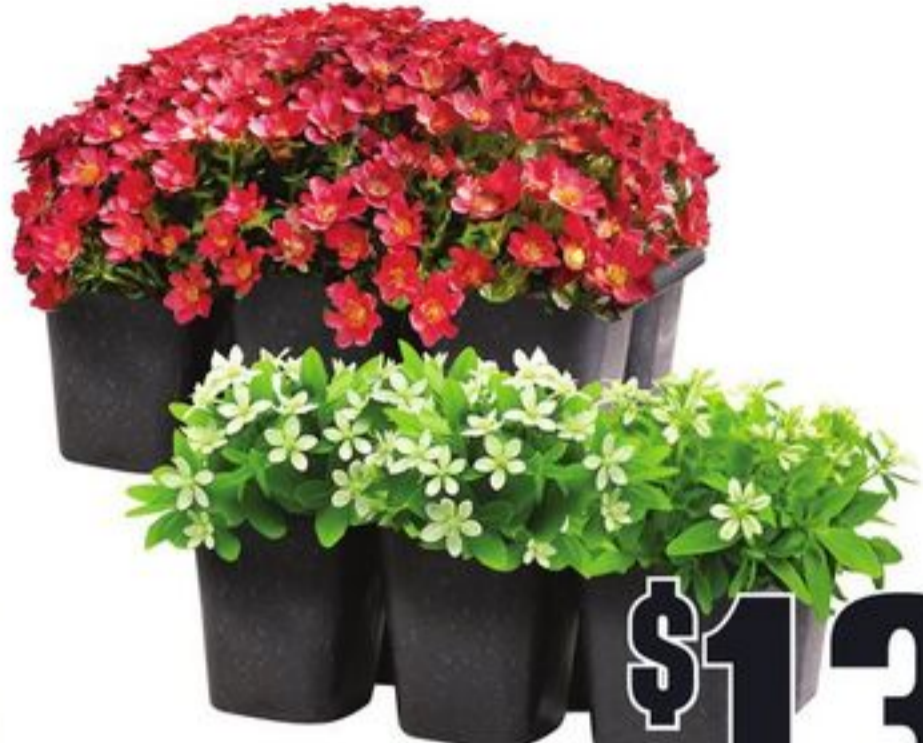
GROUNDCOVERS 6'S 20161178_EA