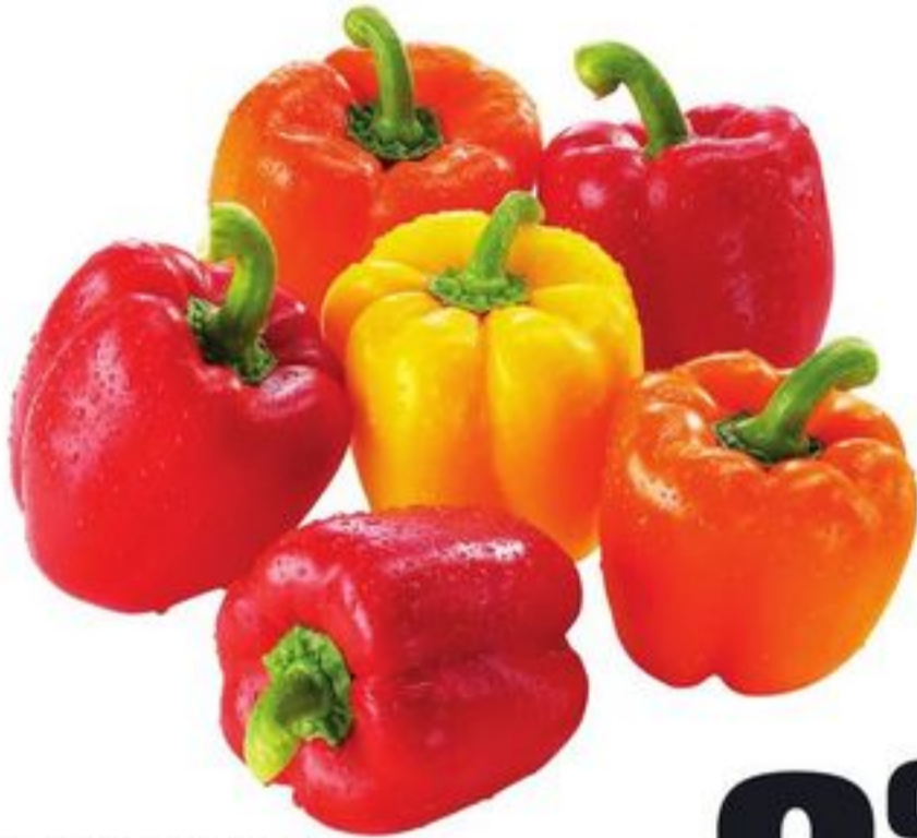
GREENHOUSE EXTRA LARGE ORANGE, RED OR YELLOW SWEET PEPPERS PRODUCT OF MEXICO 6.59/KG 20166880001_KG/20007535001_KG