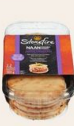
PC® NAAN ROUNDS ORIGINAL OR STONEFIRE CARAMELIZED ONION 20757871_EA/21584557_EA

BUY 2 OR MORE 3 50 EA. LESS THAN 2 $3.99 EA.