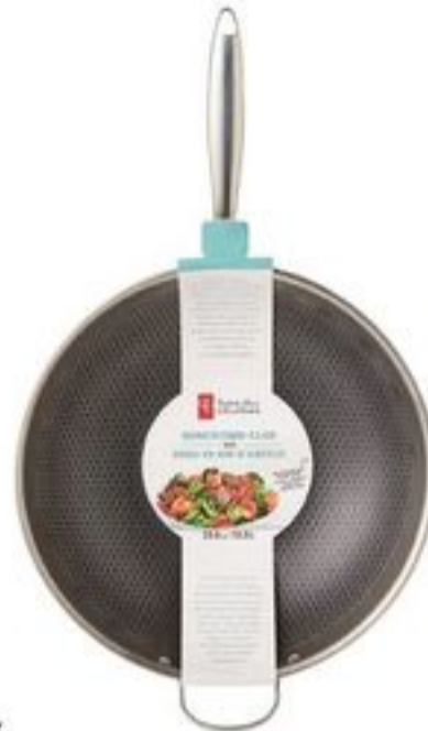
PC ® 13.3" HONEYCOMB WOK 21339634_EA