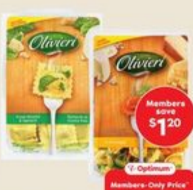
OLIVIERI FAMILY PACK PASTA SELECTED VARIETIES 540-700 G 20312412_EA/ 20915948_EA

Members save $1.20 Optimum Members-Only Price™ 10 79 Non-members 11 99