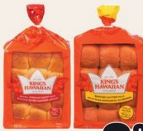
KING'S HAWAIIAN ROLLS SELECTED SIZES AND VARIETIES 21479570_EA/21489831_EA