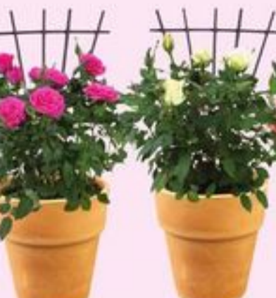
MINI ROSE WITH TRELLIS SELECTED VARIETIES 21524787_EA