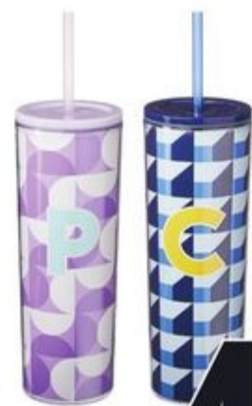
LIFE AT HOME ™ MONOGRAM TUMBLERS SELECTED VARIETIES 21540953_EA/21540922_EA