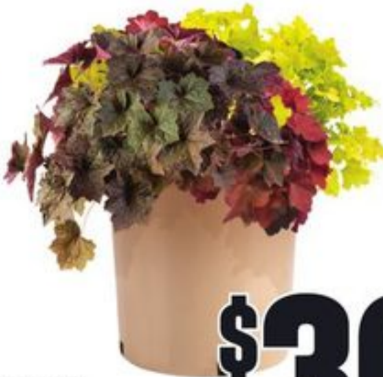
HEUCHERA PLANTER 2 GALLON 21578835_EA