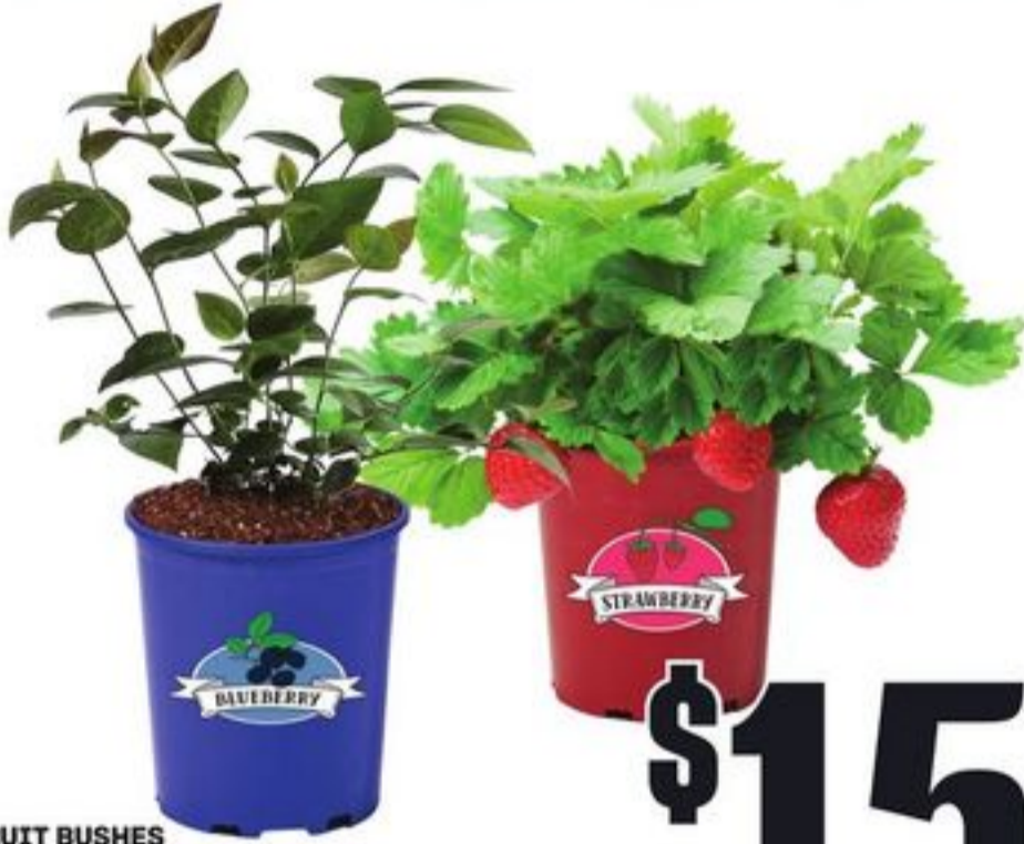
FRUIT BUSHES SELECTED VARIETIES 1 GALLON 21214932_EA