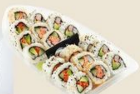
BENTO SUSHI MAKI BOAT 400 G 20171858_EA