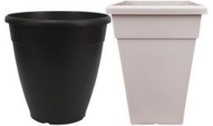
HAVANA PLANTERS SELECTED STYLES 21576659_EA 21576658_EA