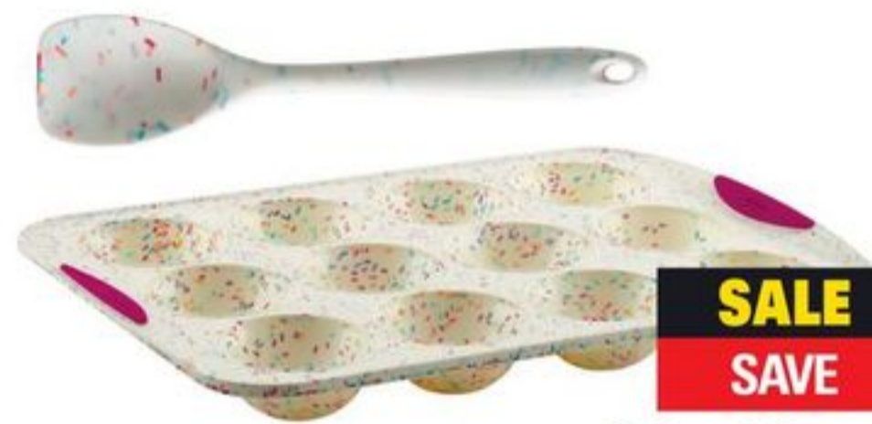
TRUDEAU SILICONE OR METAL BAKEWARE, BAKING OR ACCESSORIES SELECTED VARIETIES 21185936_EA/21185988_EA