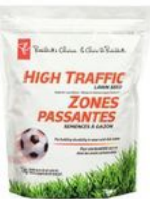
PC® GRASS SEED SELECTED VARIETIES 1 KG 21359477_EA 21359479_EA