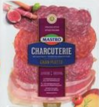
MASTRO TRIO PACKS SELECTED VARIETIES 150/250 G 21554465_EA