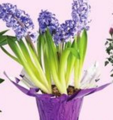
SPRING BULBS ASSORTED VARIETIES 20956925_EA