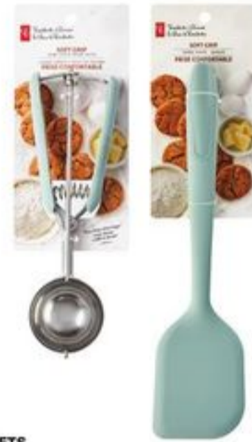
PC ® BAKING GADGETS SELECTED VARIETIES 21345447_EA/21412119_EA