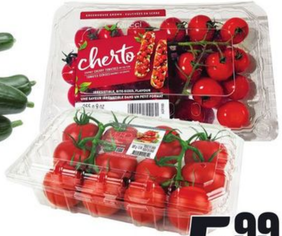
ONTARIO TOMATOES CHERTO 255 G OR VERO TOMATOES 680 G PRODUCT OF ONTARIO 21046464001_EA/21068372001_EA