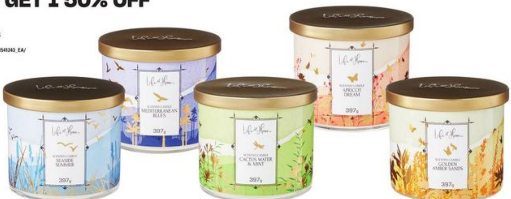
LIFE AT HOME ™ 3 WICK CANDLE ASSORTED SCENTS $16 21541249_EA/21541281_EA/21541243_EA/ 21541290_EA/21541294_EA