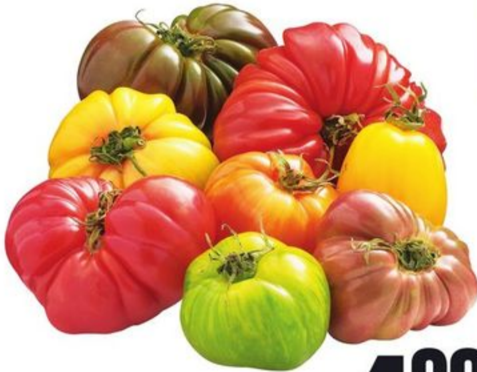
ONTARIO HEIRLOOM TOMATOES PRODUCT OF ONTARIO 11.00/KG 20154799001_KG