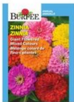
BURPEE OR MCKENZIE SEEDS SELECTED VARIETIES 20752992_EA/20752876_EA