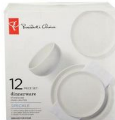
PC ® 12 PIECE DINNERWARE SETS SELECTED VARIETIES 21412464_EA/21171925_EA