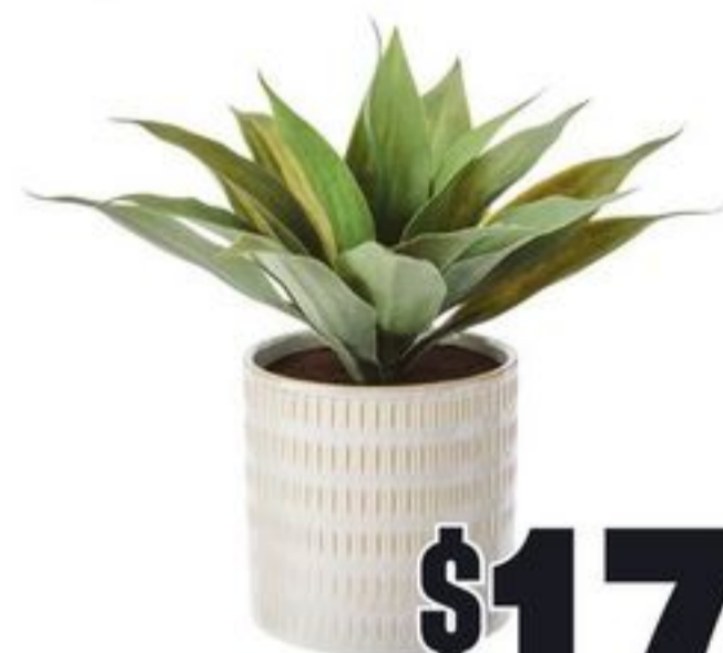
LIFE AT HOME ™ FAUX ALGAE PLANT 21428557_EA