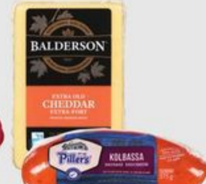
PILLER'S KOLBASSA 250/375 G OR BALDERSON CHEESE 250/280 G SELECTED VARIETIES 20308469_EA/21495455_EA