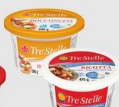
TRESTELLE BOCCONCINI 200 G OR RICOTTA 475 G SELECTED VARIETIES 20318663_EA/ 20528878_EA