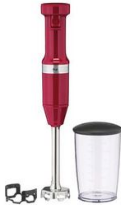
KITCHENAID APPLIANCES SELECTED VARIETIES 21297704_EA