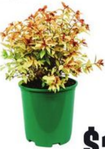
SHRUBS SELECTED VARIETIES 1 GALLON 20741263_EA/20116656_EA