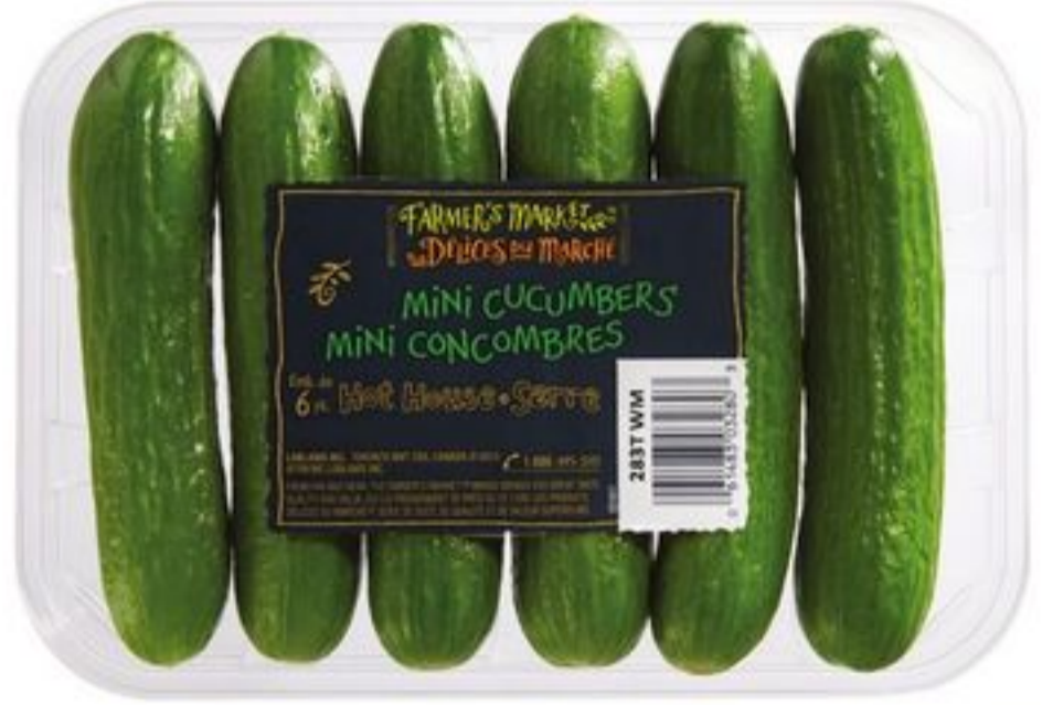
CANADA FARMER'S MARKET™ MINI CUCUMBERS PRODUCT OF CANADA 6'S 20737570001_EA