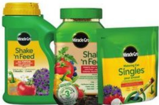
PLANT FOOD FERTILIZER SELECTED TYPES AND SIZES 21567431_EA 21157858_EA 21567705_EA