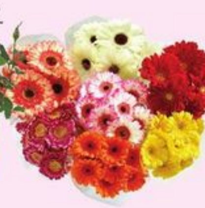
GERBERA DAISIES 21437443_EA