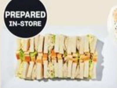
CHICKEN, EGG OR TUNA SOFTY SANDWICHES 1.1 KG 21503465_EA