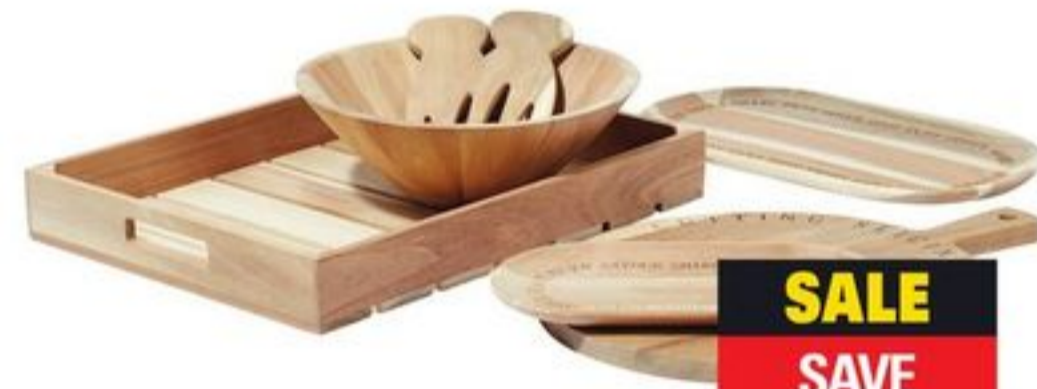
PC ® ACACIA SERVE BOARDS SELECTED VARIETIES 21043170_EA