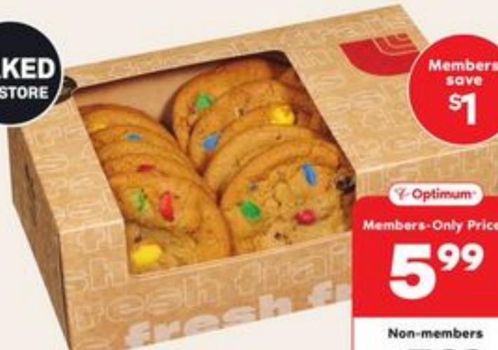
IN-STORE BAKED COOKIES SELECTED VARIETIES 18'S 21454952_EA