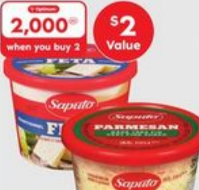
SAPUTO FETA 170/200 G OR SHREDED CHEESE 140 G SELECTED VARIETIES 20573975_EA/21081222_EA

Members save $1.20 Optimum Members-Only Price™ 10 79 Non-members 11 99