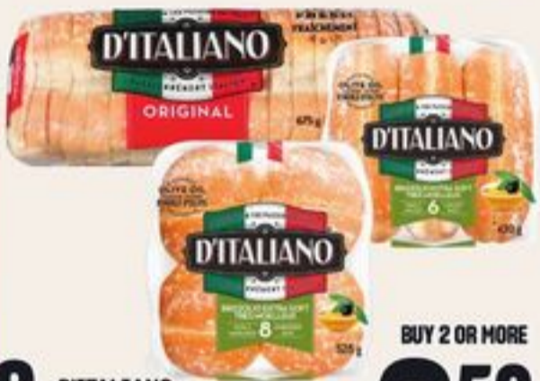
D'ITALIANO BREAD OR BUNS SELECTED VARIETIES AND SIZES 20038335_EA/20673208_EA/ 20627103_EA

BUY 2 OR MORE 3 50 EA. LESS THAN 2 $3.99 EA.