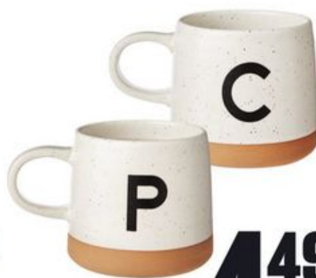
PC ® MONOGRAM MUGS 21493282_EA/21493273_EA