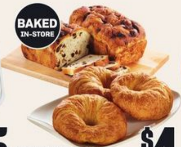
PLAIN CROISSANTS 6'S OR CINNAMON RAISIN BREAD 550 G 20729432_EA/21030153_EA