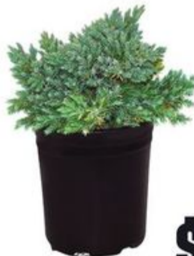
EVERGREENS SELECTED VARIETIES 1 GALLON 20741130_EA/20741475_EA