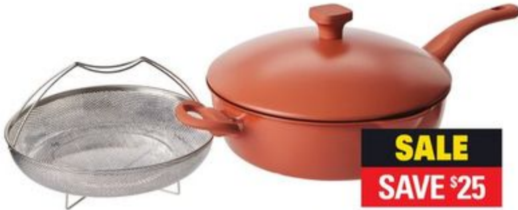
PC ® TERRACOTTA EVERYTHING PAN 21416332_EA