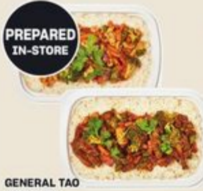
GENERAL TAO CHICKEN, TERIYAKI CHICKEN, SZECHUAN BEEF OR BUTTER CHICKEN WITH RICE ENTRÉES 900 G 21533950_EA/21533951_EA