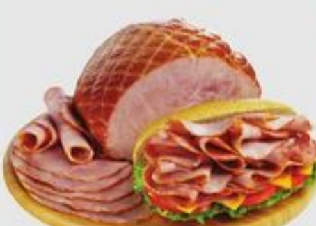
PC® HAM SERVICE CASE SELECTED VARIETIES 20301724_KG