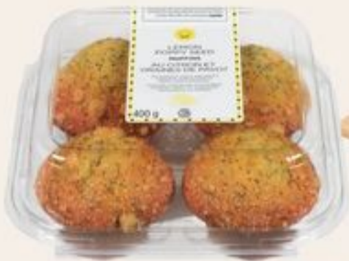
PREMIUM MUFFINS SELECTED VARIETIES 4'S 21557676_EA

Optimum Members-Only Price™ 5 99 Non-members 6 99