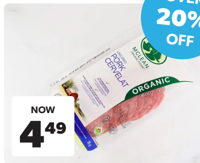
McLean Meats Assorted Organic Sliced Salamis Reg. $5.79/70g