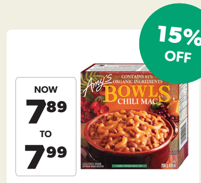
Amy's Kitchen Assorted Meals Reg. $9.29-9.49/241-269g