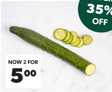
Local Long English Cucumbers Reg. $3.99/each Product of AB