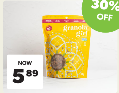
Granola Girl Gluten & Nut Free Granola Reg. $8.49/320g

Sales valid from April 28 - May 4 / 2024