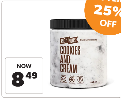
Righteous Gelato Small Batch Gelato Reg. $11.49/562ml