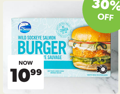
7 Seas Sockeye Salmon & Feta burgers Reg. $15.79/4x113g