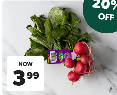
BC Organic Radish Bunches Reg. $4.99/each Product of BC