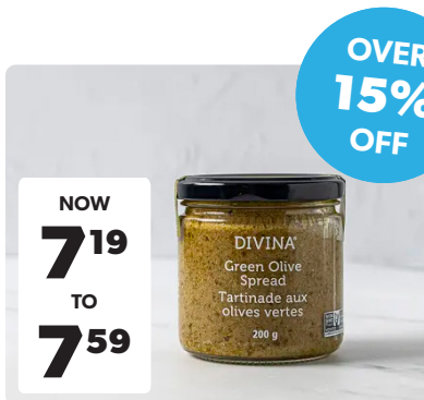
Divina Charcuterie Jams & Spreads Reg. $8.49-8.99/190-240g