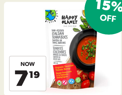
Happy Planet Assorted Soup Reg. $8.49/650ml