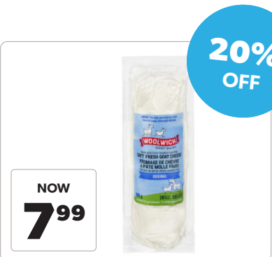
Woolwich Goat Dairy Soft Fresh Goat Cheese Reg. $9.99/300g