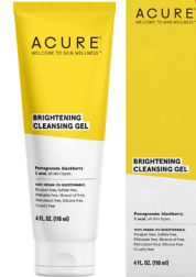
Acure Face & Body Products Assorted Sizes & Prices