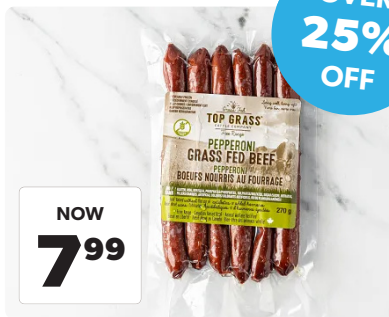
Top Grass Cattle Co. Grass Fed Beef Pepperoni Sticks Reg. $10.99/270g