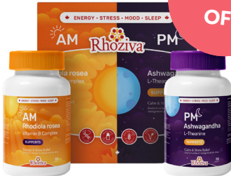
Nanton Nutraceuticals AM/PM & All Products Assorted Sizes & Prices