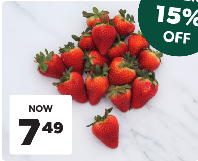
Organic Strawberries Reg. $8.99/1lb (454g) Product of MEX