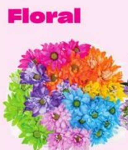
COLOUR POP DAISIES MARGUERITES COLOUR POP 21437439_EA