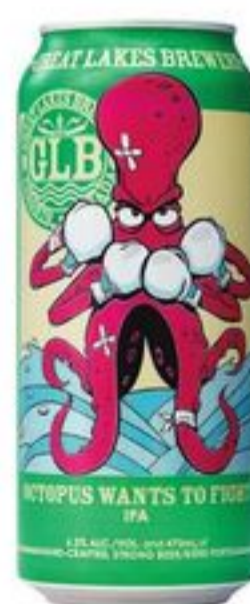
GLB OCTOPUS WANTS TO FIGHT IPA 473 ML CAN 21185170_EA