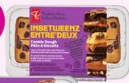
PC® INBETWEENZ™ DESSERT SQUARE SELECTED VARIETIES 312 G 21592641_EA