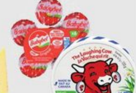
BABYBEL 6'S OR THE LAUGHING COW 8'S SELECTED VARIETIES BABYBEL OU LA VACHE QUI RIT 20319107_EA/20574332_EA