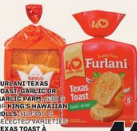
FURLANI TEXAS TOAST, GARLIC OR GARLIC PARM. 698 G OR KING'S HAWAIIAN ROLLS 312/340 G SELECTED VARIETIES TEXAS TOAST À L'AIL OU AIL ET PARMESAN FURLANI OU PETITS PAINS KING'S HAWAIIAN 20041579_EA/21475970_EA