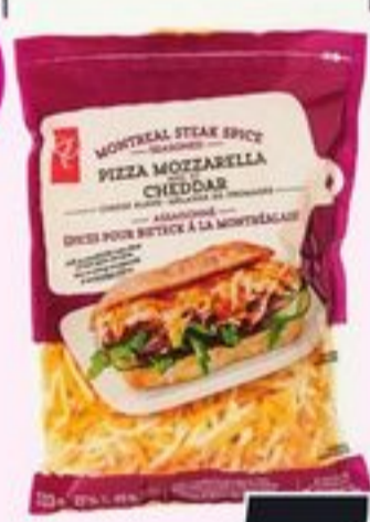
PC® MONTREAL STEAK SPICE SEASONED PIZZA MOZZARELLA AND CHEDDAR CHEESE BLEND 320 G 21575868_EA