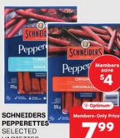
SCHNEIDERS PEPPERETTES SELECTED VARIETIES 250-375 G PEPPERETTES SCHNEIDERS 20976093_EA/20976110_EA

7 99 Members-Only Price 11 99 Non-members