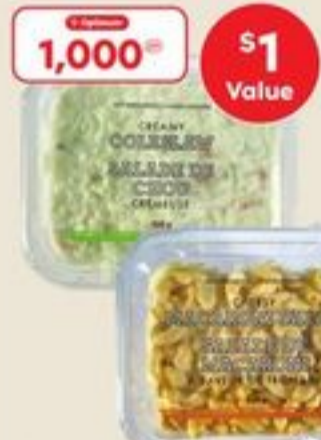
PREMIUM SALADS 425-454 G SALADES DE QUALITÉ SUPÉRIEURE 21544608_EA/21544611_EA