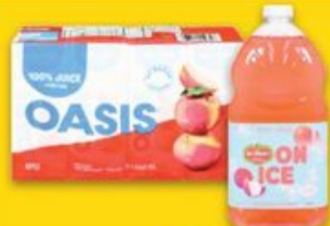
OASIS JUICE or ARIZONA ICED TEA, ALLEN'S APPLE CRANBERRY COCKTAIL or DEL MONTE ON ICE REFRESHERS 1.89 L selected varieties jus ou thé glacé ou boissons 20313744002 SA/21375041 SA