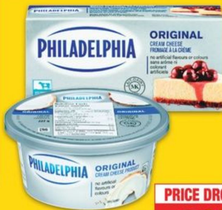
PHILADELPHIA CREAM CHEESE PRODUCT selected varieties 227/250 g produit de fromage à la crème 20641267 SA/2064492610 SA