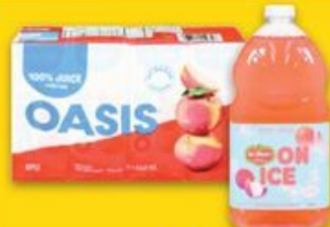
OASIS JUICE or ARIZONA ICED TEA, ALLEN'S APPLE or CRANBERRY COCKTAIL or DEL MONTE ON ICE REFRESHERS 1.89 L selected varieties jus ou thé glacé ou boissons 20313764002 SA/21375061 SA