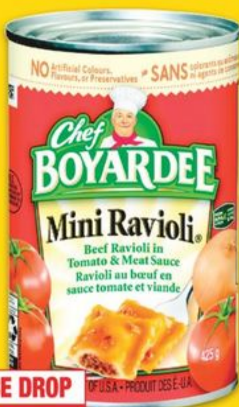
CHEF BOYARDEE selected varieties 418/425 g pâtes 2031230001 SA