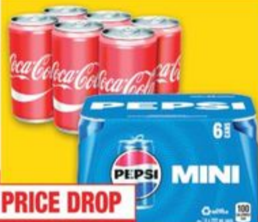
COCA-COLA or PEPSI SOFT DRINKS selected varieties 6x222 mL boissons gazeuses 20344286002 C06/20637360004 C06