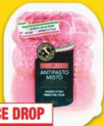
MARCANGELO SLICED DELI MEAT selected varieties 100 g viandes de charcuterie 20681202 SA