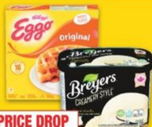
EGGO WAFFLES 16's or BREYERS CREAMERY STYLE ICE CREAM 1.66 L selected varieties, frozen gâteaux ou crème glacée 20099720004 SA/20344920004 SA