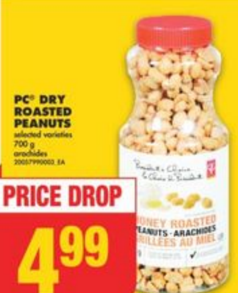
PC® DRY ROASTED PEANUTS selected varieties 700 g arachides 2005799002 SA