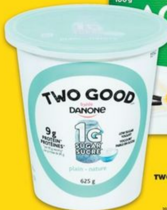
DANONE ACTIVIA 8% MIX & GO VANILLA 2% or TWO GOOD LOW SUGAR YOGURT selected varieties yogourt 2022384002 SA/21477313 SA