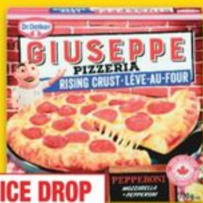
GIUSEPPE THIN CRUST or RISING CRUST PIZZA selected varieties, frozen 439-785 g pizza 21106361 SA