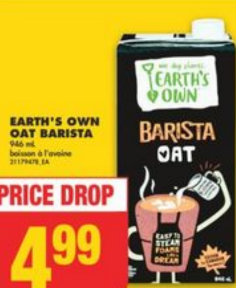
EARTH'S OWN OAT BARISTA 946 mL boisson à l'avoine 21179478 SA