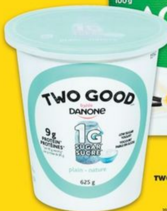
DANONE ACTIVIA 8% MIX & GO VANILLA 2% or TWO GOOD LOW SUGAR YOGURT selected varieties yogourt 2022384002 SA/21477313 SA