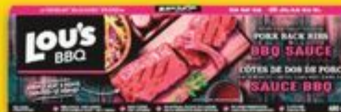
LOU'S PORK BACK RIBS selected varieties, frozen 680 g côtes de dos 21320777 SA