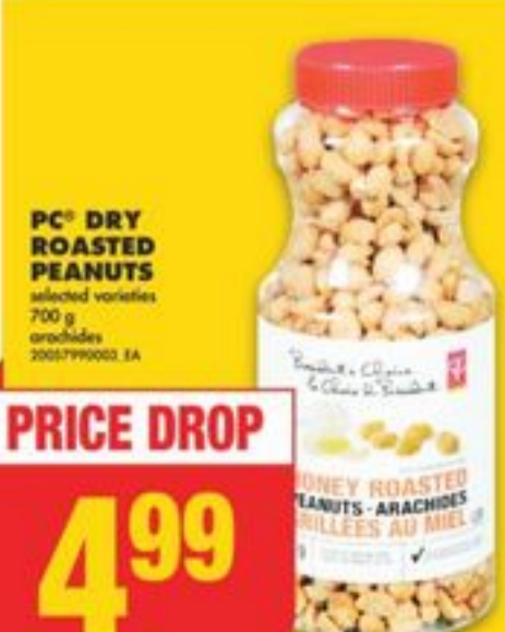
PC® DRY ROASTED PEANUTS selected varieties 700 g arachides 2005799002 SA