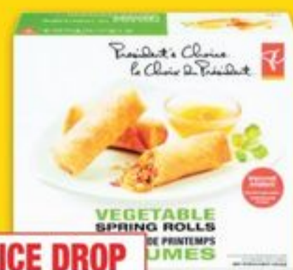
PC® SPRING ROLLS selected varieties, frozen 574 g rouleaux de printemps 20692094 SA