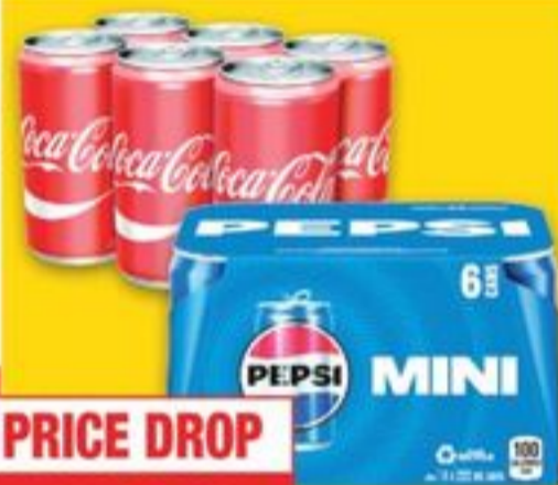
COCA-COLA or PEPSI SOFT DRINKS selected varieties 6x222 mL boissons gazeuses 20344284002 C06/20637340004 C06