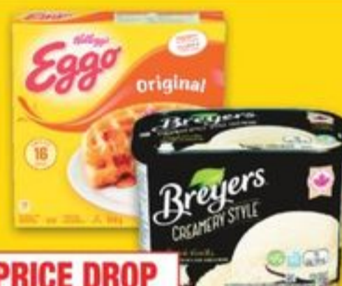
EGGO WAFFLES 16's or BREYERS CREAMERY STYLE ICE CREAM 1.66 L selected varieties, frozen gâteaux ou crème glacée 20097730004 SA/20344920004 SA