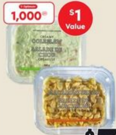
PREMIUM SALADS 425-454 G 21544608_EA/21544611_EA