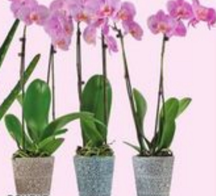
DOUBLE SPIKE ORCHID IN CERAMIC SELECTED VARIETIES EACH 20293541_EA