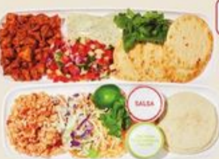
CHICKEN, FAJITA OR TANDOORI TACO TRAYS SELECTED VARIETIES 1-1.1 KG 21395977_EA/ 21595419_EA

Great to go items plus applicable taxes.