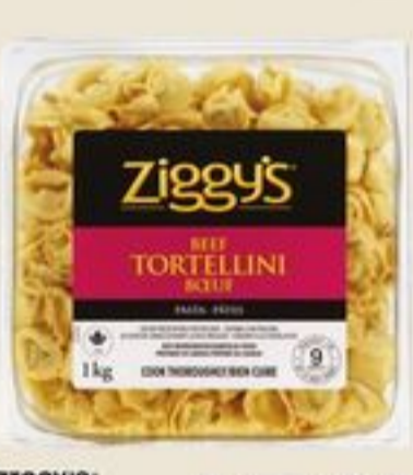
ZIGGY'S PASTA SELECTED VARIETIES 1 KG 21521156_EA