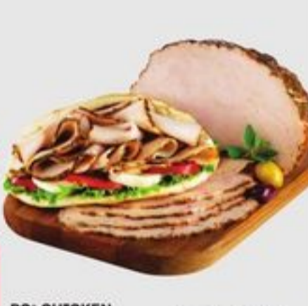
PC CHICKEN SERVICE CASE MEATS SELECTED VARIETIES 20301114_KG