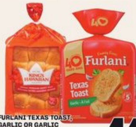
FURLANI TEXAS TOAST, GARLIC OR GARLIC PARM 638 G OR KING'S HAWAIIAN ROLLS 312/340 G SELECTED VARIETIES 20041579_EA/21475970_EA