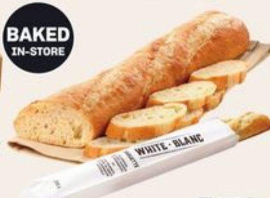
BAGUETTE WHITE OR WHOLE WHEAT 255 G 21529211_EA