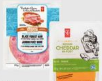
PC NATURAL CHOICE OR BLUE MENU SLICED DELI MEATS 175 G OR PC CHEESE SLICES 140-170 G SELECTED VARIETIES 20216643_EA/20310580_EA