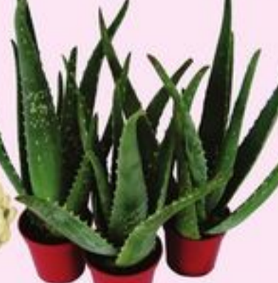
ALOE VERA 4 INCH POT 21047366_EA