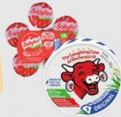
BABYBEL 6'S OR THE LAUGHING COW 8'S SELECTED VARIETIES 20319107_EA/ 20574332_EA