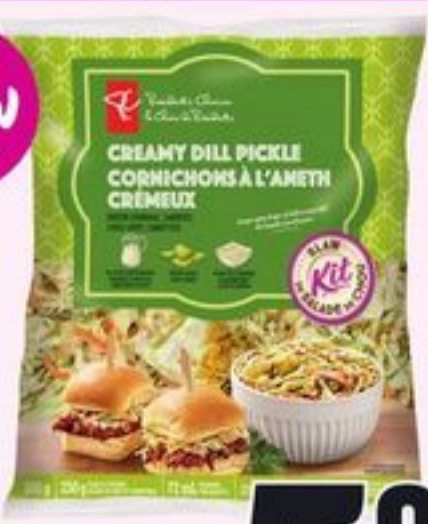
PC® CREAMY DILL PICKLE SLAW KIT 301 G 21588279_EA