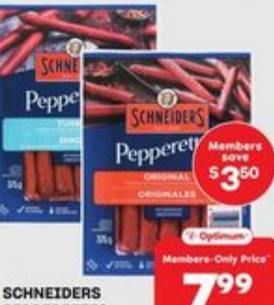
SCHNEIDERS PEPPERETTES SELECTED VARIETIES 250-375 G 20976093_EA/ 20976110_EA