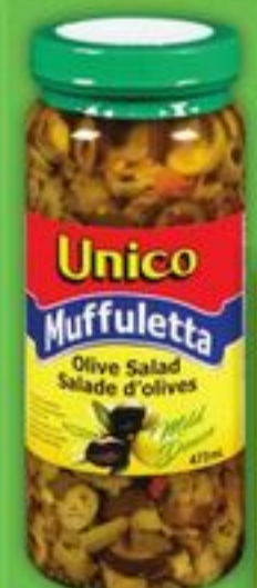
MOLISANA OLIVES OR UNICO MUFFULETTA 473, 750 ML SELECTED VARIETIES

ALL AISLES LEAD HOME KITCHENS OF THE WORLD 5.49 EACH