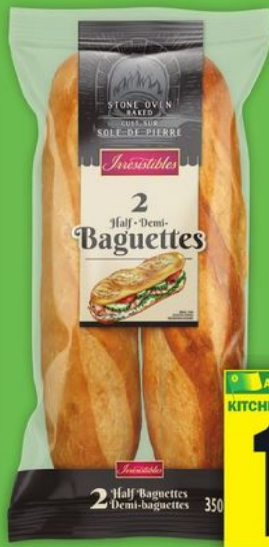
IRRESISTIBLES HALF BAGUETTES 350 G

ALL AISLES LEAD HOME KITCHENS OF THE WORLD 6.99 /LB