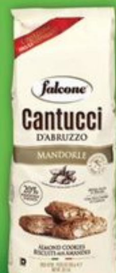
FALCONE CANTUCCI 800 G SELECTED VARIETIES

ALL AISLES LEAD HOME KITCHENS OF THE WORLD 2.49 EACH