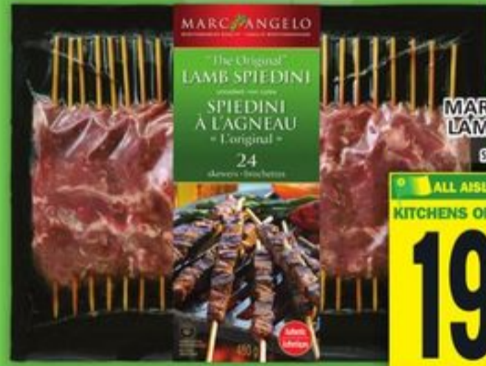
MARC ANGELO LAMB SPIEDINI 24 340 G FROZEN SELECTED VARIETIES

ALL AISLES LEAD HOME KITCHENS OF THE WORLD 13.99 EACH