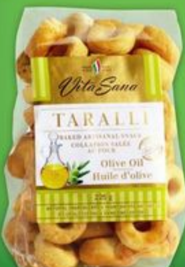
VITA SANA TARALLI 225 G SELECTED VARIETIES

ALL AISLES LEAD HOME KITCHENS OF THE WORLD 5.49 EACH