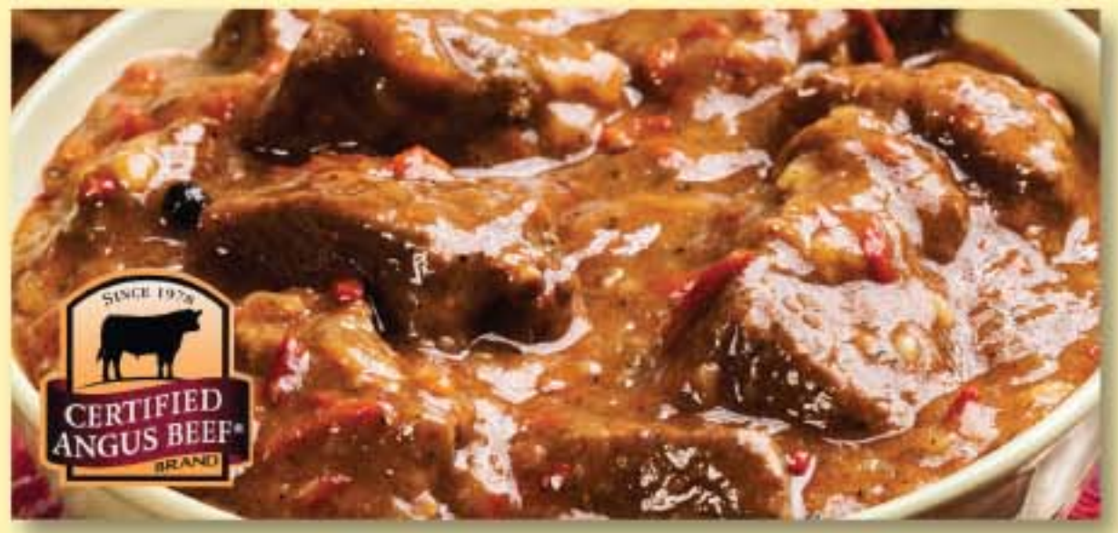
Certified Angus Beef® Stew Meat or Cube Steak Fresh SAVE up to 1.00 Lb.