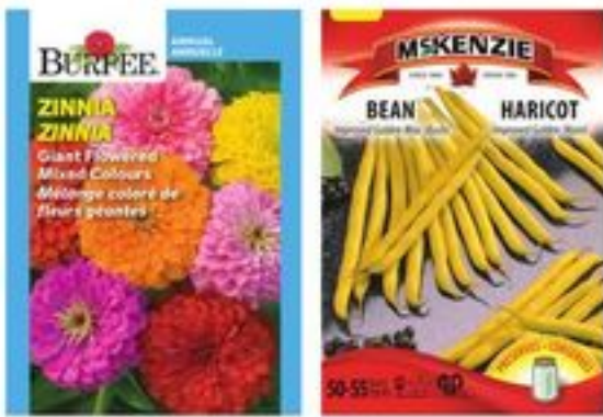
BURPEE OR MCKENZIE SEEDS SELECTED VARIETIES 20752992_EA/20752876_EA