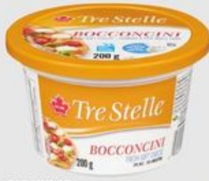
TRE STELLE BOCCONCINI SELECTED VARIETIES 200 G 20318663_EA