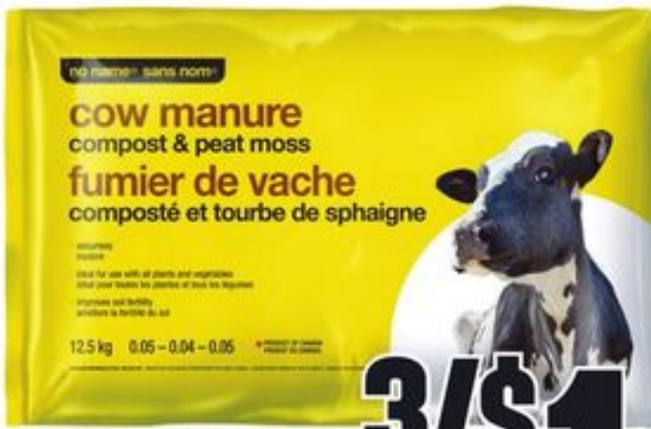
NO NAME® COW MANURE COMPOST 12.5 KG 21349331_EA