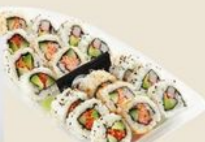
BENTO SUSHI MAKI BOAT 400 G 20171858_EA