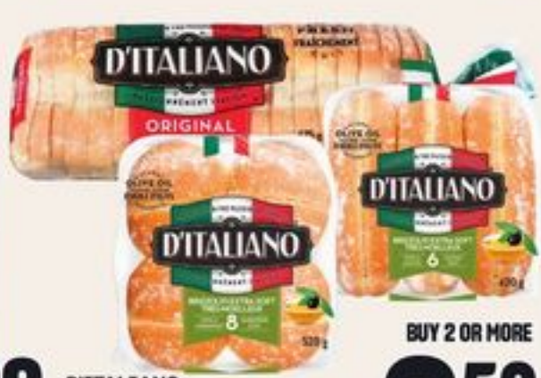
D'ITALIANO BREAD OR BUNS SELECTED VARIETIES AND SIZES 20038335_EA/20673208_EA/ 20627103_EA

BUY 2 OR MORE 3 50 EA. LESS THAN 2 $3.99 EA.