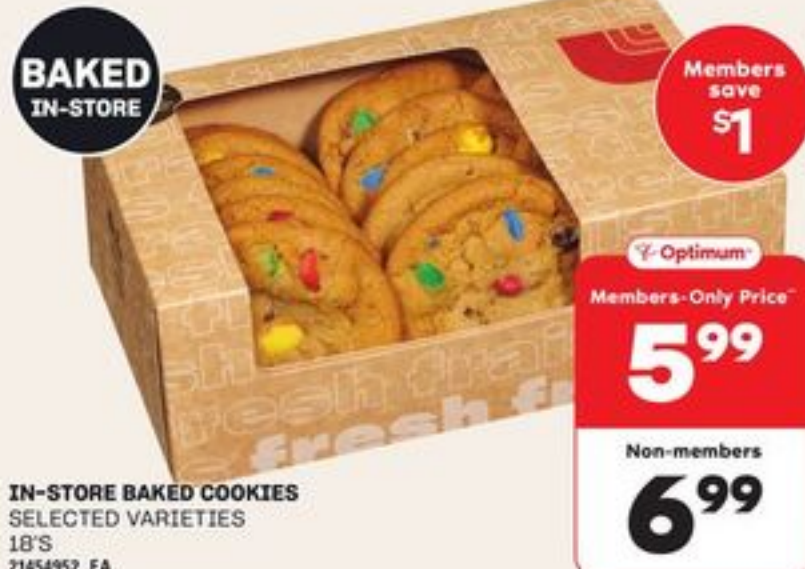
BAKED IN-STORE IN-STORE BAKED COOKIES SELECTED VARIETIES 18'S 21454952_EA