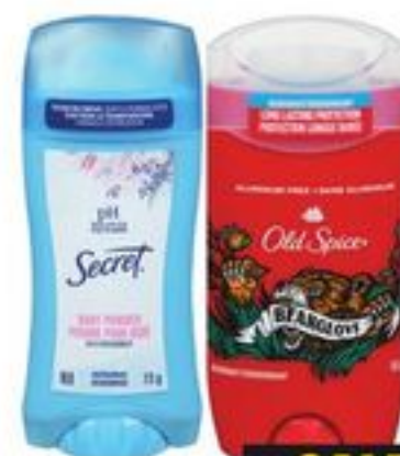
SECRET OR OLD SPICE ANTIPERSPIRANT OR DEODORANT SELECTED VARIETIES 45-107 G, 2X45 G, 175 ML 20098094_EA 20757237001_EA