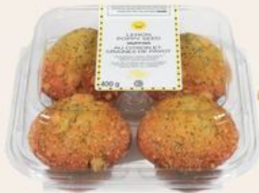
PREMIUM MUFFINS SELECTED VARIETIES 4'S 21557676_EA

Optimum Members-Only Price 5 99 Non-members 6 99