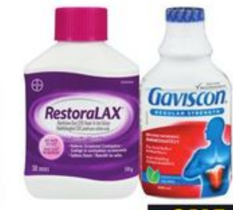
PEPTO, GAVISCON, RESTORALAX OR RESTORAFIBRE GUMMIES, CHEWS, TABLETS OR LIQUIDS SELECTED VARIETIES AND SIZES 20055323_EA 20673738_EA