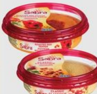
SABRA HUMMUS SELECTED VARIETIES 283 G 20095858_EA/ 20103117_EA