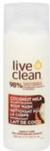
LIVE CLEAN BODY WASH SELECTED VARIETIES 500 ML 20862253_EA