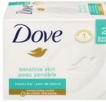
DOVE BAR SOAP 2X106 G, AXE SHOWERGEL OR HAIRCARE 473 ML, DEODORANT 76/85 G OR BODYSPRAY 113 G SELECTED VARIETIES 21220738_EA/21436066_EA