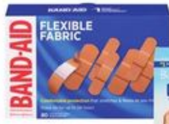
BAND-AID CHILDREN AND PREMIUM BANDAGES, POLYSPORIN OINTMENT OR DDROPS VITAMIN SUPPLEMENT SELECTED VARIETIES AND SIZES 20034059_EA 20380516001_EA