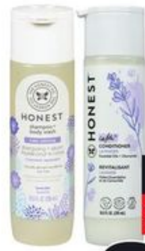
THE HONEST COMPANY SHAMPOO, CONDITIONER OR WASH SELECTED VARIETIES 250-355 ML 21303537_EA/21303553_EA