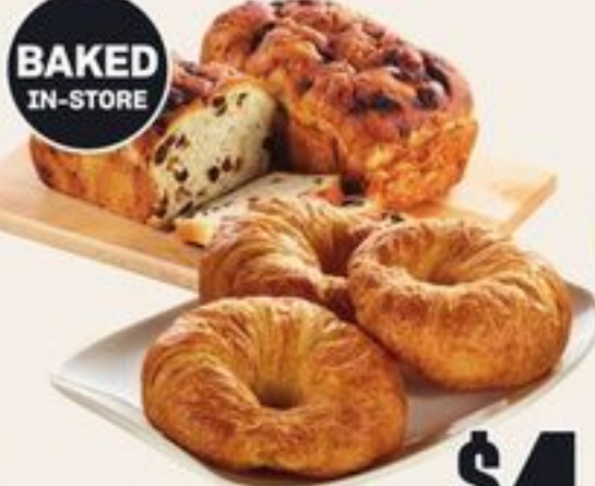
BAKED IN-STORE PLAIN CROISSANTS 6'S OR CINNAMON RAISIN BREAD 550 G 20729432_EA/21030153_EA