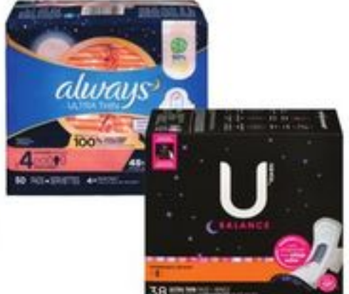
ALWAYS OR TAMPAX PADS, LINERS OR TAMPONS SELECTED VARIETIES 26-216'S 21019589_EA 21449590_EA