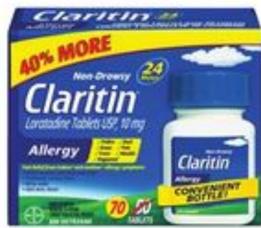
AERIUS 5 MG 40'S OR CLARITIN ALLERGY RELIEF TABLETS, LIQUID GELS OR CAPSULES 50-70'S SELECTED VARIETIES 20946006_EA