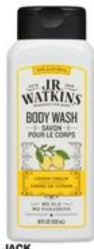
EVERY MAN JACK DEODORANT 88 G OR BODY WASH 500 ML OR J.R. WATKINS BODY WASH 532 ML OR LIQUID HAND SOAP REFILL 828 ML/1 L SELECTED VARIETIES 20968244_EA/21400051_EA