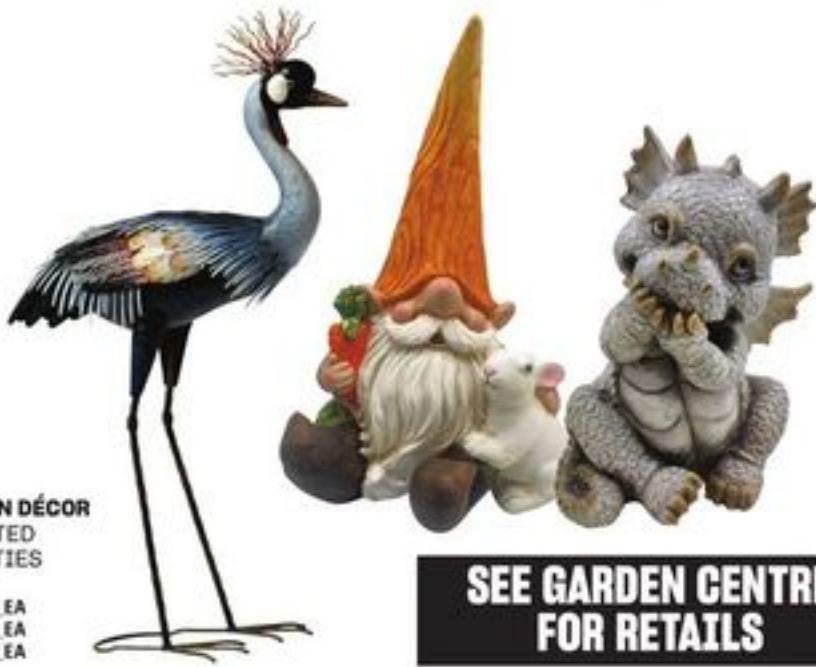
GARDEN DÉCOR SELECTED VARIETIES EACH 21570498_EA 21570439_EA 21570523_EA