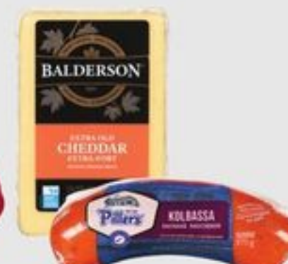
PILLER'S KOLBASSA 250/375 G OR BALDERSON CHEESE 250/280 G SELECTED VARIETIES 20308469_EA/21495455_EA