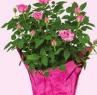
MOTHER'S DAY MINI ROSE 20284956_EA