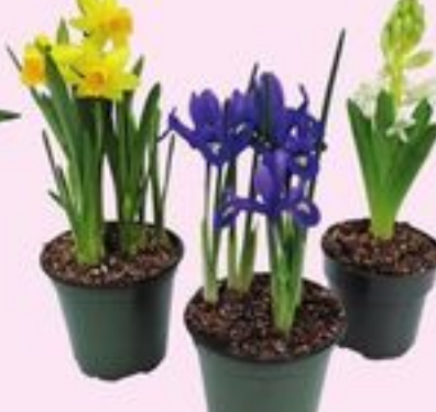
SPRING BULBS ASSORTED VARIETIES 4 INCH 20546496_EA