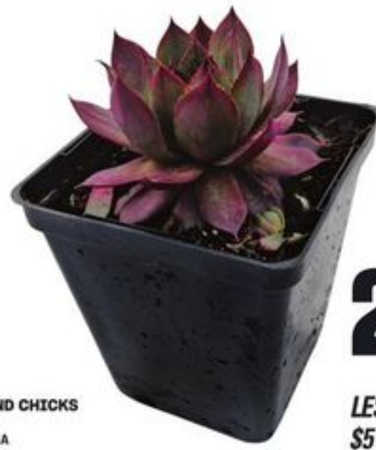
HENS AND CHICKS 9 CM 21350515_EA