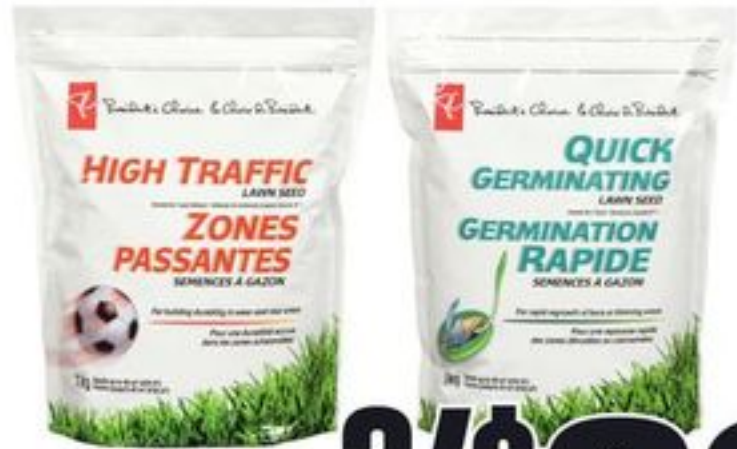
PC® GRASS SEED SELECTED VARIETIES 1 KG 21350471_EA/21350479_EA