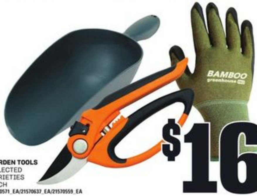
GARDEN TOOLS SELECTED VARIETIES EACH 21570571_EA/21570637_EA/21570559_EA