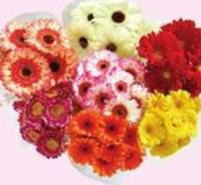
GERBERA DAISIES ASSORTED VARIETIES 21087796_EA