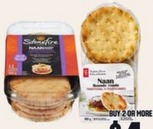
PC® NAAN ROUNDS ORIGINAL OR STONEFIRE CARAMELIZED ONION 20757871_EA/21594557_EA

BUY 2 OR MORE 3 50 EA. LESS THAN 2 $3.99 EA.