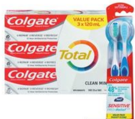
COLGATE TOTAL TOOTHPASTE 3'S, MANUAL TOOTHBRUSH 2'S, BATTERY TOOTHBRUSH , COLGATE TOTAL OR PRO RELIEF MOUTHWASH SELECTED VARIETIES AND SIZES 20124776002_EA/21166709_EA