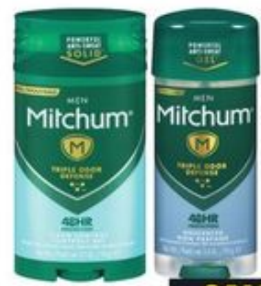
MITCHUM SOLID, GEL, ROLL ON OR ALUMINUM FREE DEODORANT SELECTED VARIETIES 45-96 G, 50 ML 2033695002_EA 20757875004_EA