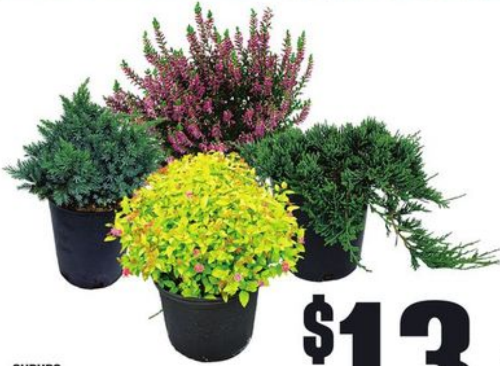
SHRUBS SELECTED VARIETIES 1 GALLON 20020362_EA/21095156_EA