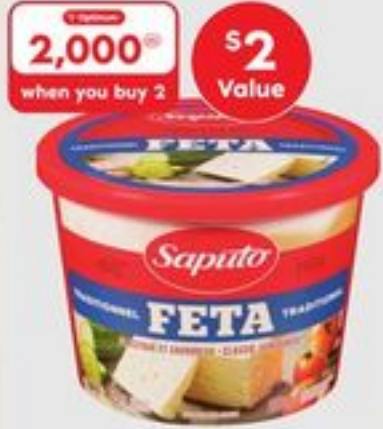
SAPUTO FETA SELECTED VARIETIES 170/200 G 20573975_EA

Members save $1.20 Optimum Members-Only Price 10 79 Non-members 11 99