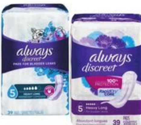
ALWAYS DISCREET 10-54'S OR TENA 12-48'S INCONTINENCE UNDERWEAR OR PADS SELECTED VARIETIES AND SIZES 20814896_EA 21033778_EA