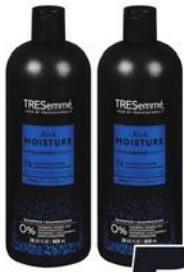
TRESEMME HAIR CARE OR STYLING SELECTED VARIETIES AND SIZES 21170103_EA/21571326_EA