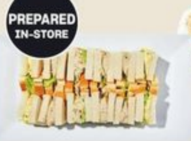
PREPARED IN-STORE CHICKEN, EGG OR TUNA SOFTY SANDWICHES 1.1 KG 21503465_EA

Great to go items plus applicable taxes.