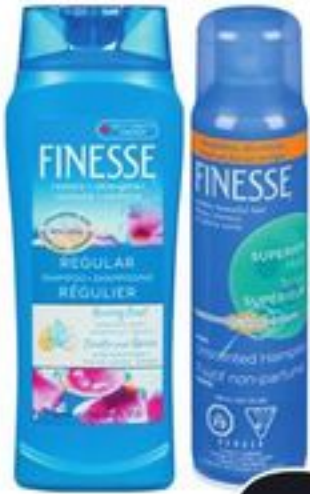
FINESSE HAIR CARE AND STYLING SELECTED VARIETIES AND SIZES 20306667004_EA/20308415002_EA 20312912004_EA/20318838_EA