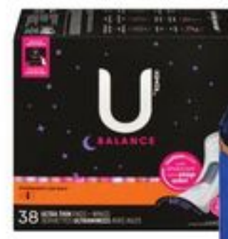
ALWAYS ULTRA THIN PADS SIZE 4, 50'S, TAMPAX PEARL REGULAR TAMPONS 50'S OR U BY KOTEX BALANCE ULTRA THIN PADS OR WINGS 38'S SELECTED VARIETIES AND SIZES 21374646_EA 21518478_EA