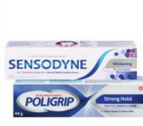
SENSODYNE OR PRONAMEL TOOTHPASTE, POLIDENT DENTURE TABLETS OR POLIGRIP DENTURE ADHESIVE SELECTED VARIETIES AND SIZES 20301179001_EA/20756075_EA