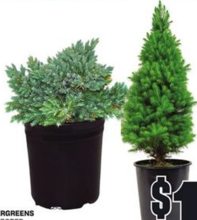
EVERGREENS SELECTED VARIETIES 1 GALLON 20020362_EA/21095156_EA