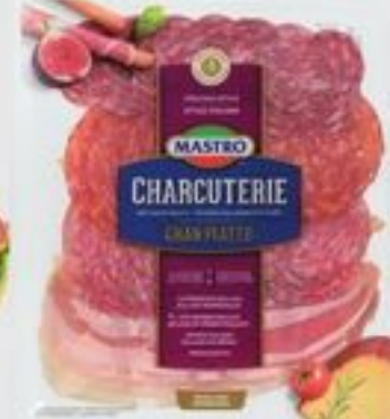
MASTRO TRIO PACKS SELECTED VARIETIES 150/250 G 21554465_EA