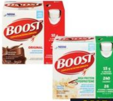
BOOST MEAL REPLACEMENT DRINKS SELECTED VARIETIES 4X325/6X237 ML 20304429002_C06 20986361_C06