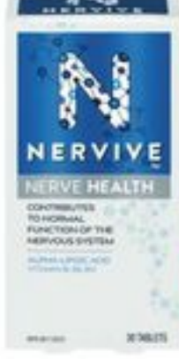
ALIGN PROBIOTIC CAPSULES, CHEWS GUMMIES 21-60'S OR NERVIVE NERVE HEALTH OR PAIN RELIEF 30'S SELECTED VARIETIES 21359037_EA 21465063_EA