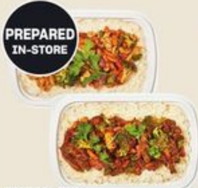
PREPARED IN-STORE GENERAL TAO CHICKEN, TERIYAKI CHICKEN, SZECHUAN BEEF OR BUTTER CHICKEN WITH RICE ENTRÉES 900 G 21533950_EA/21533951_EA