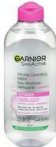
OLAY REGENERIST VITAMIN C MOISTURIZER OR GARNIER MICELLAR WATER SELECTED VARIETIES OR SIZES 21040515_EA/211411706002_EA