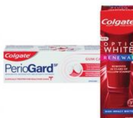
COLGATE OPTIC WHITE OR SENSITIVE PRO RELIEF TOOTHPASTE 70-133 ML, BATTERY TOOTHBRUSH, MANUAL TOOTHBRUSH, HELLO TOOTHPASTE 82-98 ML OR COLGATE PERIOGARD TOOTHPASTE 21517424_EA/21220587_EA