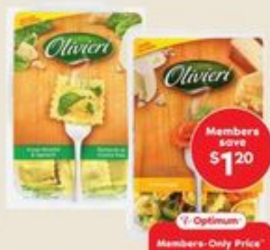
OLIVIERI FAMILY PACK PASTA SELECTED VARIETIES 540-700 G 20312412_EA/ 20915948_EA

Members save $1.20 Optimum Members-Only Price 10 79 Non-members 11 99