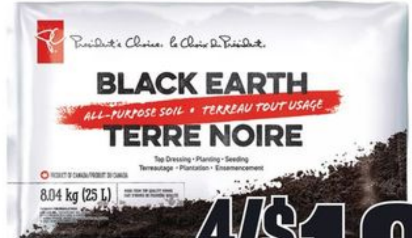
PC® BLACK EARTH SOIL 25 L 2135792_EA