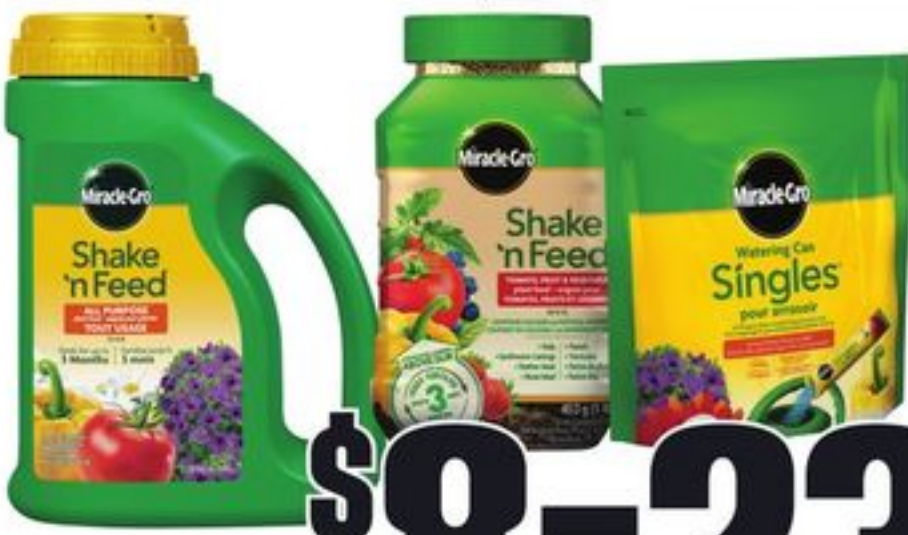
PLANT FOOD FERTILIZER SELECTED VARIETIES AND SIZES 21567431_EA/21157858_EA/21567705_EA