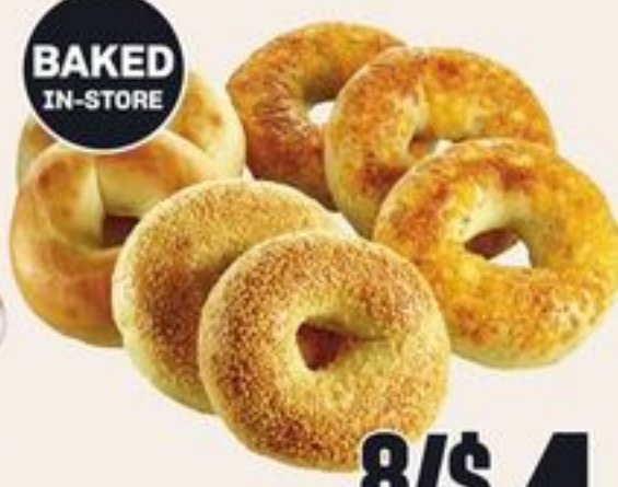
BAKED IN-STORE PREMIUM BULK BAGELS 20038964_EA