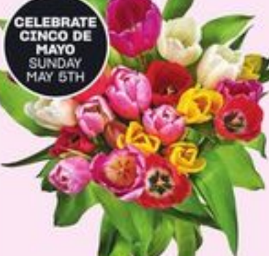
CELEBRATE CINCO DE MAYO SUNDAY MAY 5TH 15 STEM TULIPS 21593048_EA