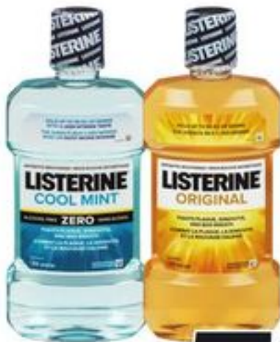
LISTERINE CLASSIC 1 L OR KIDS 500 ML MOUTHWASH SELECTED VARIETIES 20348438001_EA/21091207_EA