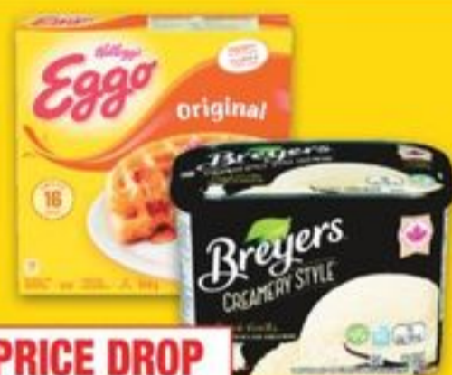
EGGO WAFFLES 16's or BREYERS CREAMERY STYLE ICE CREAM 1.66 L selected varieties, frozen gâteaux ou crème glacée 20097730004 SA/20344920004 SA