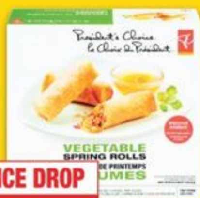
PC® SPRING ROLLS selected varieties, frozen 574 g rouleaux de printemps 20692094 SA