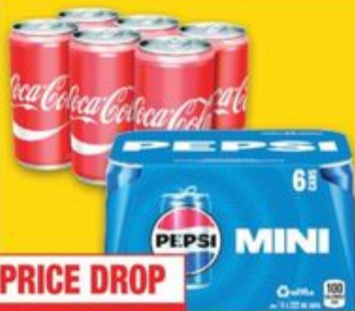
COCA-COLA or PEPSI SOFT DRINKS selected varieties 6x222 mL boissons gazeuses 20344288002 C06/20637340004 C06