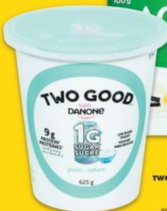
DANONE ACTIVIA 8% MIX & GO VANILLA 2% or TWO GOOD LOW SUGAR YOGURT selected varieties yogourt 2022384002 SA/21477313 SA