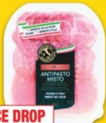
MARCANGELO SLICED DELI MEAT selected varieties 100 g viandes de charcuterie 20681202 SA