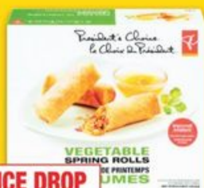
PC® SPRING ROLLS selected varieties, frozen 574 g rouleaux de printemps 20692094 SA