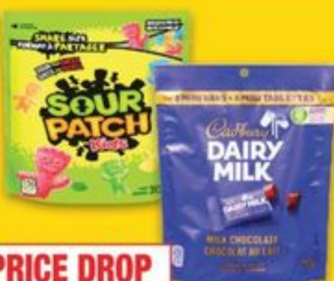
CADBURY POUCH or MAYNARDS CANDY selected varieties chocolat ou friandises 21101841 SA/21343809 SA