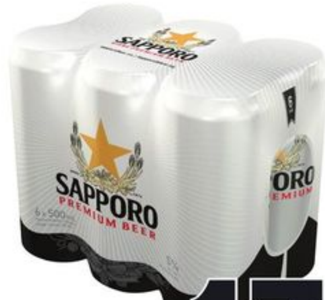
SAPPORO 6X500 ML CANS 21014346_C06