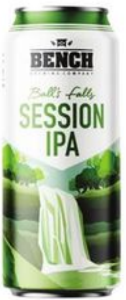
BALL'S FALLS SESSION IPA 473 ML CAN 21009874_EA