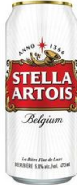
STELLA ARTOIS 473 ML CAN 21337003_EA