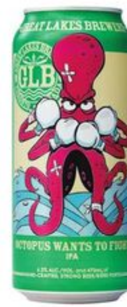
GLB OCTOPUS WANTS TO FIGHT IPA 473 ML CAN 21185170_EA