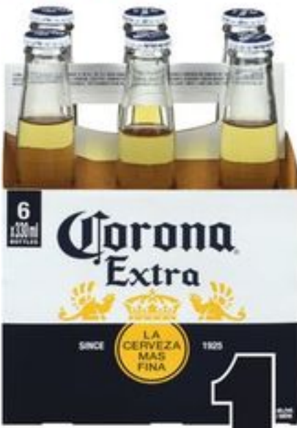
CORONA EXTRA 6X330 ML BOTTLES 21338460_C06