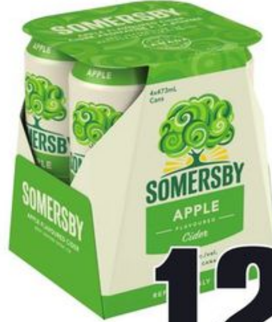
SOMERSBY APPLE CIDER 4X473 ML CANS 21313146_C04