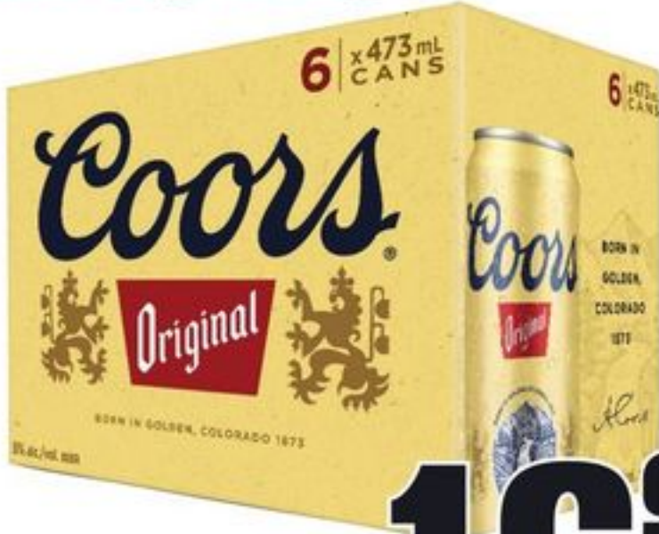
COORS ORIGINAL 6X473 ML CANS 21294687_C06