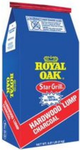
STAR GRILL LUMP CHARCOAL 8.8 LB 20773869_EA