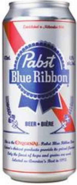
PABST BLUE RIBBON 473 ML CAN 20954813_EA