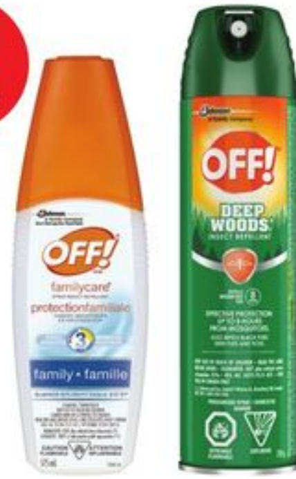
OFF! OR RAID INSECT REPELLENT SELECTED VARIETIES 20001279002_EA/20158572_EA

Optimum Members-Only Price™ $69 Non-members $79