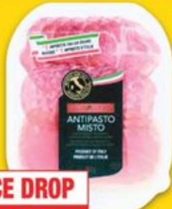
MARCANGELO SLICED DELI MEAT selected varieties 100 g viandes de charcuterie 20681202 SA