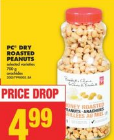
PC® DRY ROASTED PEANUTS selected varieties 700 g arachides 2005799002 SA