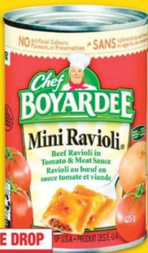
CHEF BOYARDEE selected varieties 418/425 g pâtes 2031230001 SA