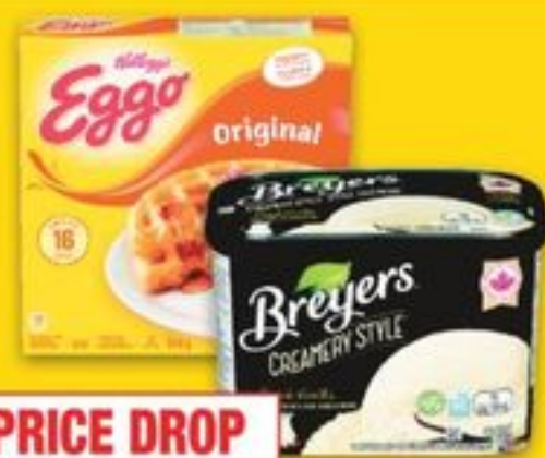
EGGO WAFFLES 16's or BREYERS CREAMERY STYLE ICE CREAM 1.66 L selected varieties, frozen gâteaux ou crème glacée 20097730004 SA/20344920004 SA