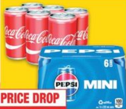
COCA-COLA or PEPSI SOFT DRINKS selected varieties 6x222 mL boissons gazeuses 20344288002 C06/20637340004 C06