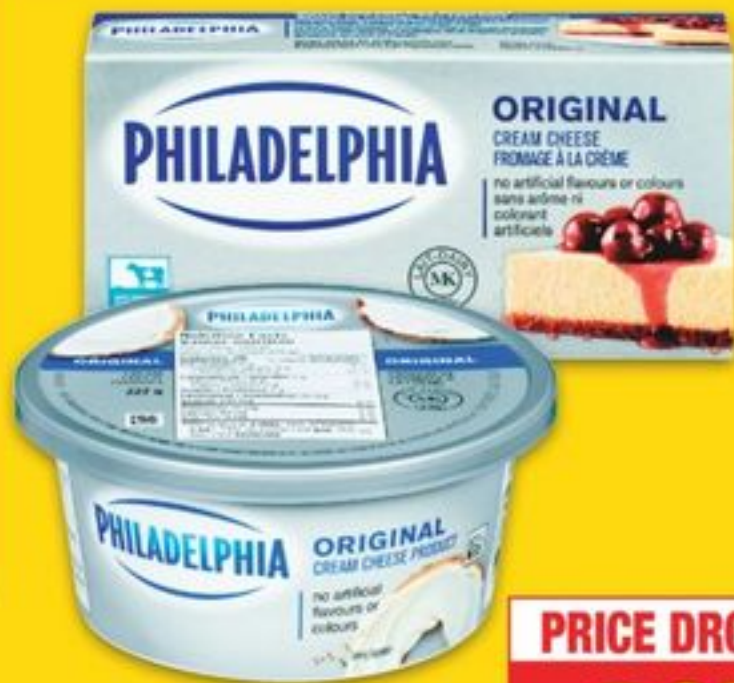
PHILADELPHIA CREAM CHEESE PRODUCT selected varieties 227/250 g produit de fromage à la crème 20641267 SA/2064492610 SA