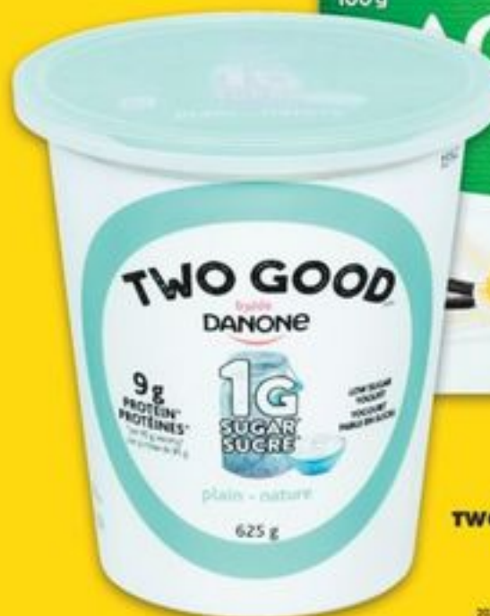
DANONE ACTIVIA 8% MIX & GO VANILLA 2% or TWO GOOD LOW SUGAR YOGURT selected varieties yogourt 2022384002 SA/21477313 SA