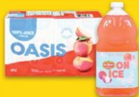
OASIS JUICE or ARIZONA ICED TEA, ALLEN'S APPLE or CRANBERRY COCKTAIL or DEL MONTE ON ICE REFRESHERS 1.89 L selected varieties jus ou thé glacé ou boissons 20313744002 SA/21375061 SA