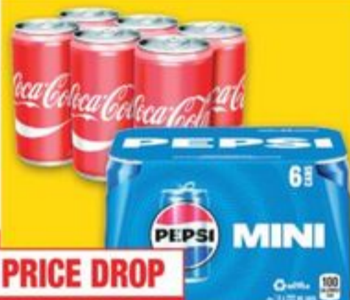
COCA-COLA or PEPSI SOFT DRINKS selected varieties 6x222 mL boissons gazeuses 20344284002 C06/20637340004 C06