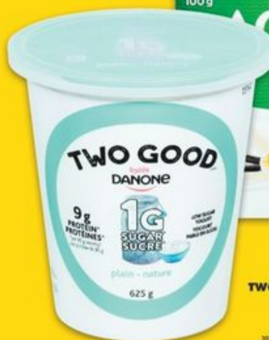
DANONE ACTIVIA 8% MIX & GO VANILLA 2% or TWO GOOD LOW SUGAR YOGURT selected varieties yogourt 2022384002 SA/21477313 SA