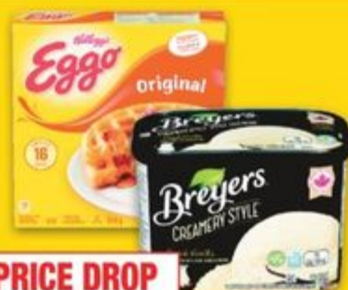
EGGO WAFFLES 16's or BREYERS CREAMERY STYLE ICE CREAM 1.66 L selected varieties, frozen gâteaux ou crème glacée 20099730004 SA/20344920004 SA