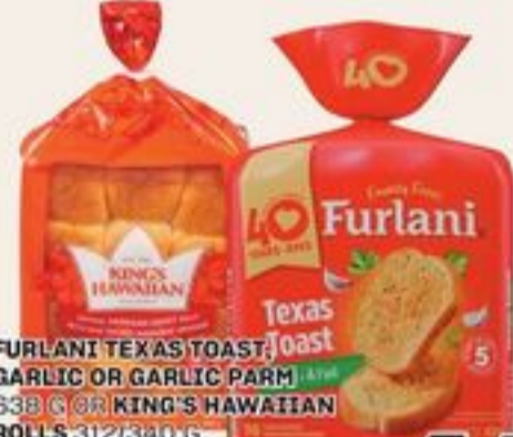
FURLANI TEXAS TOAST, GARLIC OR GARLIC PARM ROLLS 312/340 G SELECTED VARIETIES TEXAS TOAST À L'AIL OU AIL ET PARMESAN FURLANI OU PETITS PAINS KING'S HAWAIIAN 20041579_EA/21479970_EA