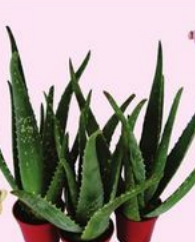
ALOE VERA 4 INCH POT ALOËS 21047366_EA