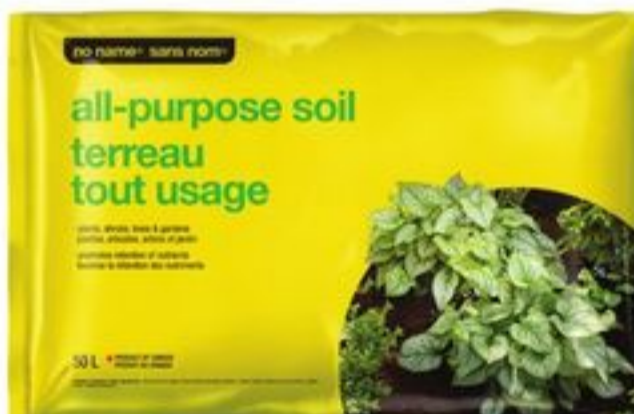
NO NAME® ALL-PURPOSE SOIL 50 L 21358664_EA