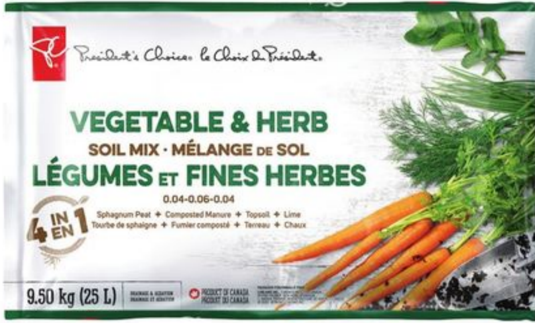
PC® VEGETABLE AND HERB SOIL 25 L 21349109_EA