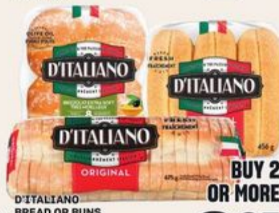
D'ITALIANO BREAD OR BUNS SELECTED VARIETIES AND SIZES PAIN OU PETITS PAINS D'ITALIANO 20038335_EA/20627101_EA/20627103_EA

BUY 2 OR MORE 3 25 LESS THAN 2 $3.99 EA.