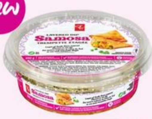
PC® SAMOSA LAYERED DIP 350 G 21588729_EA