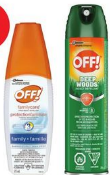
OFF! OR RAID INSECT REPELLENT SELECTED VARIETIES 20001279002_EA/20158572_EA