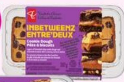
PC® INBETWEENZ™ DESSERT SQUARE SELECTED VARIETIES 312 G 21592641_EA