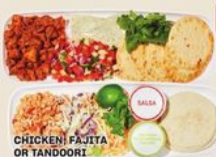
CHICKEN, FAJITA OR TANDOORI TACO TRAYS SELECTED VARIETIES 1-1.1 KG PLATEAUX DE TACOS AU POULET, FAJITA OU TANDOORI 21395977_EA/21595419_EA

Great to go items plus applicable taxes.