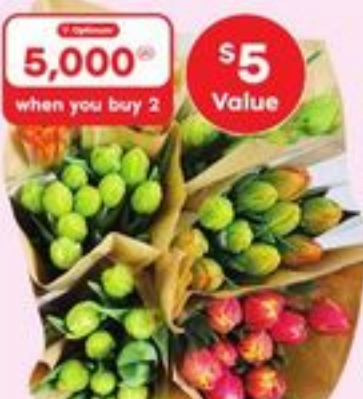
5,000 99 when you buy 2 $5 Value