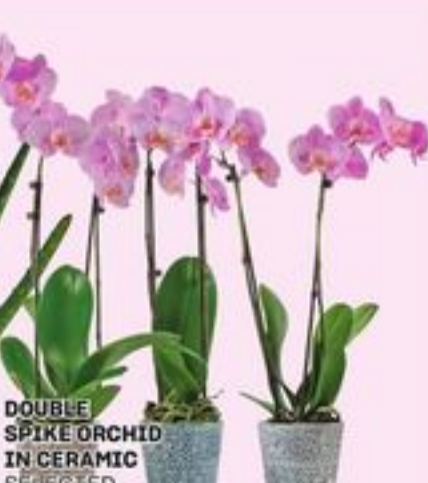
DOUBLE SPIKE ORCHID IN CERAMIC SELECTED VARIETIES EACH ORCHIDÉE À DEUX TIGES DANS UN POT EN CÉRAMIQUE 20293541_EA