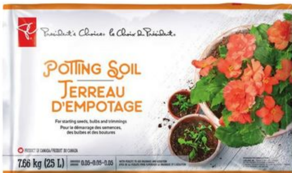
PC® POTTING SOIL 25 L 21349090_EA