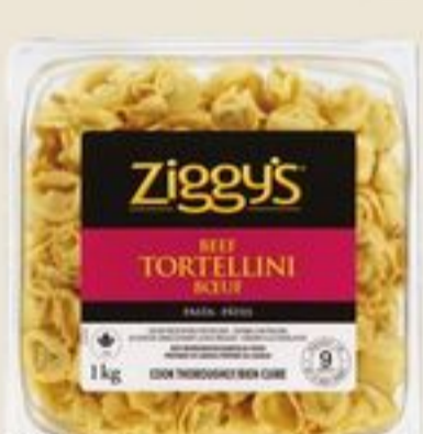
ZIGGY'S® PASTA SELECTED VARIETIES 1 KG PÂTES ZIGGY'S® 21521156_EA