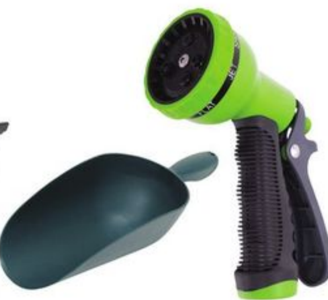
GARDEN TOOLS AND WATERING ACCESSORIES SELECTED VARIETIES AND STYLES EACH 21570571_EA 21570637_EA