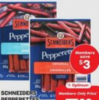
SCHNEIDERS PEPPERETTES SELECTED VARIETIES 250-375 G PEPPERETTES SCHNEIDERS 20976093_EA/20976110_EA