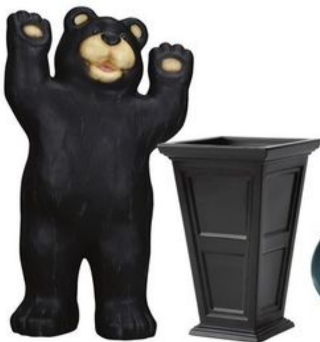
GARDEN DÉCOR AND POTS SELECTED SIZES EACH 21570498_EA 21570439_EA