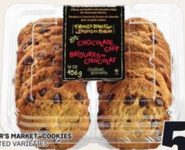
FARMER'S MARKET™ COOKIES SELECTED VARIETIES 12'S BISCUITS DÉLICÉS DU MARCHÉ™ 20566774_EA