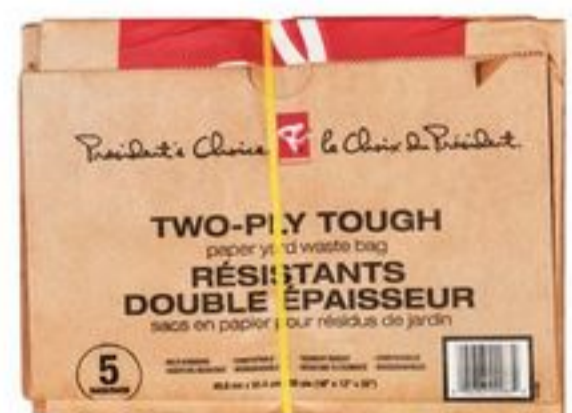
PC® YARD WASTE BAGS 5'S 20429980_EA