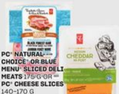
PC® NATURAL CHOICE™ OR BLUE MENU™ SLICED DELI MEATS 175 G OR PC® CHEESE SLICES 140-170 G SELECTED VARIETIES CHARCUTERIES TRANCHÉES PC™ LE CHOIX NATUREL™ OU MENU BLEU™ OU TRANCHES DE FROMAGE PC™ 20216643_EA/20310580_EA