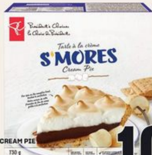
PC® S'MORES CREAM PIE FROZEN 730 G TARTE À LA CRÈME S'MORES PC™ 21574358_EA