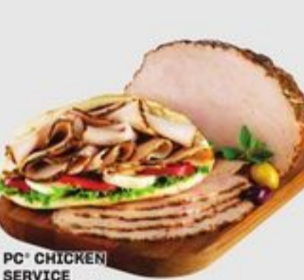
PC® CHICKEN SERVICE CASE MEATS SELECTED VARIETIES POULET PC™ POUR LE COMPTOIR DE SERVICE 20301114_KG