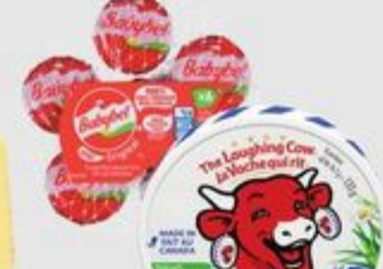
BABYBEL 6'S OR THE LAUGHING COW 8'S SELECTED VARIETIES BABYBEL OU LA VACHE QUI RIT 20319107_EA/20574332_EA