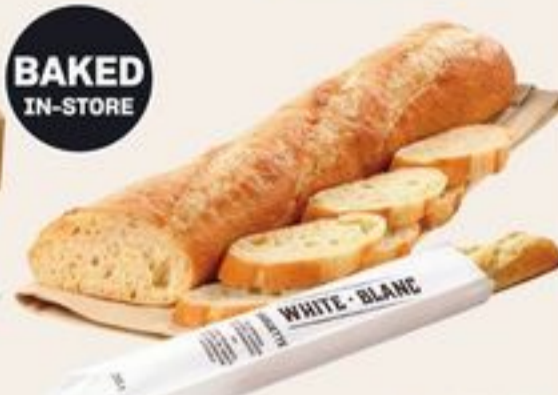
BAKED IN-STORE BAGUETTE WHITE OR WHOLE WHEAT 255 G BAGUETTE 21529211_EA