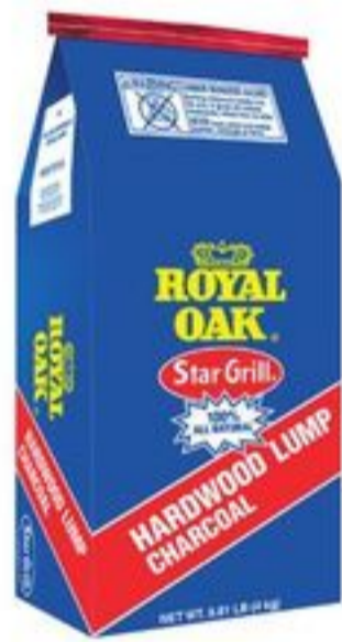
STAR GRILL LUMP CHARCOAL 8.8 LB 20773869_EA