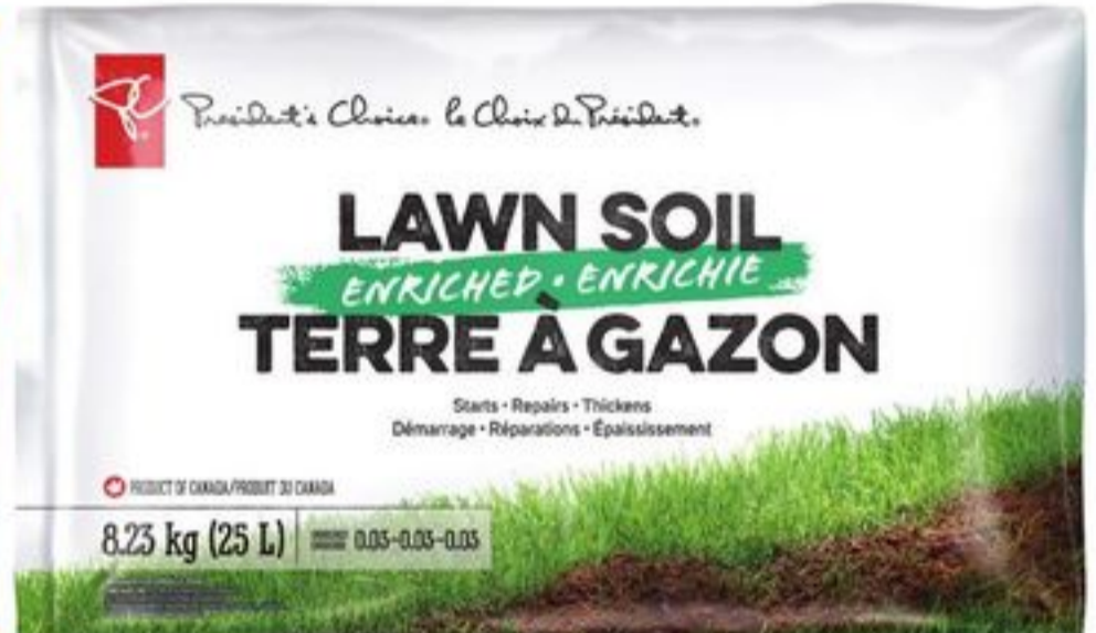
PC® ENRICHED LAWN SOIL 25 L 21349080_EA