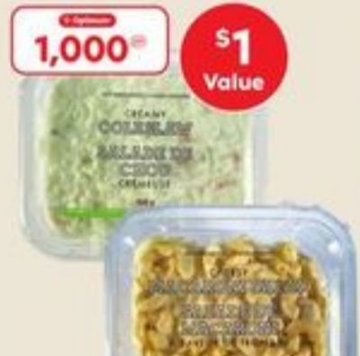
PREMIUM SALADS 425-454 G SALADES DE QUALITÉ SUPÉRIEURE 21544608_EA/21544611_EA