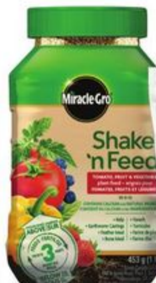
PLANT FOOD FERTILIZER OR GRASS SEED SELECTED VARIETIES AND SIZES 21567431_EA 21359480_EA