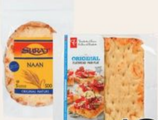
PC® FLATBREAD 220/300 G OR SURAJ® NAAN 5'S SELECTED VARIETIES PAIN PLAT PC™ OU NAAN SURAJ® 20910042_EA/21051353_EA