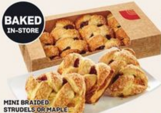
BAKED IN-STORE MINI BRAIDED STRUDELS OR MAPLE PECAN DANISH SELECTED VARIETIES 4'S MINI-CHAUSSON TRESSÉ OU DANOISÉ ÉRABLE ET PACANES 21464142_EA/21464199_EA