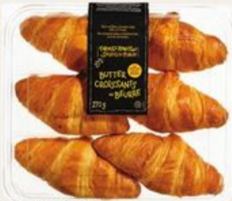
FARMER'S MARKET™ BUTTER CROISSANTS SELECTED VARIETIES 6'S CROISSANTS AU BEURRE DÉLICÉS DU MARCHÉ™ 20975943_EA