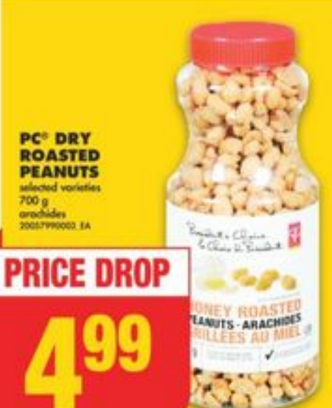
PC® DRY ROASTED PEANUTS selected varieties 700 g arachides 2002799002 SA