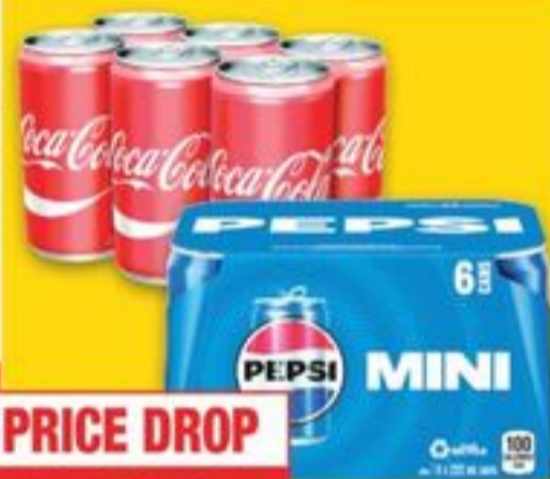
COCA-COLA or PEPSI SOFT DRINKS selected varieties 6x222 mL boissons gazeuses 20344288002 C06/20637340004 C06