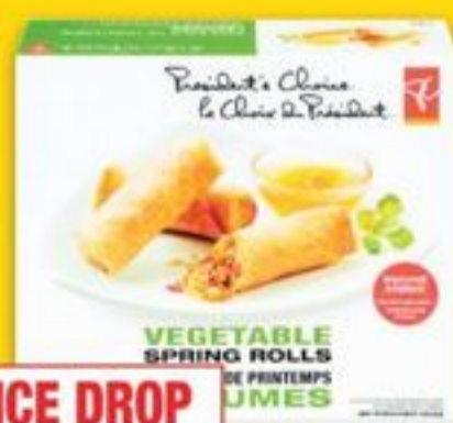
PC® SPRING ROLLS selected varieties, frozen 574 g rouleaux de printemps 20692094 SA