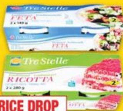
TRE STELLE CHEESE TWIN PACK selected varieties 240-560 g fromage 21100062 SA/21100064 SA