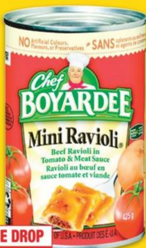
CHEF BOYARDEE selected varieties 418/425 g pâtes 2031230001 SA