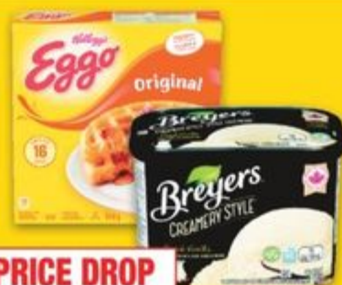
EGGO WAFFLES 16's or BREYERS CREAMERY STYLE ICE CREAM 1.66 L selected varieties, frozen gâteaux ou crème glacée 20097730004 SA/20344920004 SA