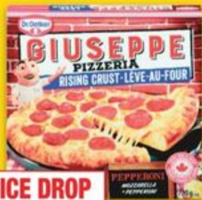
GIUSEPPE THIN CRUST or RISING CRUST PIZZA selected varieties, frozen 439-785 g pizza 21106361 SA