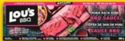
LOU'S PORK BACK RIBS selected varieties, frozen 680 g côtes de dos 21320777 SA