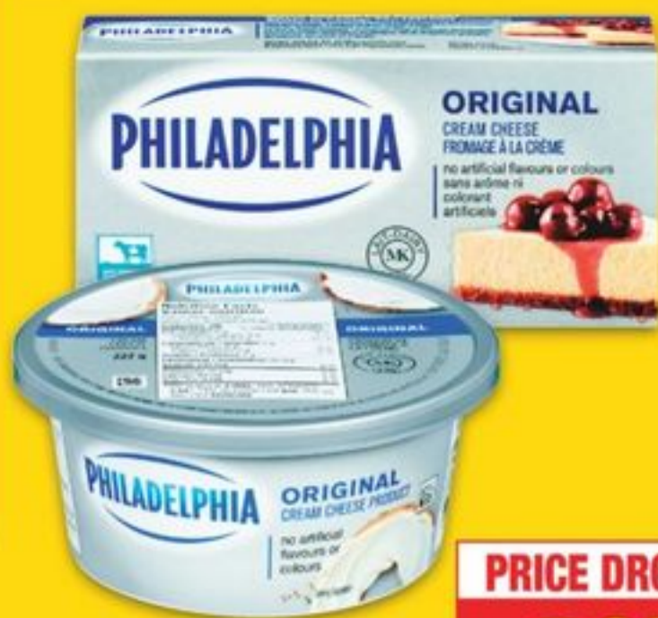
PHILADELPHIA CREAM CHEESE PRODUCT selected varieties 227/250 g produit de fromage à la crème 20641267 SA/2064492610 SA