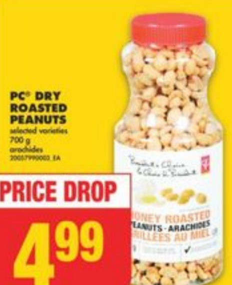
PC® DRY ROASTED PEANUTS selected varieties 700 g arachides 2005799002 SA