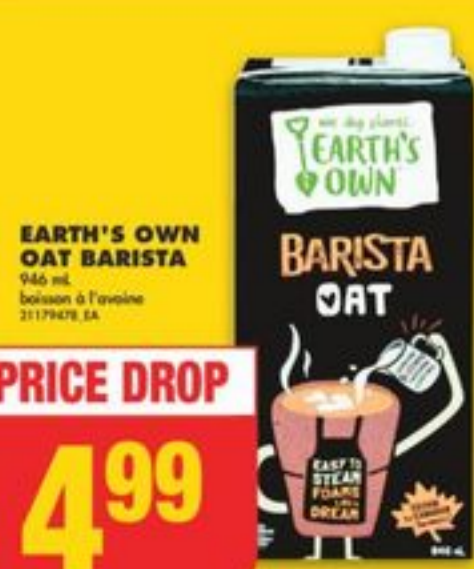
EARTH'S OWN OAT BARISTA 946 mL boisson à l'avoine 21179478 SA