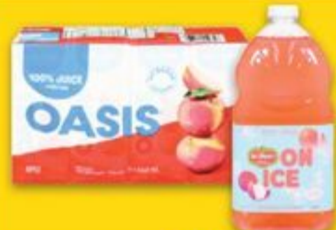
OASIS JUICE or ARIZONA ICED TEA, ALLEN'S APPLE or CRANBERRY COCKTAIL or DEL MONTE ON ICE REFRESHERS 1.89 L selected varieties jus ou thé glacé ou boissons 20313744002 SA/21375061 SA