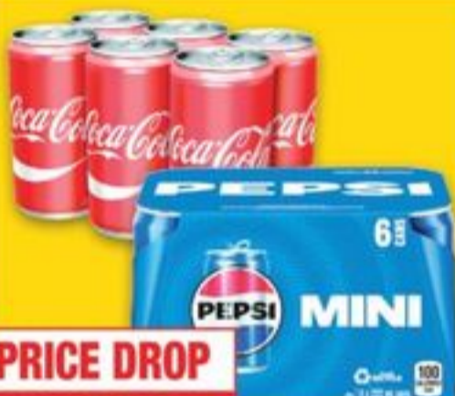
COCA-COLA or PEPSI SOFT DRINKS selected varieties 6x222 mL boissons gazeuses 20344288002 C06/20637340004 C06