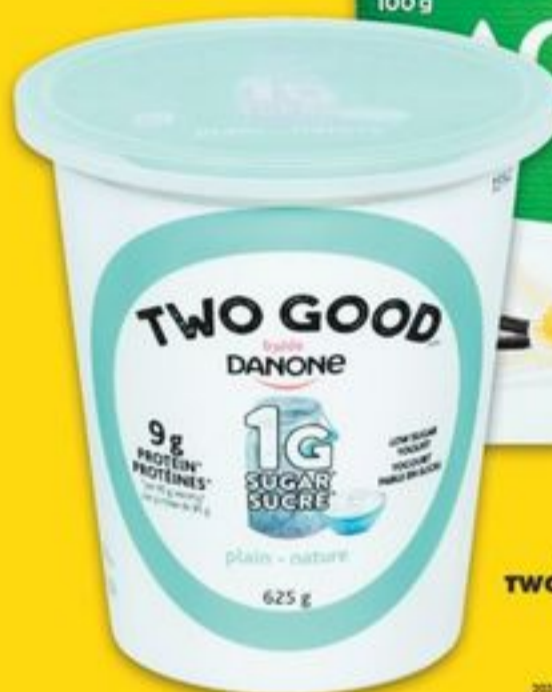
DANONE ACTIVIA 8% MIX & GO VANILLA 2% or TWO GOOD LOW SUGAR YOGURT selected varieties yogourt 2022384002 SA/21477313 SA