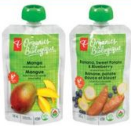
PC® ORGANICS BABY FOOD POUCHES SELECTED VARIETIES, 128 ML