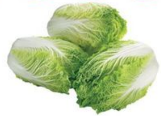
NAPA PRODUCT OF MEXICO 20015029001_KG