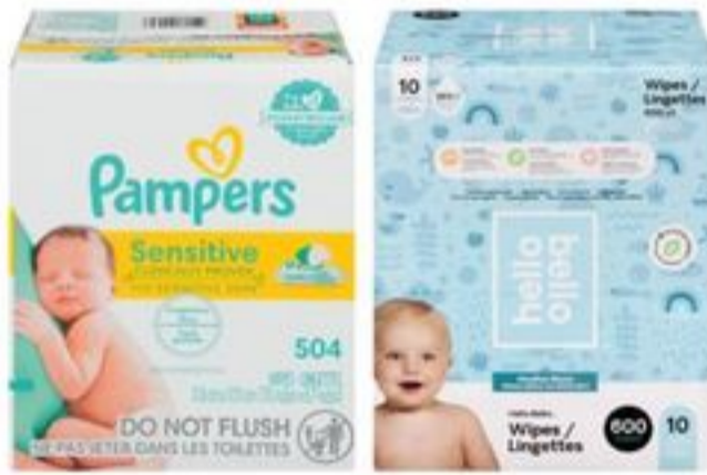
PAMPERS OR HELLO BELLO 9/10X BABY WIPES SELECTED VARIETIES 336-600'S