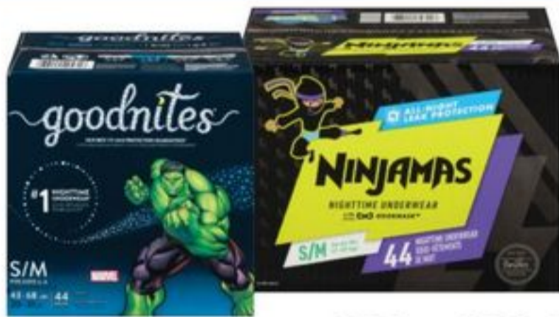
NINJAMAS OR GOODNITES NIGHTTIME UNDERWEAR SELECTED VARIETIES 28-44'S