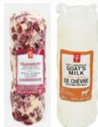
PC® GOAT CHEESE LOGS SELECTED VARIETIES, 300 G