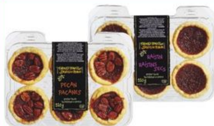
FARMER'S MARKET™ HOMESTYLE TARTS SELECTED VARIETIES, 6'S