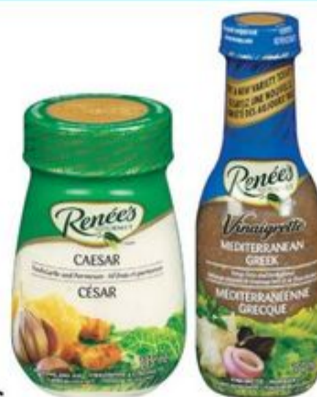
RENÉE'S DRESSING SELECTED VARIETIES, PRODUCT OF CANADA, 350 ML