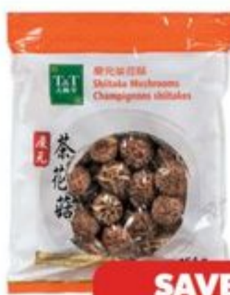
T&T® DRIED SHIITAKE MUSHROOMS 454 G 21426418_EA