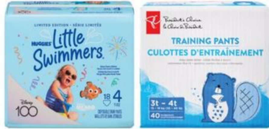
PC® TRAINING PANTS 20-44'S OR HUGGIES LITTLE SWIMMERS SWIM DIAPERS 17-20'S SELECTED VARIETIES