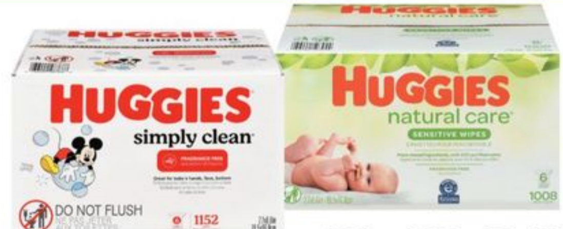
HUGGIES 16X BABY WIPES SELECTED VARIETIES 960-1152'S