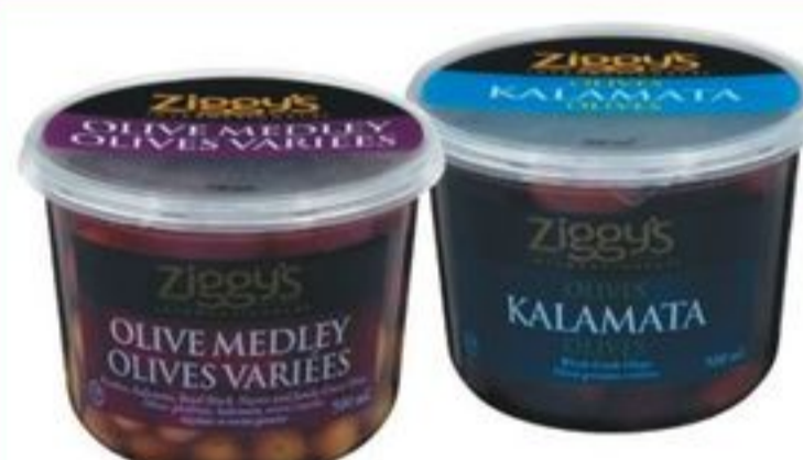
ZIGGY'S® OLIVES SELECTED VARIETIES, 500 ML