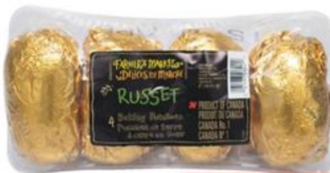
FARMER'S MARKET™ BAKING POTATOES PRODUCT OF U.S.A. NO. 1 GRADE, 4'S