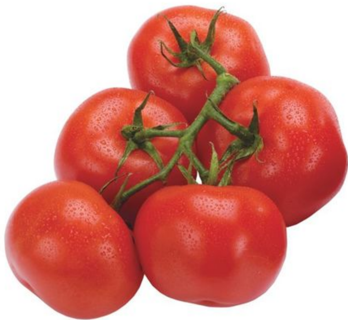
TOMATOES ON THE VINE PRODUCT OF ONTARIO