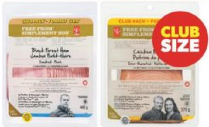
PC® FREE FROM® SLICED DELI MEAT SELECTED VARIETIES 375/400 G