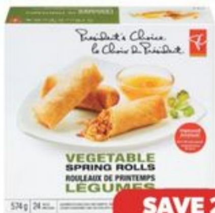
PC® SPRING ROLLS SELECTED VARIETIES FROZEN, 574 G