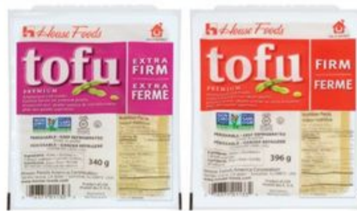
HOUSE FOODS TOFU SELECTED VARIETIES, 340/396 G 21315424_EA/21315429_EA