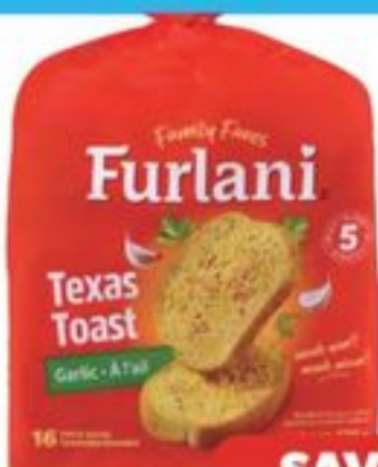
FURLANI TEXAS TOAST SELECTED VARIETIES, 16'S