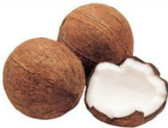
COCONUT PRODUCT OF INDIA 20005774001_EA