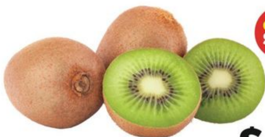
KIWI PRODUCT OF GREECE, 2 LB