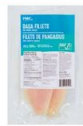
PMC BASA FILLETS, 400 G OR ANCHOR'S BAY MUSSEL MEAT 340 G OR BASA FILLETS 400 G FROZEN 20432307_EA