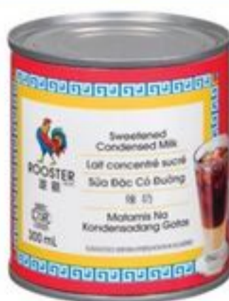
ROOSTER™ SWEET CONDENSED MILK 300 ML 20126907_EA