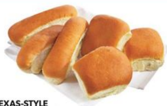
TEXAS-STYLE HAMBURGER OR HOT DOG BUNS 8'S OR BRIOCHE HAMBURGER BUNS 4'S BAKE IN-STORE SELECTED VARIETIES