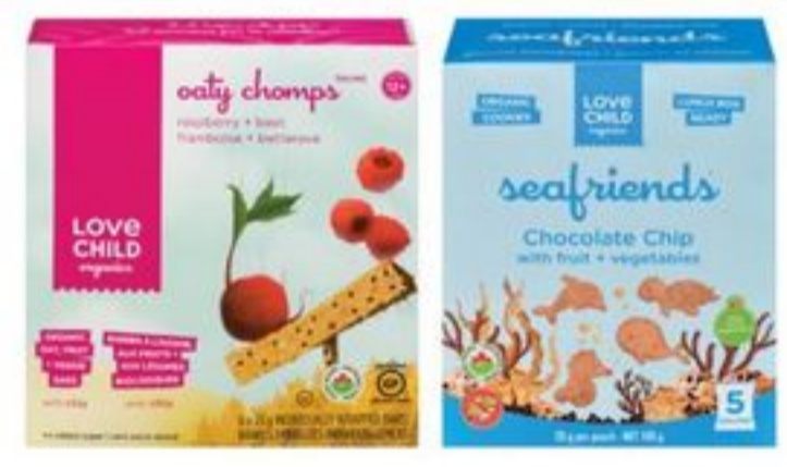
LOVE CHILD ORGANICS OATY CHOMPS OR SEAFRIENDS BABY SNACKS SELECTED VARIETIES, 100-140 G