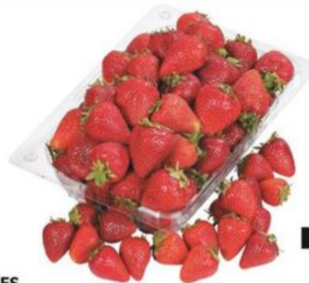
STRAWBERRIES PRODUCT OF U.S.A., 2 LB CLAMSHELL