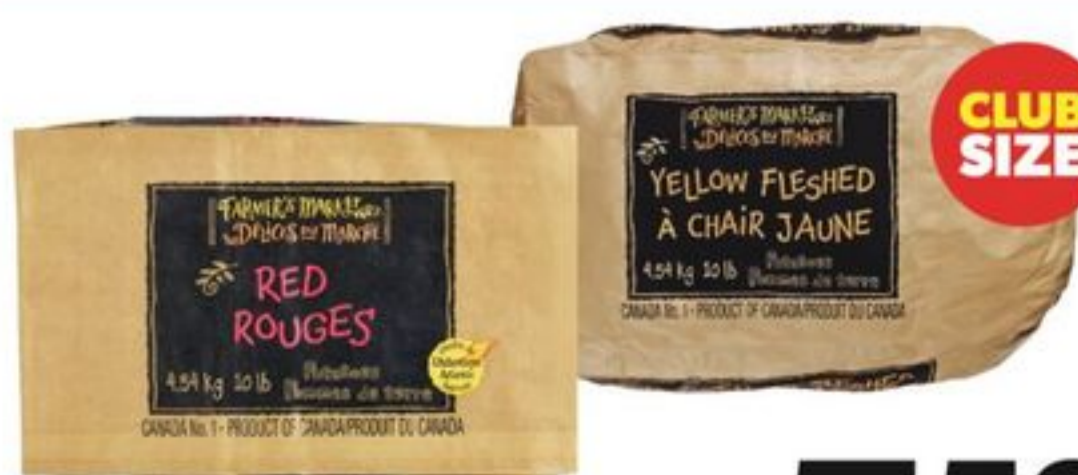
FARMERS MARKET™ RED OR YELLOW POTATOES PRODUCT OF CANADA, CANADA NO. 1 GRADE, 10 LB BAG