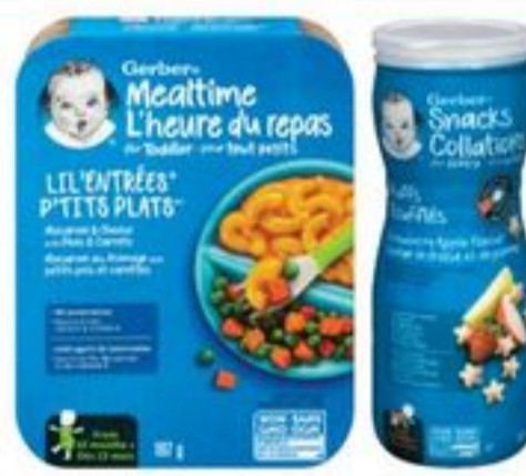
GERBER BABY SNACKS 42-155 G OR ENTRÉES 187/192 G