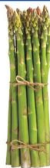
ASPARAGUS PRODUCT OF ONTARIO, CANADA NO. 1 GRADE