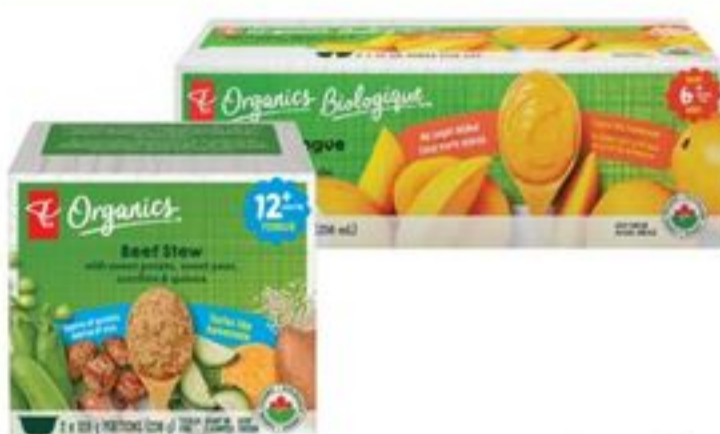
PC® ORGANICS FROZEN BABY FOOD SELECTED VARIETIES 8X32 ML/2X128 G