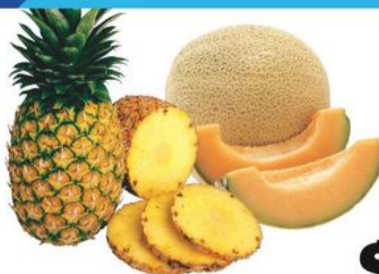
CANTALOUPE PRODUCT OF GUATEMALA OR PINEAPPLE PRODUCT OF COSTA RICA