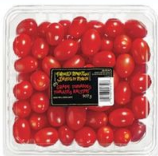
FARMER'S MARKET™ GRAPE TOMATOES PRODUCT OF MEXICO, 907 G