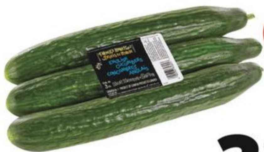
FARMER'S MARKET™ ENGLISH CUCUMBERS PRODUCT OF ONTARIO, 3'S