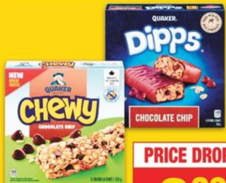
QUAKER DIPPS or CHEWY GRANOLA BARS selected varieties 120-156 g barres granola 30847382 EA/21337966 EA