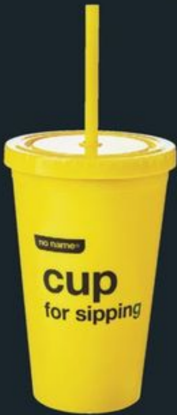
NO NAME® TO-GO TUMBLER 21294636, EA