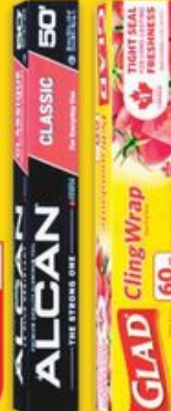
ALCAN 50' GLAD Cling Wrap 60'