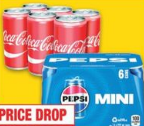
COCA-COLA or PEPSI SOFT DRINKS selected varieties 6x222 mL boissons gazeuses 2034428002 C06/20637340004 C06