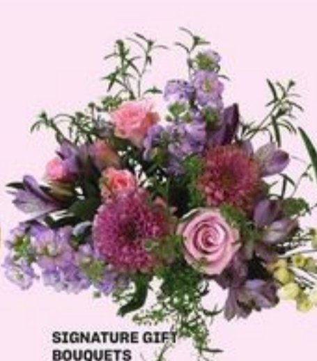
SIGNATURE GIFT BOUQUETS SELECTED VARIETIES BOUQUETS-CADEAUX SIGNATURE 21087812_EA/21087813_EA