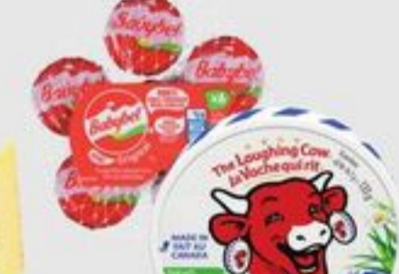
BABYBEL 6'S OR THE LAUGHING COW 8'S SELECTED VARIETIES BABYBEL OU LA VACHE QUI RIT 20319107_EA/20574332_EA