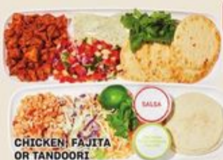
CHICKEN, FAJITA OR TANDOORI TACO TRAYS SELECTED VARIETIES 1-1.1 KG PLATEAUX DE TACOS AU POULET, FAJITA OU TANDOORI 21395977_EA/21595419_EA

Great to go items plus applicable taxes.