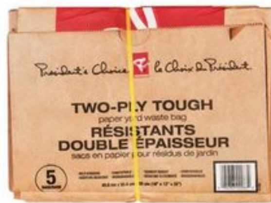
PC® YARD WASTE BAGS 5'S 20429980_EA