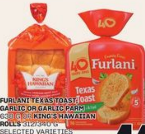
FURLANI TEXAS TOAST, GARLIC OR GARLIC PARM ROLLS 312/340 G SELECTED VARIETIES TEXAS TOAST À L'AIL OU AIL ET PARMESAN FURLANI OU PETITS PAINS KING'S HAWAIIAN 20041579_EA/21479970_EA