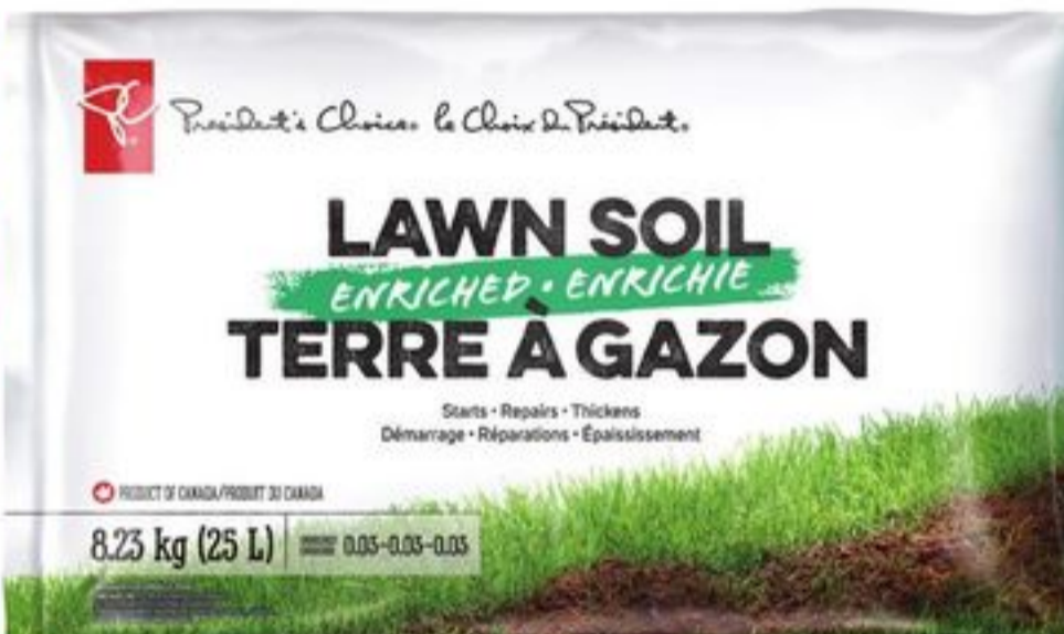
PC® ENRICHED LAWN SOIL 25 L 21349080_EA