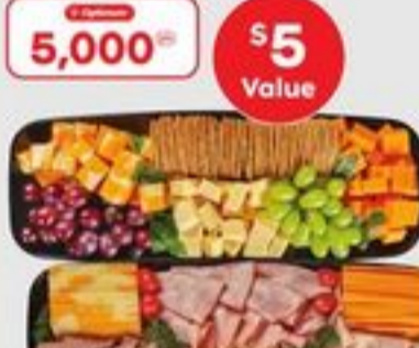
PARTY PLATTERS SELECTED VARIETIES 696 G/1.8 KG PLATEAUX DE CÉLÉBRATION 21217521_EA/21217522_EA