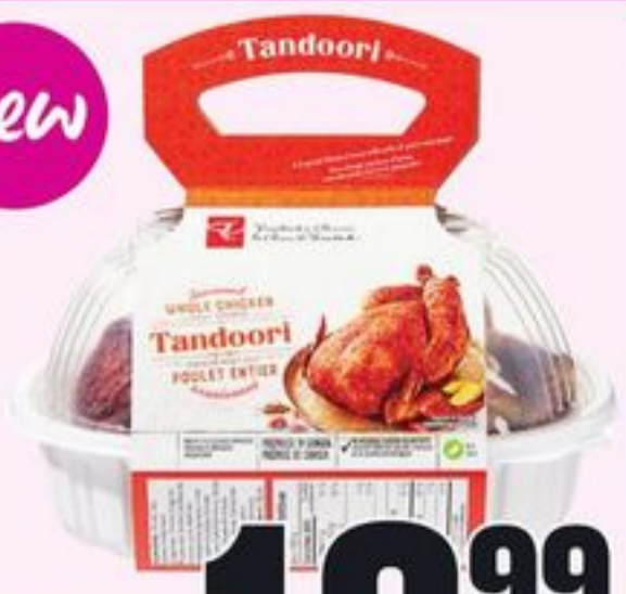
PC® TANDORI SEASONED FULLY COOKED WHOLE CHICKEN 900 G 21587735_EA