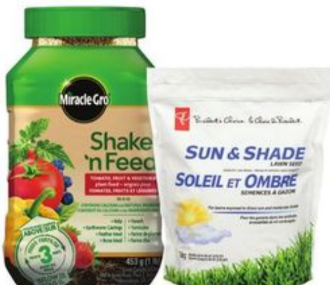
PLANT FOOD FERTILIZER OR GRASS SEED SELECTED VARIETIES AND SIZES 21567431_EA 21359480_EA