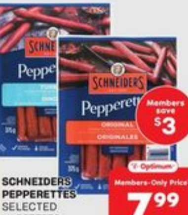
SCHNEIDERS PEPPERETTES SELECTED VARIETIES 250-375 G PEPPERETTES SCHNEIDERS 20976093_EA/20976110_EA