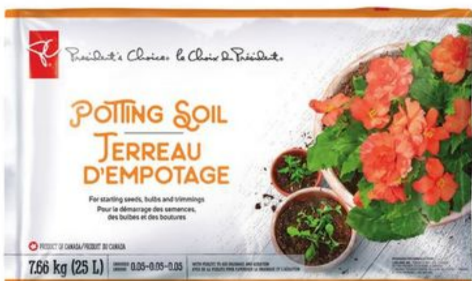
PC® POTTING SOIL 25 L 21349090_EA