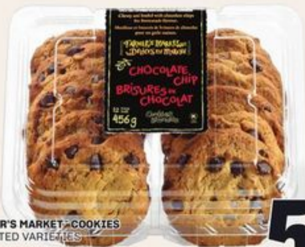
FARMER'S MARKET™ COOKIES SELECTED VARIETIES 12'S BISCUITS DÉLICÉS DU MARCHÉ™ 20566774_EA