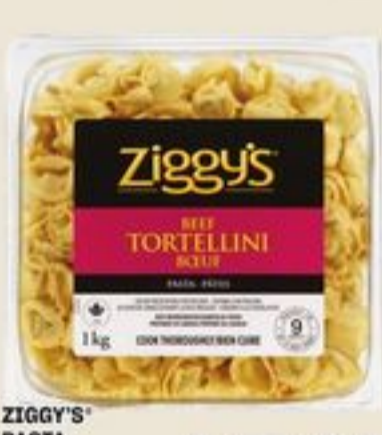
ZIGGY'S® PASTA SELECTED VARIETIES 1 KG PÂTES ZIGGY'S® 21521156_EA