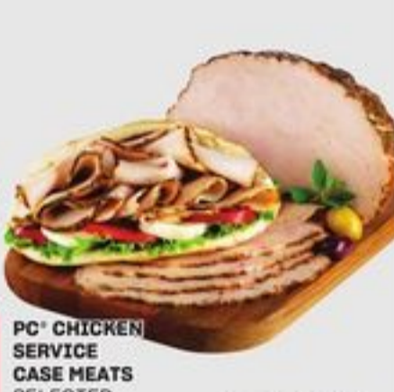
PC® CHICKEN SERVICE CASE MEATS SELECTED VARIETIES POULET PC™ POUR LE COMPTOIR DE SERVICE 20301114_KG