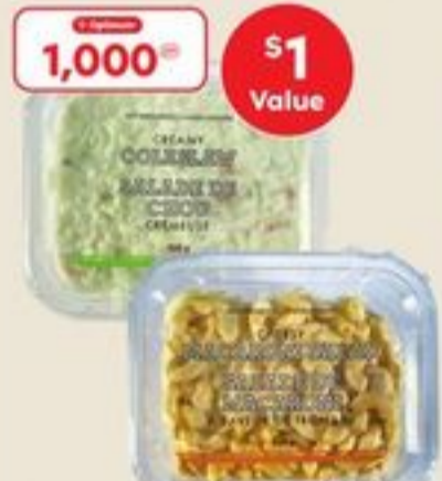
PREMIUM SALADS 425-454 G SALADES DE QUALITÉ SUPÉRIEURE 21544608_EA/21544611_EA