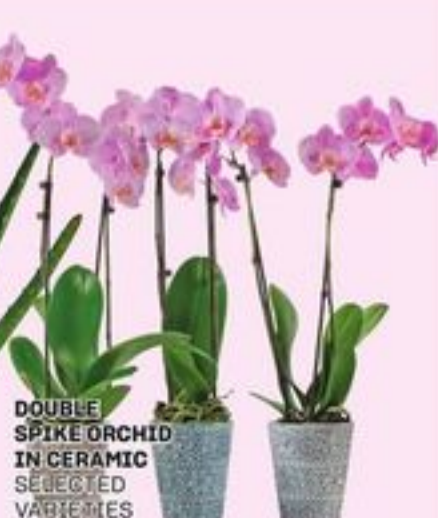
DOUBLE SPIKE ORCHID IN CERAMIC SELECTED VARIETIES EACH ORCHIDÉE À DEUX TIGES DANS UN POT EN CÉRAMIQUE 20293541_EA