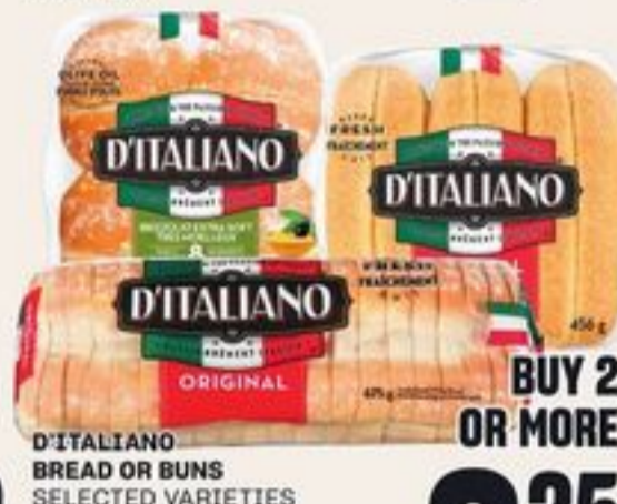
D'ITALIANO BREAD OR BUNS SELECTED VARIETIES AND SIZES PAIN OU PETITS PAINS D'ITALIANO 20038335_EA/20627101_EA/20627103_EA

BUY 2 OR MORE 3 25 LESS THAN 2 $3.99 EA.