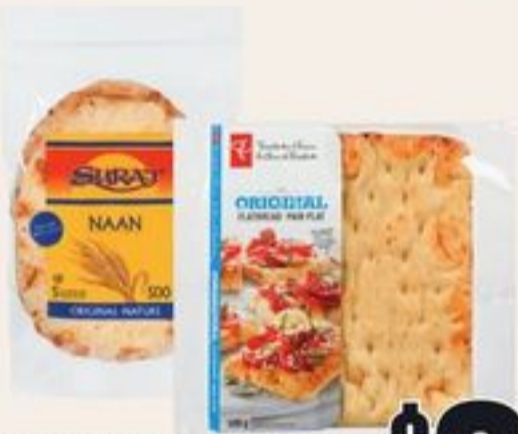
PC® FLATBREAD 220/300 G OR SURAJ® NAAN 5'S SELECTED VARIETIES PAIN PLAT PC™ OU NAAN SURAJ® 20910042_EA/21051353_EA