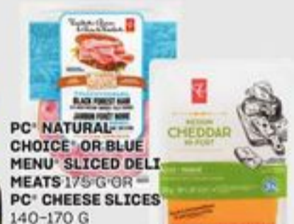
PC® NATURAL CHOICE™ OR BLUE MENU™ SLICED DELI MEATS 175 G OR PC® CHEESE SLICES 140-170 G SELECTED VARIETIES CHARCUTERIES TRANCHÉES PC™ LE CHOIX NATUREL™ OU MENU BLEU™ OU TRANCHES DE FROMAGE PC™ 20216643_EA/20310580_EA