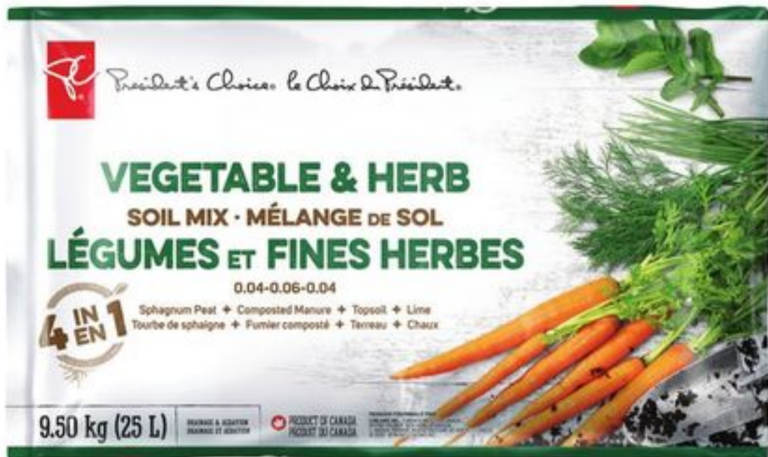
PC® VEGETABLE AND HERB SOIL 25 L 21349109_EA