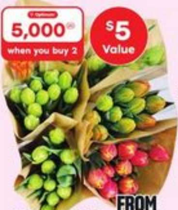
5,000 99 when you buy 2 $5 Value