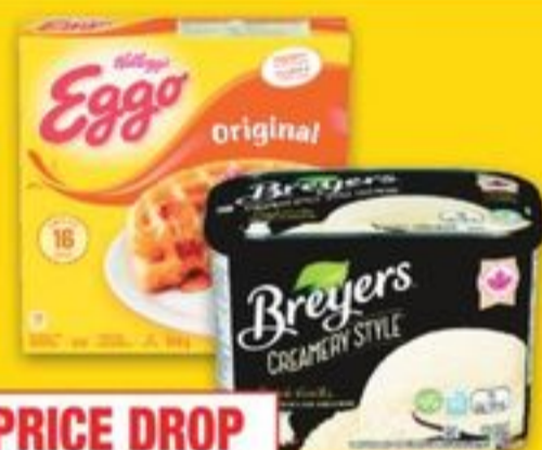
EGGO WAFFLES 16's or BREYERS CREAMERY STYLE ICE CREAM 1.66 L selected varieties, frozen gâteaux ou crème glacée 20099730004 SA/20344920004 SA