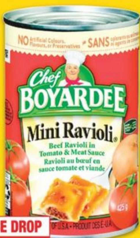
CHEF BOYARDEE selected varieties 418/425 g pâtes 2031230001 SA