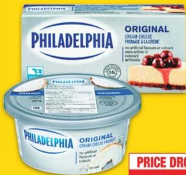
PHILADELPHIA CREAM CHEESE PRODUCT selected varieties 227/250 g produit de fromage à la crème 20641267 SA/2064492610 SA