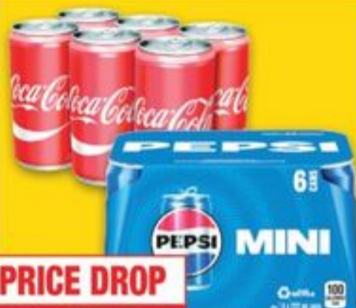
COCA-COLA or PEPSI SOFT DRINKS selected varieties 6x222 mL boissons gazeuses 20344284002 C06/20637360004 C06