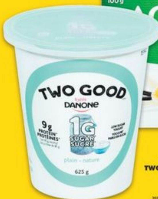
DANONE ACTIVIA 8% MIX & GO VANILLA 2% or TWO GOOD LOW SUGAR 625 g selected varieties yogourt 20223264002 SA/21477313 SA