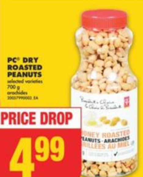
PC® DRY ROASTED PEANUTS selected varieties 700 g arachides 2005799002 SA