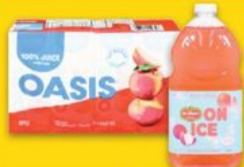
OASIS JUICE or ARIZONA ICED TEA, ALLEN'S APPLE or CRANBERRY COCKTAIL or DEL MONTE ON ICE REFRESHERS 1.89 L selected varieties jus ou thé glacé ou boissons 20313764002 SA/21375061 SA