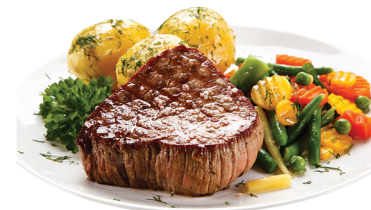
Fresh, Boneless Beef Shoulder Clod Steaks or Roast Espaldilla de Novillo sin Hueso