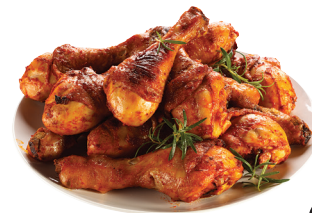
Fresh Chicken Drumsticks Piernitas de Pollo