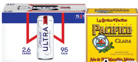
Pacifico 12 Pack, 12 oz. Cans or Bottles or Michelob Ultra 15 Pack, 12 oz. Cans