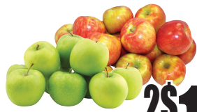
Granny Smith or Honeycrisp Apples Manzanas Verde o Honeycrisp