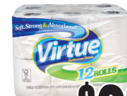
Virtue Bath Tissue Assorted, 12 Pack Limit 4