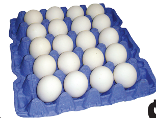
Grade AA Large Eggs Brown or White, 20 Count

Cacique Chorizo Beef/Pork or Soy, 9 oz. $1.69