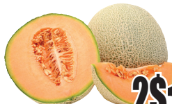
Cantaloupe Melón Chino