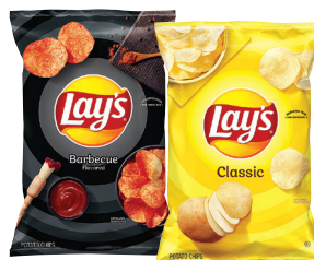
Lay's Potato Chips Assorted, 7.75-8 oz.