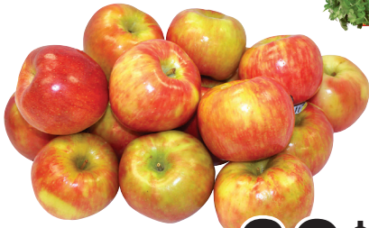
Honey Crisp Apples Manzanas Honey Crisp