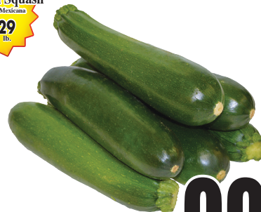
Fresh Italian Squash Calabaza Calabaza