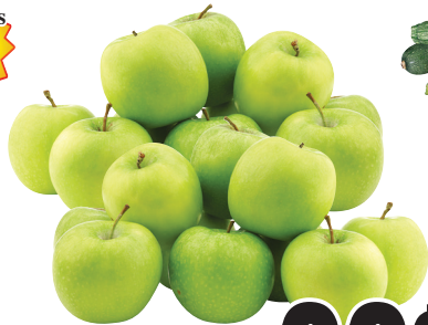
Granny Smith Apples Manzanas Verde