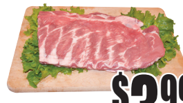
Fresh Pork Spareribs Costillas de Puerco