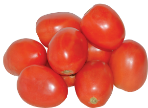
Roma Tomatoes Tomate Roma