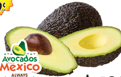
Large Hass Avocados Aguacate Hass Grande