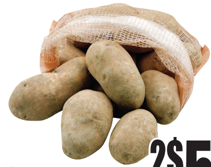
10 Lb. Bag Russet Potatoes Papas Russet en Bolsa de 10 Lbs.