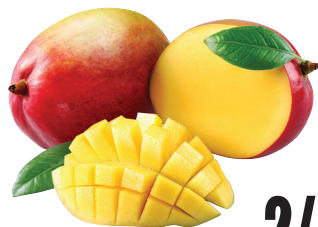
Sweet Mangos Mangos Dulces