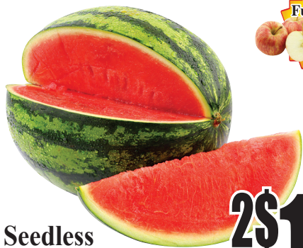
Seedless Watermelon Sandía sin Semillas