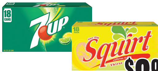
7up, Squirt, Sunkist Assorted, 18 Pack, 12 oz. Cans