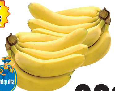
Golden Ripe Bananas Plátanos