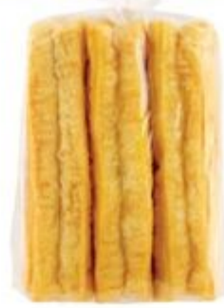
CHINESE LONG DONUTS BAKED IN-STORE, 6'S 20923195_EA