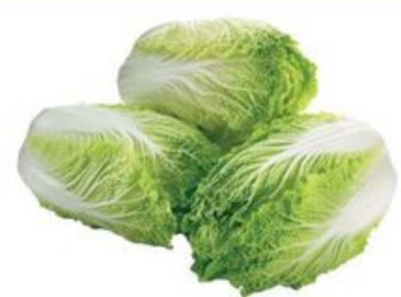
NAPA PRODUCT OF U.S.A. 20015025001_KG