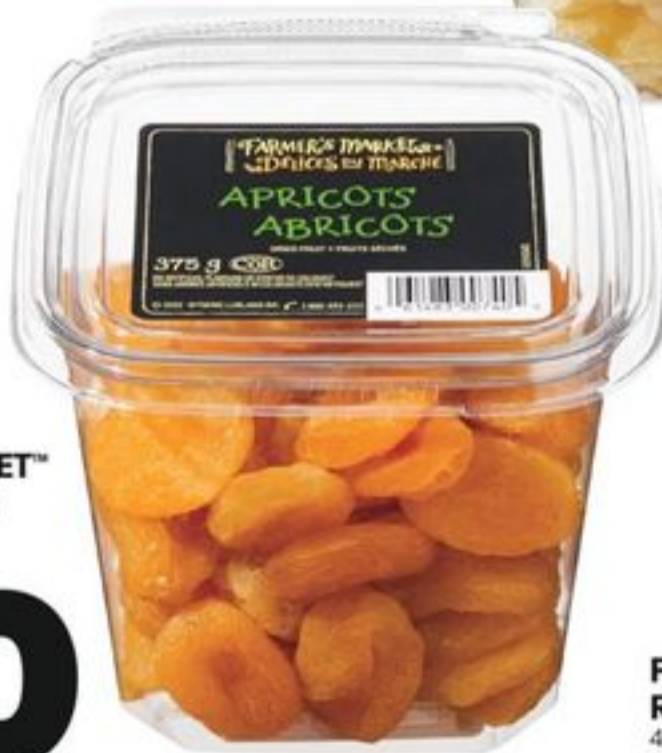
FARMER'S MARKET™ DRIED APRICOTS 375 G 21519961_EA