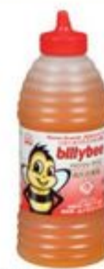
BILLY BEE HONEY 1 KG 20528715_EA