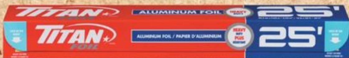
Titan Aluminum Foil, 12" x 25'