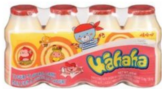
WAHAHA YOGURT DRINK 4X100 ML 20091972_EA