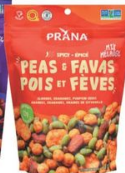
PRANA SNACK MIXES 350-400 G 21521521_EA/21521599_EA