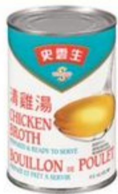
CAMPBELL'S SWANSON CHICKEN BROTH 412 ML 20042814_EA