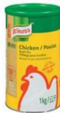
KNORR CHICKEN BOUILLON 1 KG 20154074_EA