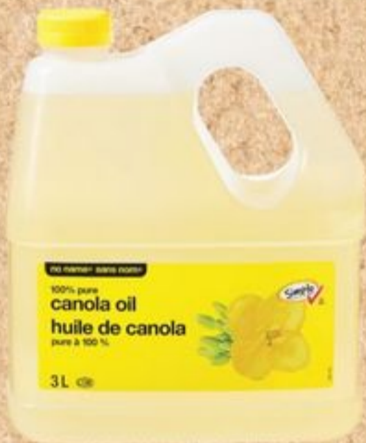
no name® Canola Oil, 3L