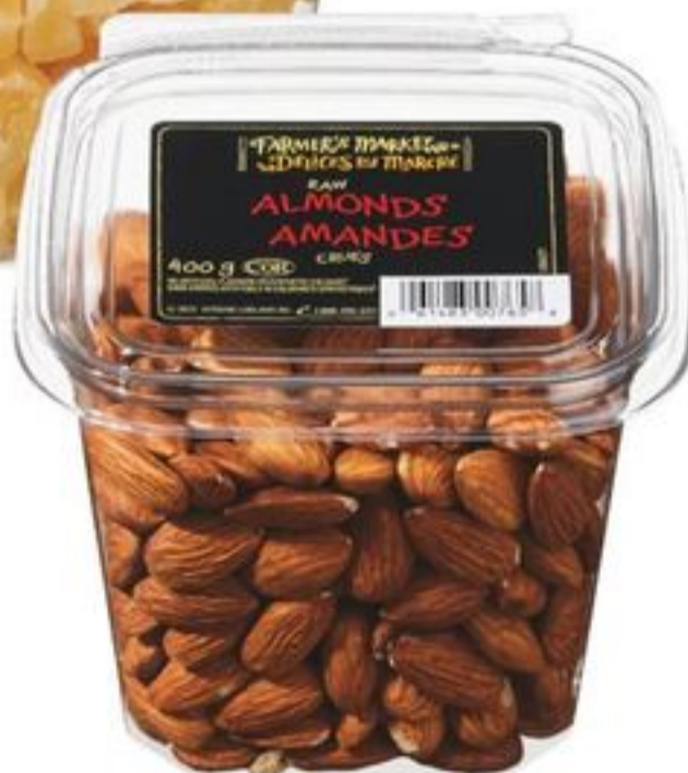
FARMER'S MARKET™ RAW ALMONDS 400 G 21519217_EA