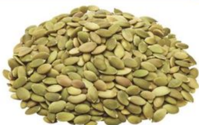
RAW PEPITAS 21564091_KG