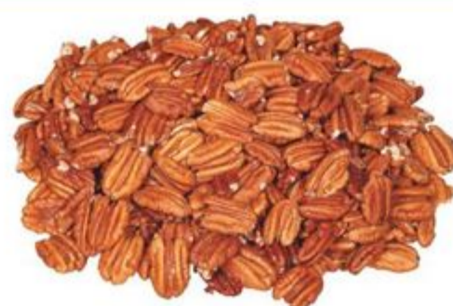
RAW PECAN HALVES 21564332_KG