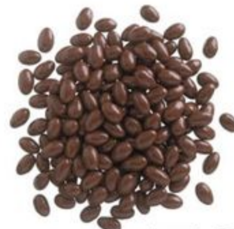
MILK CHOCOLATE ALMONDS 21564333_KG