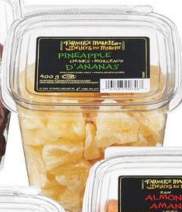
FARMER'S MARKET™ PINEAPPLE CHUNKS 400 G 21519982_EA