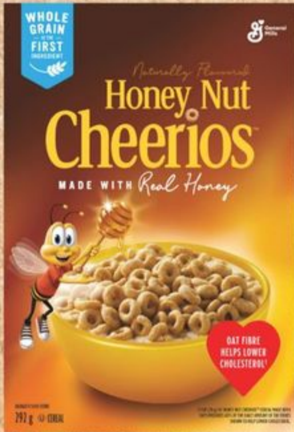
General Mills Honey Nut Cheerios, 292g