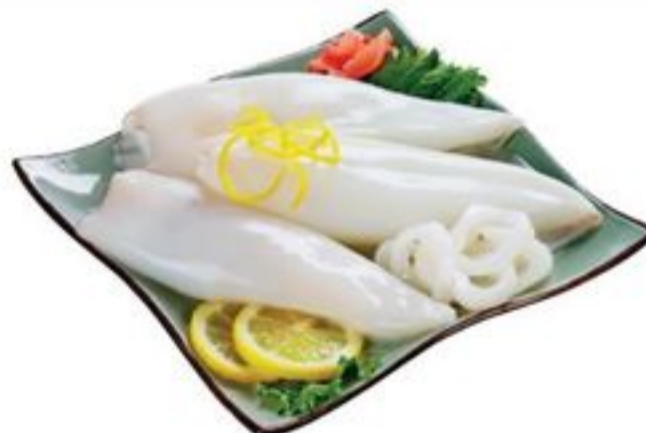
CALIFORNIA SQUID 1 KG OR SQUID TUBES 680 G FROZEN 20121461_EA