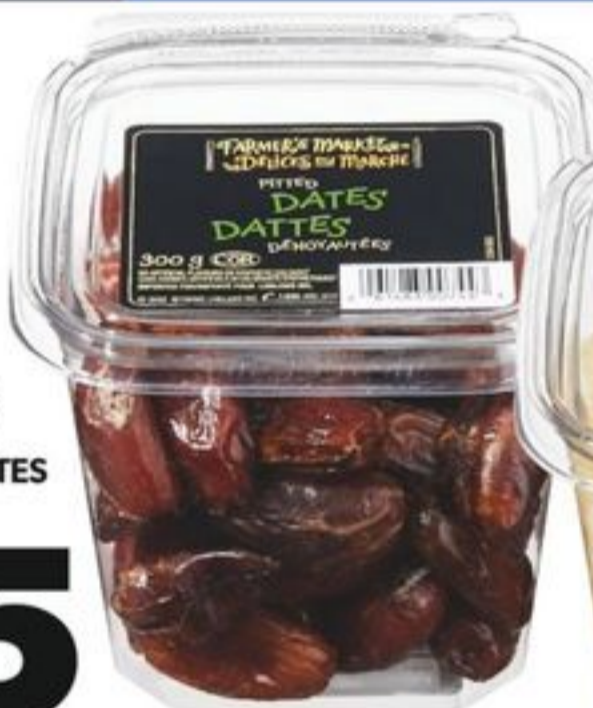
FARMER'S MARKET™ PITTED DATES 300 G 21519965_EA