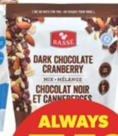
BASSÉ SNACK MIXES SELECTED VARIETIES 415-600 G 21518603_EA/21518613_EA