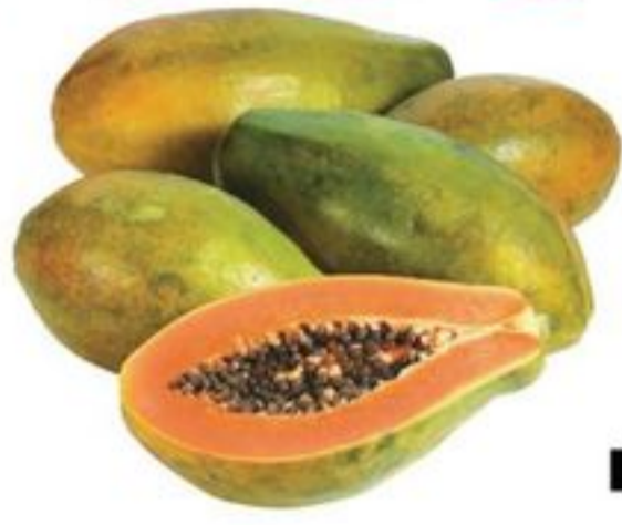
PAPAYA PRODUCT OF MEXICO 20817066001_KG