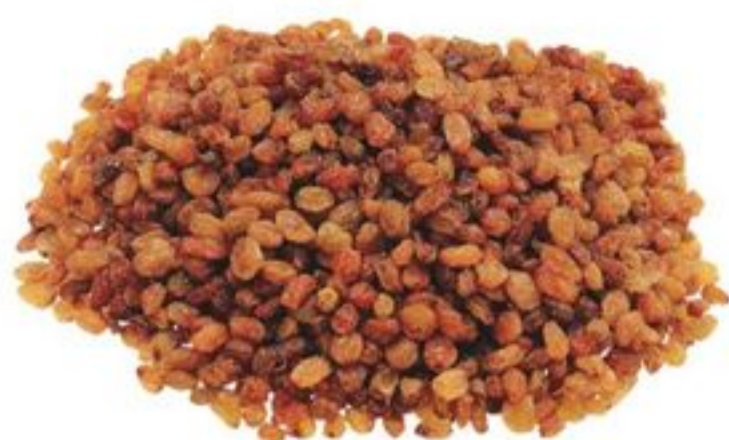
SULTANA RAISINS 21564330_KG