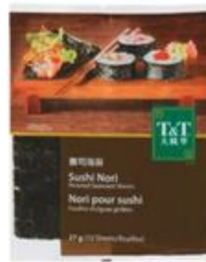
T&T® SUSHI NORI ROASTED SEAWEED SHEETS 27 G 20703060_EA