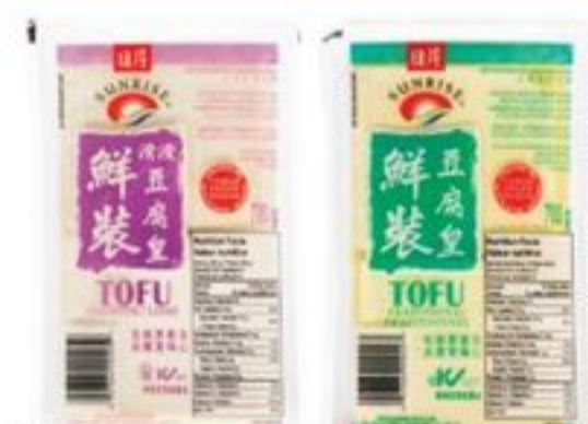
SUNRISE TOFU SELECTED VARIETIES, 700 G 20571047_EA/20571249_EA