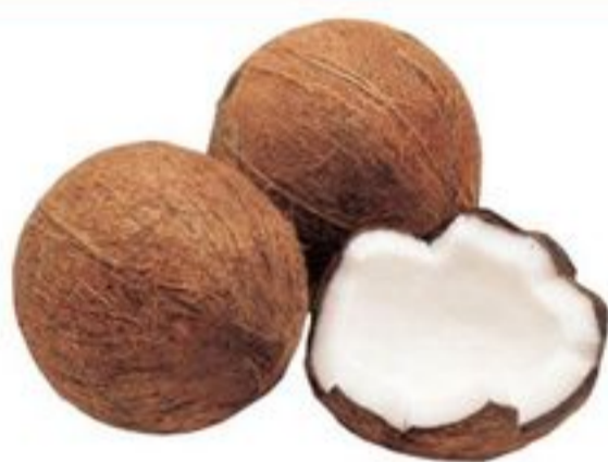
COCONUT PRODUCT OF DOMINICAN REPUBLIC 20005774001_EA