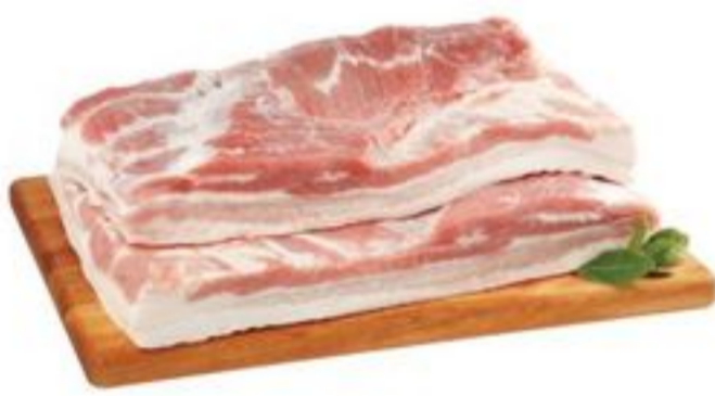
PC® FREE FROM® SIDE PORK WHOLE OR SLICED 20097011_KG