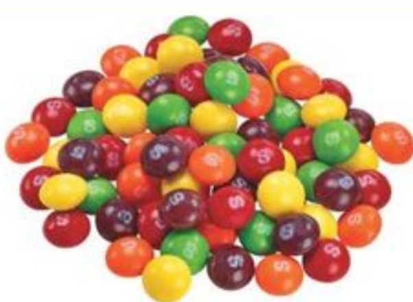
SKITTLES CANDY 21563827_KG